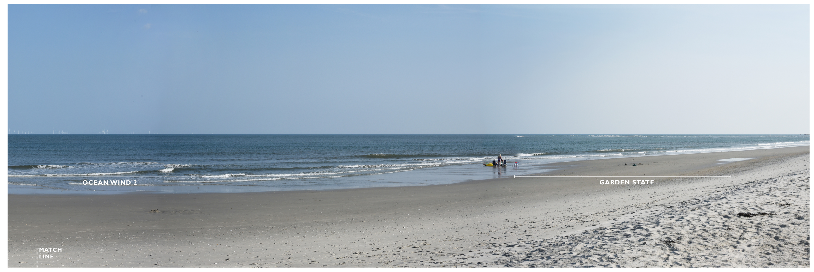
Panoramic Field of View: 80° Ocean Wind 1 not in view