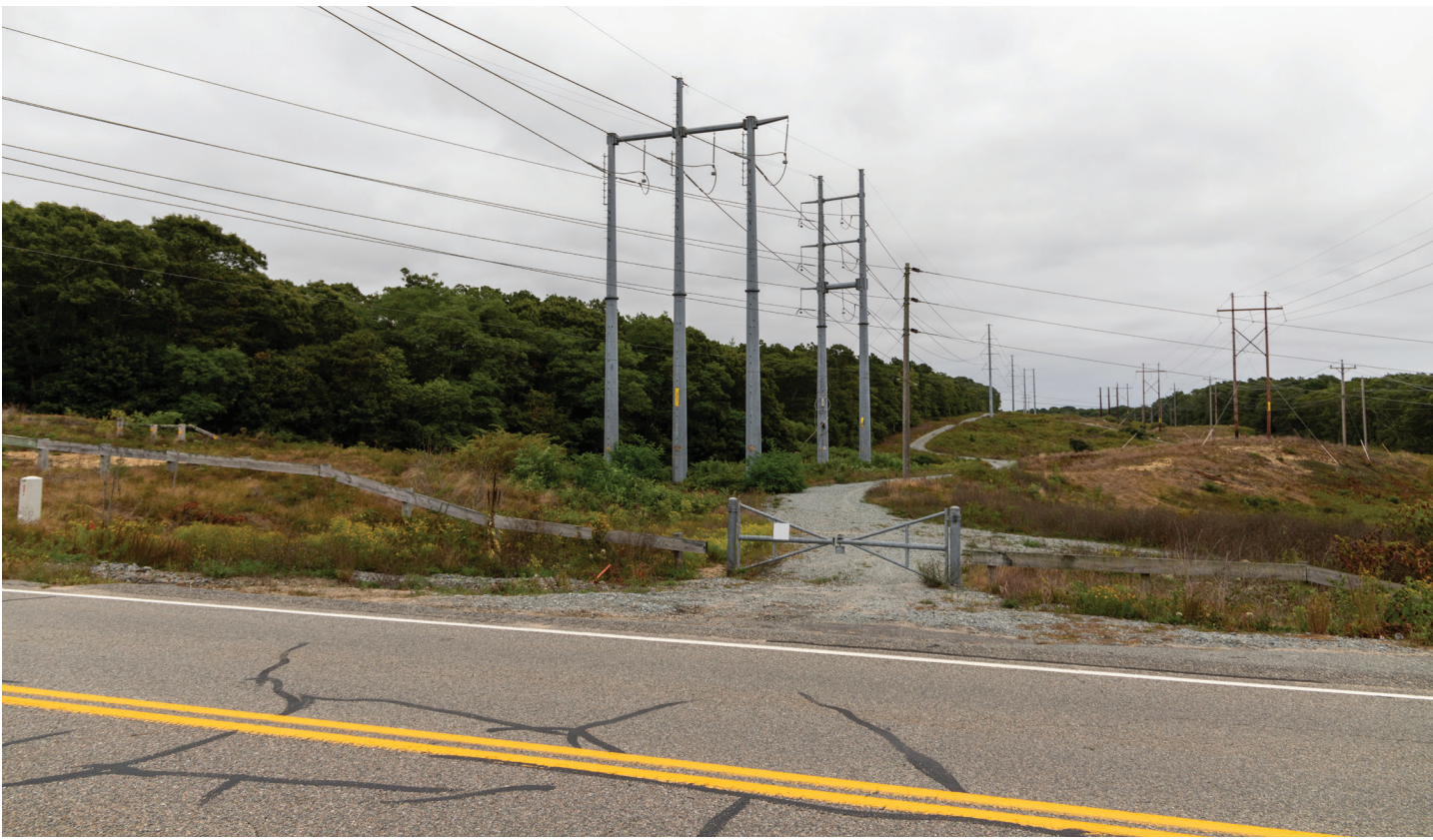
VP5 - Shootflying Hill Road at Center of Transmission Corridor