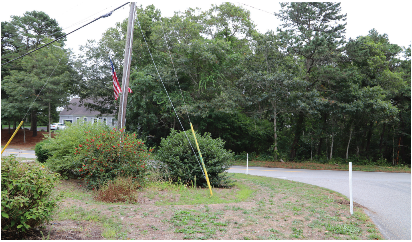
VP3 - Shootflying Hill Road at Service Road