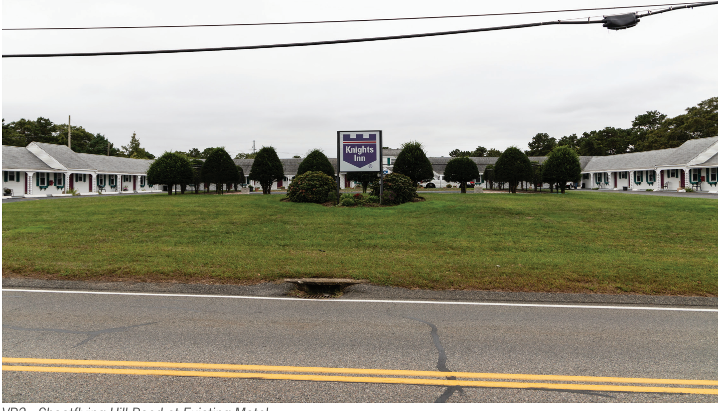
VP2 - Shootflying Hill Road at Existing Motel