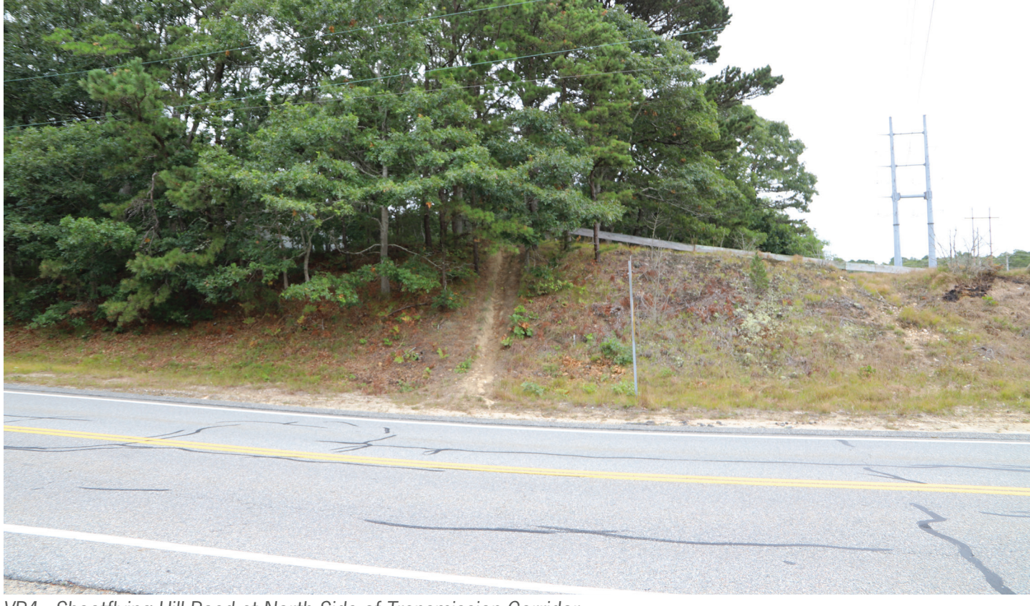
VP4 - Shootflying Hill Road at North Side of Transmission Corridor