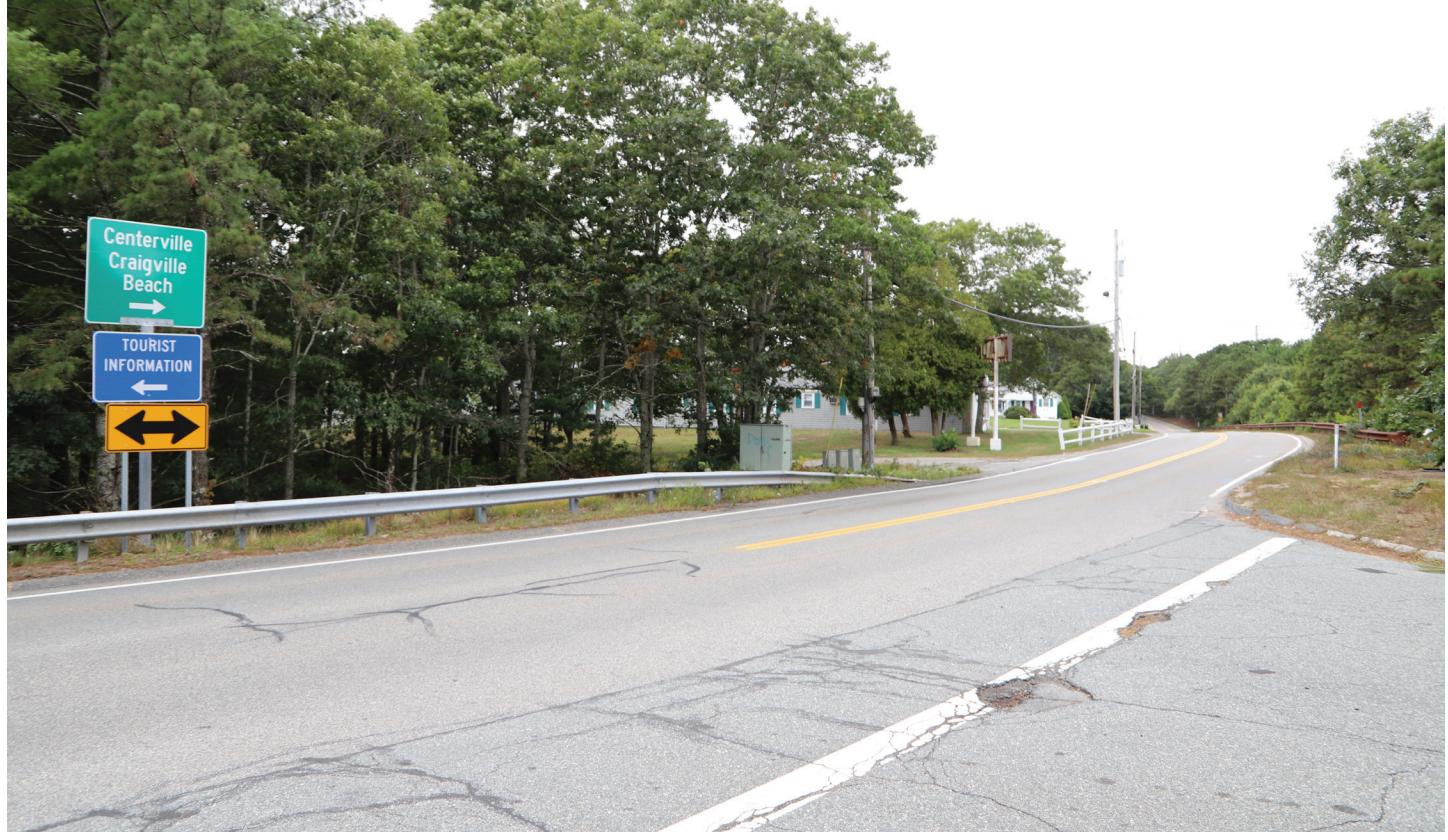
VP1 - Shootflying Hill Road at Route 6 Eastbound Exit Ramp