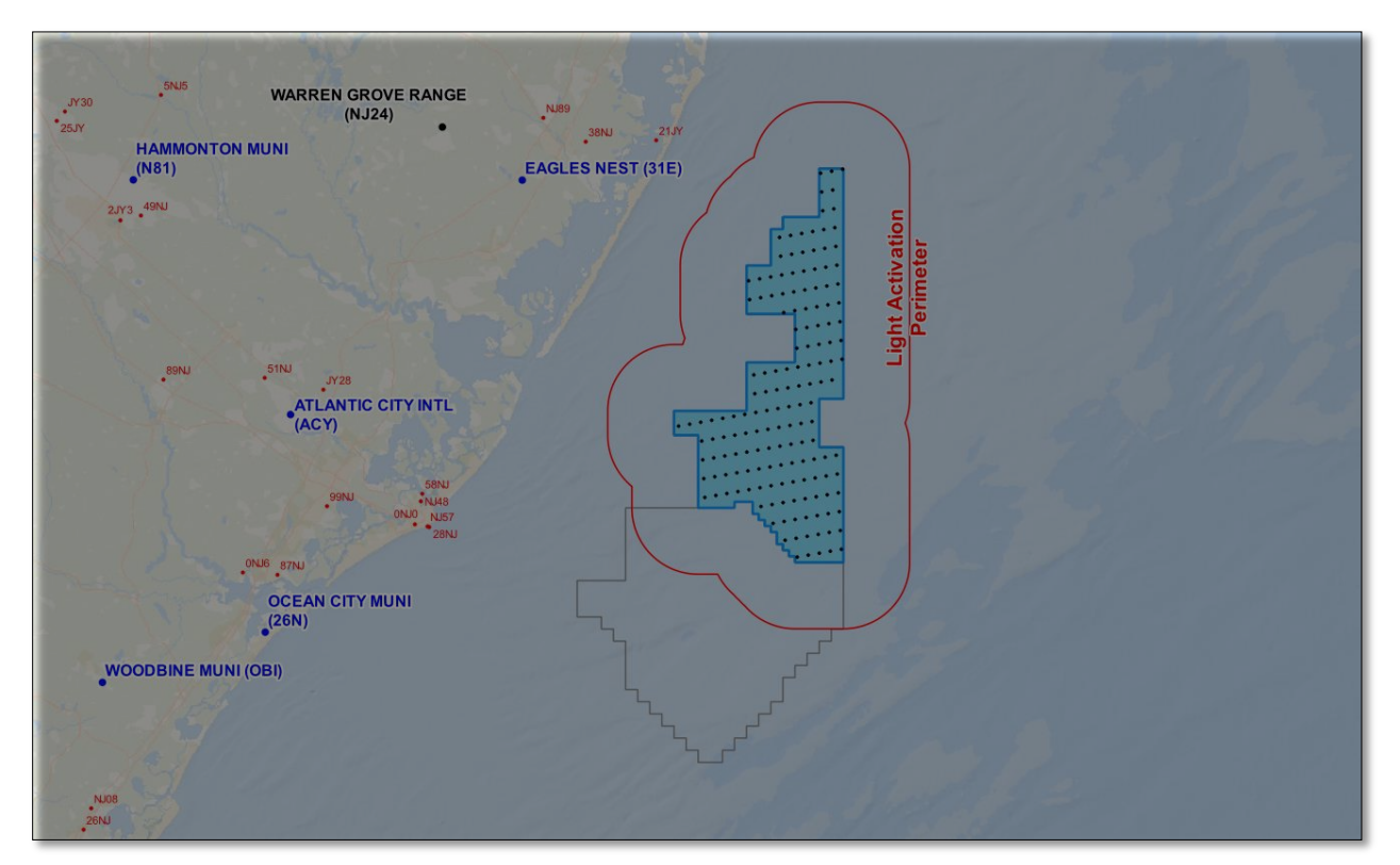
Figure 1: Public-use (blue), private-use (red), and military (black) airports in proximity to the Atlantic Shores Lease Area (blue area) with Lease Area OCS-A 0499 (grey outline)

Historical air traffic data for flights passing through the light activation volume indicates that ADLS-controlled obstruction lights would have been activated for a total of 20 hours 25 minutes and 15 seconds over a one-year period. Considering the local sunrise and sunset times, an ADLS-controlled obstruction lighting system could result in over a 99% reduction in system activated duration as compared to a traditional always-on obstruction lighting system.