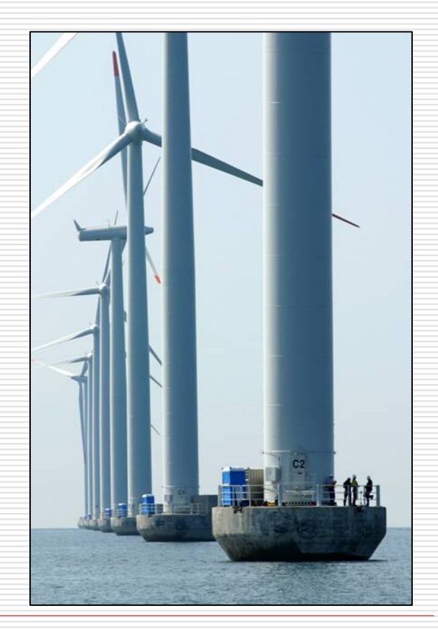
8 December, 2009