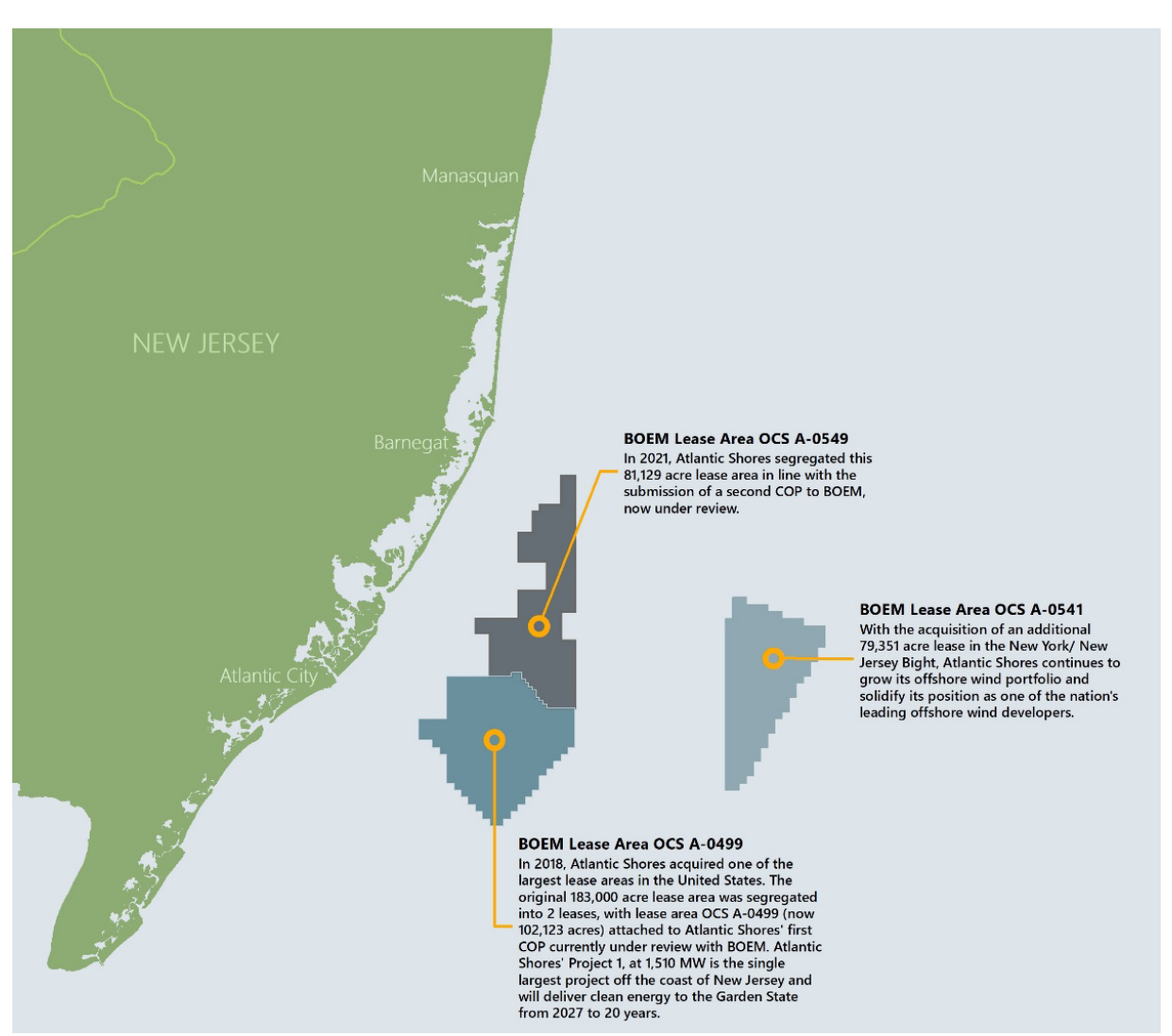
Figure 1. Map of Atlantic Shores current lease areas including OCS-A-0541