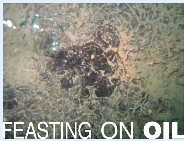
Oil on the floor of the Pacific Ocean.

il-eating organisms living thousands of feet beneath the ocean floor could one day become an integral part of the Mineral Management Service's (MMS) efforts to protect the marine environment.