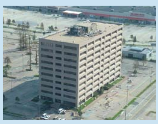
Main office building for the Minerals Management Service, Gulf of Mexico OCS Region. Photo taken September 2005 after Hurricane Katrina.

The lease for the offices, known as the Elmwood Tower Building, provides for updated scientific capabilities, including a state-of-the-art visualization room with 3-D capacity. The data interpretation capabilities of MMS geoscientists and engineers will be greatly enhanced by this new facility. Renovations included in the lease agreement also provide increased security and easier access to the public information offices. The offices will be totally