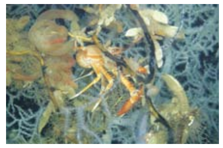
Squat lobster with gooseneck barnacles on an antipatharian.

This year's Lophelia II cruises are just the beginning of the project. During cruises over the next 2 years, coral colonies on oil platforms will also be explored, additional mapping surveys will be conducted,