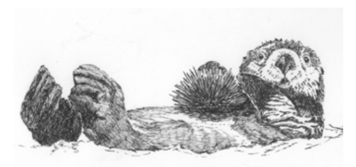
Sea otter with a sea urchin.

Remnant sea otter colonies gradually expanded across Alaska and Russia. In California, the