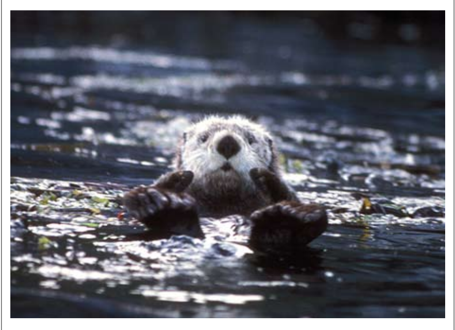
Sea otter.

It took a highly-skilled team, hard work, dedication, and a bit of luck to fulfill the objectives of this study. More important, this collaborative, interdisciplinary effort crossed traditional government agency, private sector, and international boundaries. The MMS played a role in the success of this study, demonstrating that cooperation, coordination, and shared use of resources can pay great dividends toward our understanding and stewardship of the marine environment.