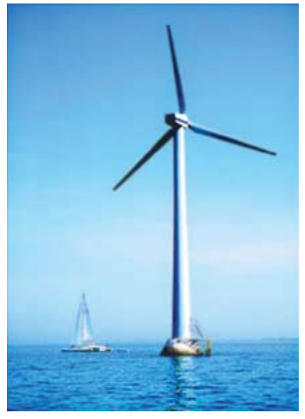
Offshore commercial wind-powered electricity generator.

The final report is expected to be complete in late 2010. In the meantime, MMS continues to advance in developing proposed regulations to encourage the orderly, safe, and environmentally responsible development of alternative energy resources and alternate uses of the facilities on the OCS.