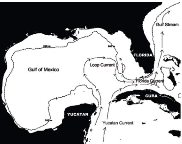
Illustration of Loop Current movement.

Eddies are vortices carrying mass and energy and can interrupt or interfere with oil production, especially in deep waters where floating production, storage, and