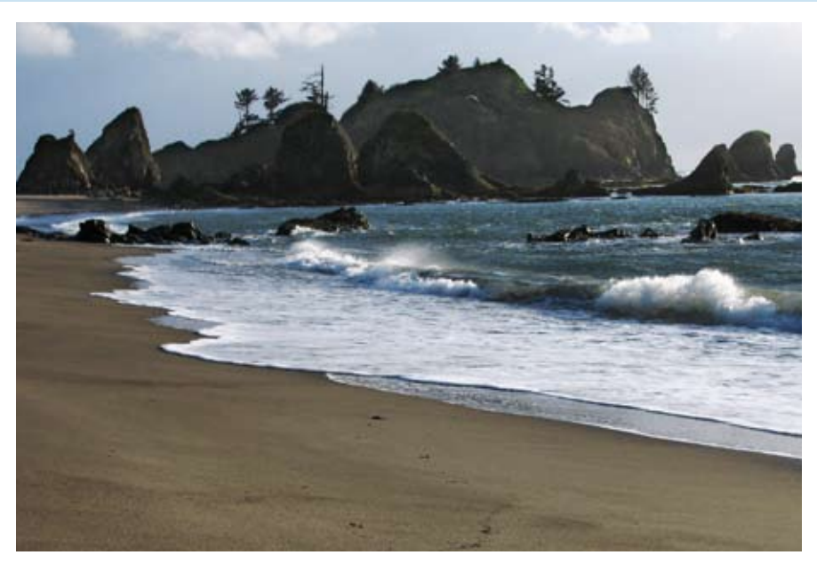
The Pacific Ocean from Rialto Beach, Olympic National Park, Washington.

The West Coast Ocean Action Plan focuses on seven points or goals to maintain healthy ocean ecosystems. The goals include clean coastal waters and beaches; healthy ocean and coastal habitats; ecosystem-based management of ocean and coastal resources; reducing impacts of offshore development; increasing ocean awareness and literacy; improving ocean and coastal scientific information, research,