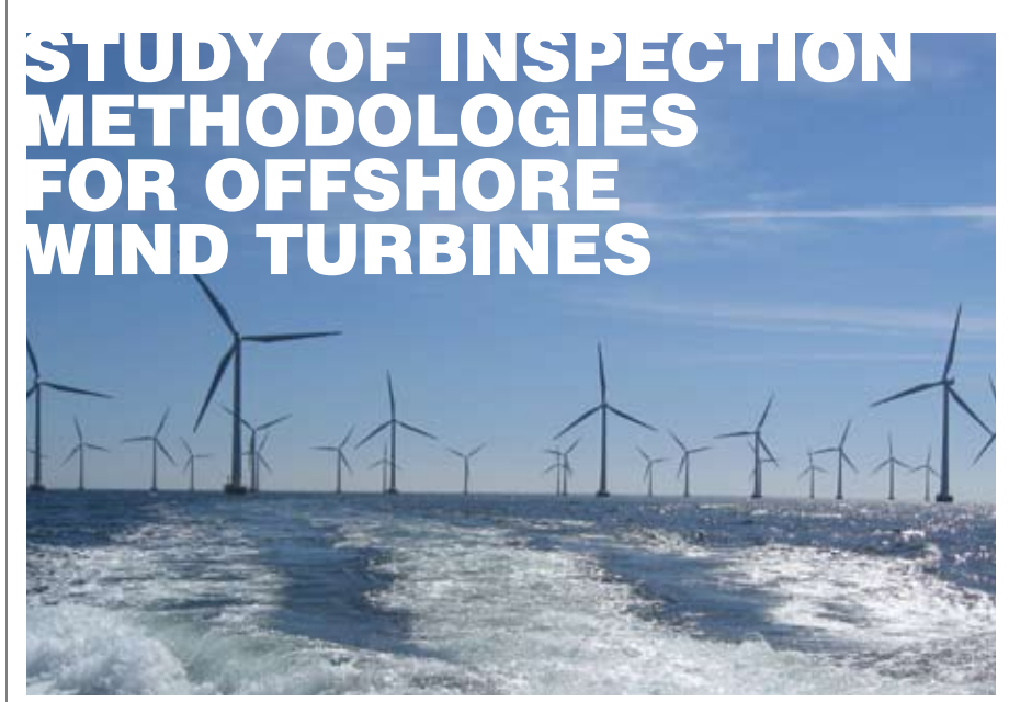
Lillgrund Sweden.

nsuring that our Nation benefits from resources available on Federal offshore lands today and in the future is a prime concern of the Minerals Management Service (MMS). For that reason, the development of a renewable energy resource like offshore wind to generate electricity on the Outer Continental Shelf (OCS) waters is exciting. As with the development of any energy supply, safety and environmental concerns must be addressed. The potential introduction of wind turbine facilities necessitates the establishment of Integrity Management activities, particularly inspections, to ensure the safe and long-term operation of these facilities.