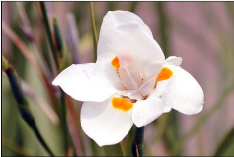
Figure 1. Katrina iris

A hybrid of bog-tolerant African irises Dietes vegeta and Dietes bicolor , the Katrina Iris was developed in New Orleans just after Hurricane Katrina. Sale proceeds benefit wetland restoration.