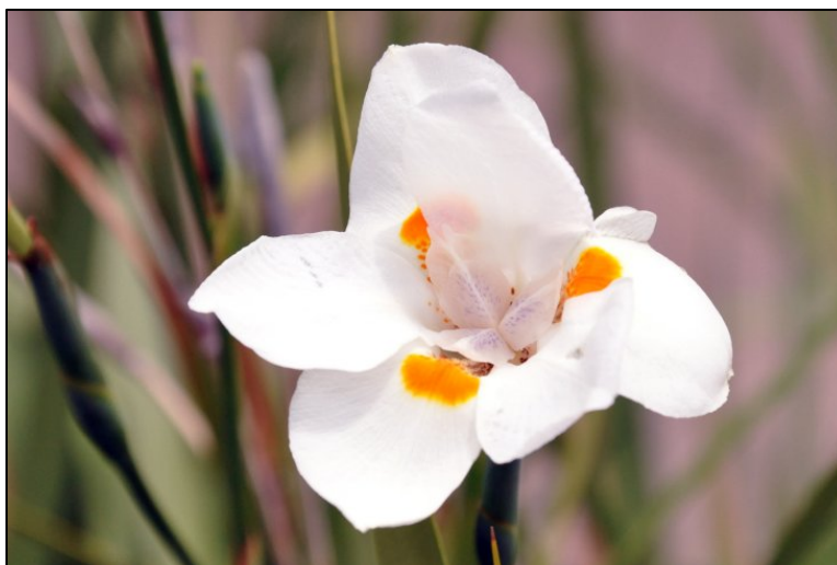
Figure 1. Katrina iris

Figures include graphs, drawings, photos, flowcharts, illustrations, etc. Insert figures into the report immediately following the paragraph where they are first referenced wherever possible. Provide the individual file for each figure to BOEM with the final report. The minimum resolution for graphic files is 300 pixels per inch (ppi). A sample figure (Figure 1) is provided to show the caption and description (if desired) as flush left, with margins centered below the figure.