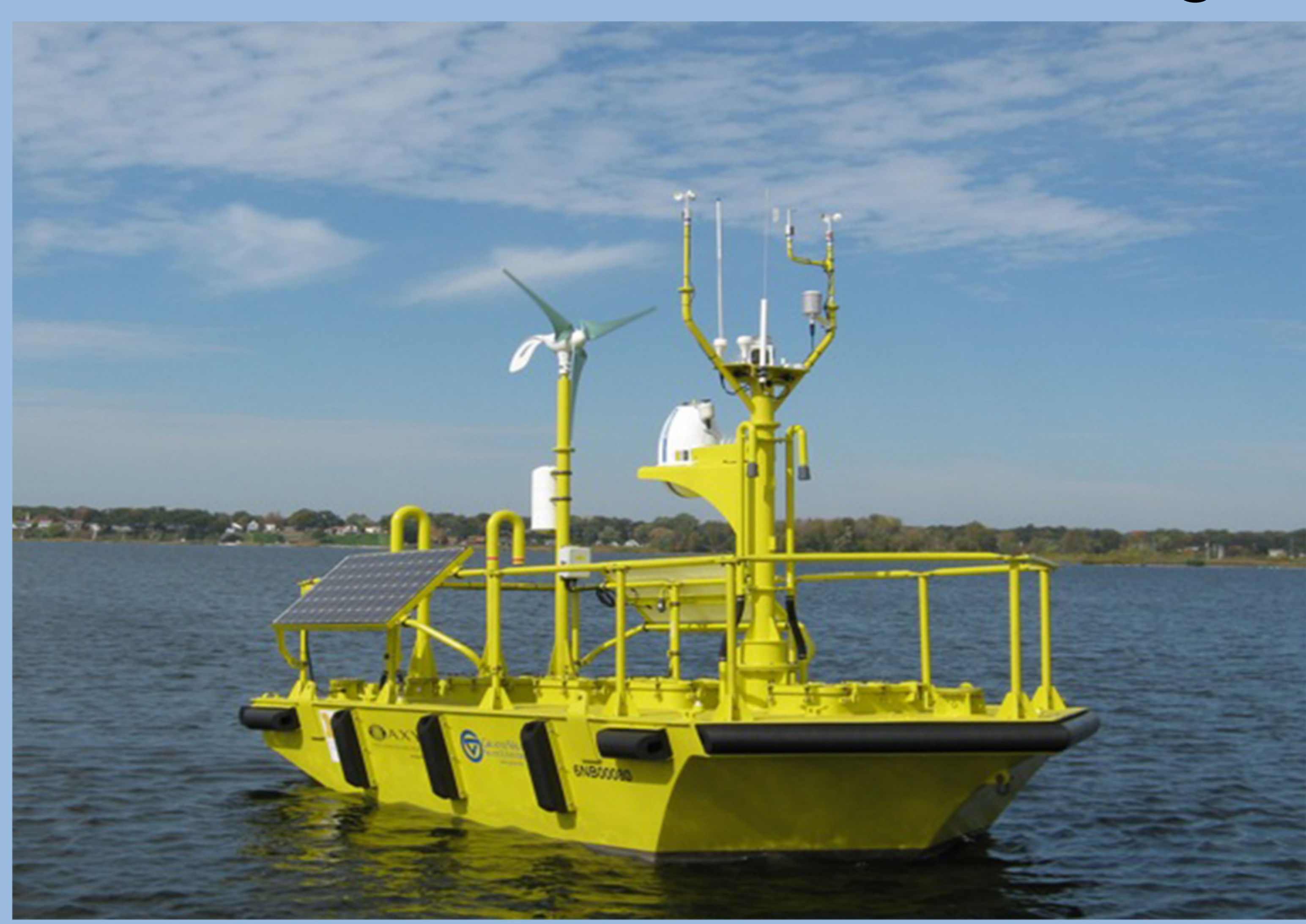
AXYS WindSentinel - Buoy Data Collection Configuration