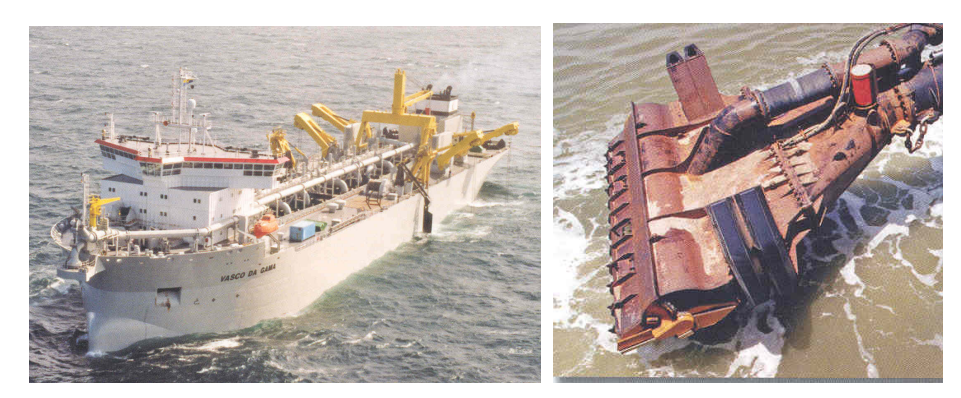
Figure 1. Jen de Nul's Vasco de Gamma (left) and Typical Draghead (right)

The offshore sand deposits that are being considered for sources of sand for beach nourishment projects for beaches along the US coastline are typically 10 to 20 nautical miles offshore in water depths of 9.1 to 30.5 meters (m). The trailing suction hopper dredge is one type of dredging equipment that is considered suitable for dredging sand deposits in these offshore shoal areas. These dredges have powerful dredge pumps that create a low pressure in the pump that allows the near bottom water and associated sand to enter the draghead and be placed in the large hopper in the dredge. Once the hopper is full the hopper dredge raises the two dragarms out of the water and sails to the beach placement area. The sand in the hopper is typically pumped through a submerged pipeline to the beach. Once the hopper is empty, it returns the sand deposit area and excavates another hopper load. Randall and Koo (2004) describe some of the various equipment combinations used to deliver sand to the beach along the Texas coast. Figure 1 shows the Vasco de Gama trailing suction hopper dredge operated by the company Jen de Nul, with a hopper capacity of 33,000 m<sup>3</sup>. The draghead for the Vasco de Gama is approximately 10 m wide.