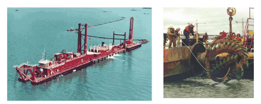
Figure 4. Great Lakes Cutter Suction Dredge California (left) and CutterHead (right)

The more common conventional cutter suction pipeline dredges have no propulsion and are moved to the dredging site by push boats or tugs. The Great Lakes Dredge and Dock dredge, "California", and a typical cutter head used for hard material are shown in Figure 4. These dredges can only work in wave heights up to 1 m and must be mobilized to sheltered water in case of severe storms. The dredged sand can be pumped through a pipeline or to barges for transport to the beach area. The length of the pipeline to the beach may be on the order of 32 to 64 kilometers of pipeline for offshore sand borrow sites so the use of a pipeline discharge to the beach is unlikely.