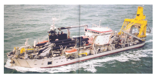
Figure 3. Self Propelled Cutter Suction Dredge JFJ de Nul

Several self-propelled cutter suction dredges are available in the world market, but none exist in the US to date. These dredges can sail under their own power ( \sim 12 knots) and have similar sea worthy capabilities as the trailing suction hopper dredge. These dredges are relatively new and the JFJ de Nul is shown in Figure 3. These dredges advance (move forward) using a spud carriage arrangement. When dredging, the spuds are located at the bow of the vessel and the cutter is located at the stern. The cutter is mounted on the ladder and lowered to the seafloor for excavating. The current maximum water depth is 35 m. The excavated slurry of sand and water is drawn into the dredge pumps and pumped through a pipeline to a barge or placement area. Self-propelled split hull barges can be used to transport the slurry to the beach area depending on water depth and barge draft. Turbidity generation of cutter suction dredges is relatively low. These dredges can work in similar wave conditions as the trailing suction hopper dredge.