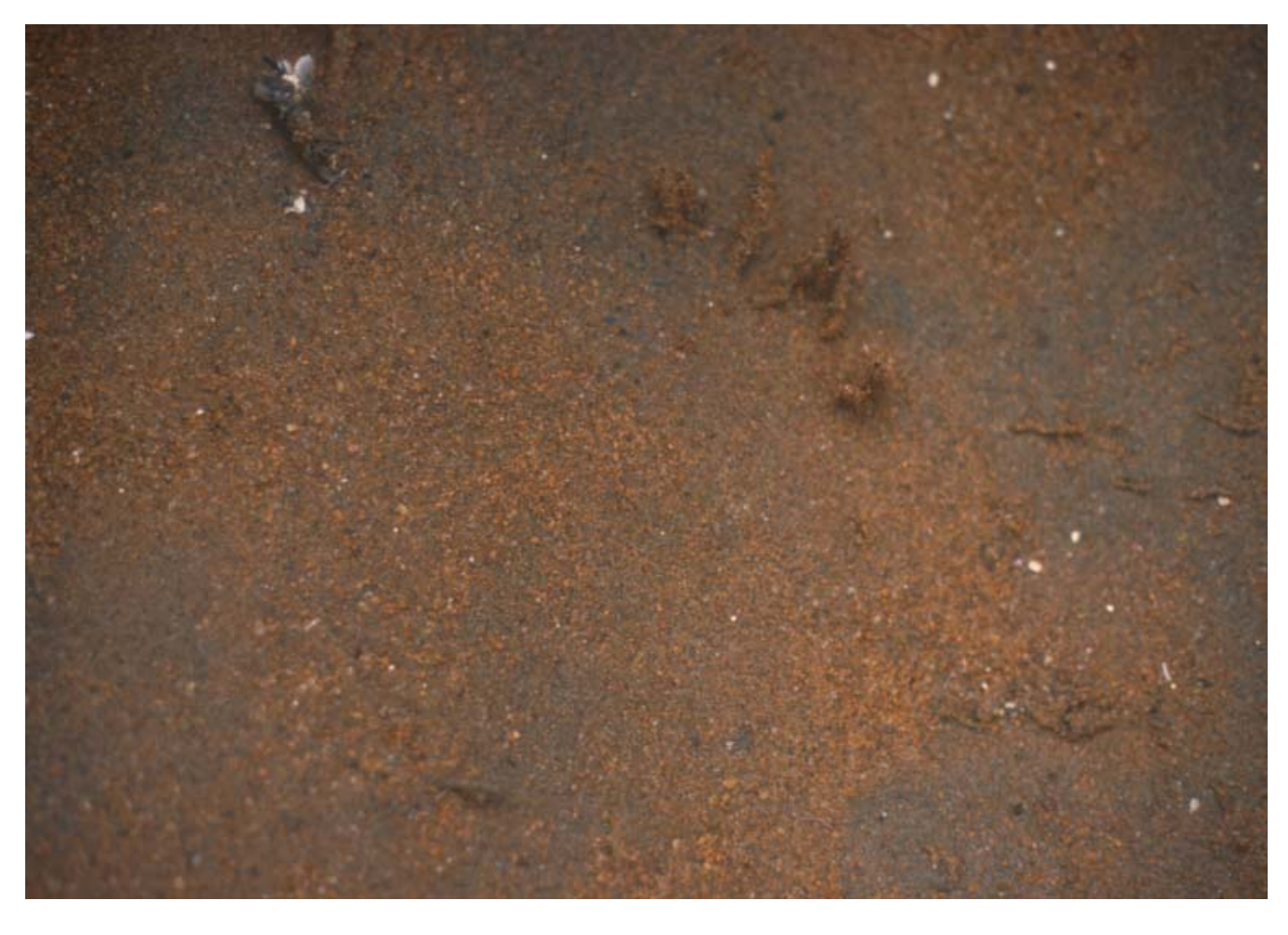
Partially oxidized sand retrieved in box-core sampler during USGS sampling campaign on San Pedro Shelf.