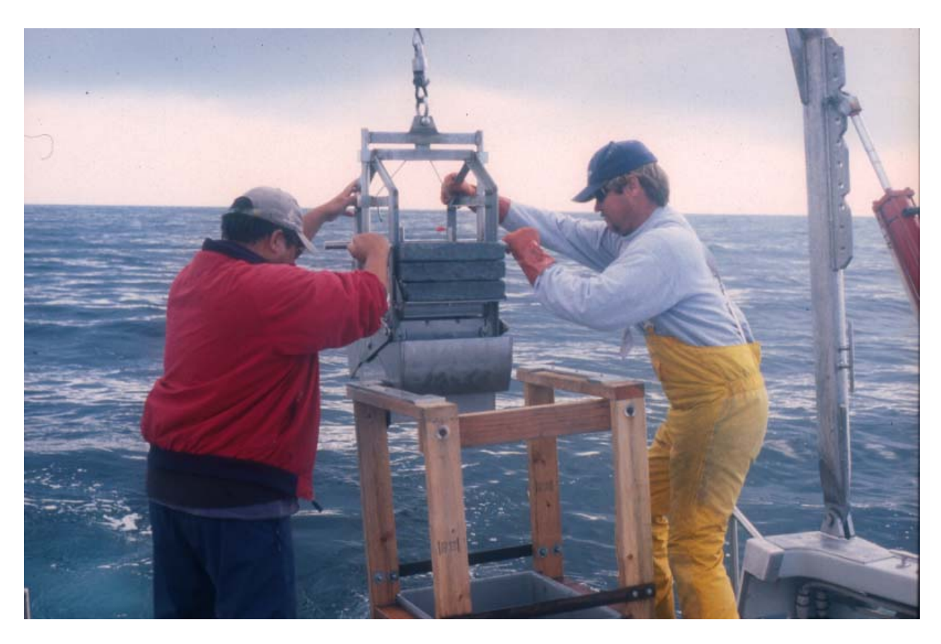
Deployment of the box-core sampler by staff of the Orange County Sanitation District aboard R/V Early Bird during the sampling campaign on San Pedro Shelf.