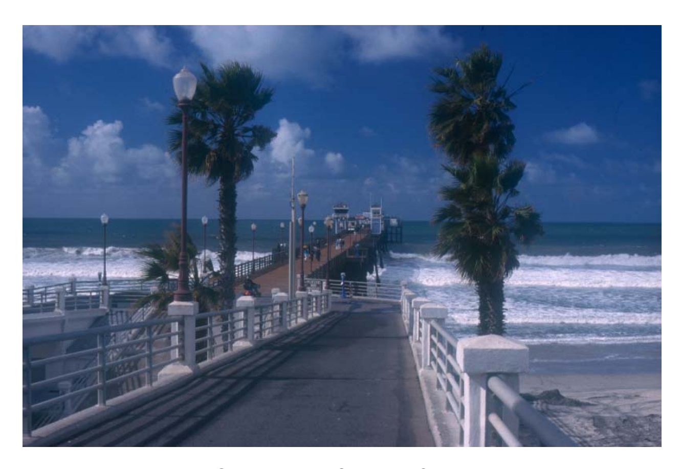
Oceanside Pier, San Diego County