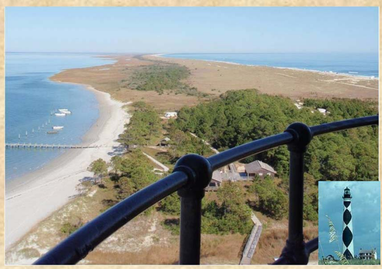
View Looking North from Cape Lookout Light