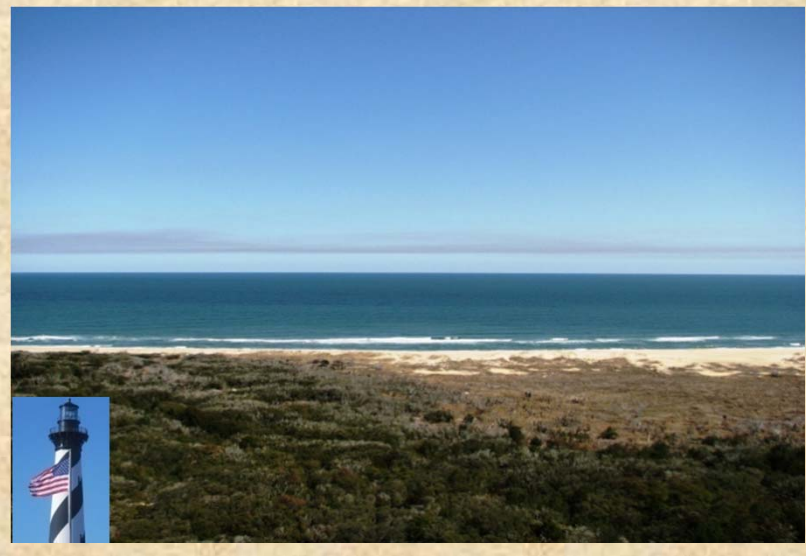
View From Top of Cape Hatteras Light