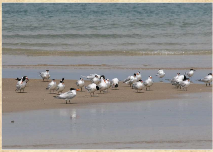
Habitat for Numerous Shorebird Species