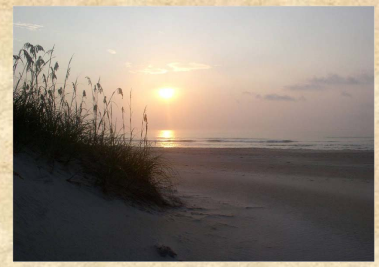
Pristine Shoreline View from South Core Banks