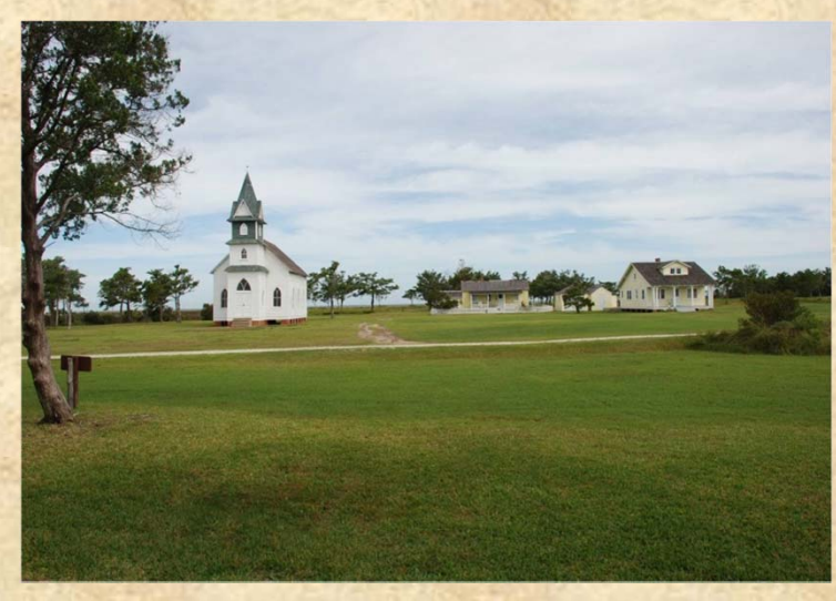
Portsmouth Village Historic District