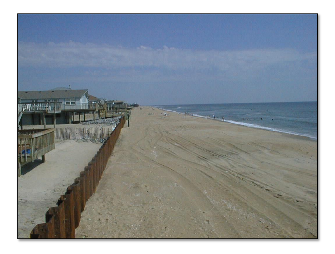
U.S. Department of the Interior Bureau of Ocean Energy Management Division of Environmental Assessment