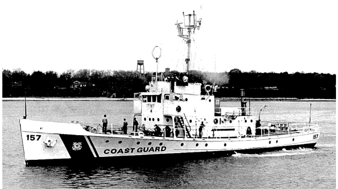
Figure 4. USCGC Cuyahoga in 1974

Cuyahoga sank within two minutes of the collision in 17.7 m (58.0 ft) of water. Eleven onboard the Cuyahoga were lost. The vessel was subsequently raised, repaired, and towed 15 nmi (27.8 km) offshore where it was scuttled to make an artificial fishing reef. She currently sits in 30.5 m (100.0 ft) of water (Shomette 1982).