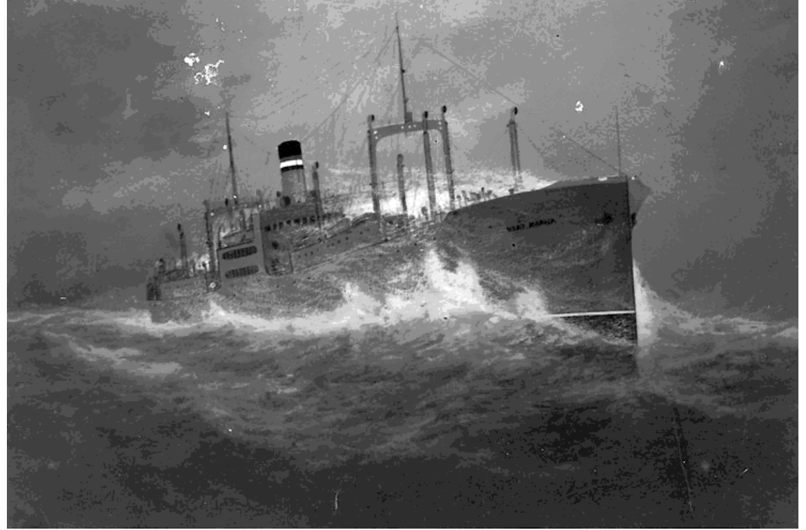
Photo # NH 103127 U.S. Army Transport Marica, which was USS Marica in 1919

division, demolished the ship, which had been deemed a hazard to the convoys using the channel during World War II (Gentile 1992).