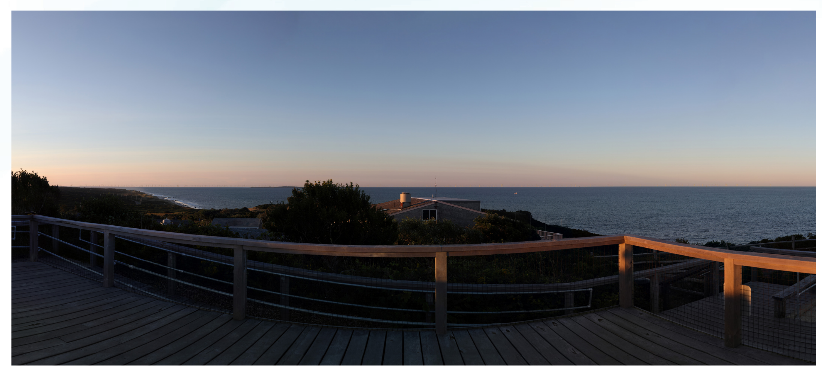
Sunrise view of full lease build-out at Aquinnah Overlook, Aquinnah, Massachusetts.

Key Observation Point MV07 – View to the south – Distance to Project 13.7 miles