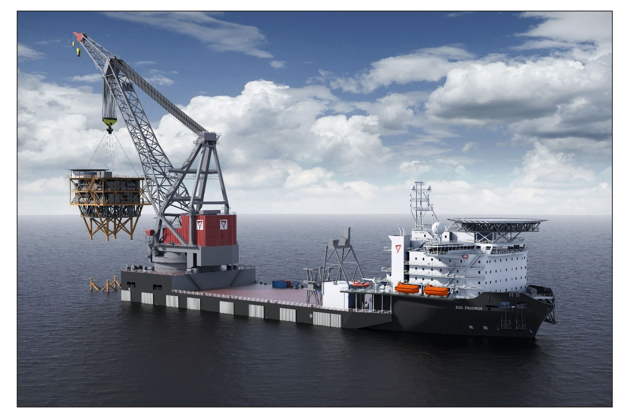
Heavy Lift Vessel Installing an Offshore Substation Platform