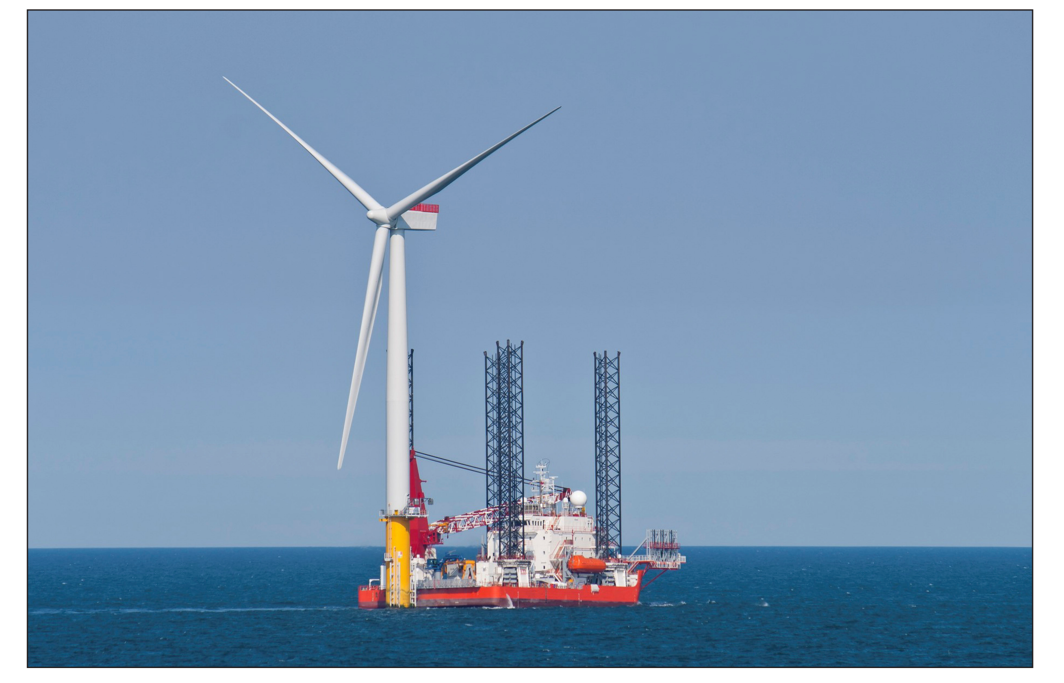
Jack-up Vessel Installing a Wind Turbine Generator

pumps and control units and then the jacket structure is lowered onto the seabed. The water and air contained within the bucket is pumped out, creating a suction force. This negative pressure causes the bucket to bury itself securely into the seabed.