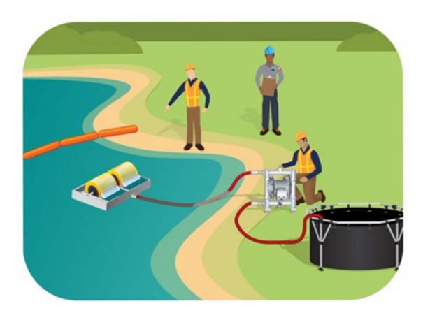
Audit Industry Spill Training and Exercises