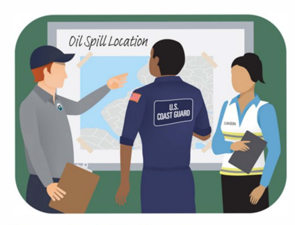
Support the National Response System