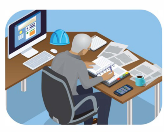
Review Oil Spill Response Plans