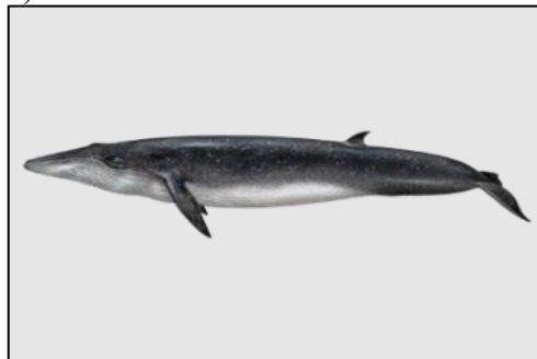
Figure depicting a Rice's whale