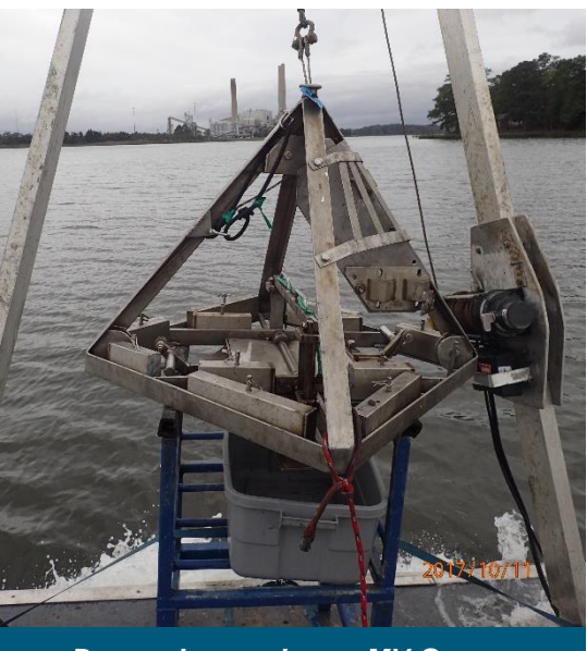
Day grab sampler on MV George

Surface benthic grab samples were successfully collected using a Day grab sampler at each of the twelve sampling locations on October 11, 2017. The sampler measured approximately 12.5 inches by 12.5 inches (31.75 cm by 31.75 cm) at the sampling interface. After retrieval, each sample was examined for quality and a decision was made to accept or reject the sample based on representativeness of the grab. Sample grabs that did not retain at least 2.5 inches (6.4 cm) of material or showed evidence of uneven penetration (i.e. angled sample) were rejected as incomplete and the grab was redeployed until an acceptable sample was retained. Over the course of the field program, only four sample attempts were rejected, due to overpenetration, inadequate recovery, or sample washout.