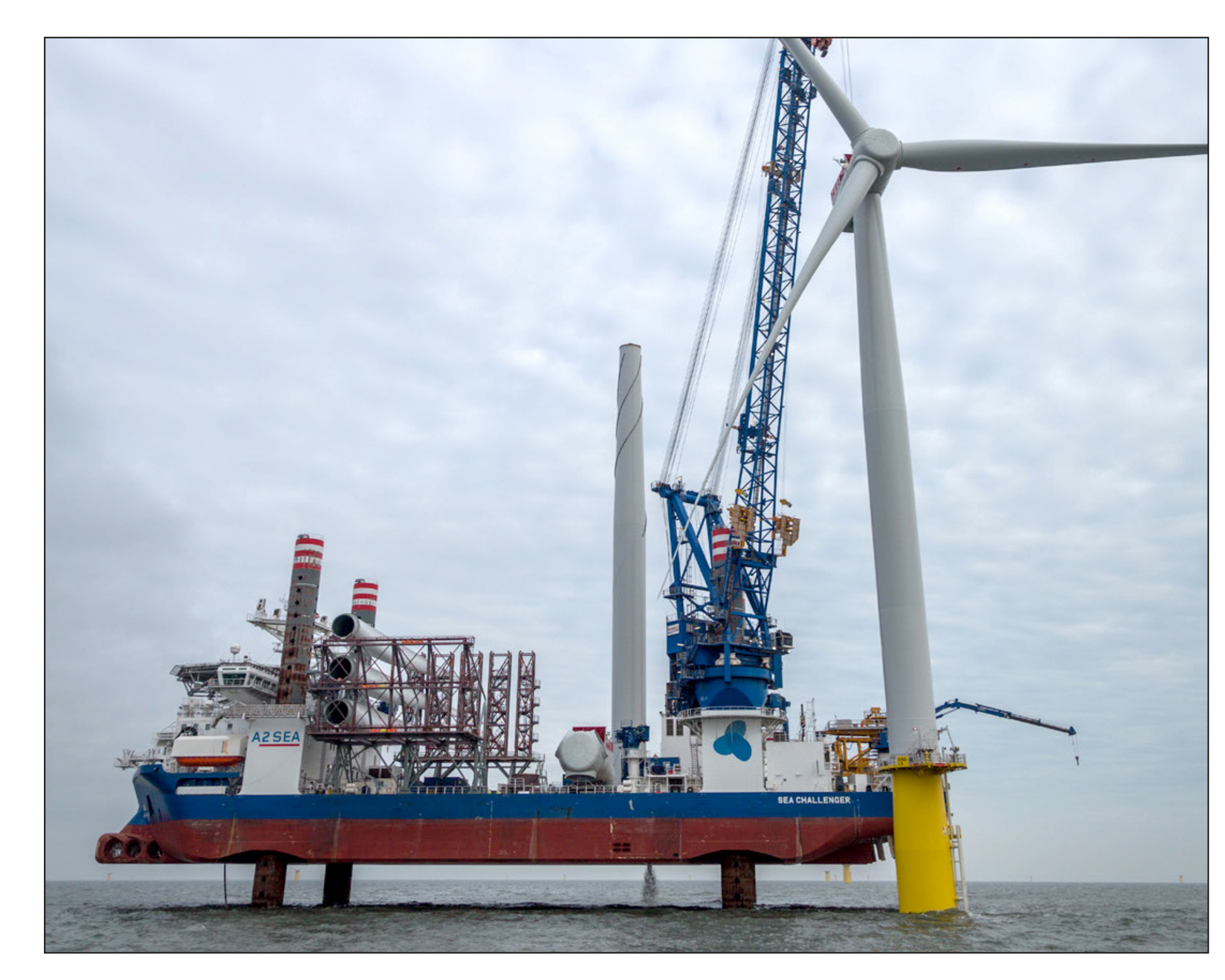
Wind Turbine Installation