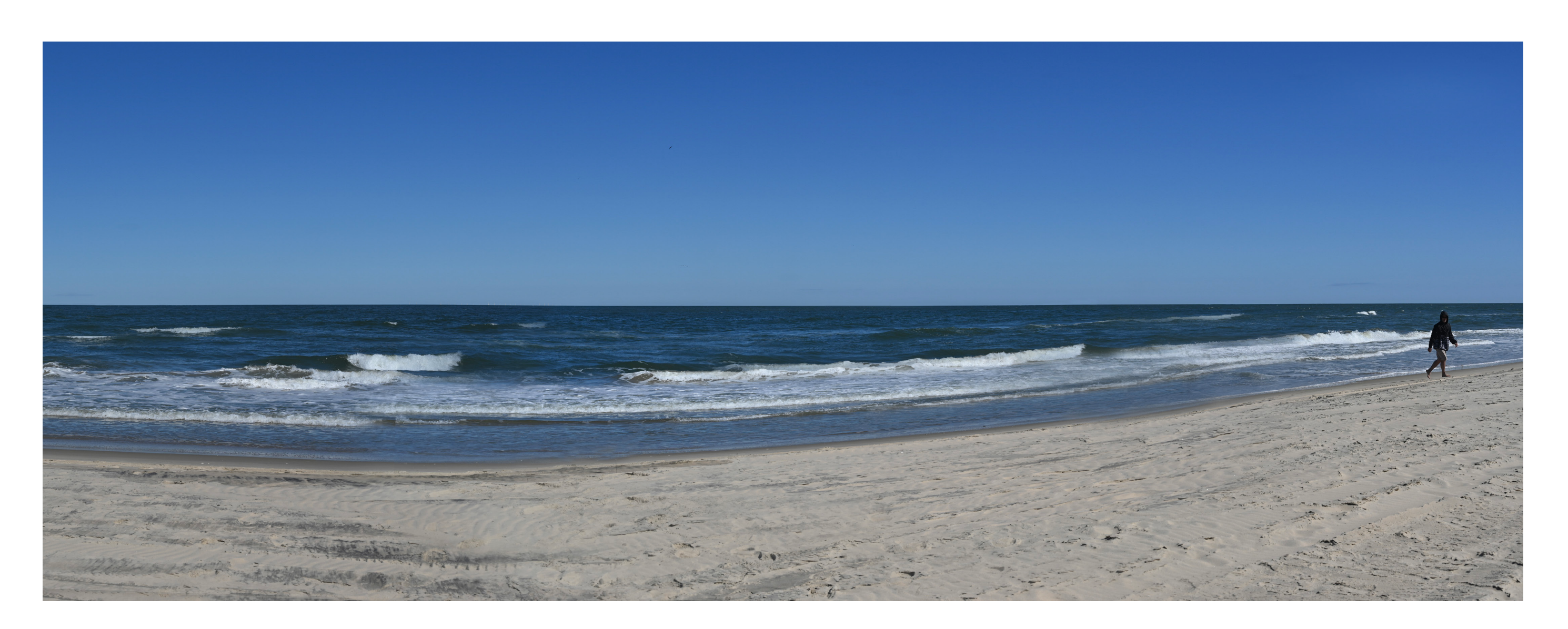
KOP 45 - False Cape State Park - Distance to Project 27.1 miles