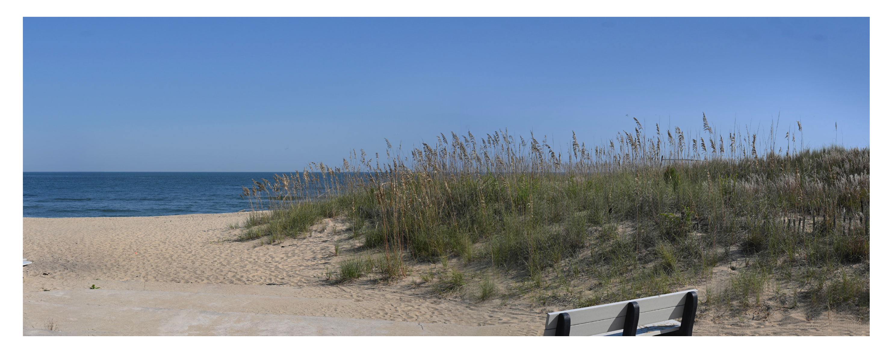
KOP 31 - Beach Views at State Military Reservation - Distance to Project 27.6 miles