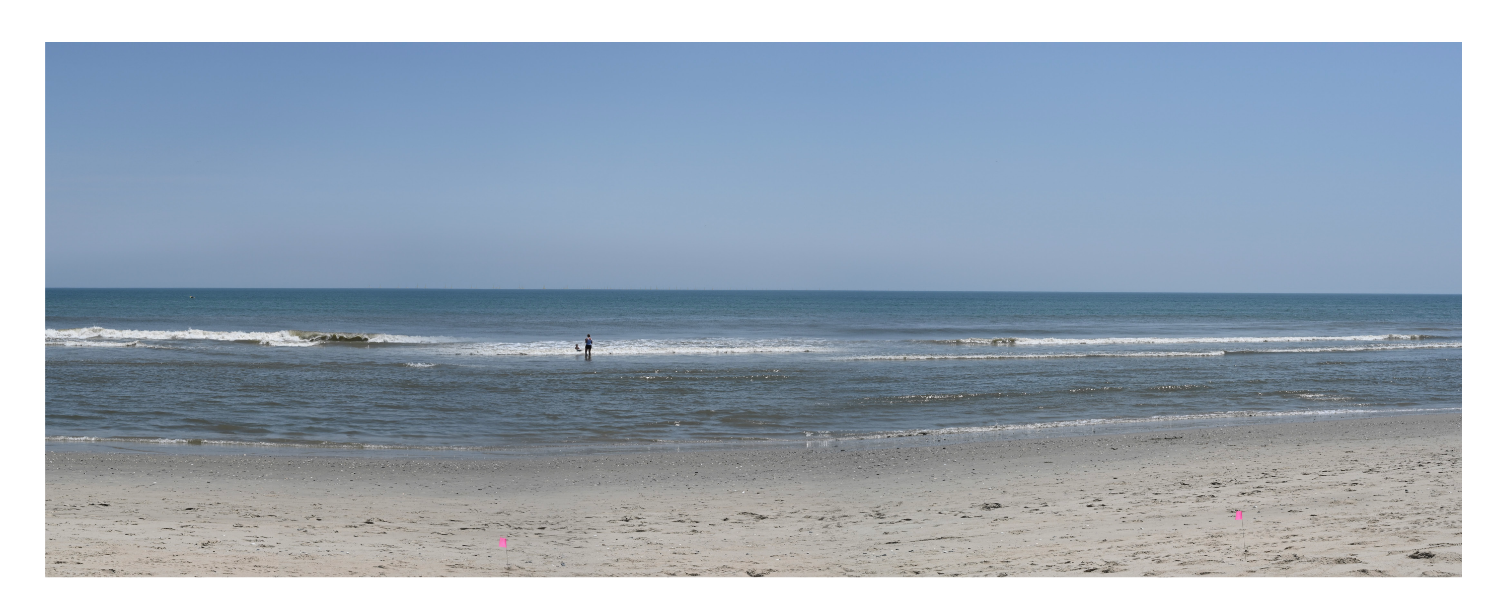
KOP 49a - Whale Head Bay, Residential - Distance to Project 39.1 miles