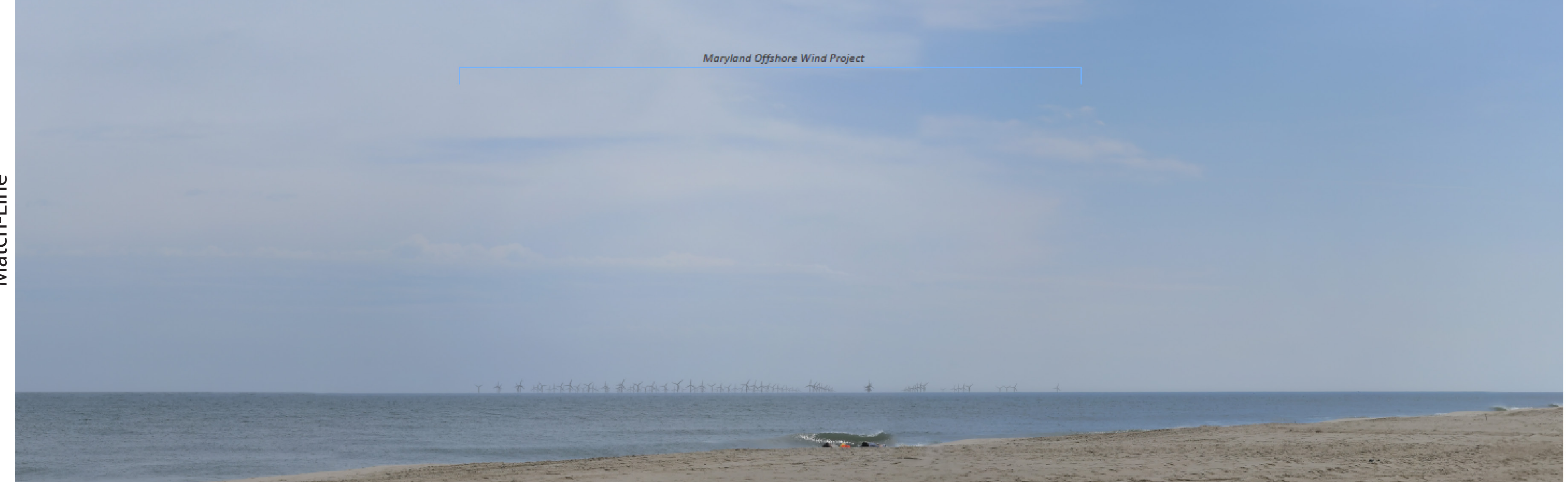
Cropped Single Frame (50-mm lens) Simulation, Right Half of the Panoramic View and Project Extents