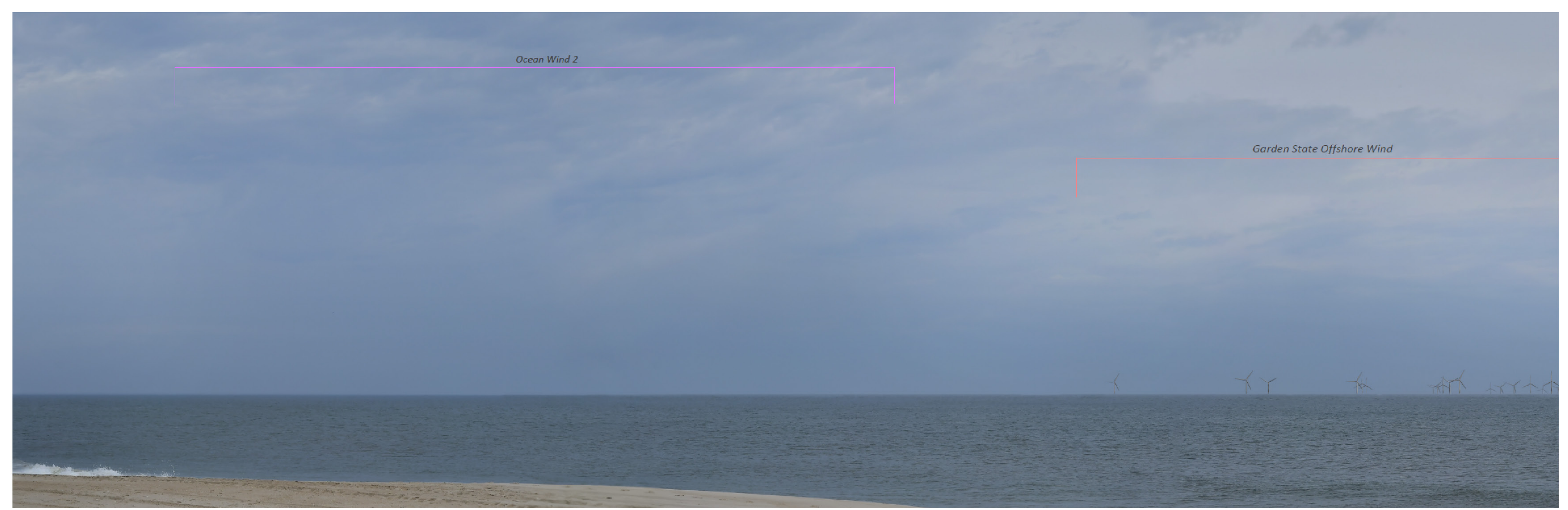
Cropped Single Frame (50-mm lens) Simulation, Left Half of the Panoramic View and Project Extents