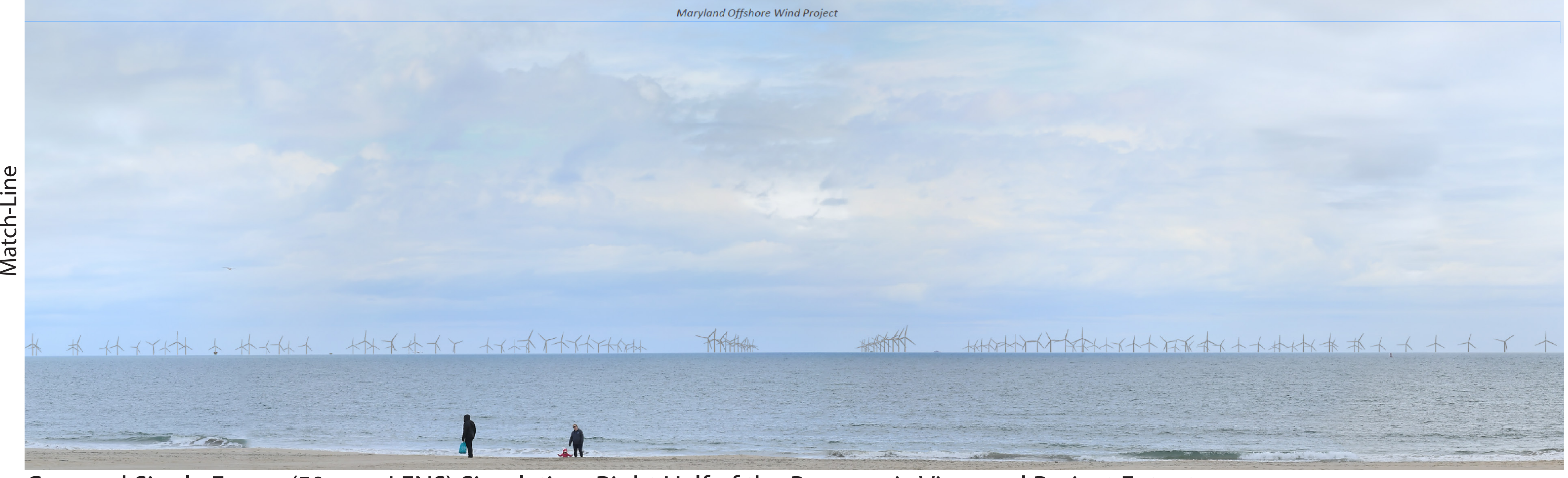
Cropped Single Frame (50-mm LENS) Simulation, Right Half of the Panoramic View and Project Extents