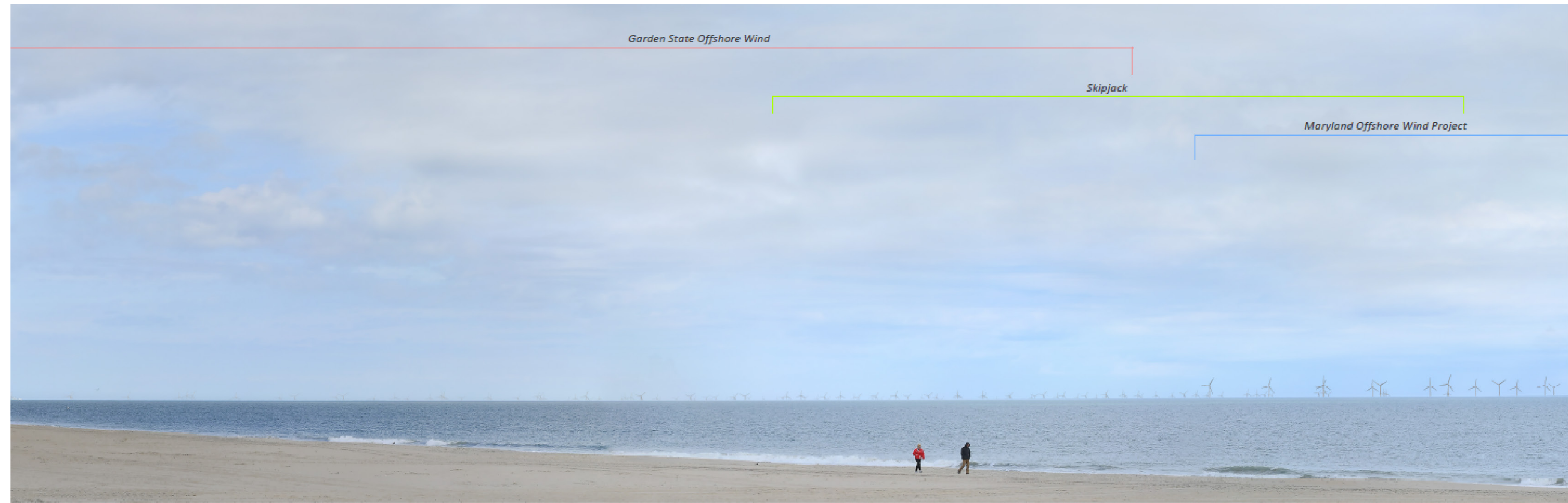
Cropped Single Frame (50-mm LENS) Simulation, Left Half of the Panoramic View and Project Extents