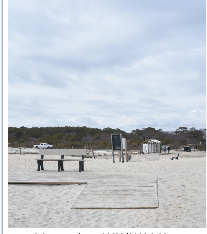
#2 Context Photo, 03/22/2023 3:00 PM A view landward from the beach looking across public access features toward a parking lot.