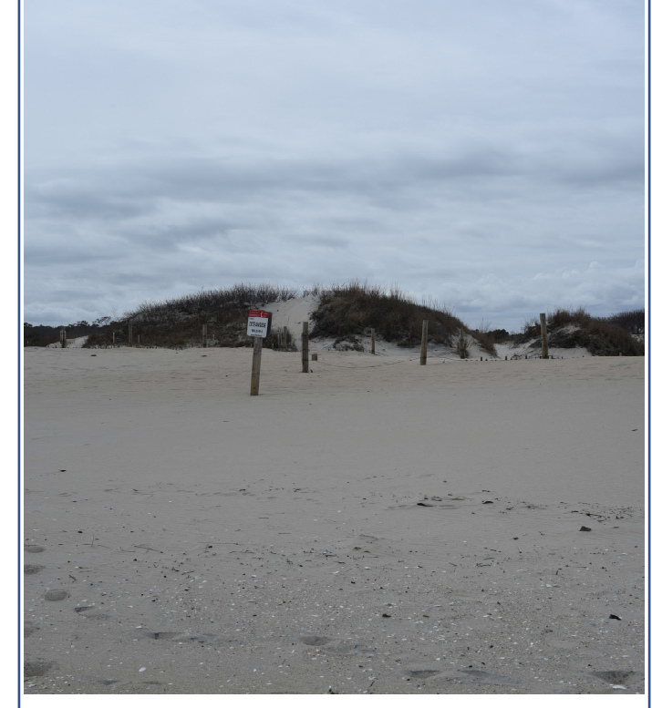
#6 Viewing West, 03/22/2023 3:00 PM