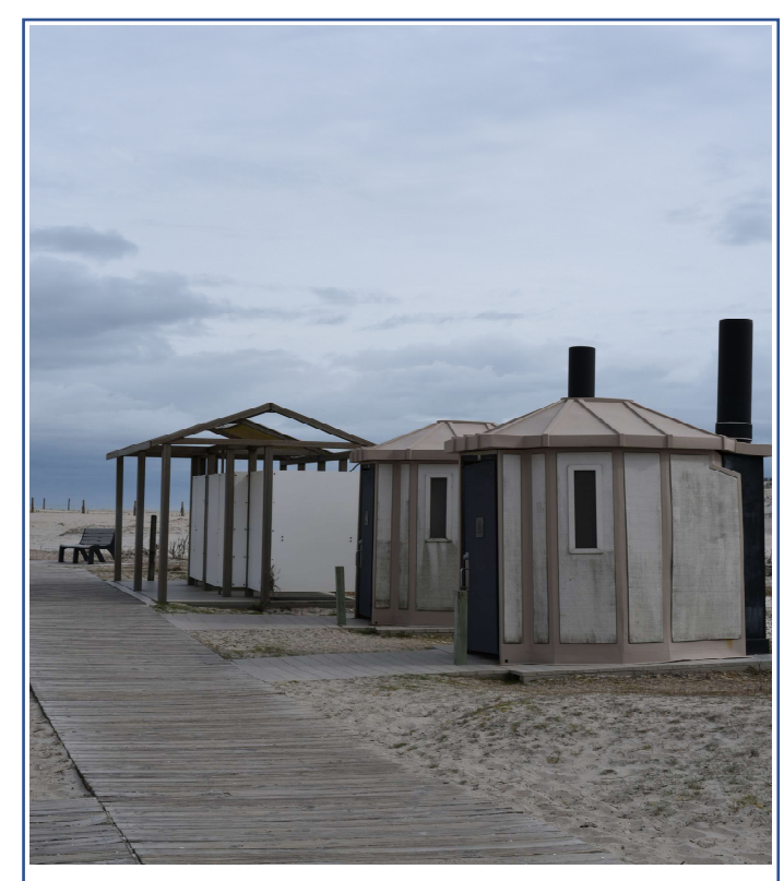
#1 Context Photo, 03/22/2023 3:00 PM A view of the public restrooms and beach access near Bayberry Drive.

This view is from Assateague Island National Seashore in Maryland southwest of the nearest proposed WTG location. It is a popular recreation area/tourist destination that receives high visitation throughout the summer and fall. Visitors use the beach to lounge, go swimming, surfing, boating, or fishing.