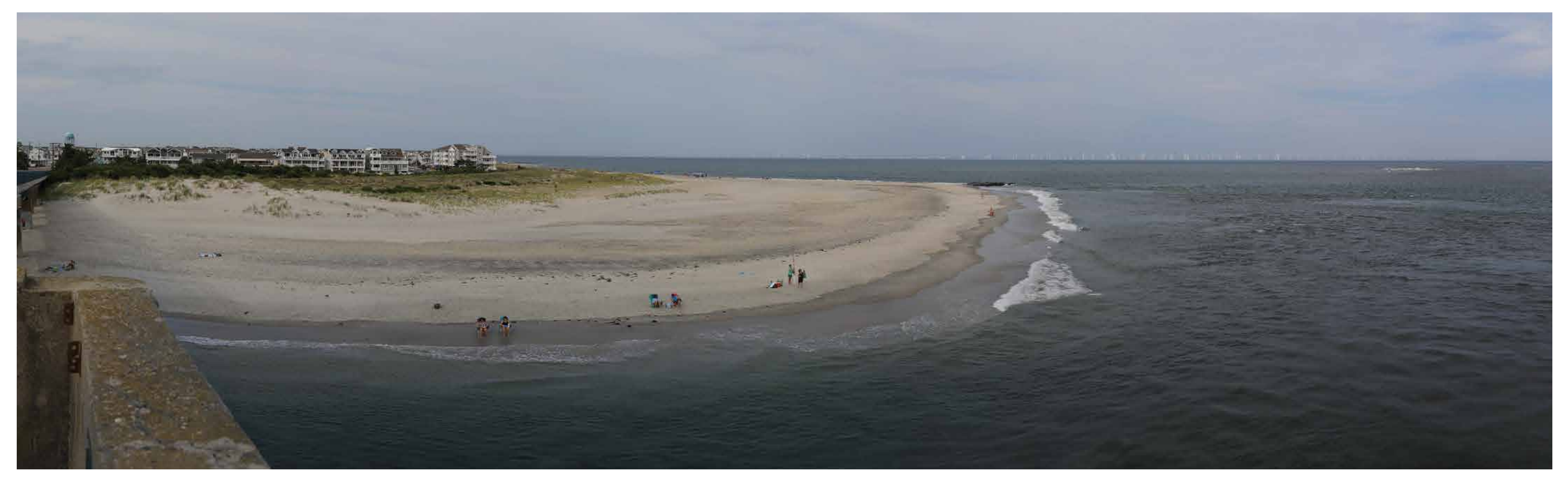
Daytime east-northeast view of full lease build-out at Townsend's Inlet Bridge, Sea Isle City, New Jersey

Key Observation Point SIC02 - Distance to Project 27 miles