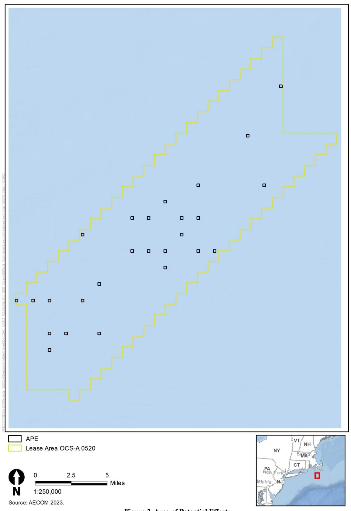
Figure 2. Area of Potential Effects