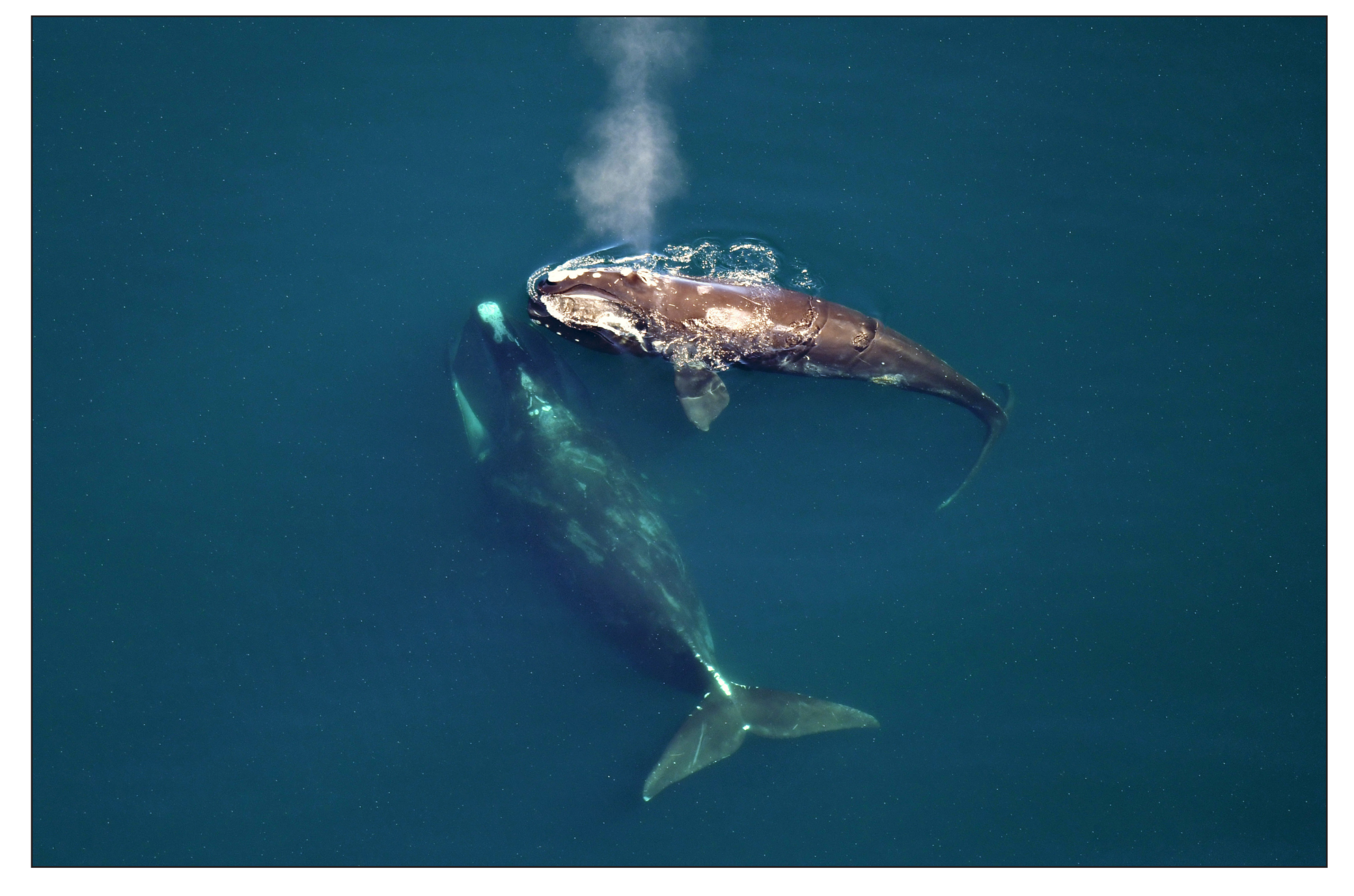
The endangered population of North Atlantic right whales has been declining and is a species of particular concern in offshore wind development areas. BOEM will work with it's partners to develop appropriate mitigation, monitoring, and reporting conditions for whales and other protected species.