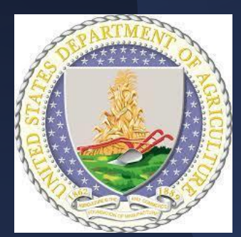
FAS FSA APHIS NRCS AMS