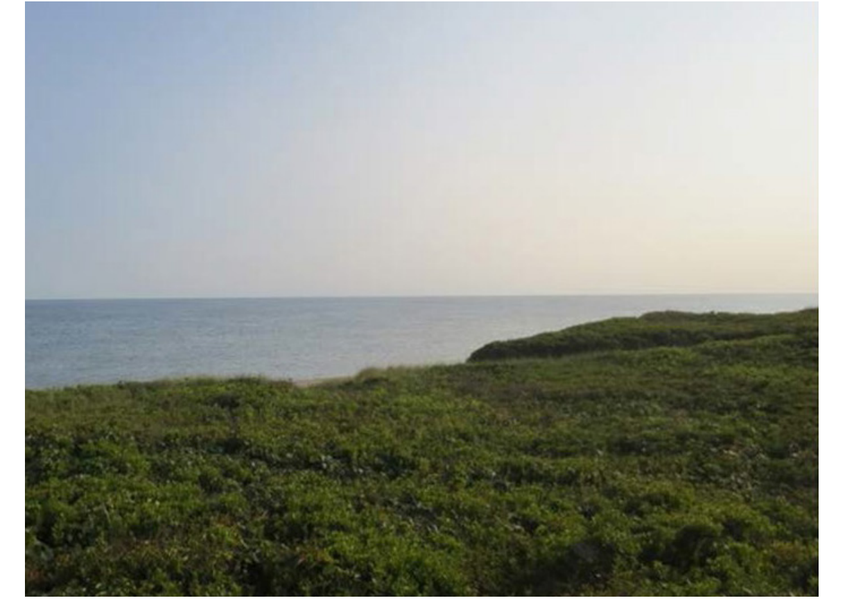
Tom Nevers Field, Nantucket