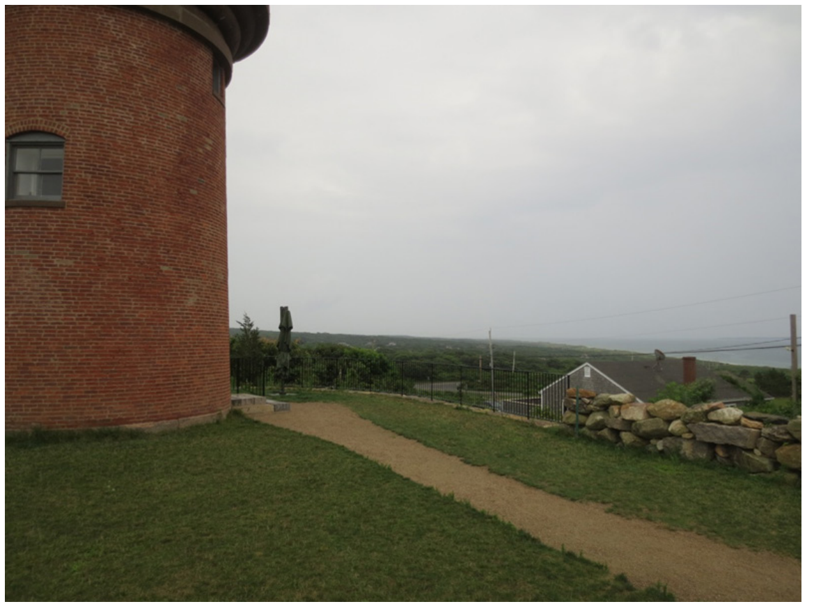
Gay Head Lighthouse, Aquinnah