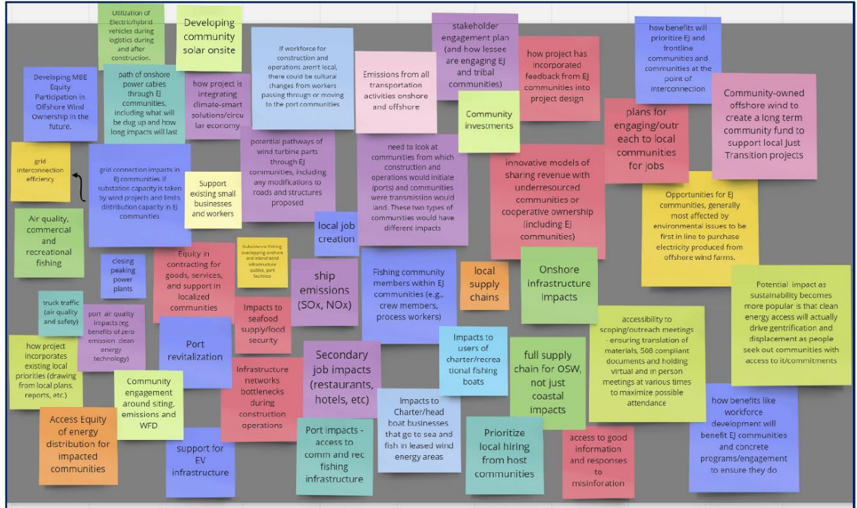
Figure 2: Miro Board Ideas Shared at July 21, 2022 EJ Roundtable