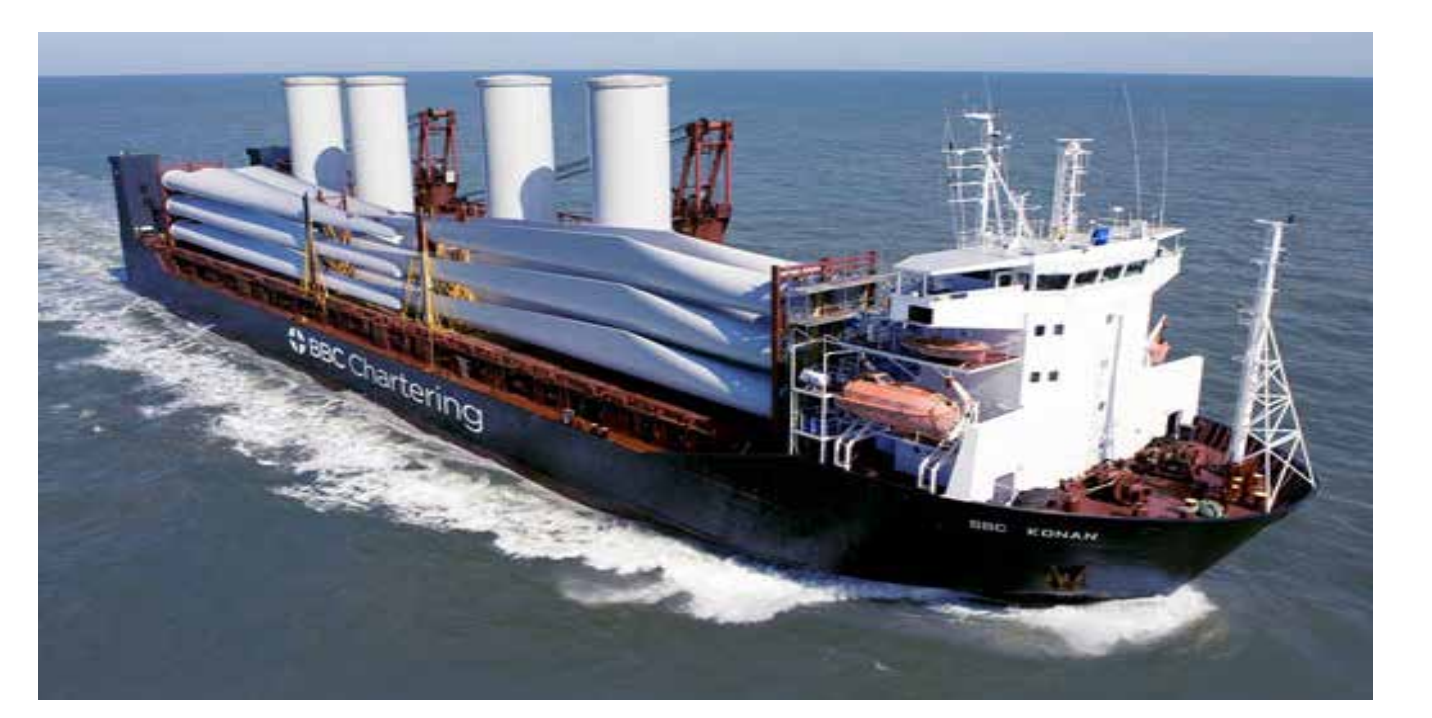
Tower Sections Onboard the BBC Chartering and Logistic Ship M/V BBC Konan