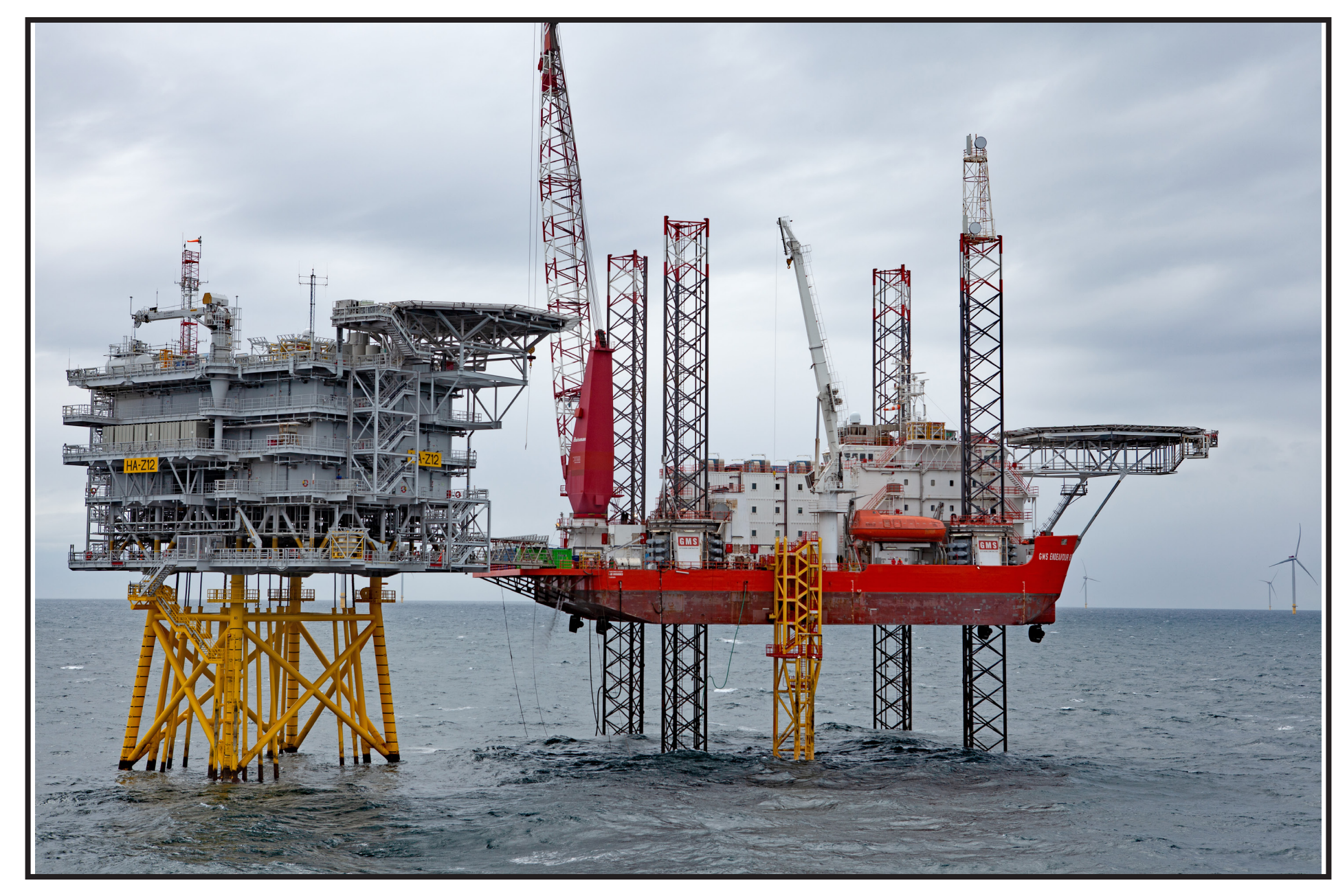
Installation of Offshore Substation