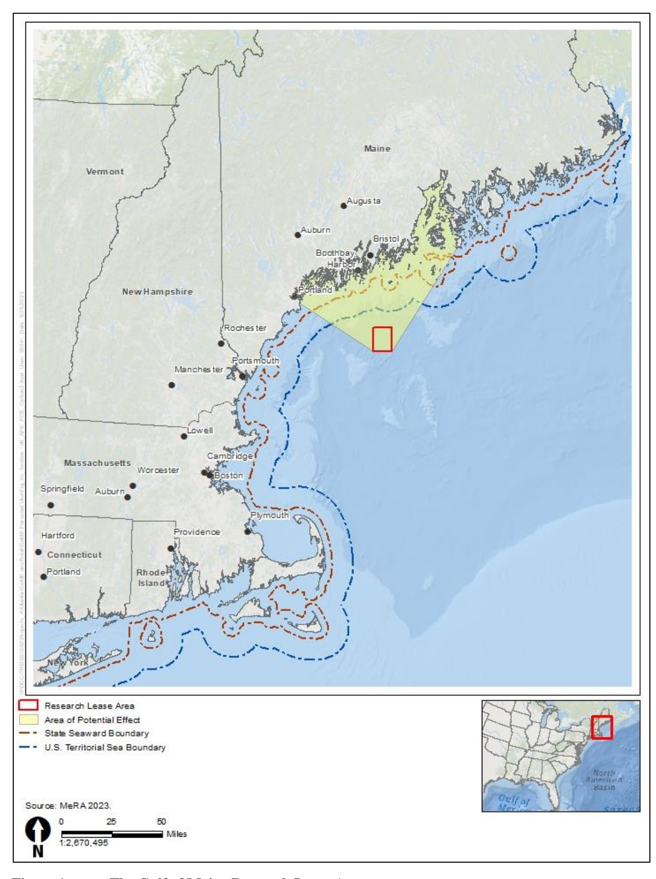
Figure 1. The Gulf of Maine Research Lease Area