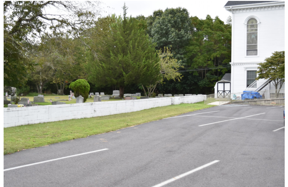
105 Port Republic - Port Republic Historic District, St. Paul's Church & Cemetery NE