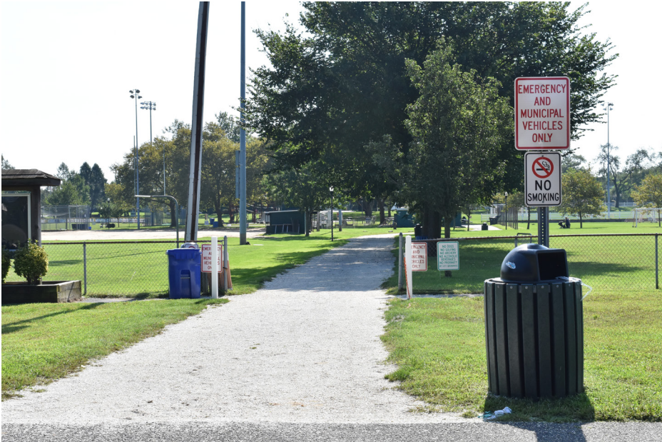
214 Linwood - All Wars Memorial Park, Linwood Historic District SE