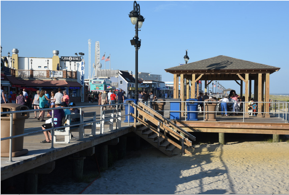
280 Ocean City - Ocean City Boardwalk, 8th Street