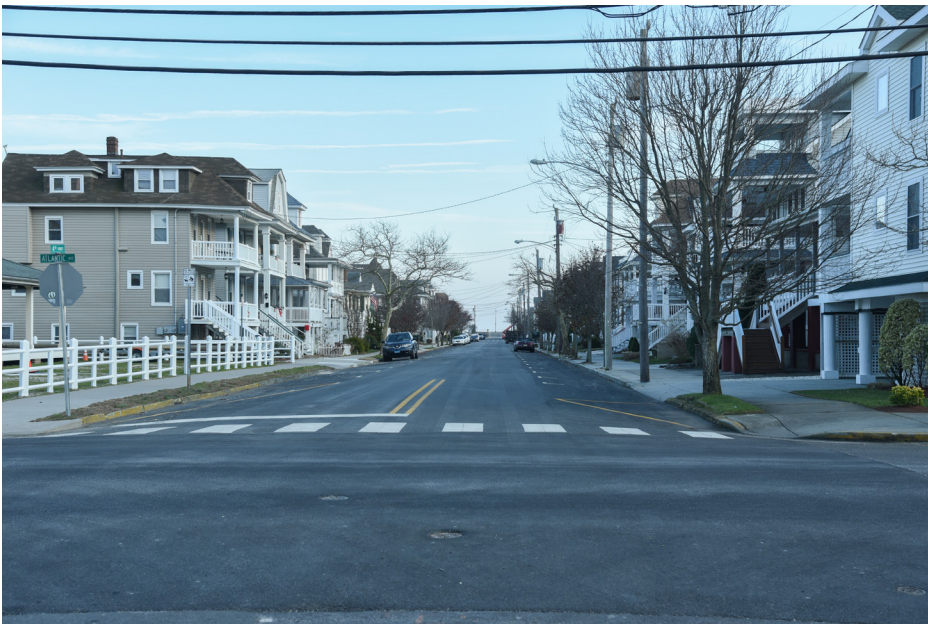
266 Ocean City - Atlantic Avenue at 4th Street SW