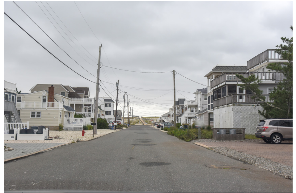
099 Long Beach Township (Holgate) - Jacqueline Avenue E