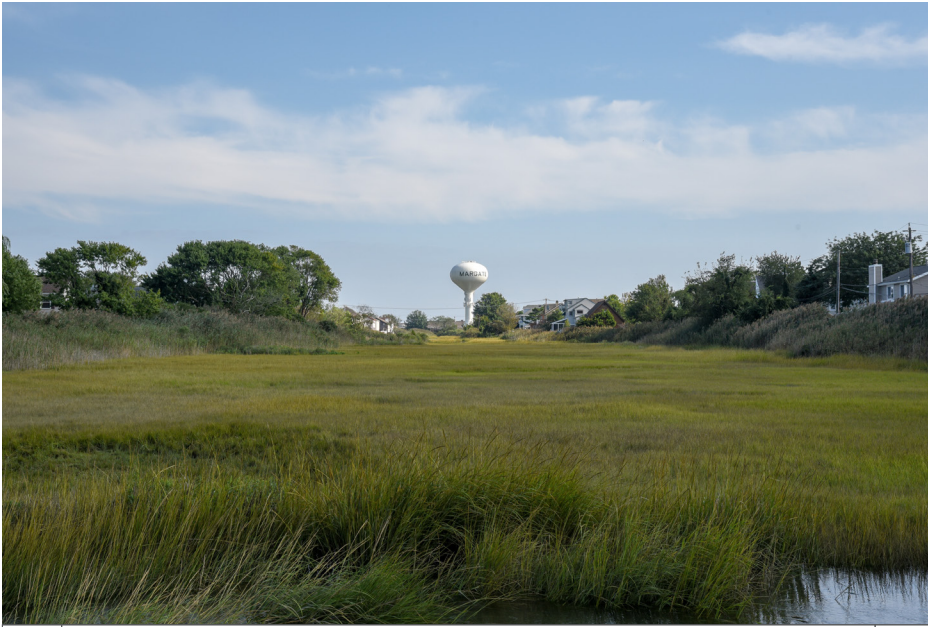
229 Margate City - Minnie Creek Wetlands, Conservation Area SE