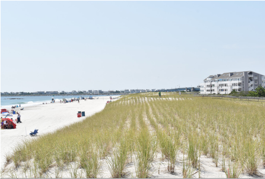
336 Sea Isle City - Public Beach Access, 89th Street SW