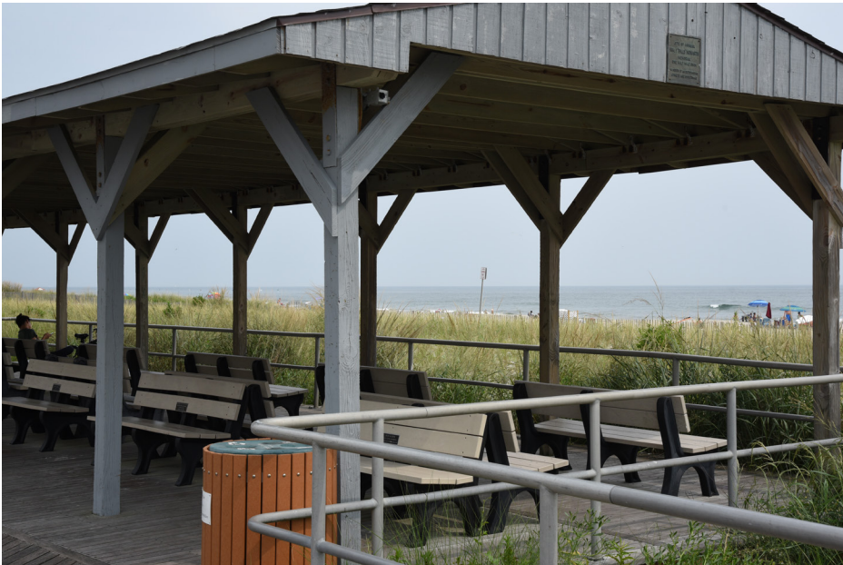
208 Ventnor City - Boardwalk Pavilion, at South Cambridge Avenue E