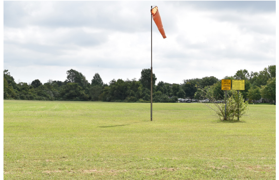
196 Northfield - Stillwater Park, at Main Street SE