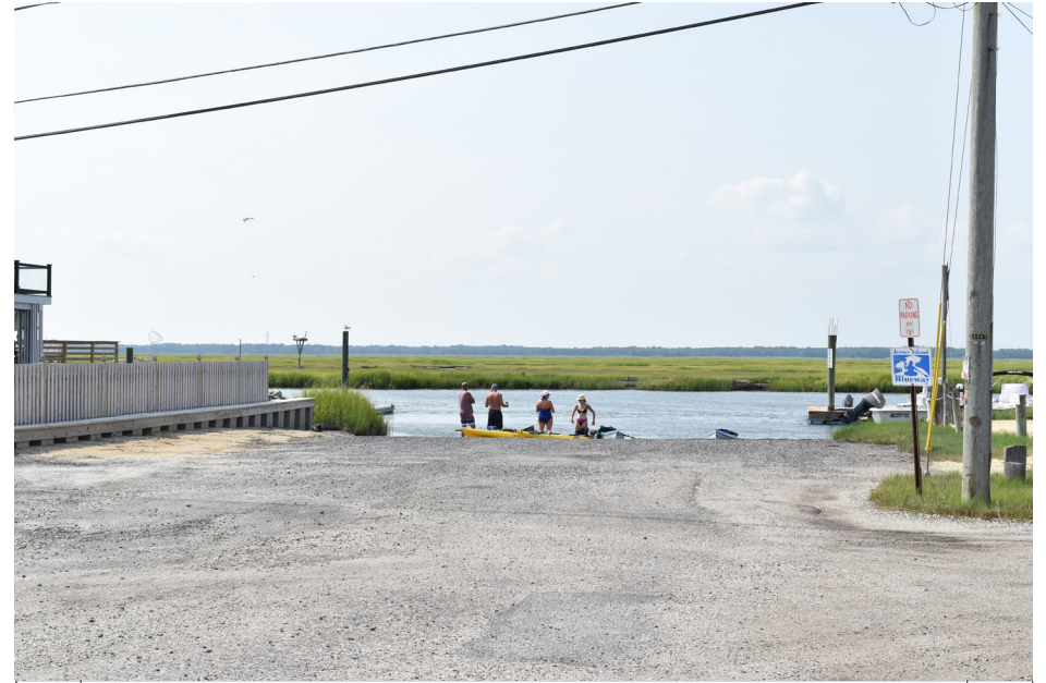
320 *Upper Township - Boat Launch, Taylor Avenue, Jersey Island Blueway N