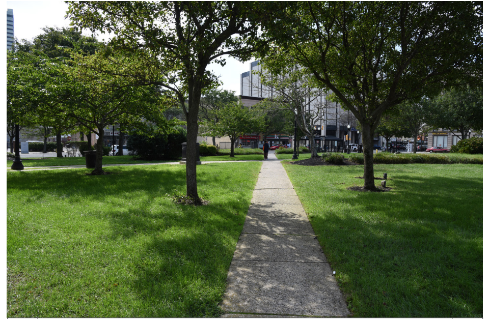
173 Atlantic City - Center City Park S