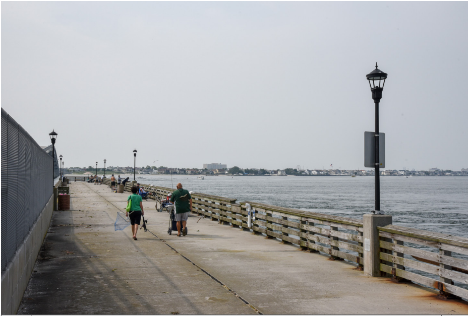
248 Egg Harbor Township - Longport Fishing Pier S