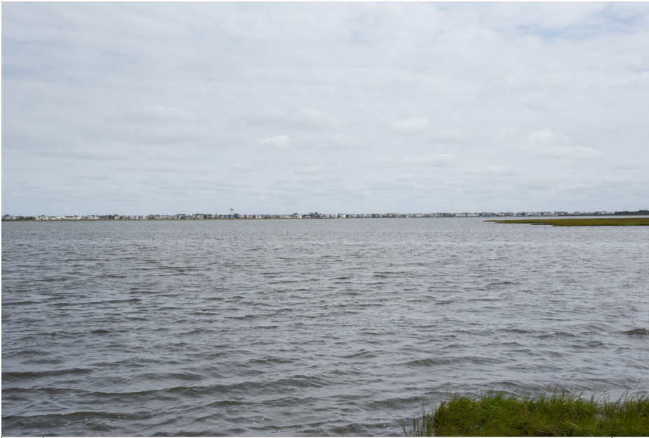
044 *Stafford Township - Bayfront Park, Conservation Area, Mill Creek Road SE