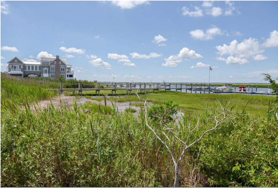
367 Avalon - West side of 66th Street, Lower Long Reach Inlet W