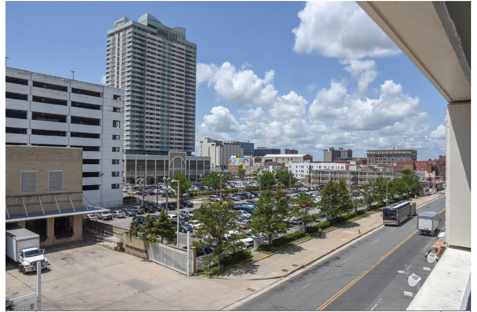
177 Atlantic City - Hard Rock Casino, Parking Garage, Wyndham Skyline Tower W