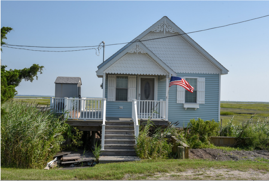
391 Middle Township - Atlantic City Railroad Cape May Division Historic District N