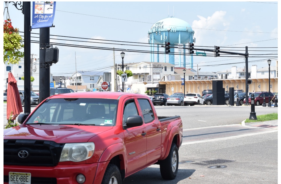
347 Sea Isle City - John F. Kennedy Boulevard at Landis Avenue N