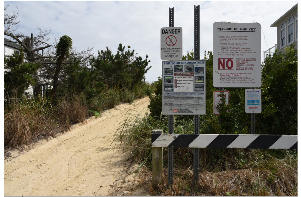
053 Surf City - Beach Access, 16th Street SE