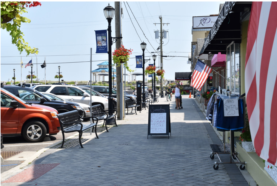
354 Sea Isle City - Sea Isle City Promenade, John F. Kennedy Boulevard SE