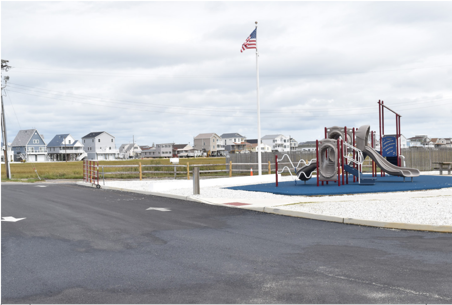
085 *Tuckerton - South Green Street Park N