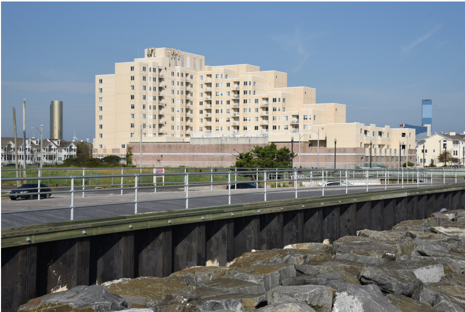
182 *Atlantic City - Maine Avenue Promenade, Overlook NW