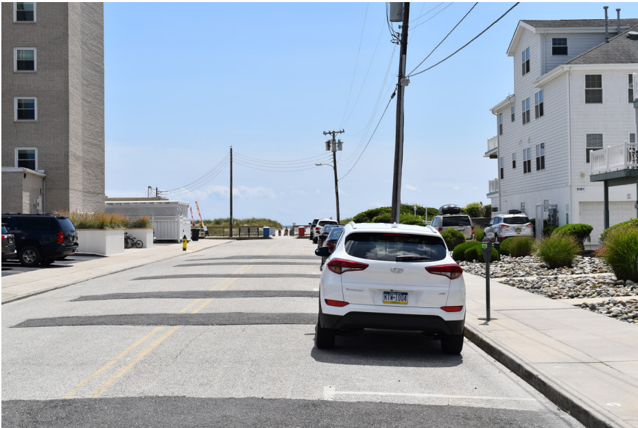
419 Wildwood Crest - Newark Avenue, Beachfront townhouses SE