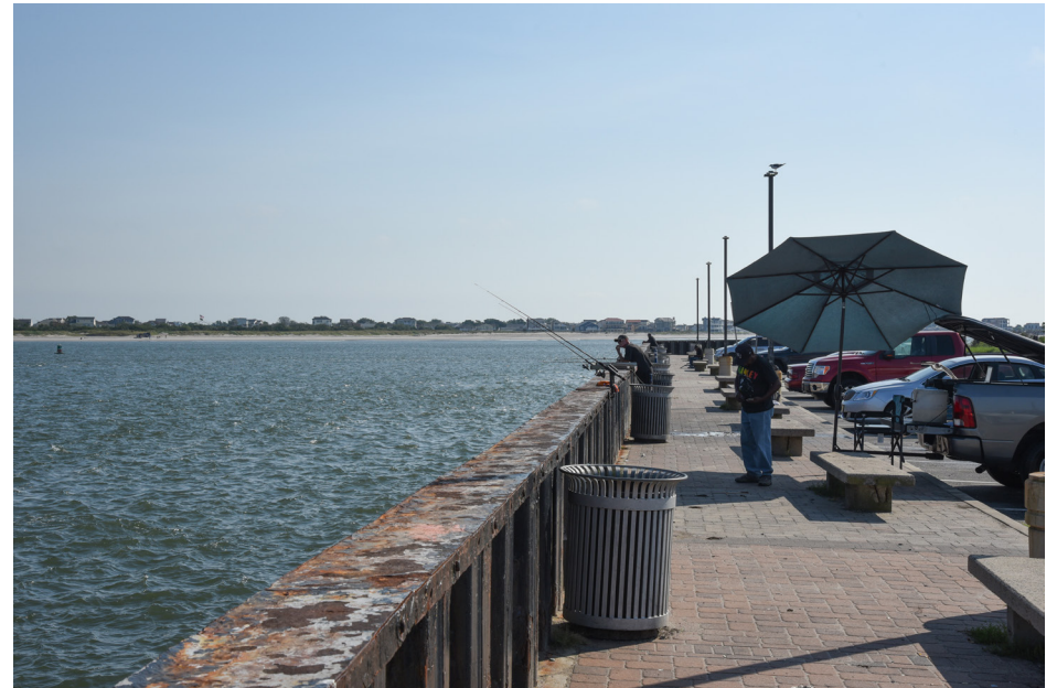
155 Atlantic City - Atlantic City Aquarium Dock E