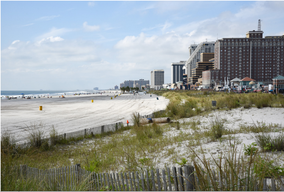
180 Atlantic City - Beach Access, Kennedy Plaza W