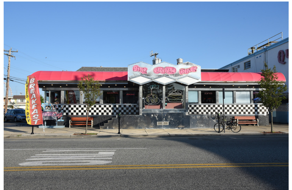
439 Wildwood - Pink Cadillac Diner, Atlantic Avenue SE