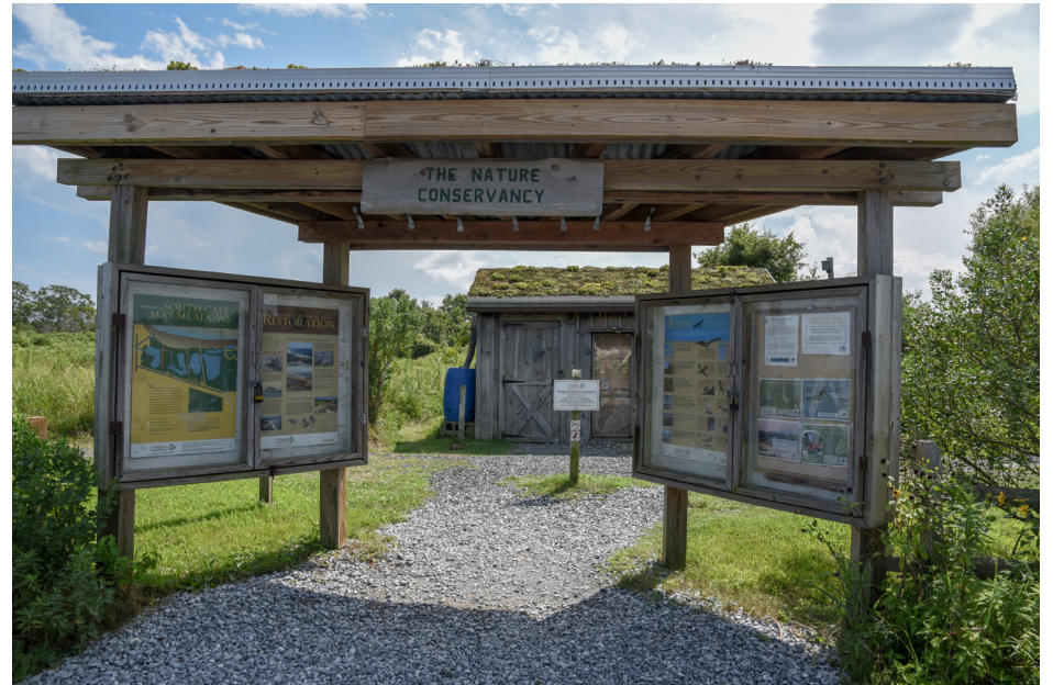
464 Lower Township - South Cape May Meadows Preserve S