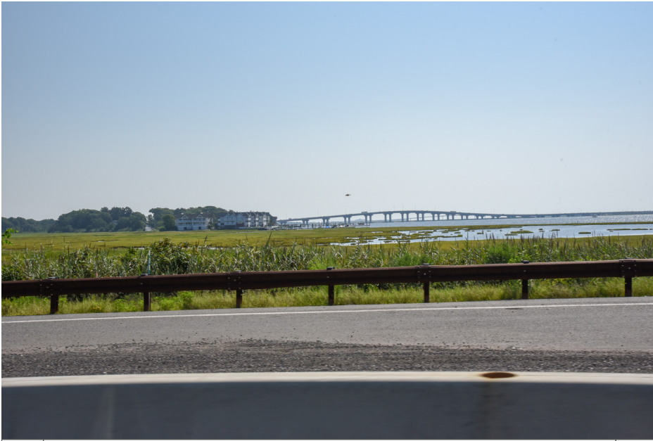
296 Somers Point - Garden State Parkway, Historic Resource E