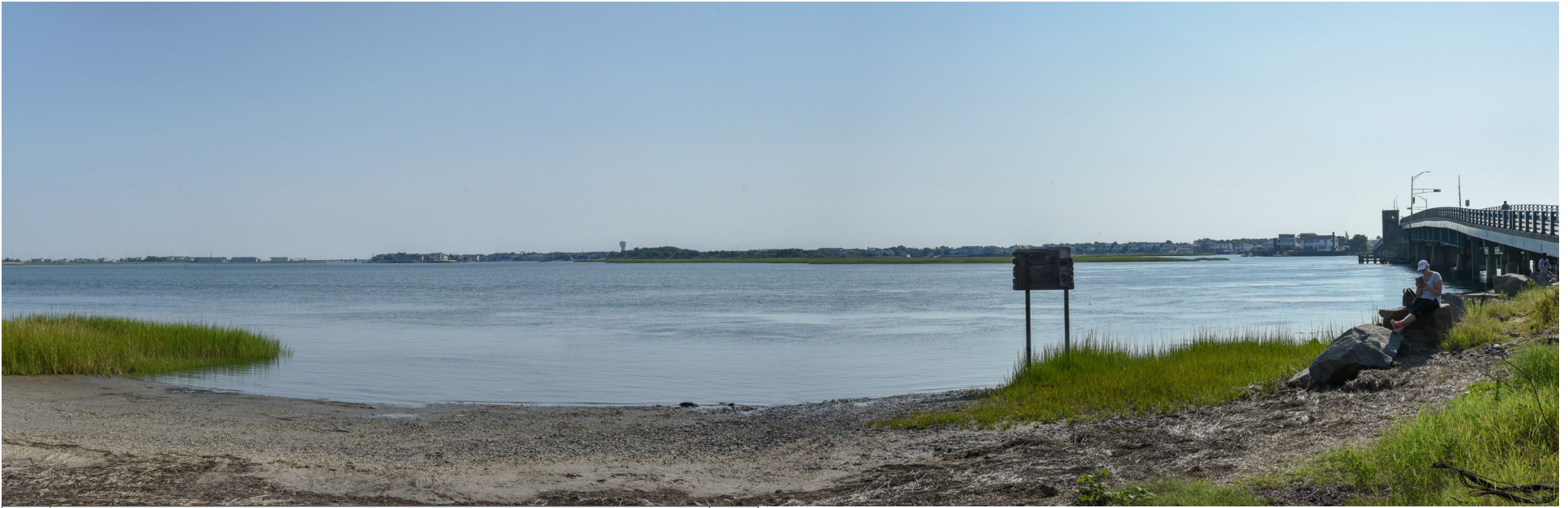
395 Middle Township - Boat Launch west of Grassy Sound Bridge NE