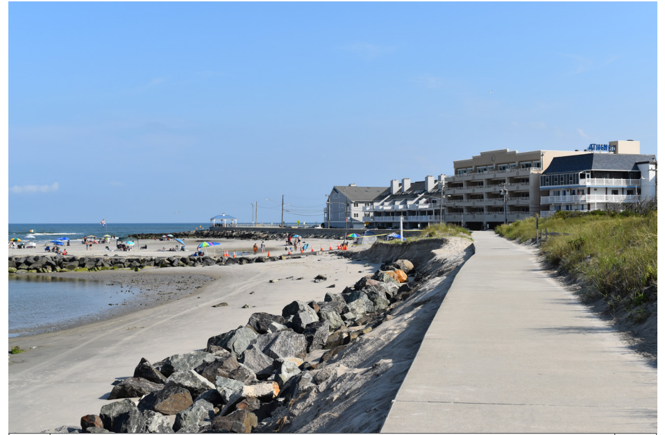
452 North Wildwood - Hereford Inlet Park S