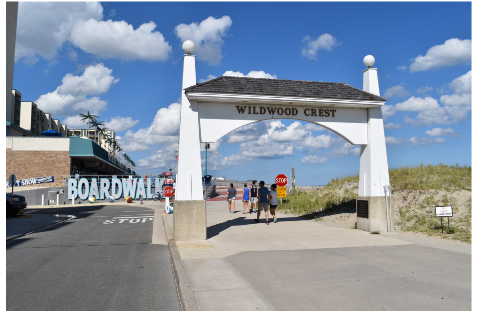
424 Wildwood Crest - Beginning of Boardwalk NE