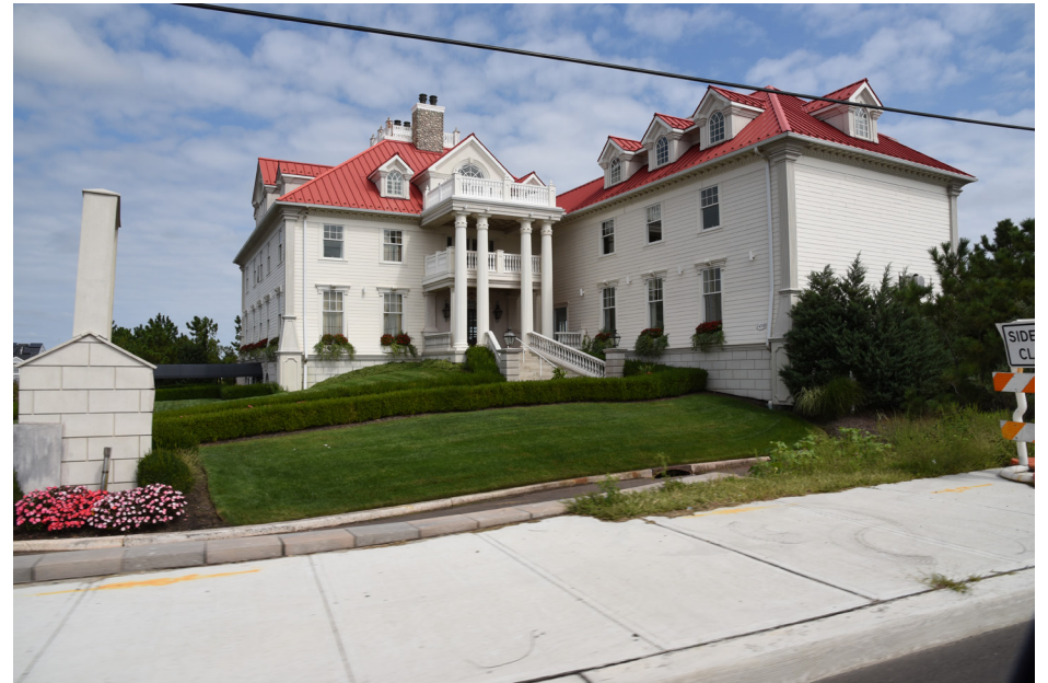
047 Stafford Township - Bay Avenue N