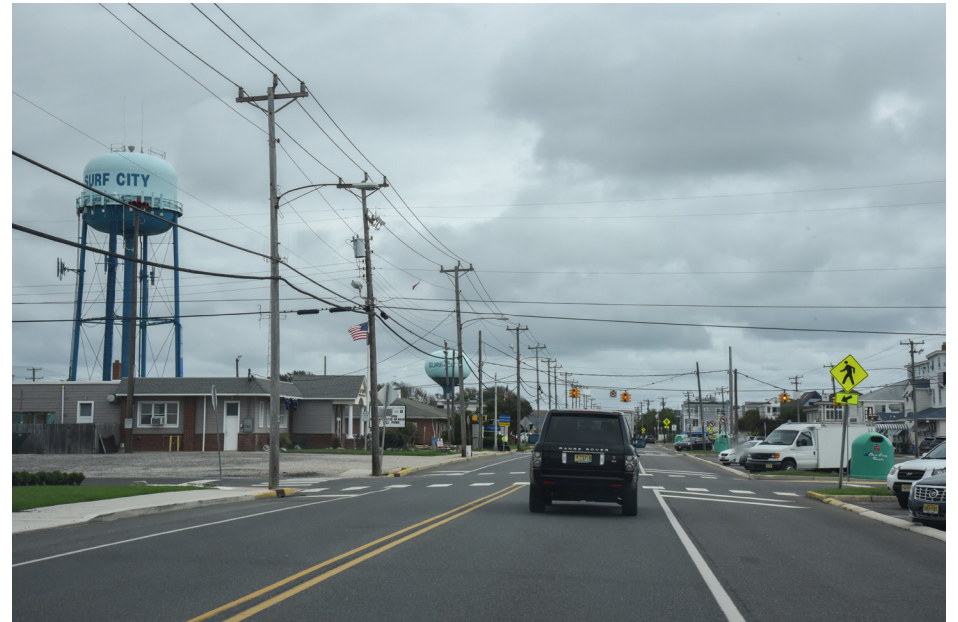
059 Surf City - Long Beach Boulevard at 6th Street N