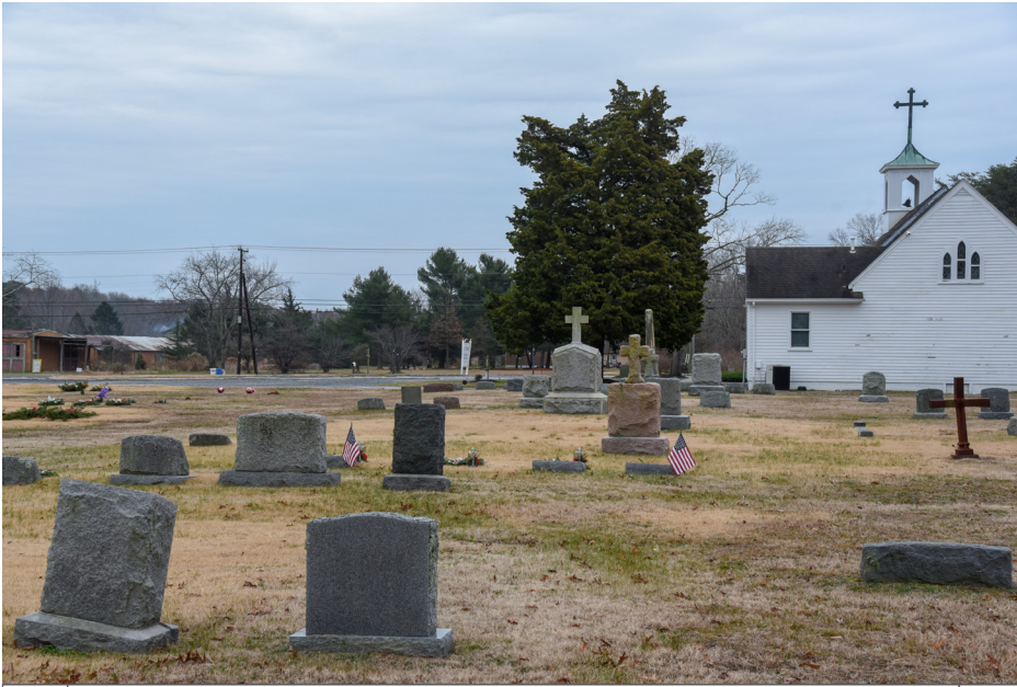
383 Middle Township - Goshen Historic District, St. Elizabeth's Cemetery SW