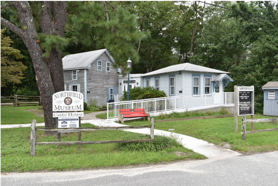
193 Northfield - Northfield Museum at Casto House NW