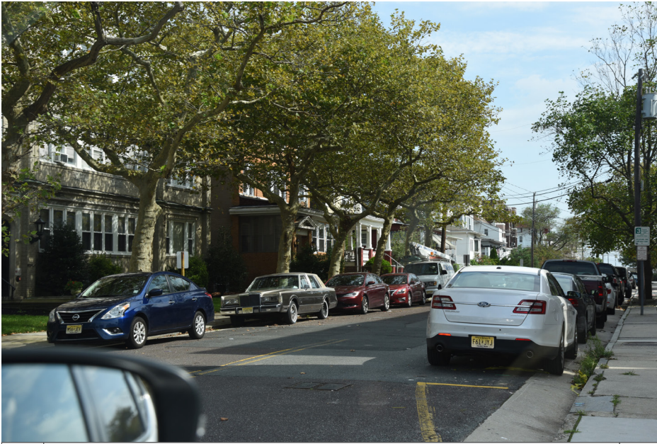
144 Atlantic City - Ventnor Avenue Residential Historical District E