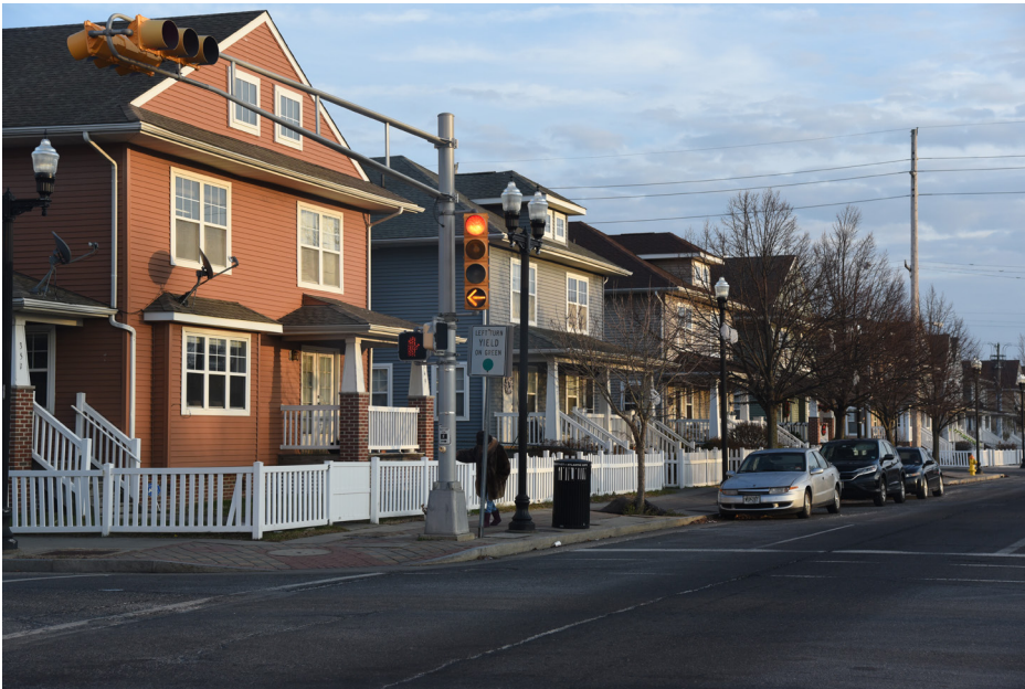
154 Atlantic City - North Carolina Avenue at Adriatic Avenue SE