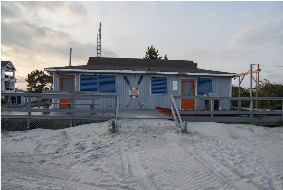
123 *Brigantine - Brigantine Beach Patrol, 17th Street NW