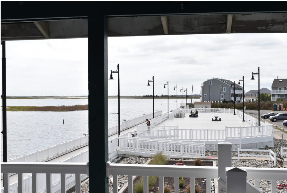
034 | Barnegat Township - Barnegat Township Municipal Dock | S