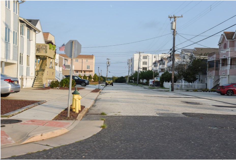
117 Brigantine - Brigantine Avenue at 44th Street SE