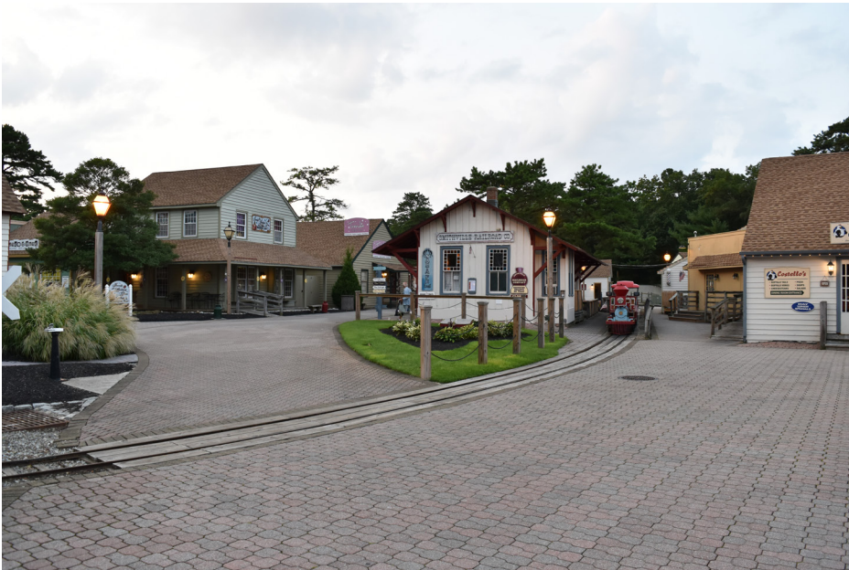
111 Galloway Township - Historic Smithville N