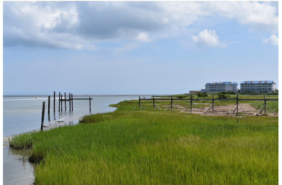
397 Middle Township - Dad's Place Marina, off of Ocean Drive NE