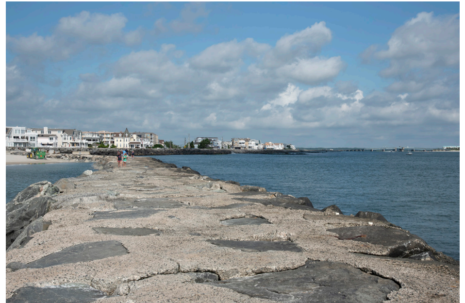
370 *Avalon - Jetty at Northern End of Avalon Beach NW