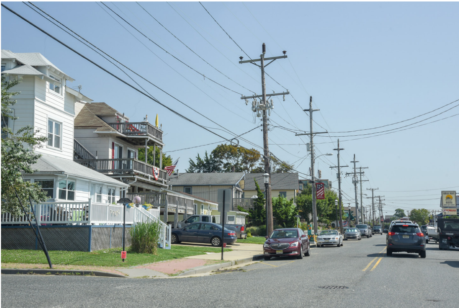
262 Somers Point - Bay Front Historic District, Bay Avenue NE