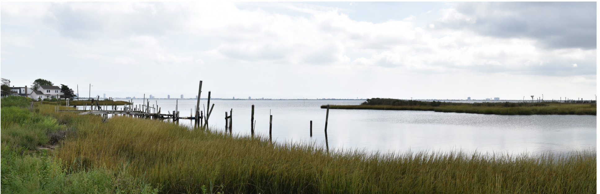
136 Pleasantville - Bay Drive SE