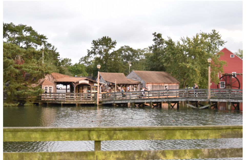
112 Galloway Township - Historic Smithville S