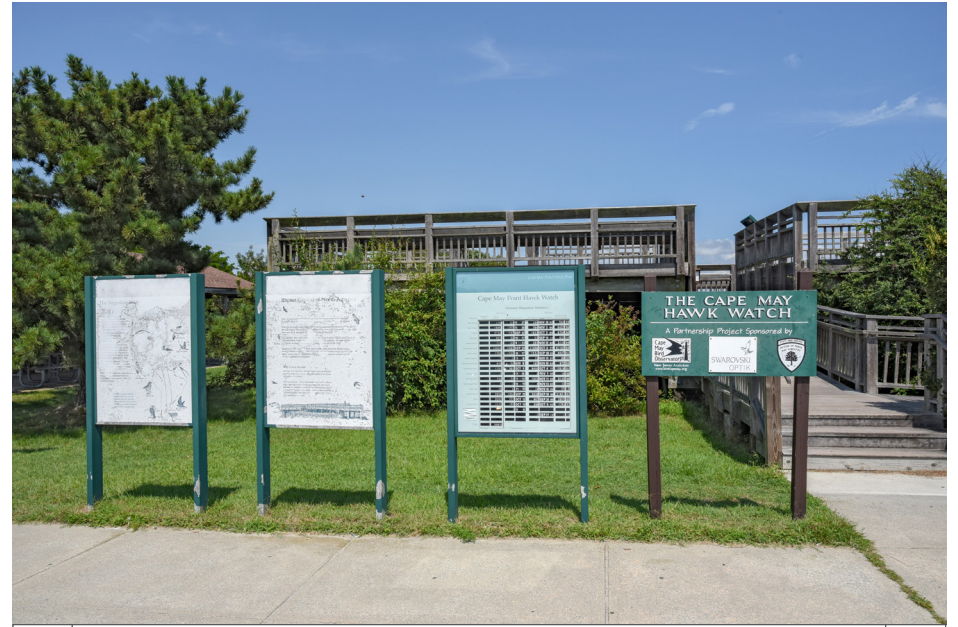
462 Lower Township - Cape May Point State Park NW