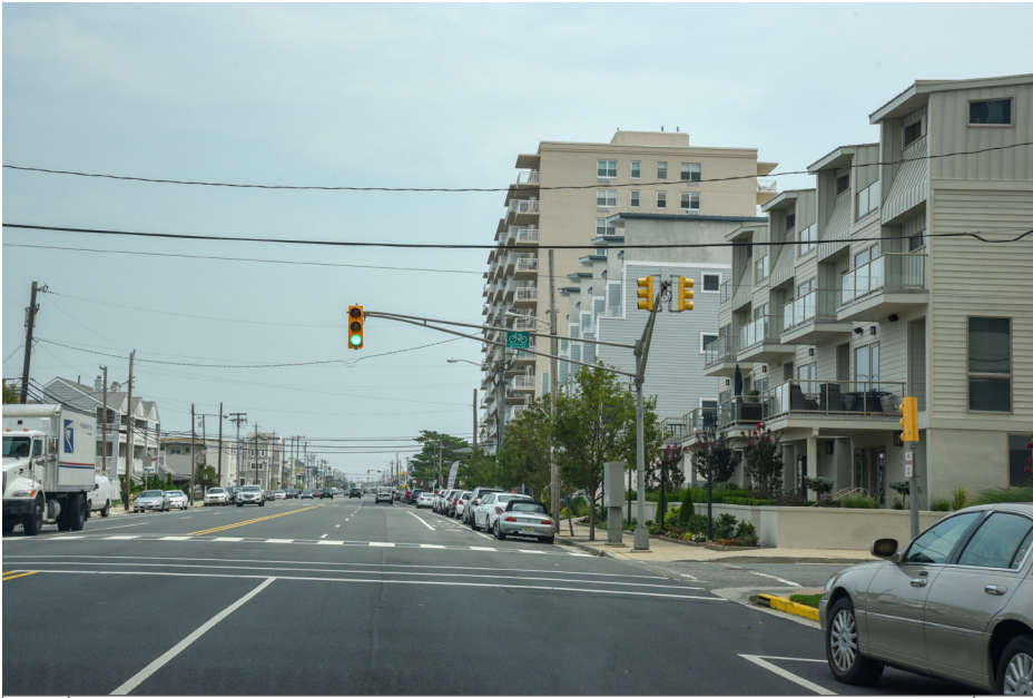
225 Margate City - Atlantic Avenue at South Madison Avenue NE