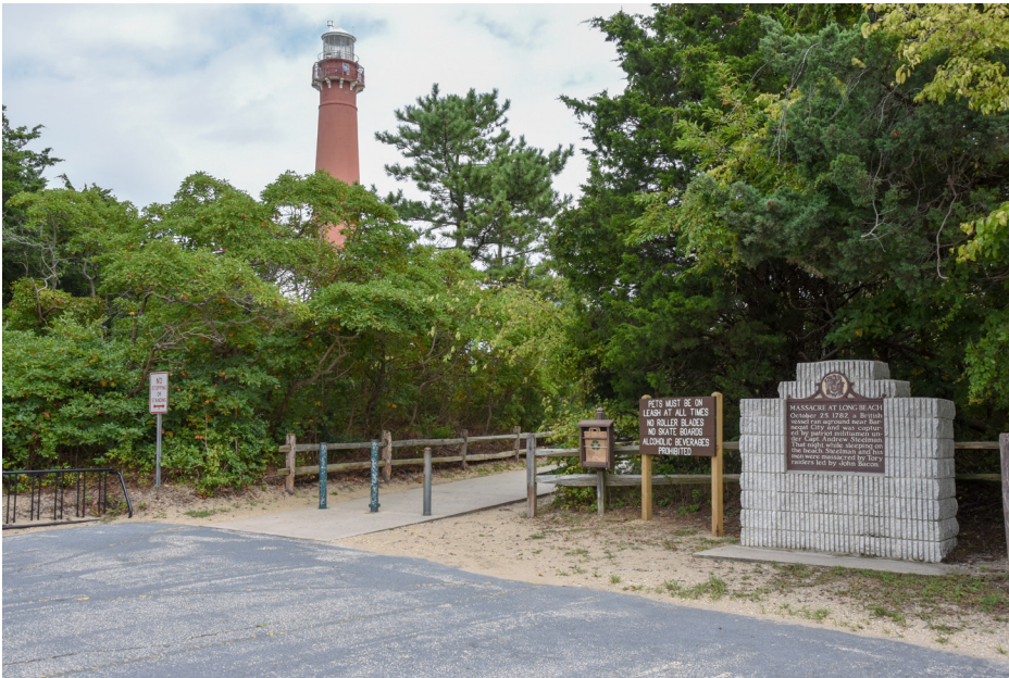
027 *Barnegat Light - Barnegat Lighthouse State Park, Parking Lot / Entrance N