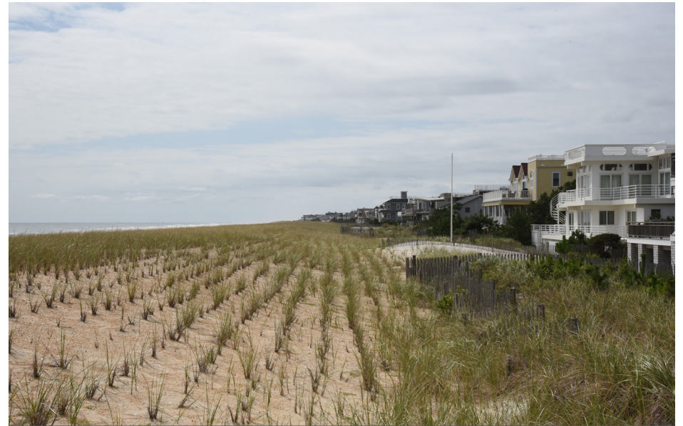
051 Long Beach Township (North Beach) - Public Beach Access, Long Beach Boulevard SW