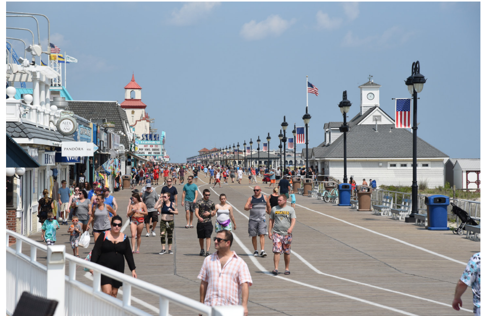
283 Ocean City - Ocean City Boardwalk, 13th-14th Street