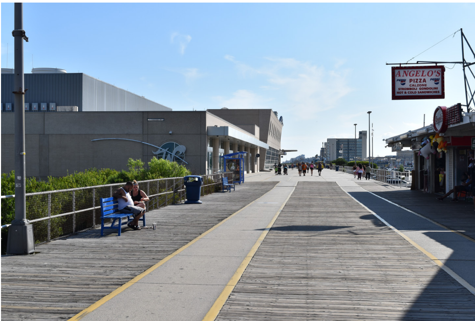
434 Wildwood - Convention Center, Boardwalk at Baker Avenue SW