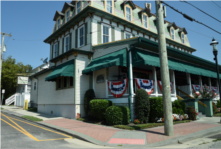
260 Somers Point - Bay Front Historic District, Anchorage Tavern, Bay Avenue N