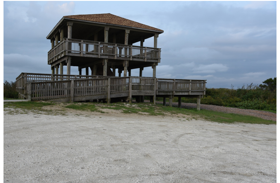
128 *Brigantine - Overlook, East Beach Avenue at 14th Street NE