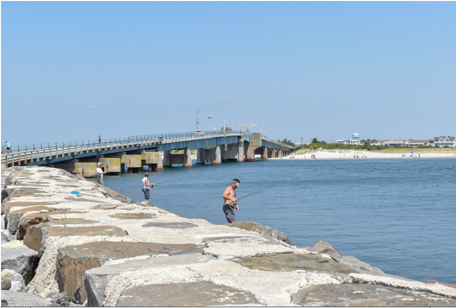
371 Avalon - Townsend Inlet Bridge, Ocean Drive N