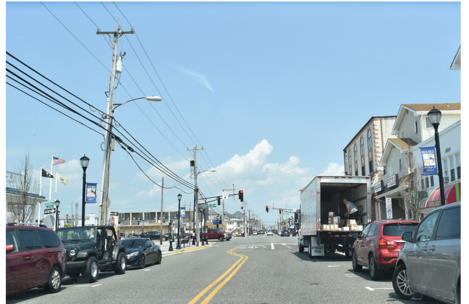
339 Sea Isle City - Landis Avenue, toward intersection with JFK Boulevard NE