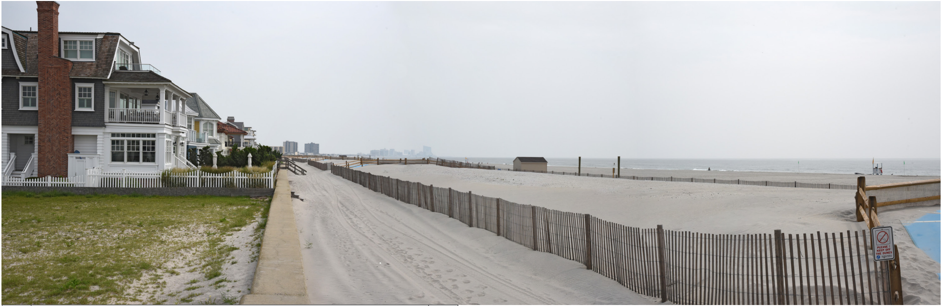
241 Longport - 12th Avenue, Public Beach Access NE