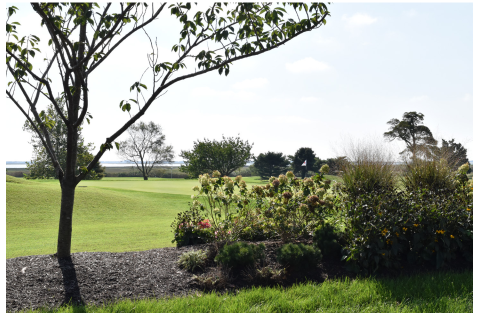
221 Linwood - Linwood Country Club SE