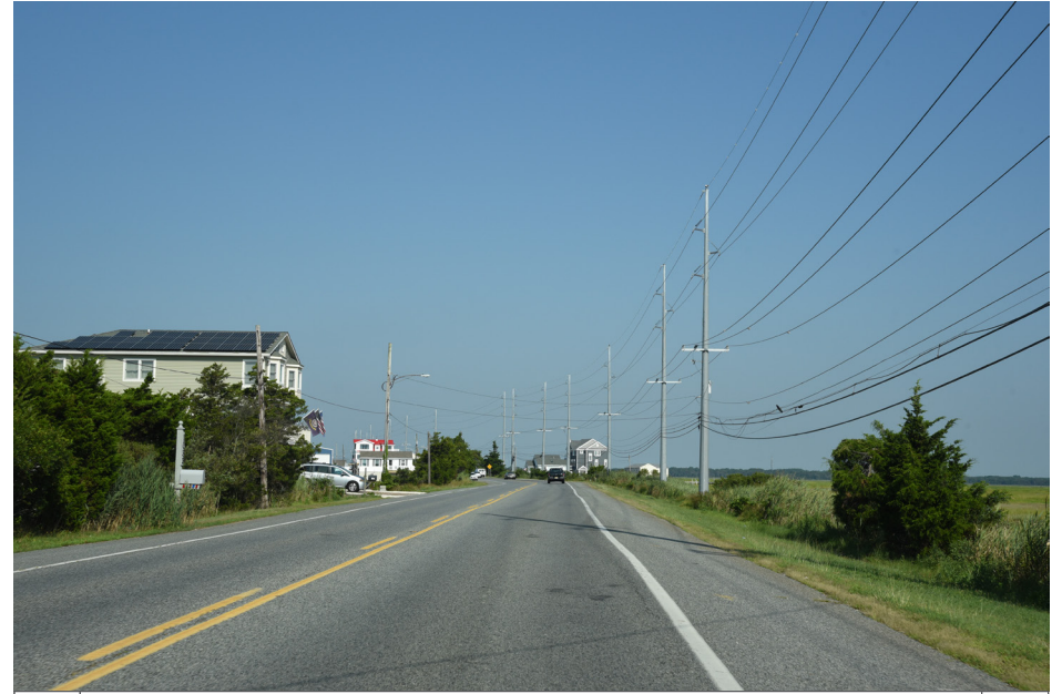
392 Middle Township - Atlantic City Railroad Cape May Division Historic District NW