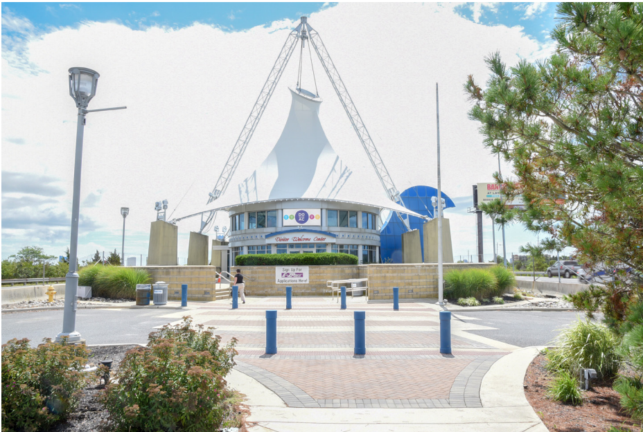
142 Pleasantville - Atlantic City's Visitor Center SE