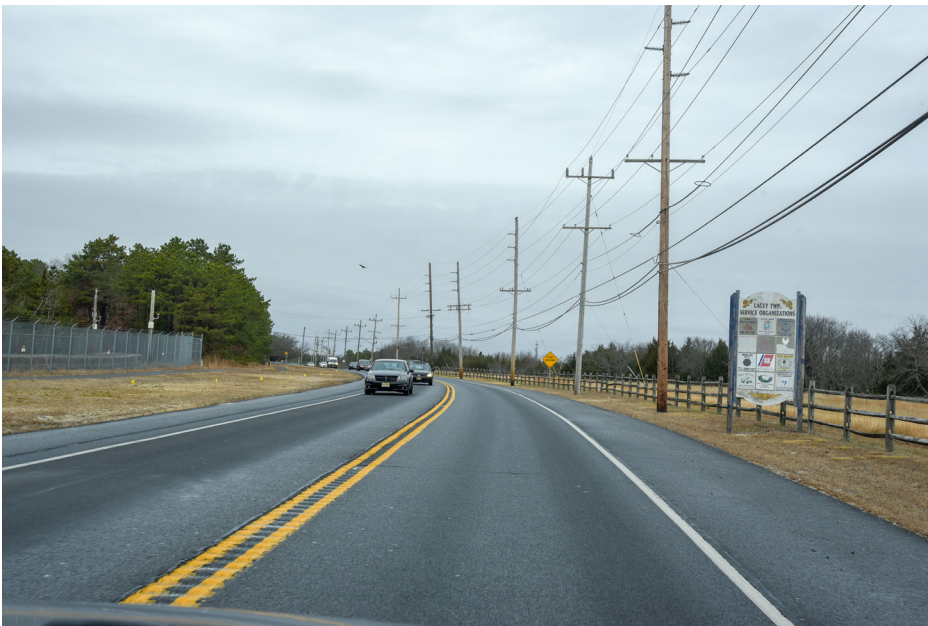
007 Lacey Township - Route 9 N