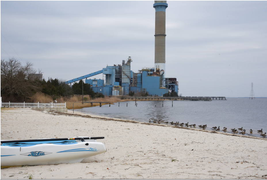
304 Upper Township - BL England, North Shore Road NW