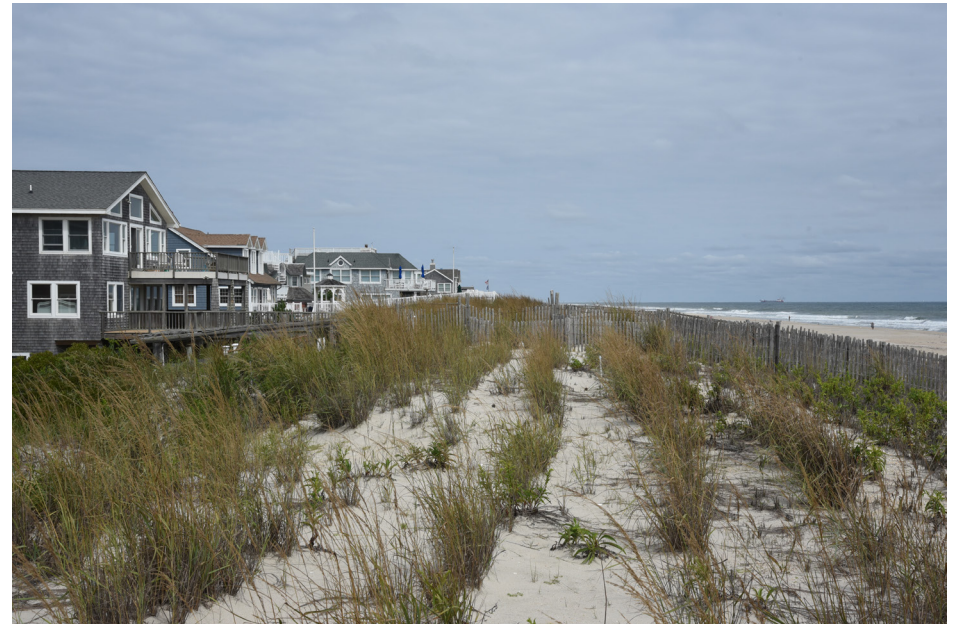
055 Surf City - Beach Access, 16th Street NE