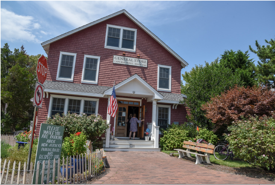
480 Cape May Point - Cape Avenue, Sea Grove Historic District NW