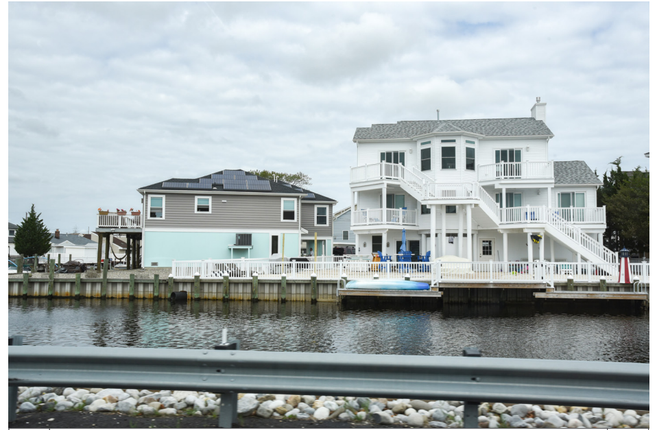
041 Stafford Township - Mill Creek Road NW