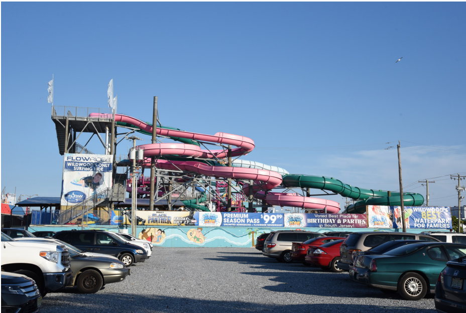
442 Wildwood - Splashzone Water Park, Atlantic Avenue SE