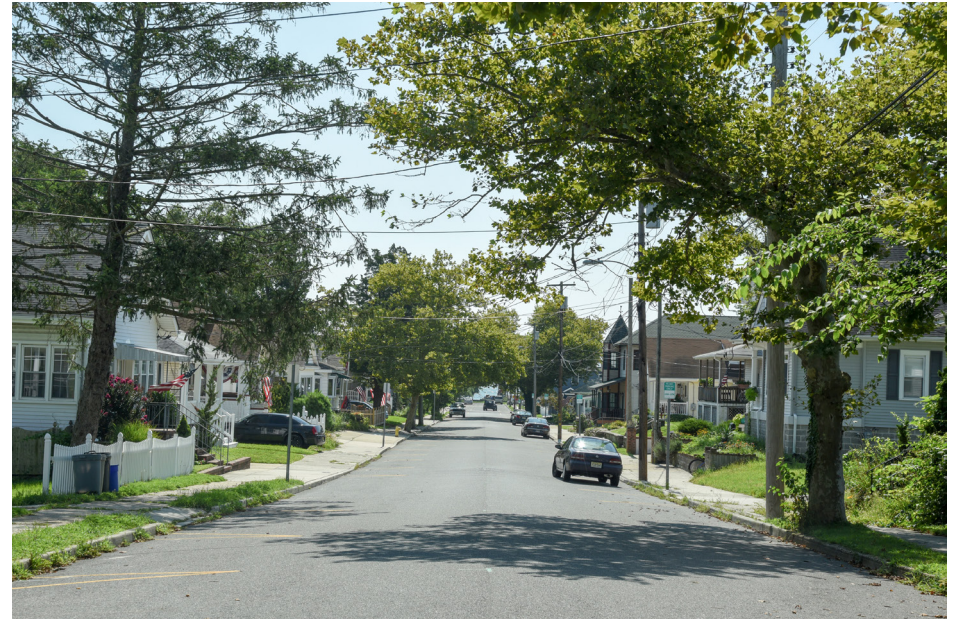
257 Somers Point - Bay Front Historic District, Higbee Avenue SW