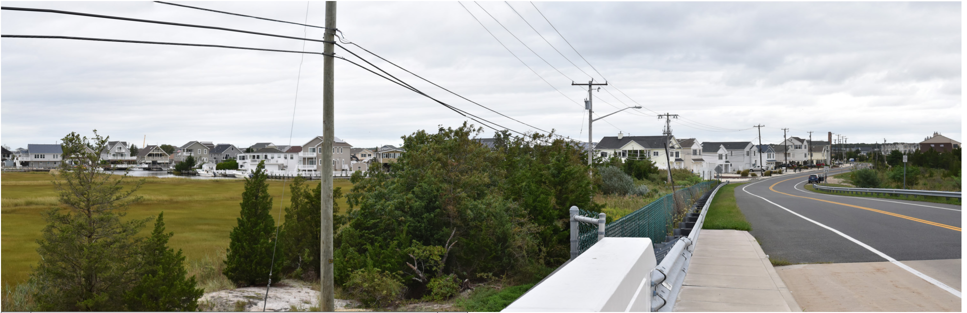
096 Little Egg Harbor Township - Radio Road Bridge, on Bridge N