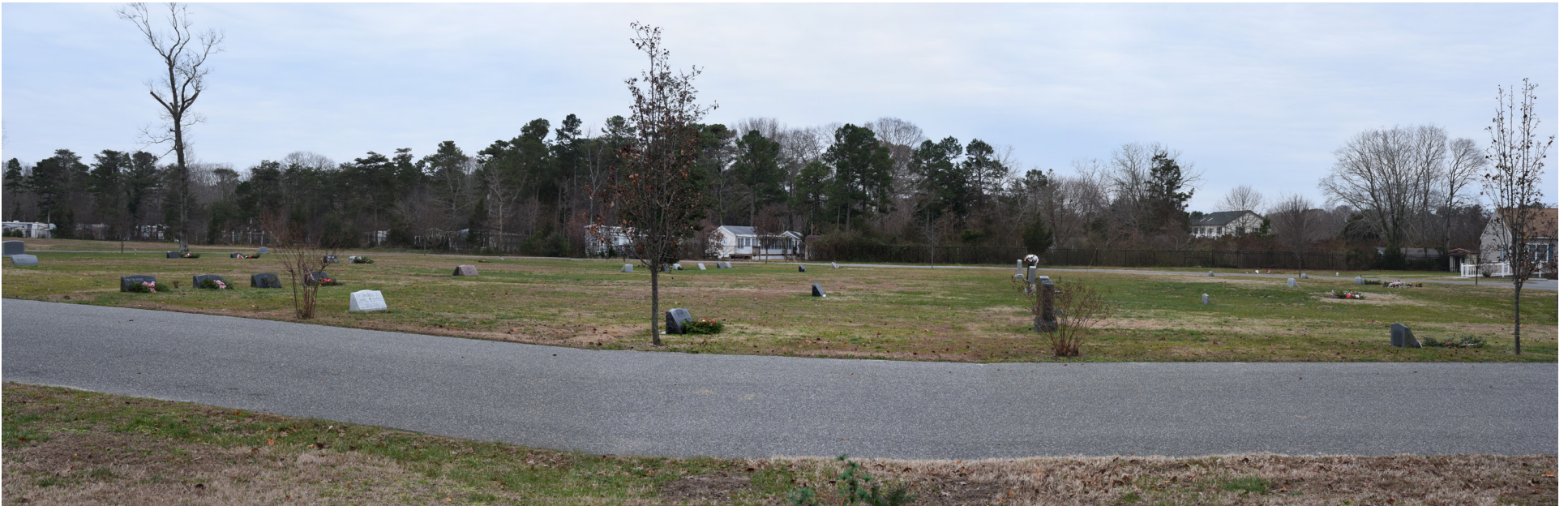
325 Dennis Township - Resurrection Cemetery, off of Kings Highway S