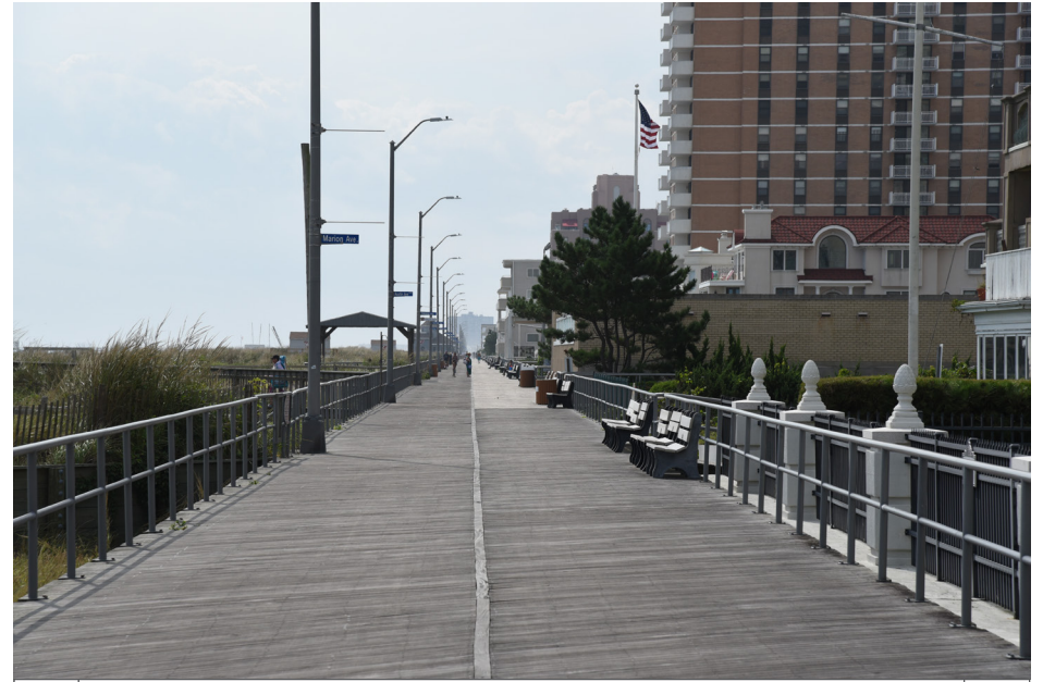
200 Ventnor City - Boardwalk, at South Baton Rouge Avenue SW