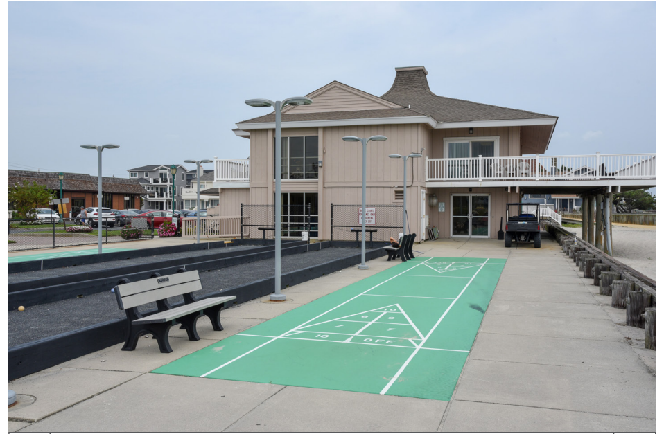
226 Margate City - Public Library, Senior Citizen Park NE