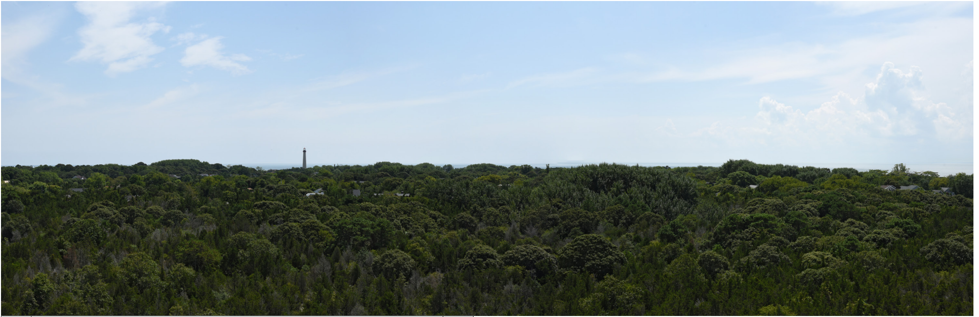
469 Lower Township - WWII Lookout Tower View, Historic Resource S