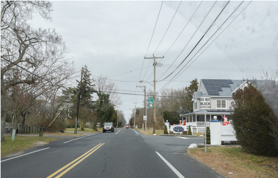
017 Ocean Township - Proposed Underground Cable Route to Oyster Creek, Main Street, Route 613 N