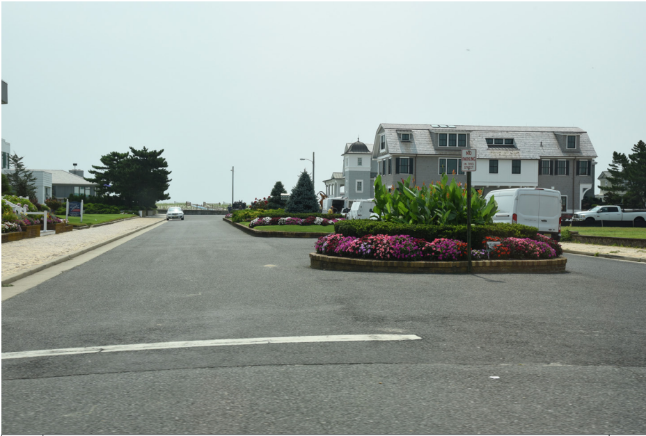
237 Longport - Atlantic Avenue at 22nd Avenue SE