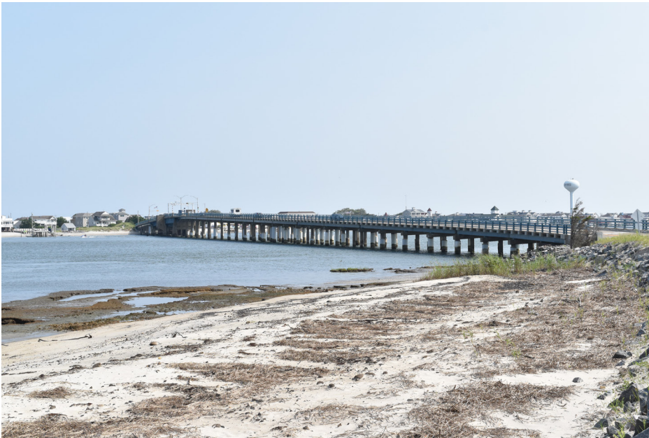
317 Upper Township - Bay Avenue N