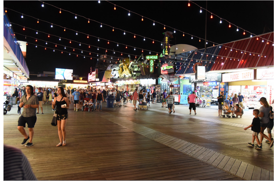
445 Wildwood - Boardwalk, at Oak Avenue W