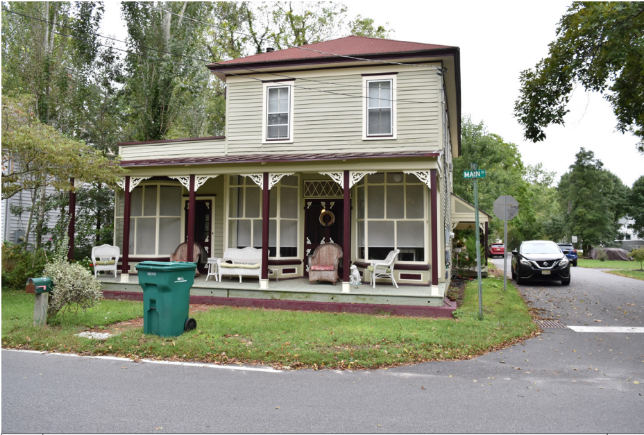
102 Port Republic - Port Republic Historic District, Amanda Blake Store N