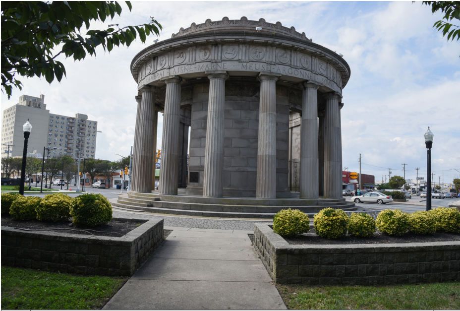
184 Atlantic City - World War I Memorial, Historic Resource, O'Donnell Park W