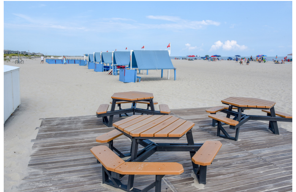
475 Cape May - Public Beach, Beach Avenue at Trenton Avenue W