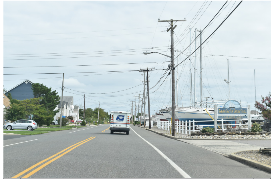
033 | Barnegat Township - East Bay Avenue, Mariner's Marina | NE