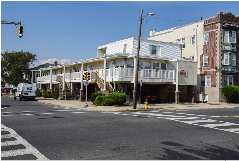
199 Ventnor City - Ventnor Avenue at Sacramento Avenue N