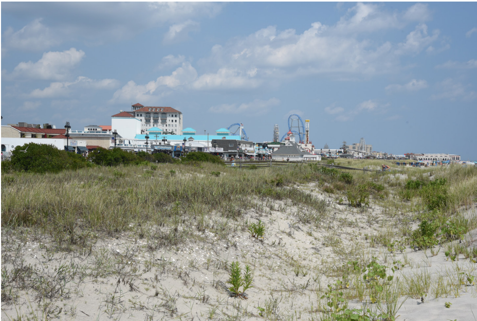
282 Ocean City - Public Beach Access, Dune, 13th-14th Street