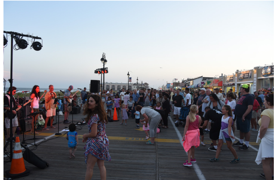
279 Ocean City - Ocean City Boardwalk, 7th Street