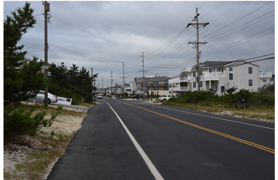
101 Long Beach Township (Holgate) - South Bay Avenue SW