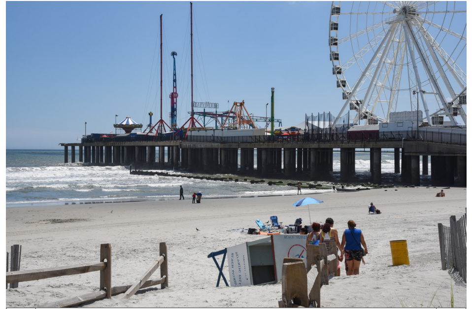
169 Atlantic City - Beach, Atlantic City Boardwalk, East of Steel Pier S