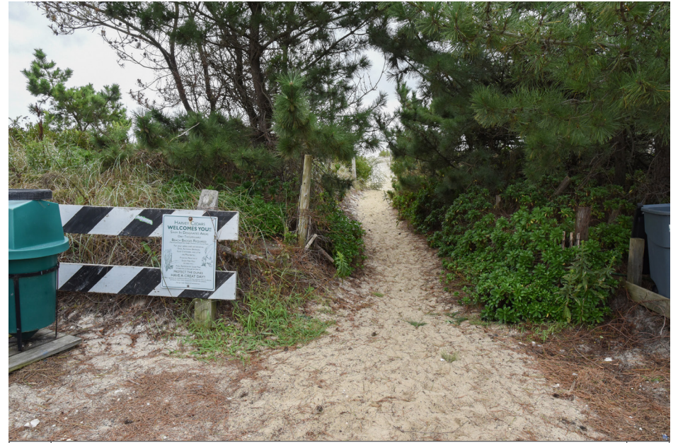
037 Harvey Cedars - East Cape May Street Beach Access SE