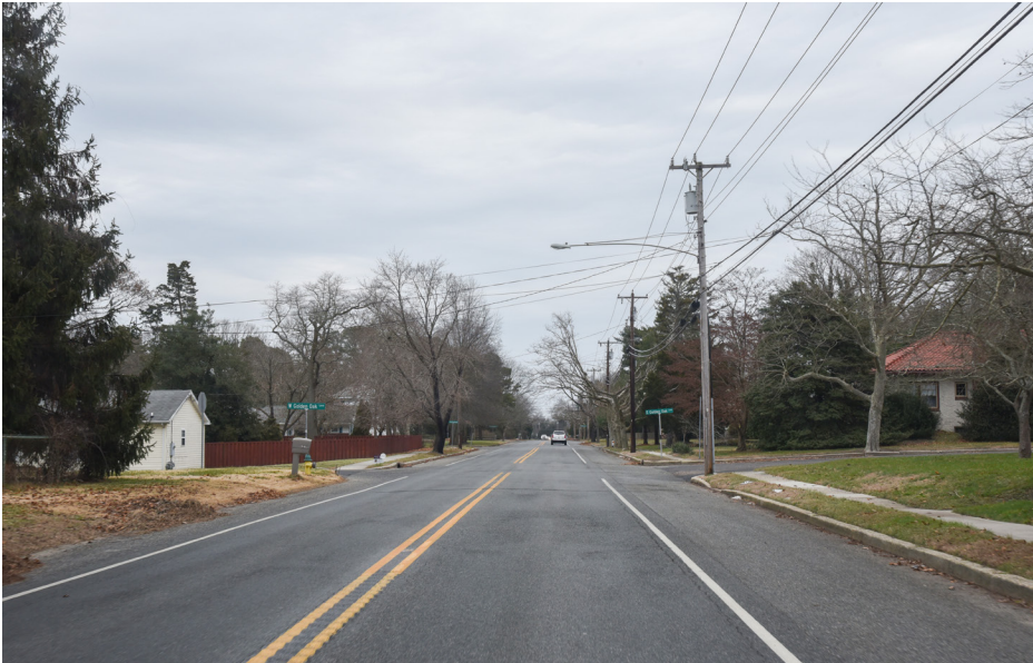
311 Upper Township - Proposed Underground Cable Route to BL England, North Shore Road NE