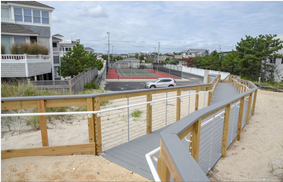
050 Long Beach Township (North Beach) - Public Beach Access, Long Beach Boulevard NW