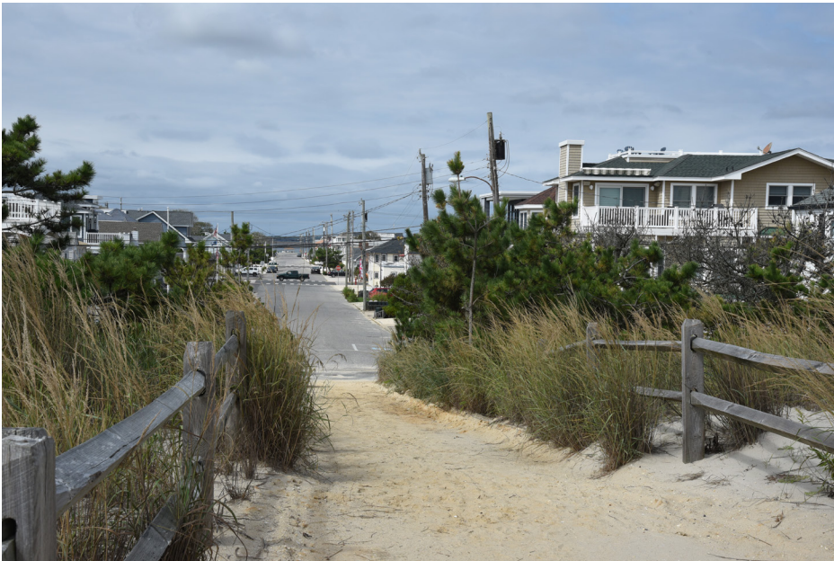
054 Surf City - Beach Access, 16th Street NW