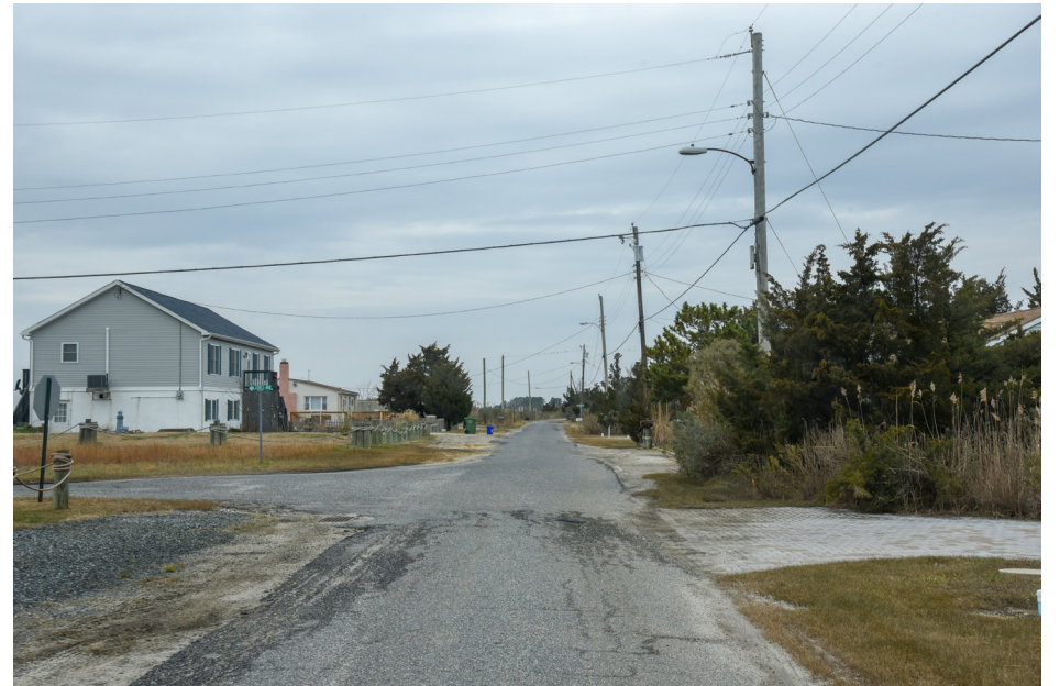
247 Egg Harbor Township - Morris Avenue Historic District NW