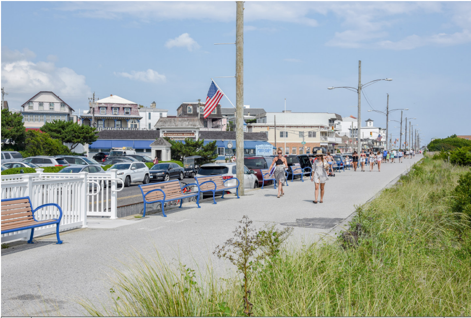
476 Cape May - Public Beach Access, Beach Avenue at Congress Street W