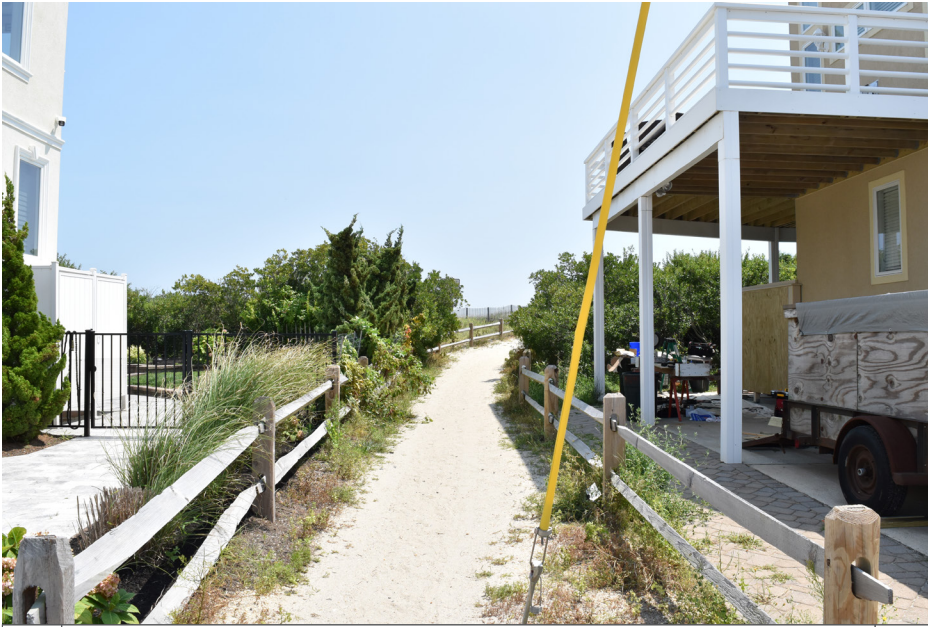
329 Sea Isle City - Public Beach Access, Pleasure Avenue at 62nd Street SE