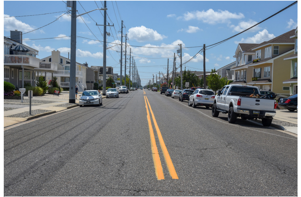
368 Avalon - Ocean Drive at 66th Street SW