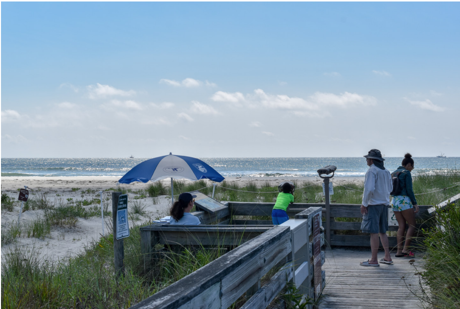
467 *Lower Township - Cape May National Wildlife Refuge SE