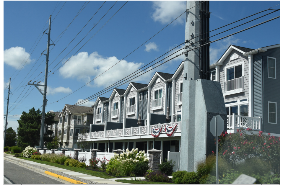
399 Middle Township - Stone Harbor Boulevard, Townhouses N