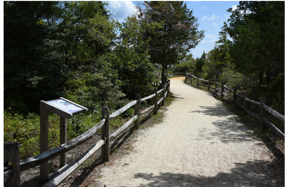
363 | Avalon - 48th Street Trail | SE