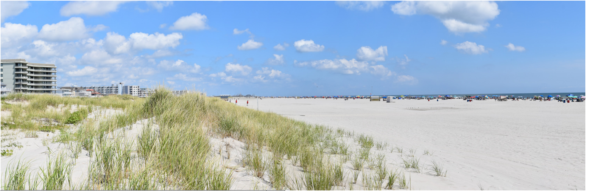
418 Wildwood Crest - Beach Access, Newark Avenue, Beachfront Resorts NE