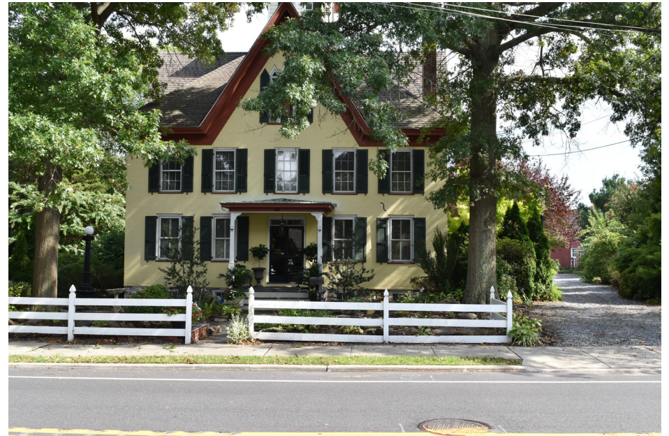
131 Absecon - Doughty House, North Shore Road, Historic Resource SE