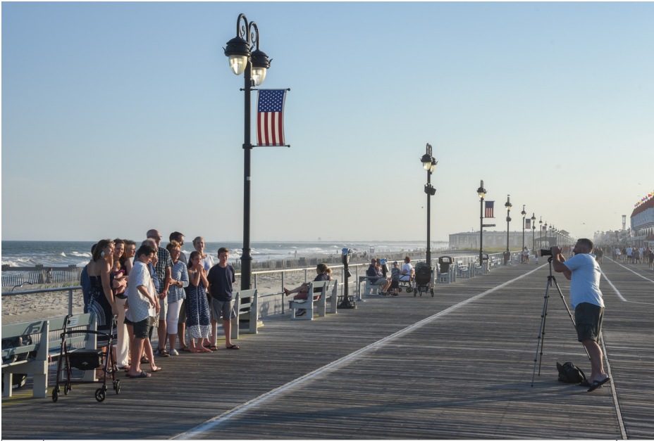
276 *Ocean City - Ocean City Boardwalk, 5th Street