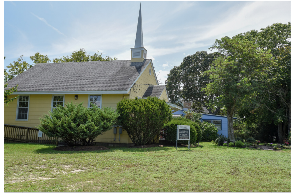
481 Cape May Point - Pavilion Circle, Sea Grove Historic District S