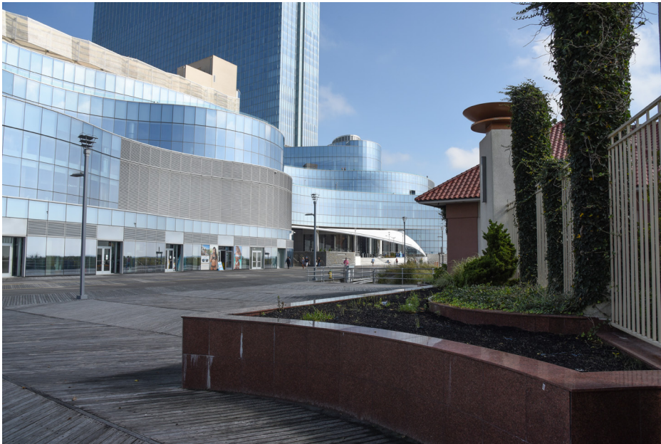
190 Atlantic City - Atlantic City Garden Pier, Historic Resource NE