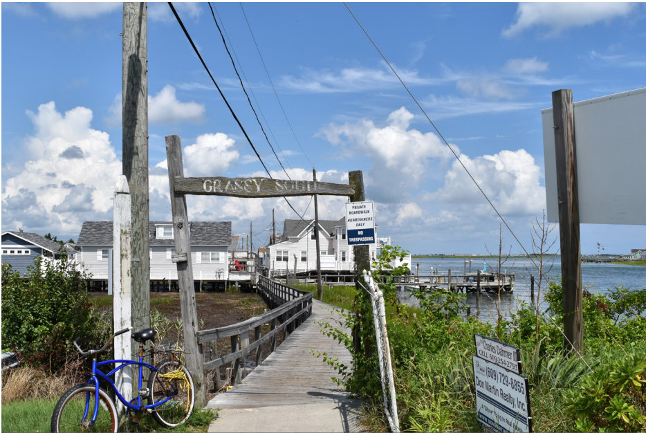
396 Middle Township - Grassy Sound Historic District NE