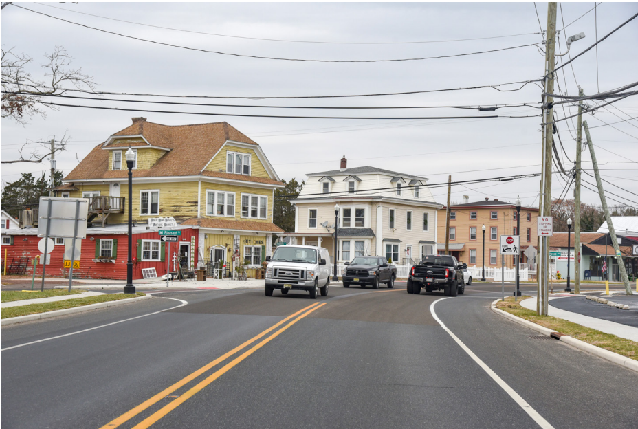
309 Upper Township - Tuckahoe Historic District, Route 50 N