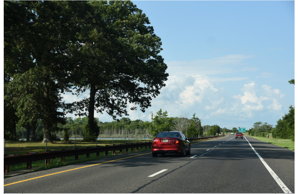
458 Lower Township - Garden State Parkway, Historic Resource N