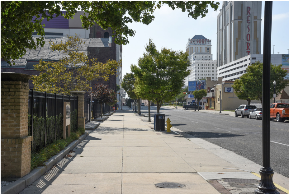
158 Atlantic City - Barclay Court, Historic Resource, Pennsylvania Avenue SW