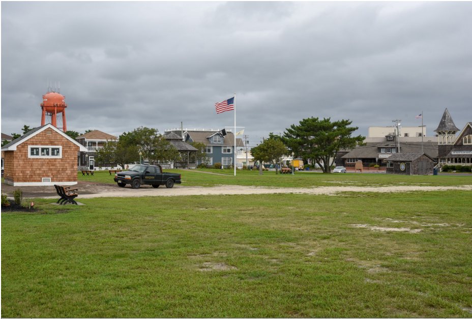
077 Beach Haven - Bicentennial Veterans Park, South Atlantic Avenue NW