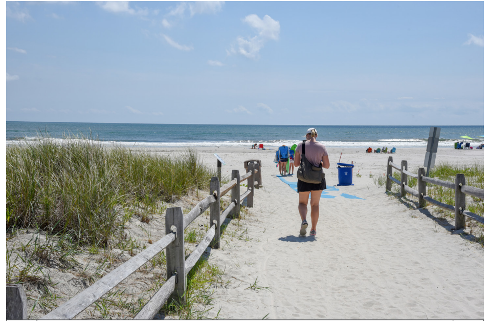
365 Avalon - 48th Street Trail, Dune, view toward ocean SE