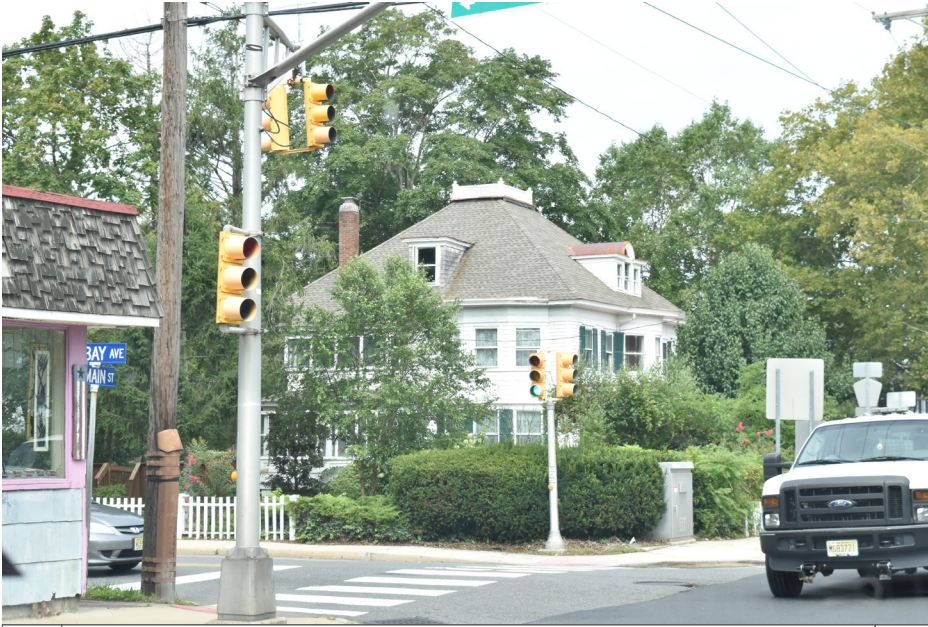
032 | Barnegat Township - Barnegat Historic District, Main Street at Bay Avenue | N