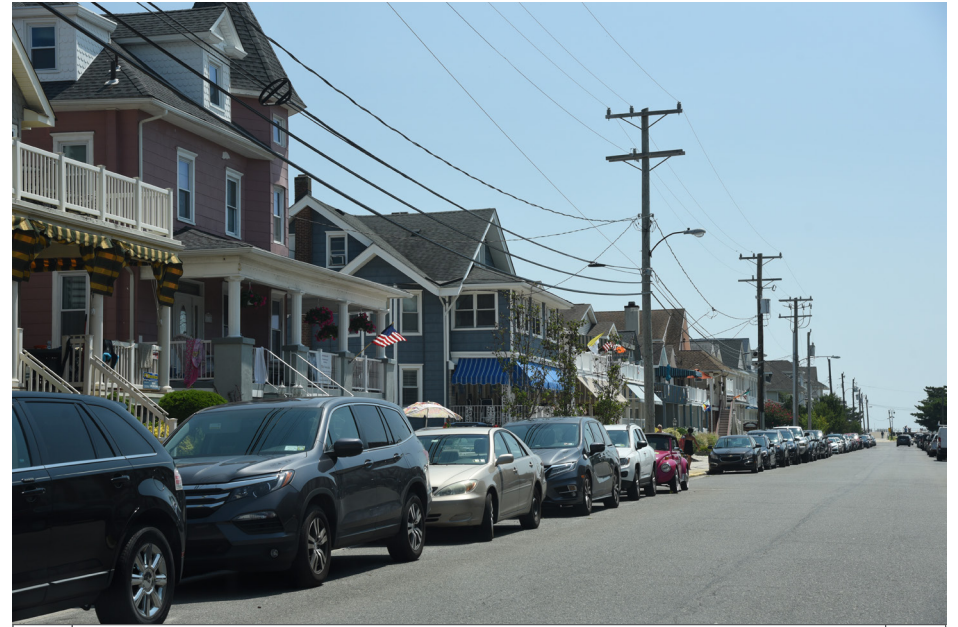
273 Ocean City - 5th Street, Historic Resource SE