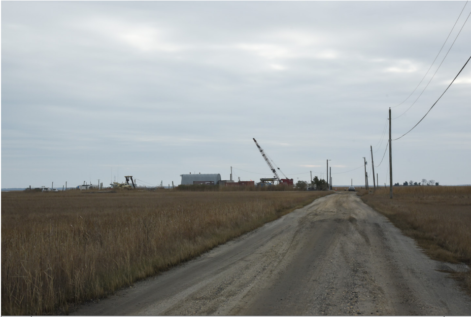
244 Egg Harbor Township - Great Egg River, Wharf Road S