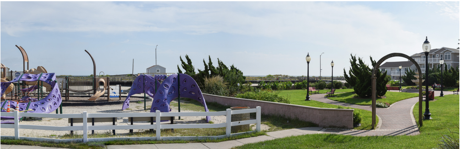
205 Ventnor City - New Haven Avenue Park S