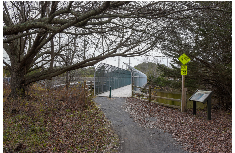
004 Lacey Township - Barnegat Trail Pedestrian Bridge over Forked River S