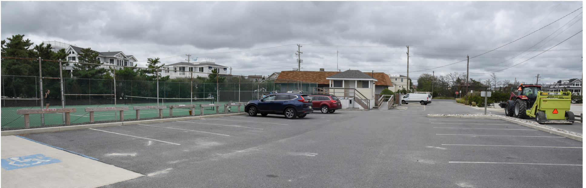
031 Long Beach Township (Loveladies) - Long Beach Boulevard Tennis Courts & Beach Access W