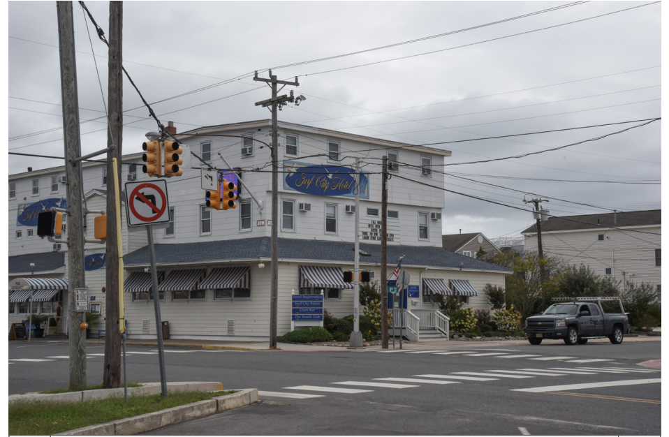
057 Surf City - Long Beach Boulevard at 8th Street E