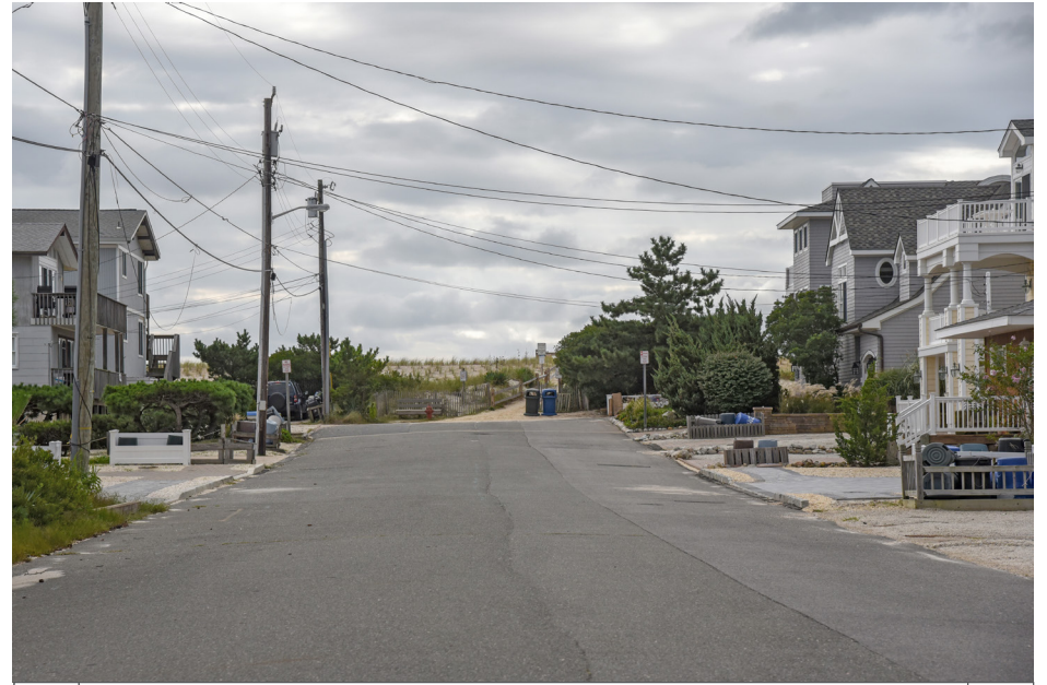
070 Beach Haven - Jefferies Avenue W