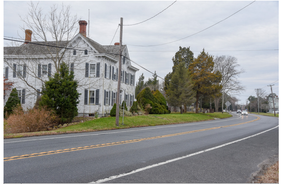
324 Dennis Township - Townsend Moore House, Route 47 W