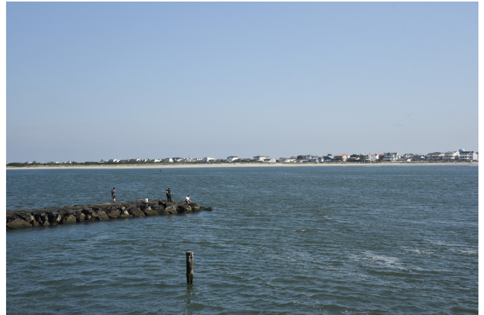
183 *Atlantic City - Maine Avenue Promenade, Overlook N