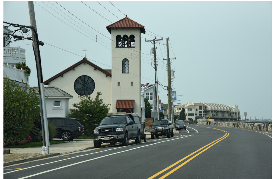
240 Longport - Atlantic Avenue, Church of the Redeemer, Historic Resource SW