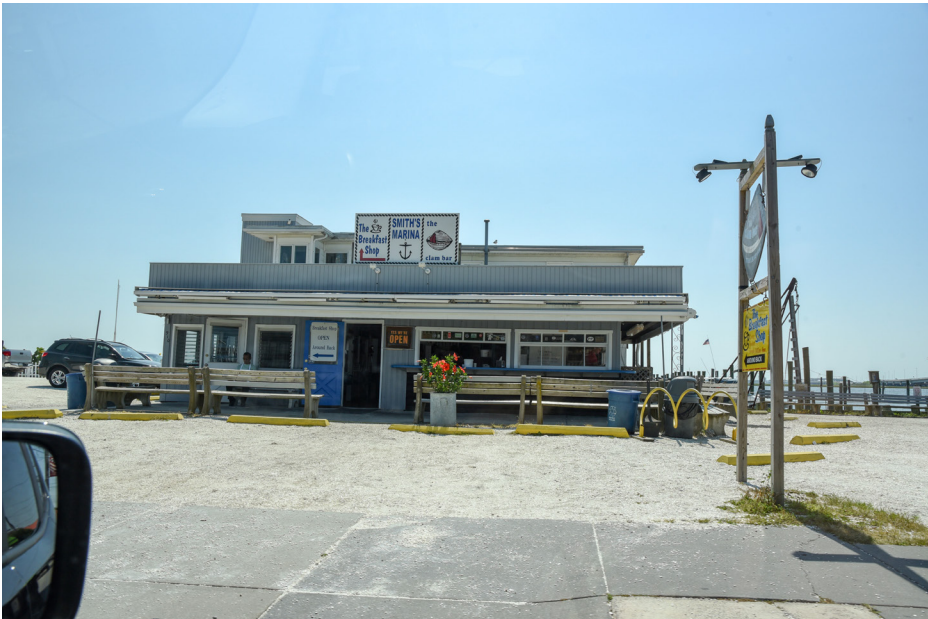
258 Somers Point - Bay Front Historic District, Smiths Marina, Breakfast Shop SE