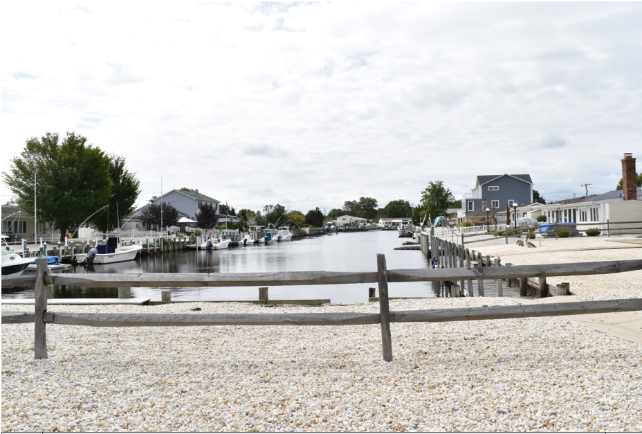
009 Ocean Township - Tuscarora Avenue SW