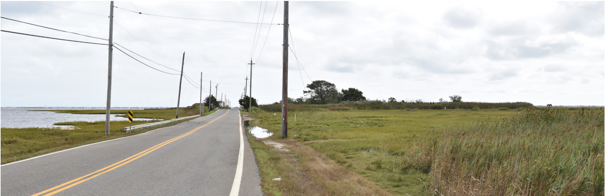
065 Eagleswood Township - Dock Road SW