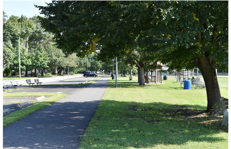
215 Linwood - All Wars Memorial Park, Linwood Historic District NE