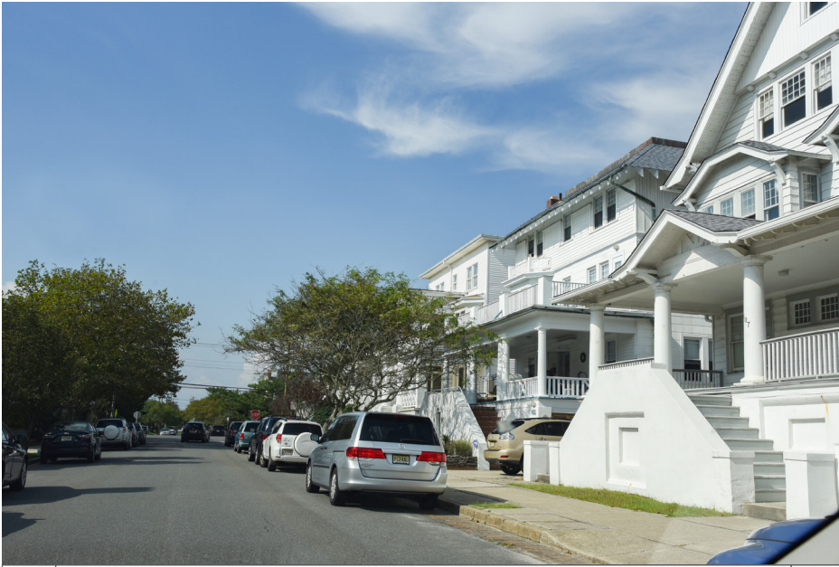
210 | Ventnor City - St. Leonard's Tract Historic District, Marston Place | W