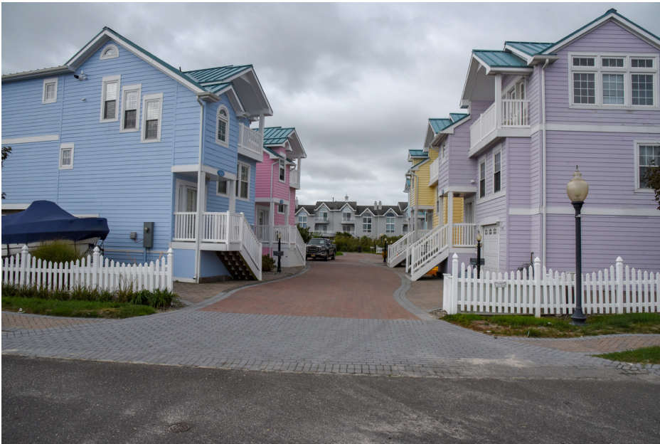
079 Beach Haven - Taylor Ave at Bay Club Lane West SW