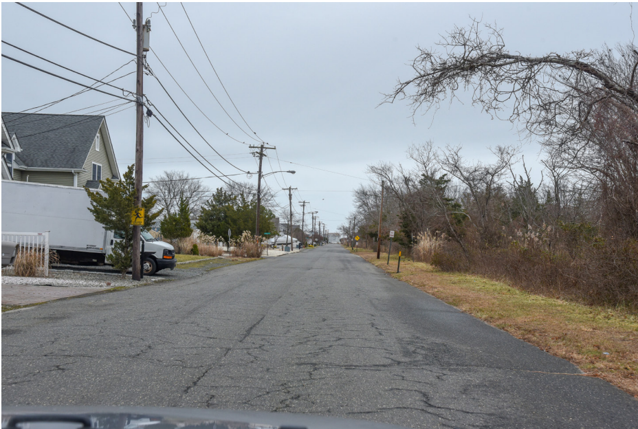
003 Lacey Township - Oyster Creek Route, Orlando Drive E