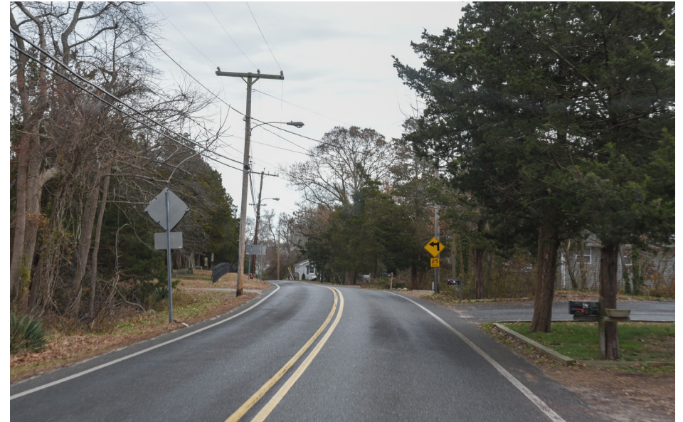
014 Ocean Township - Proposed Underground Cable Route to Oyster Creek, Bryant Road S