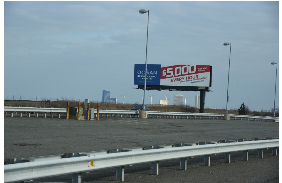
143 Pleasantville - Atlantic City Expressway E