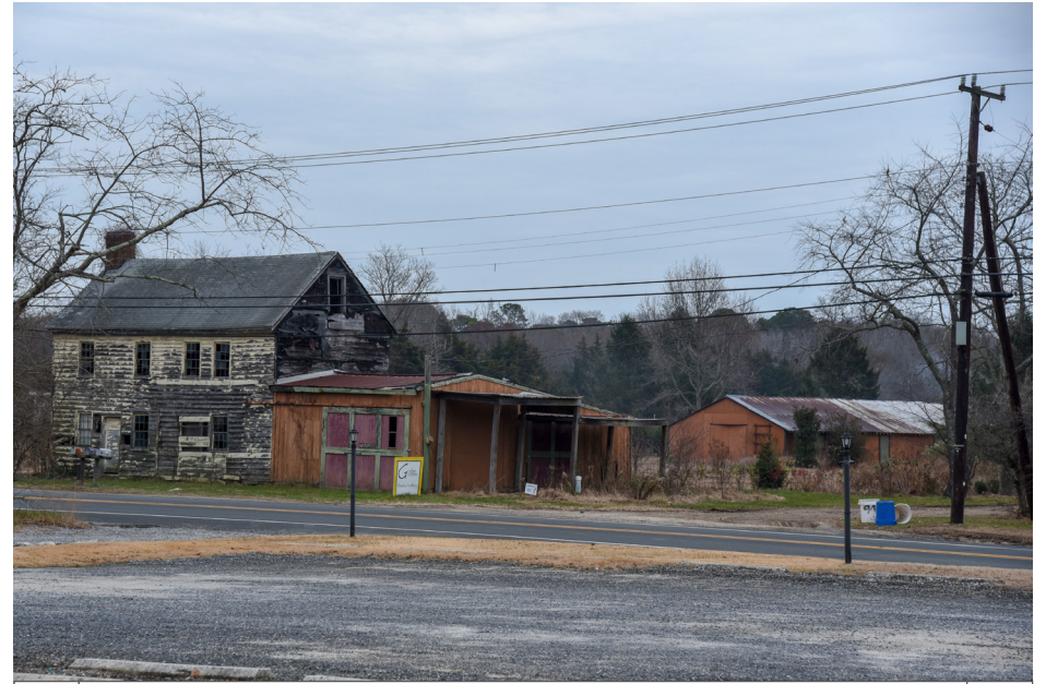
384 Middle Township - Goshen Historic District, North Delsea Drive E