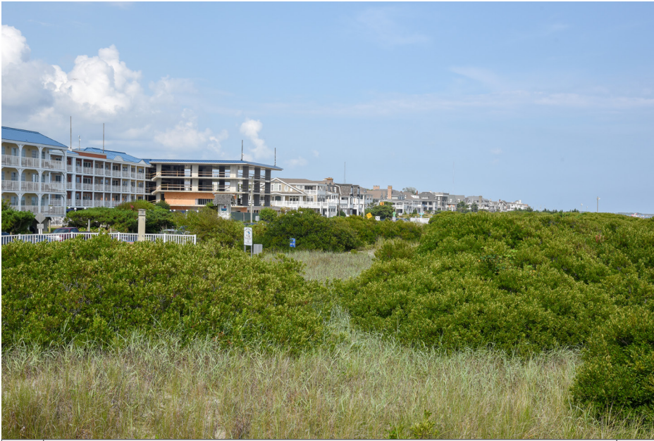
472 Cape May - Public Beach Access, Beach Avenue at Trenton Avenue NE