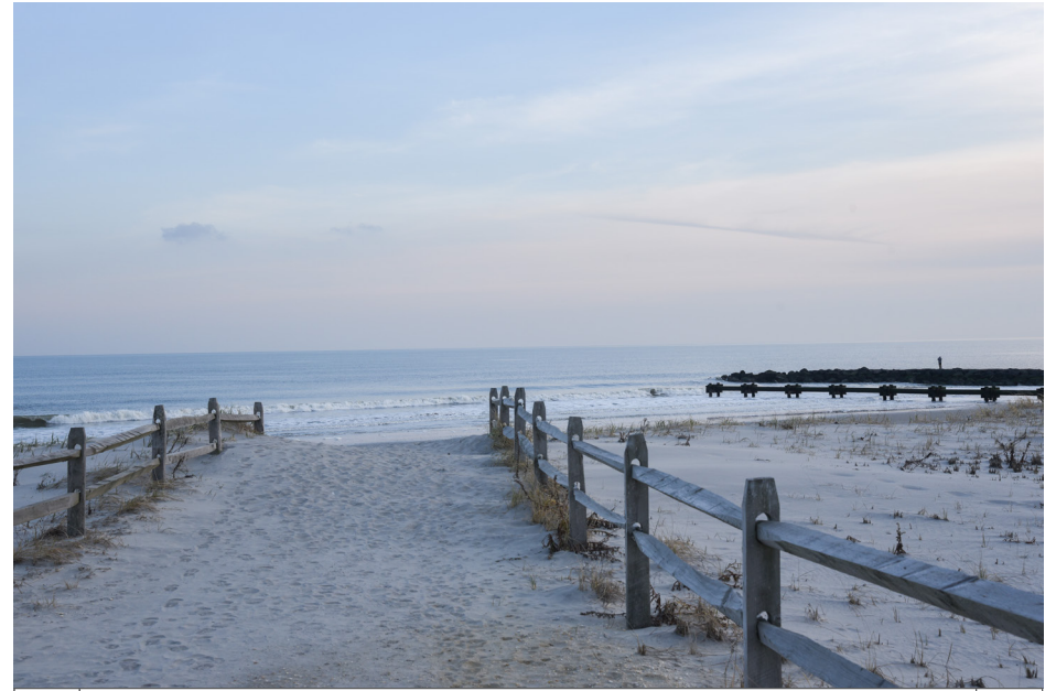
265 Ocean City - Beach Access, 4th Street S