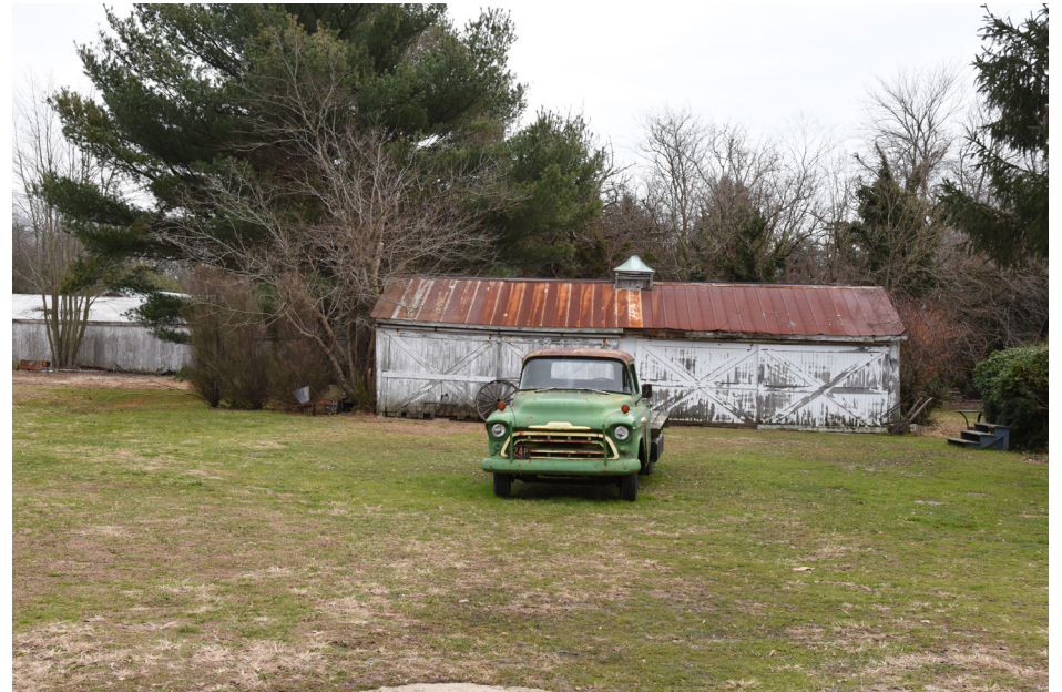
310 Upper Township - Van Gilder Tenant House, Historic Resource E