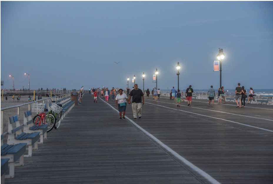
278 Ocean City - Ocean City Boardwalk, 6th Street