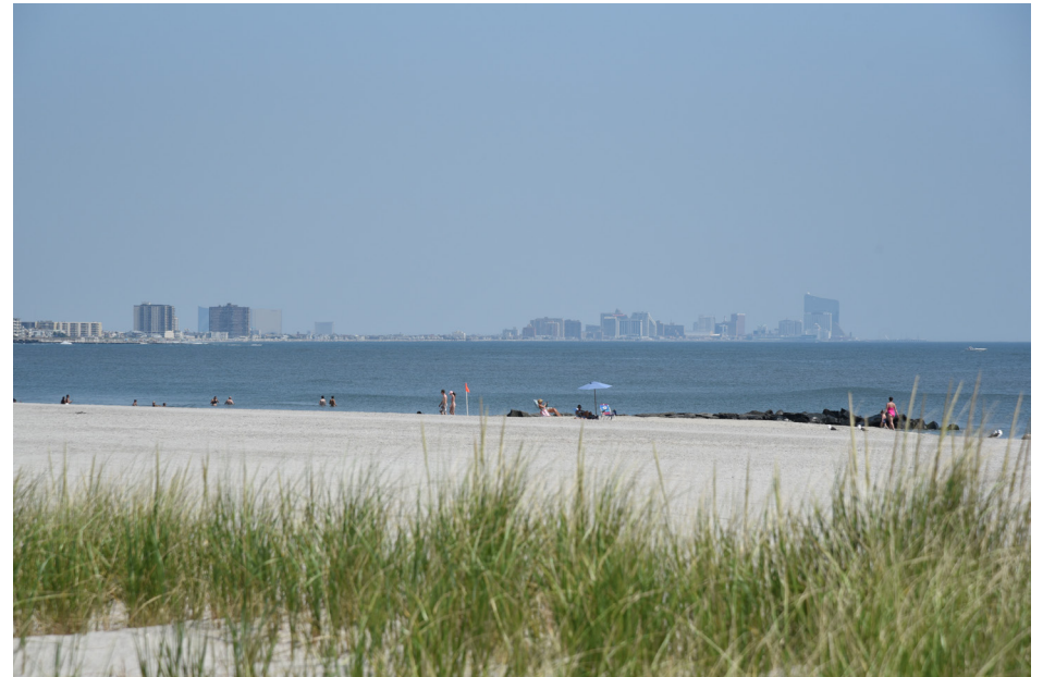
295 Ocean City - Public Beach Access, Atlantic Boulevard NE