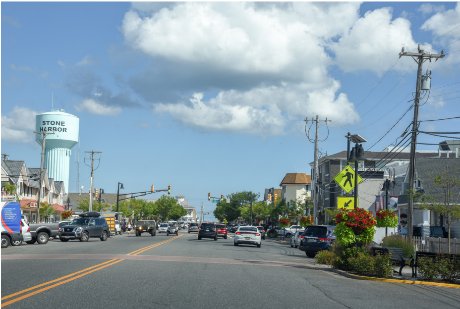
408 Stone Harbor - Stone Harbor Historic District SW