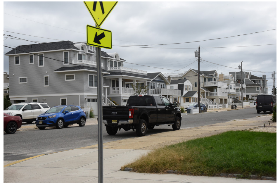
063 Ship Bottom - Long Beach Boulevard at 22nd Street E