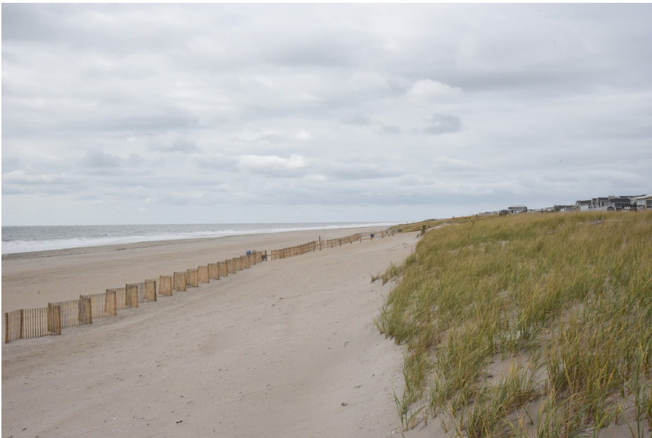
038 *Harvey Cedars - Beach Access, East Cape May Avenue SW