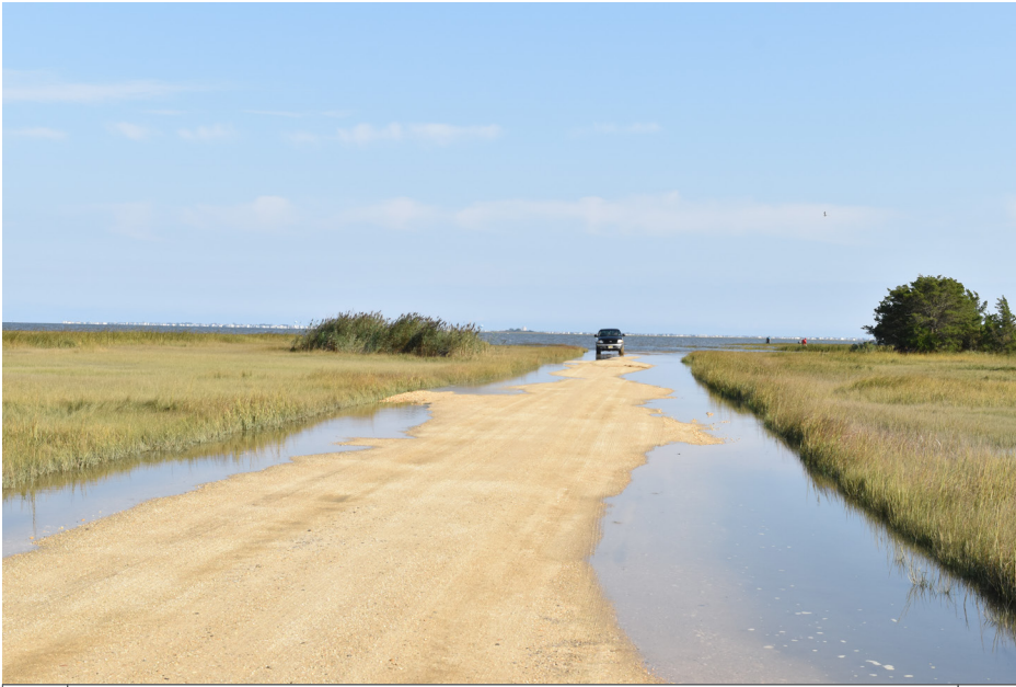
113 Galloway Township - End of East Ocean Avenue toward Absecon WMA SE