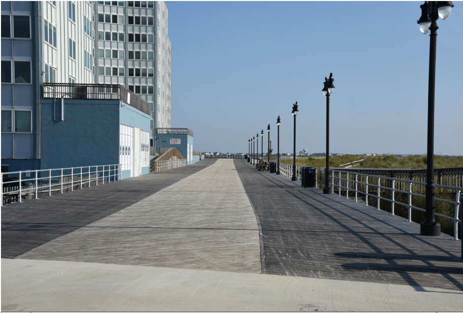
164 Atlantic City - Atlantic City Boardwalk at New Hampshire Street N