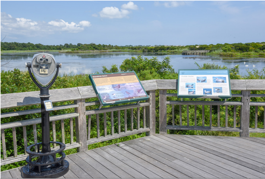
461 Lower Township - Cape May Point State Park NW