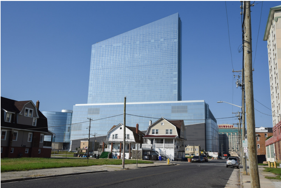
146 Atlantic City - Vermont Avenue, Historic Resource, Ocean Resort Casino SW