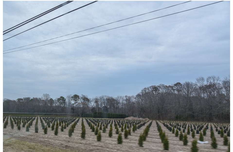
386 Middle Township - Nursery on North Delsea Drive E