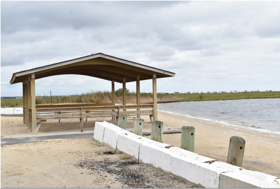
088 Little Egg Harbor Township - Parkerstown Dock, End of Dock Street NE