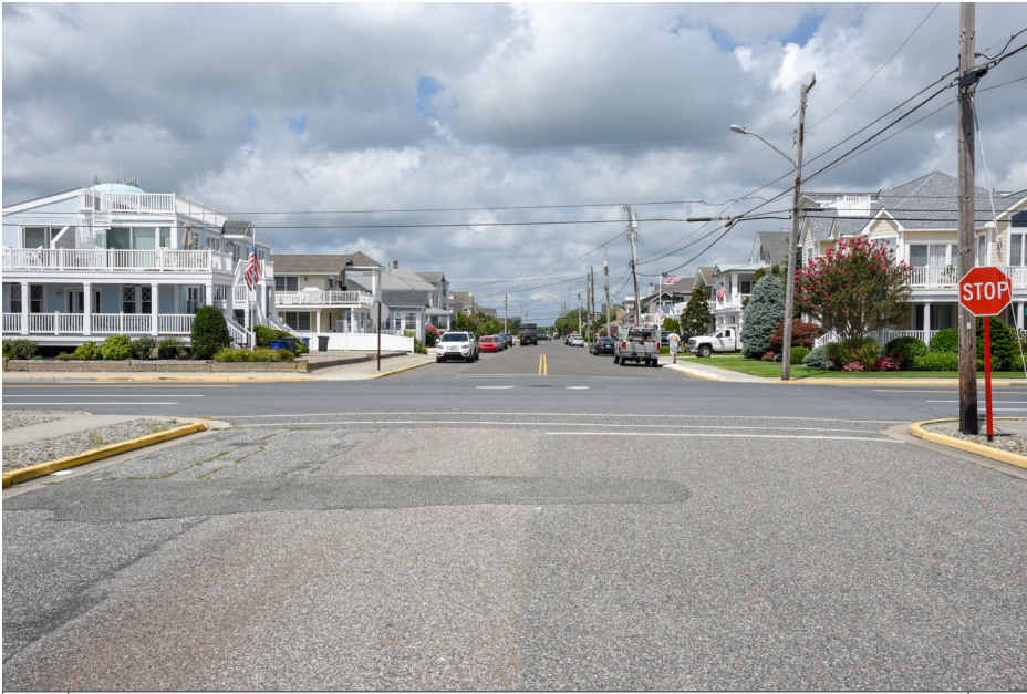
360 | Avalon - 37th Street at First Avenue, toward bay | NW