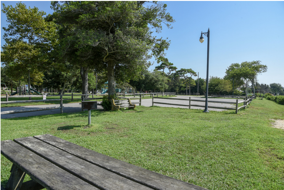
254 Somers Point - John F. Kennedy Park NE