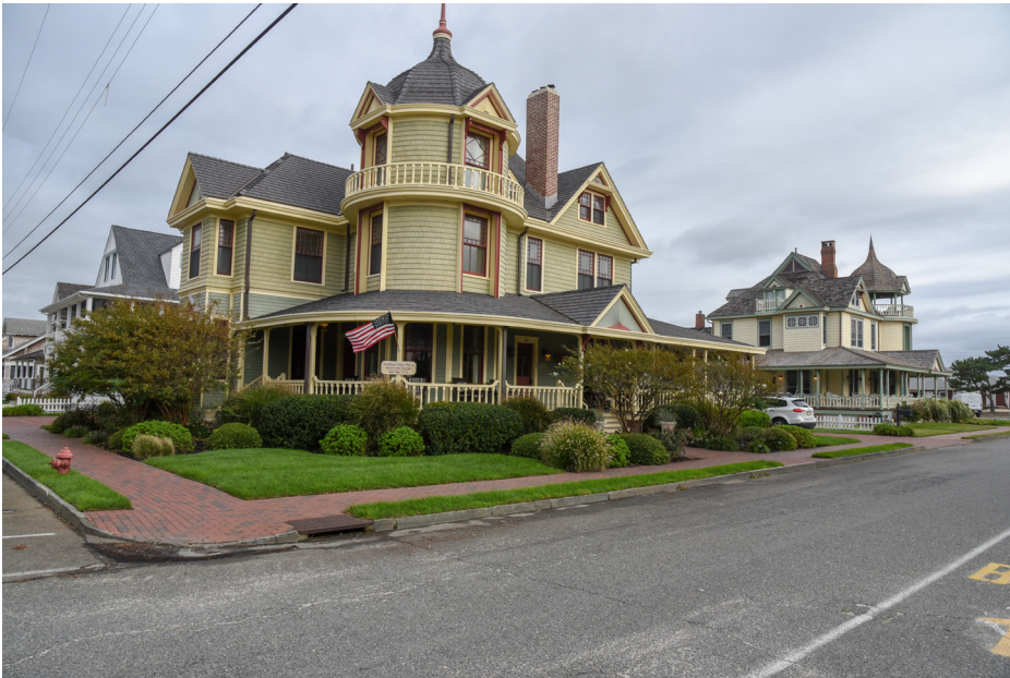
075 Beach Haven - Dr. Edward H. Williams House, Beach Haven Historic Dist. NW