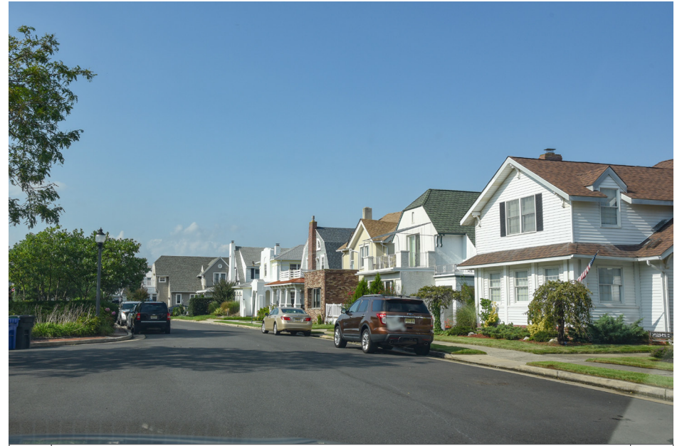
230 Margate City - Marvin Gardens, Historic Resource N