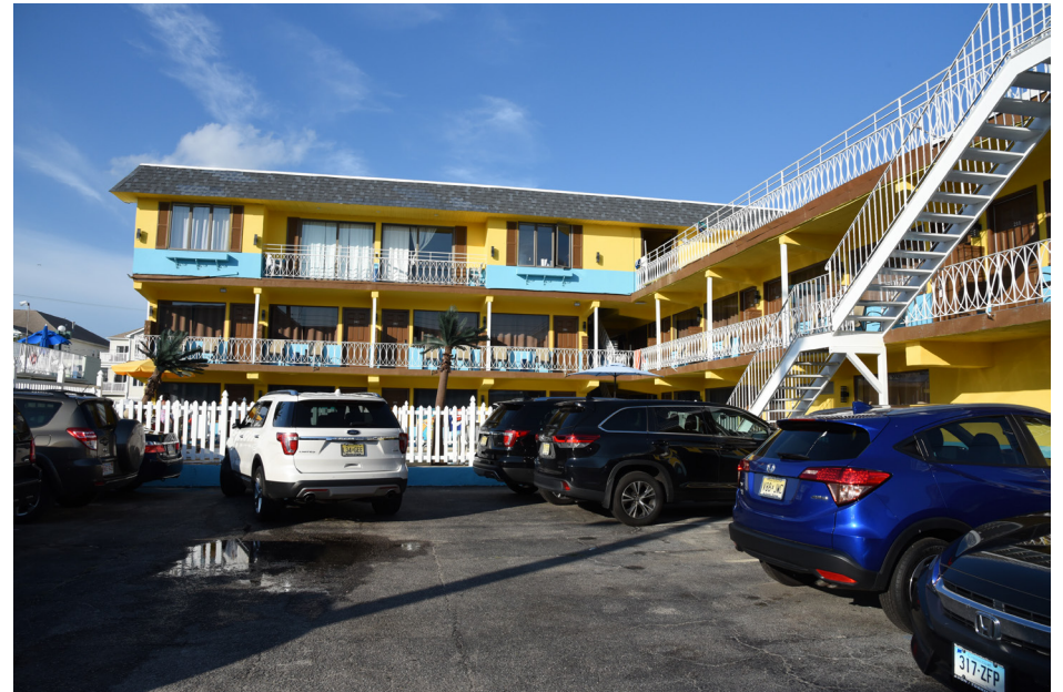
443 Wildwood - Paradise Inn, Wildwood Avenue NE