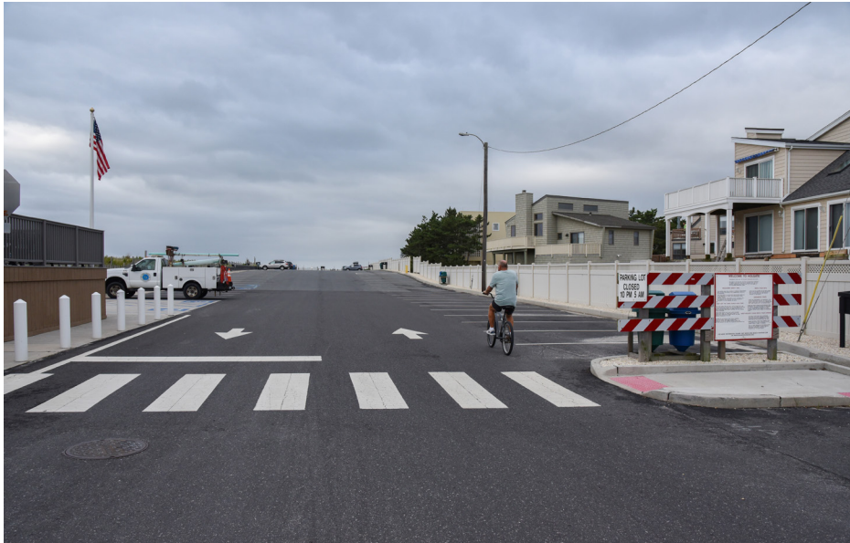
098 Long Beach Township (Holgate) - Edwin B. Forsythe - Holgate Unit Conservation SW