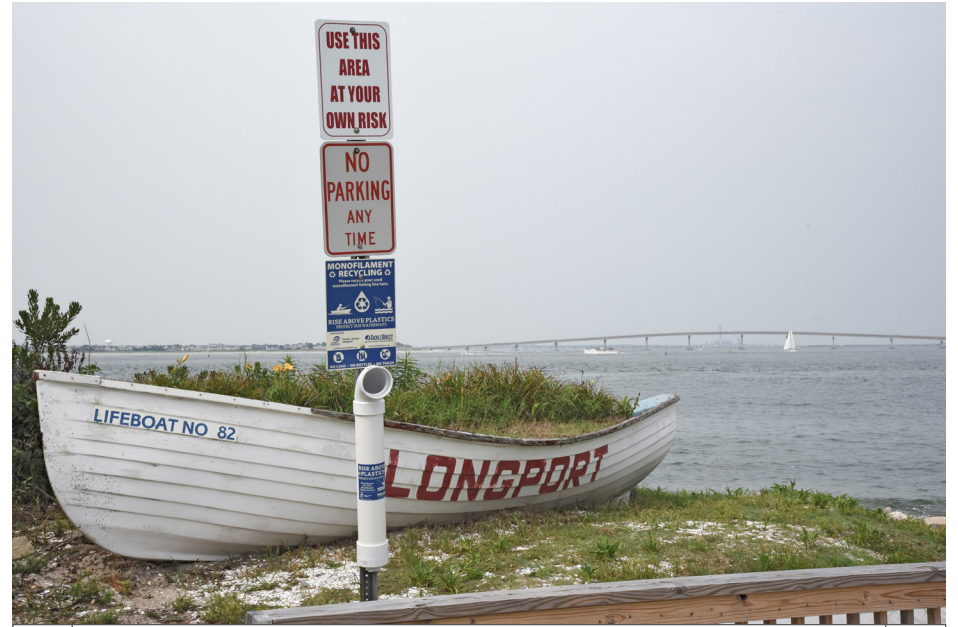
238 Longport - Jetty at the End of Atlantic Avenue W