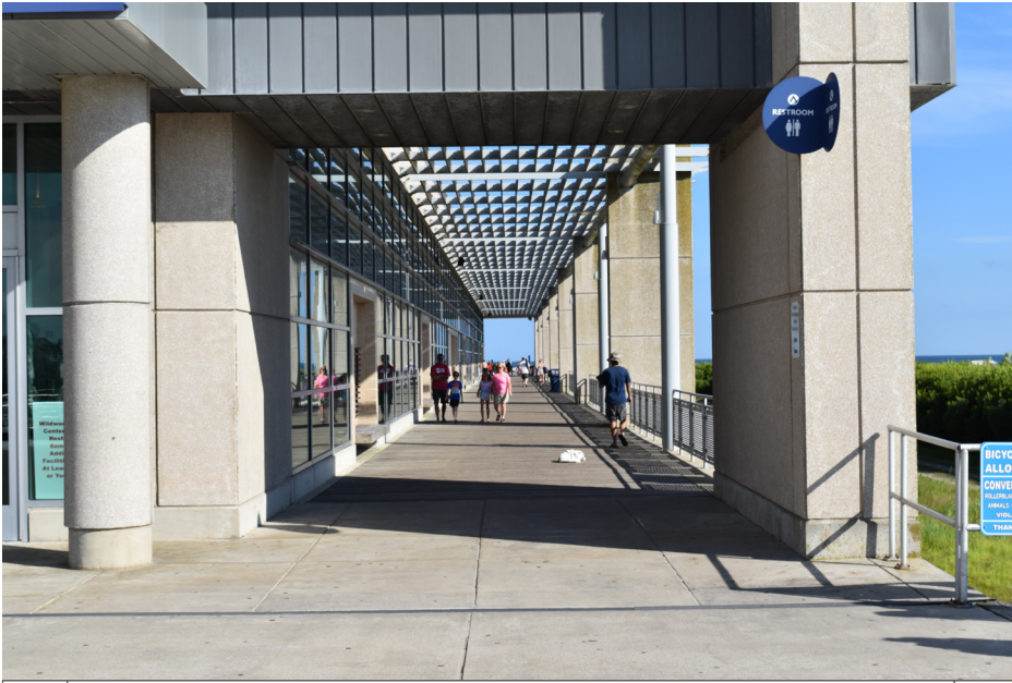
432 Wildwood - Convention Center Beach Access, Ocean Avenue SE