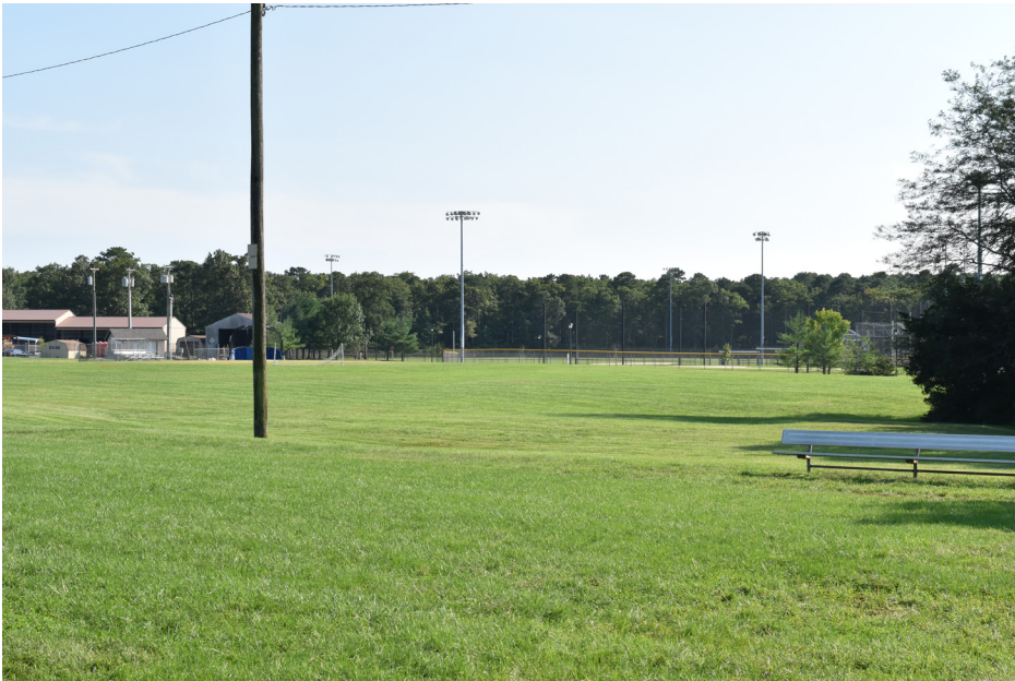
130 Absecon - Pitney Park S