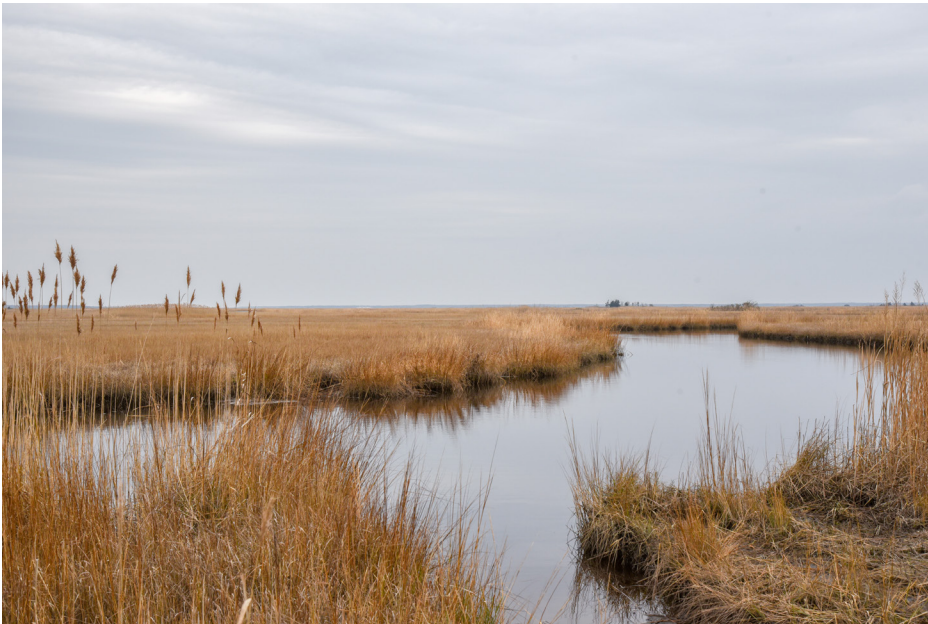
313 Upper Township - Tuckahoe River North, Tuckahoe Road N