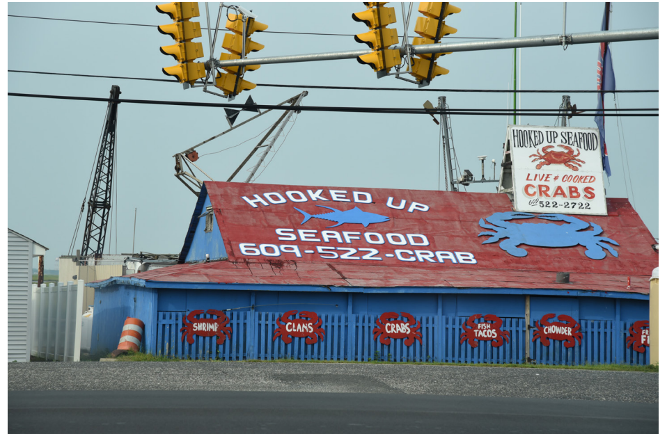
394 Middle Township - Route 47 SW