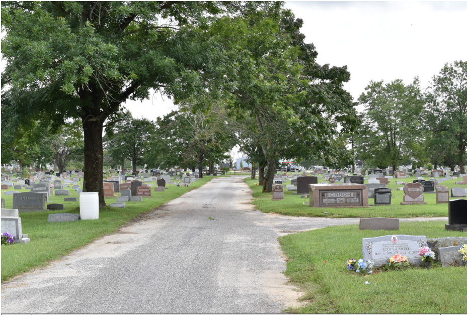
134 Pleasantville - Atlantic City / Greenwood Cemetery E