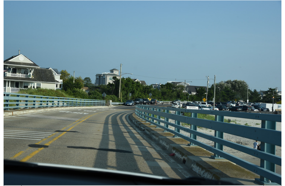
316 Upper Township - Corson's Inlet Bridge, toward Deauville Inn, Bay Avenue S