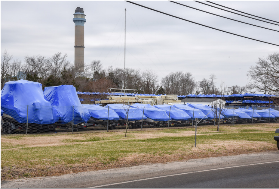
300 Upper Township - BL England, North Shore Road NW