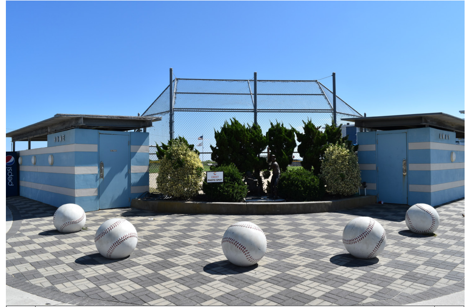
422 Wildwood Crest - Greater Wildwood Little League Field, Aster Road S