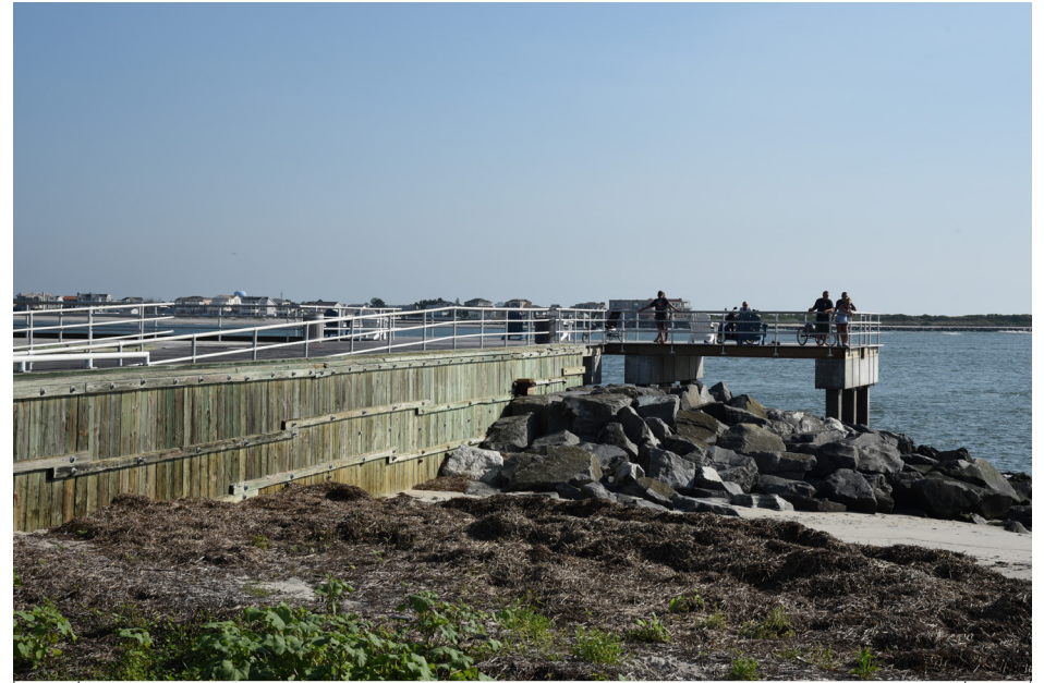
185 *Atlantic City - Oscar E. McClinton Waterfront Park, Maine Ave Promenade X