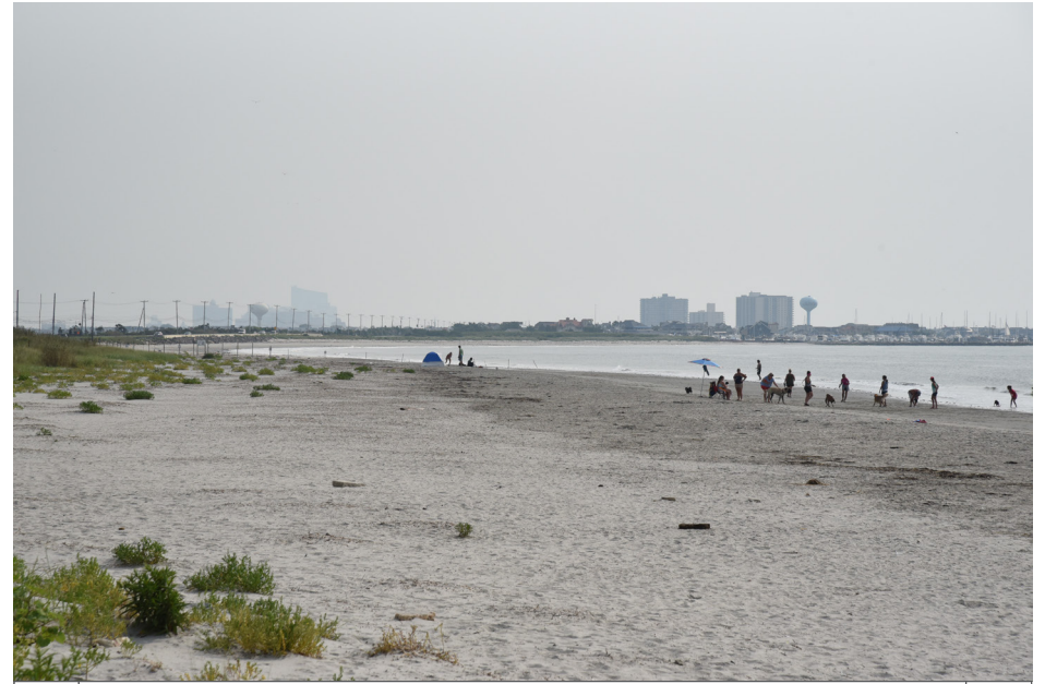
249 Egg Harbor Township - Longport Dog Park, Malibu Beach WMA E