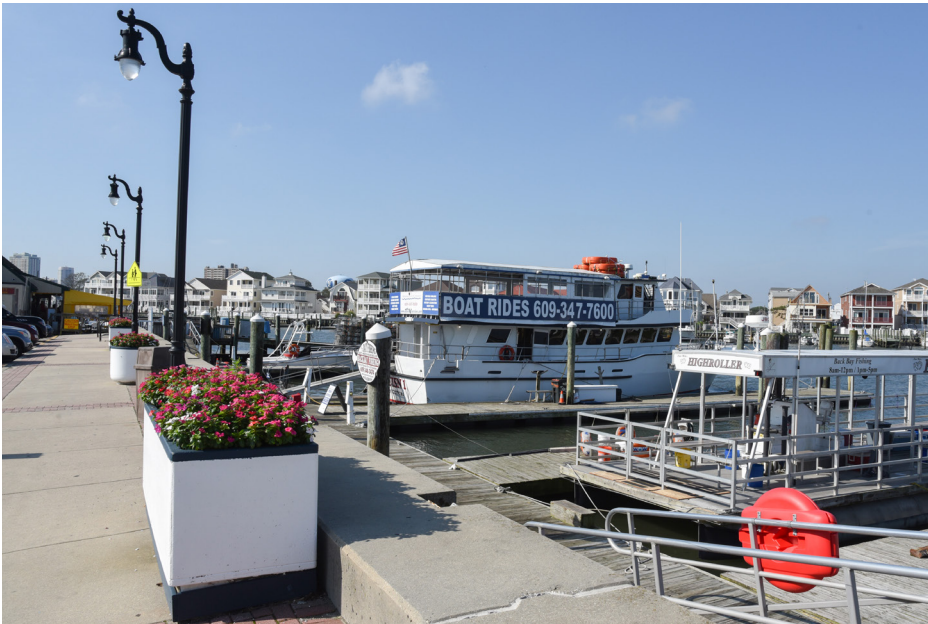
178 Atlantic City - Historic Gardeners Basin SW