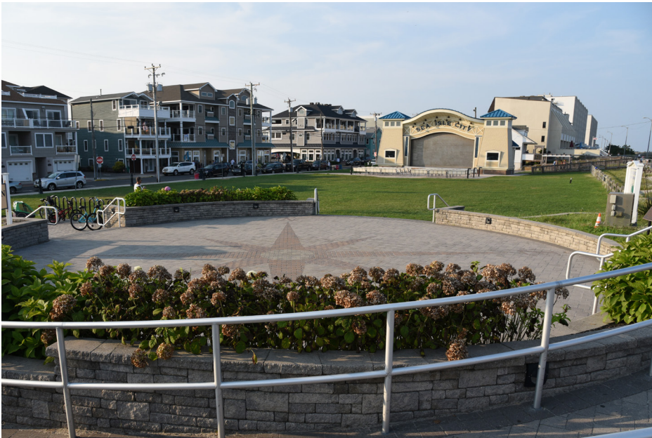
342 *Sea Isle City - Excursion Park, End of John F. Kennedy Boulevard N