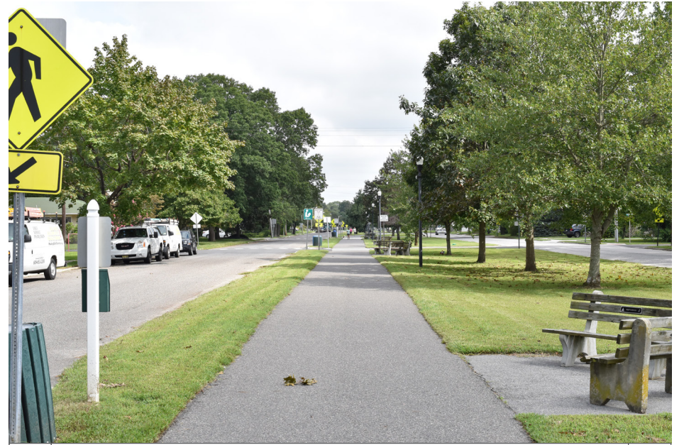
219 Linwood - Linwood Bike Path, Wabash Avenue NE