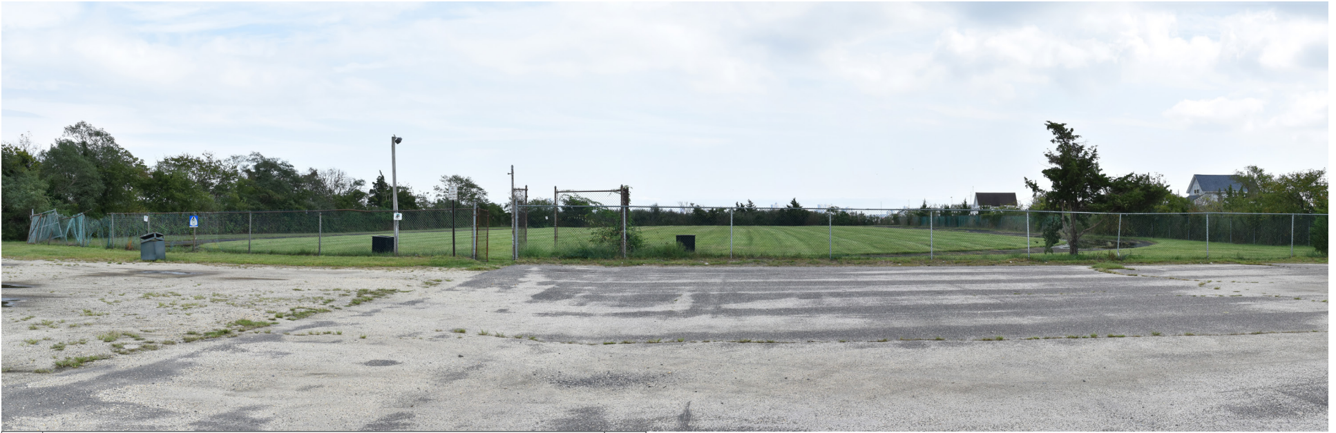
141 Pleasantville - Hampden Court Track E