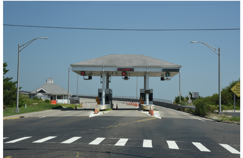
271 Ocean City - Ocean City - Longport Bridge, Historic Resource, Toll N