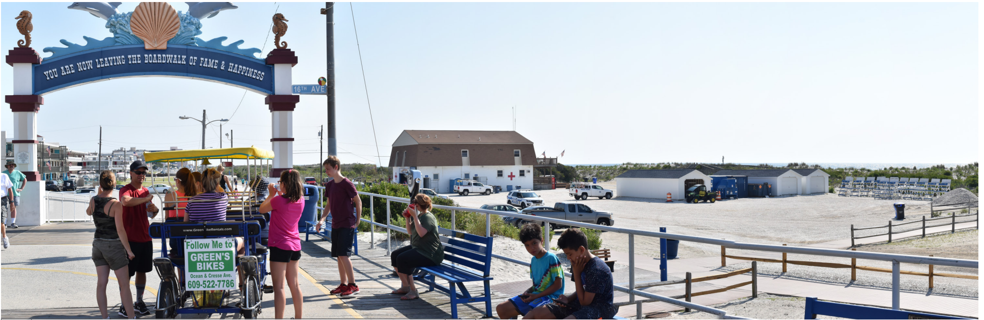
448 North Wildwood - North End of Boardwalk, 16th Avenue