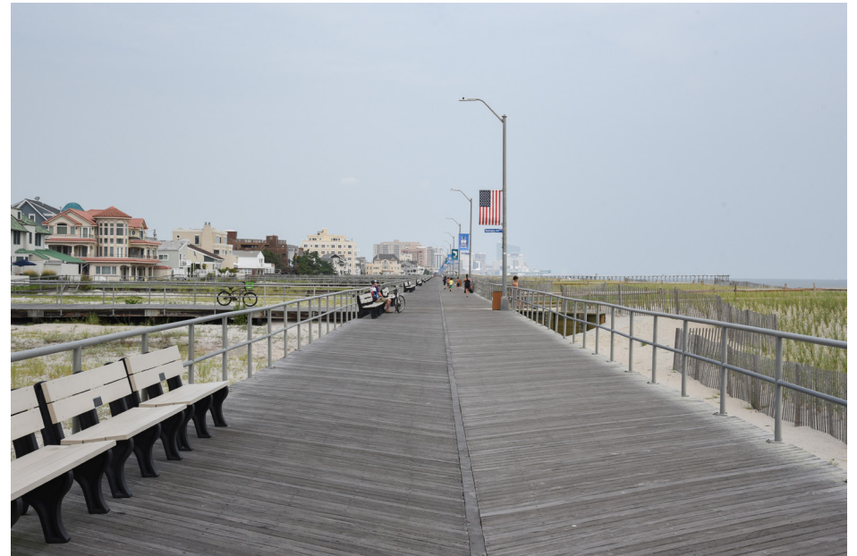
209 Ventnor City - Boardwalk (West End), at South Martindale Avenue NE