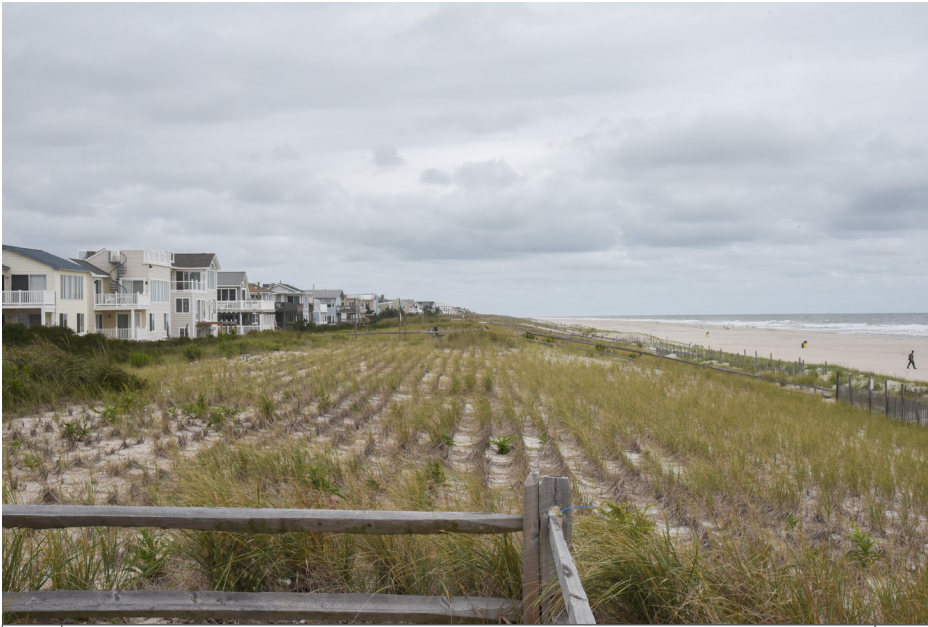
060 Ship Bottom - Beach Access, 8th Street N