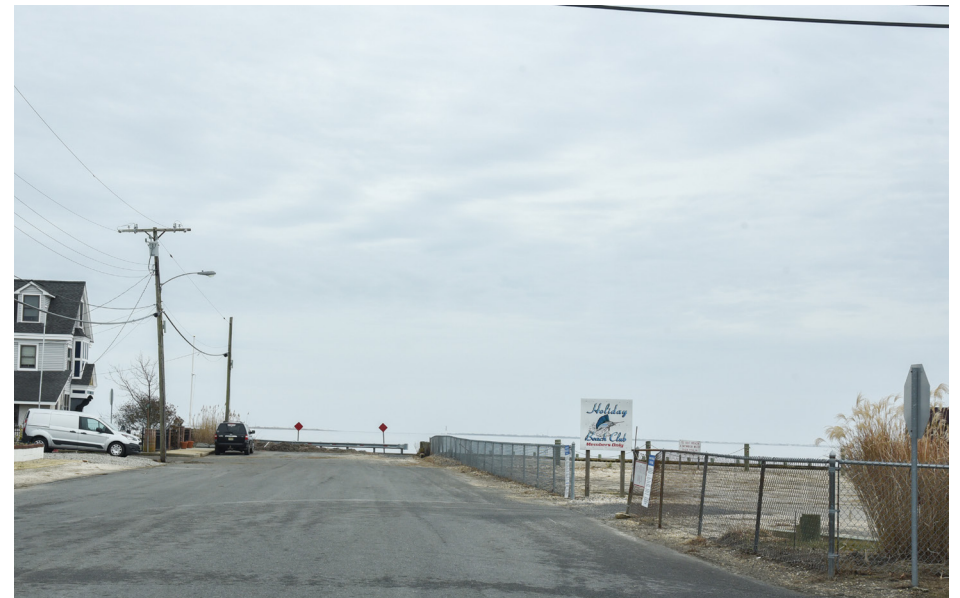
016 Ocean Township - Proposed Underground Cable Route to Oyster Creek, Lighthouse Drive, End of Road SE