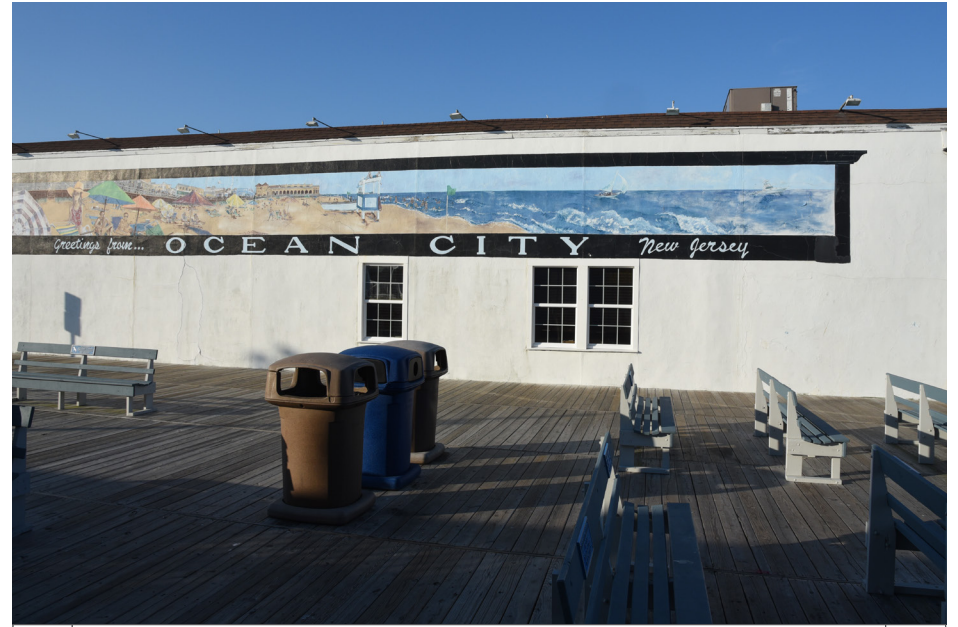
281 Ocean City - Ocean City Boardwalk Access, Plymouth Place