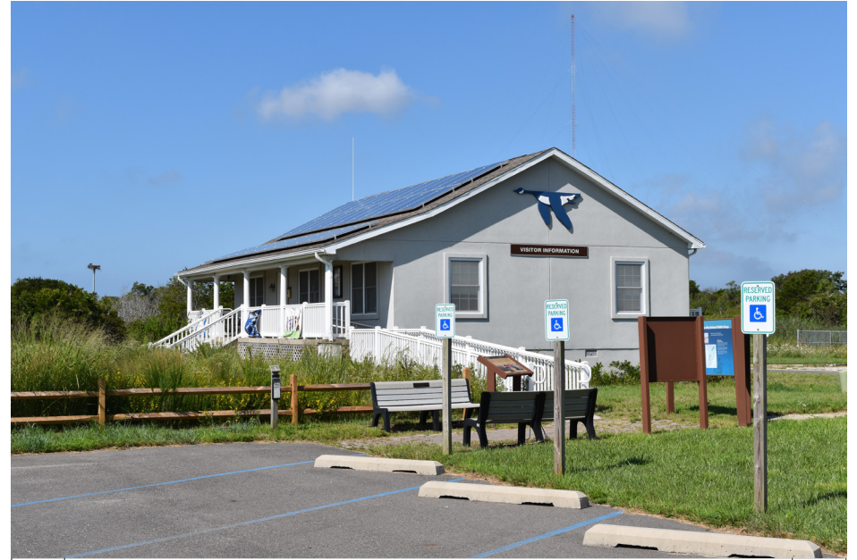
466 *Lower Township - Cape May National Wildlife Refuge NW