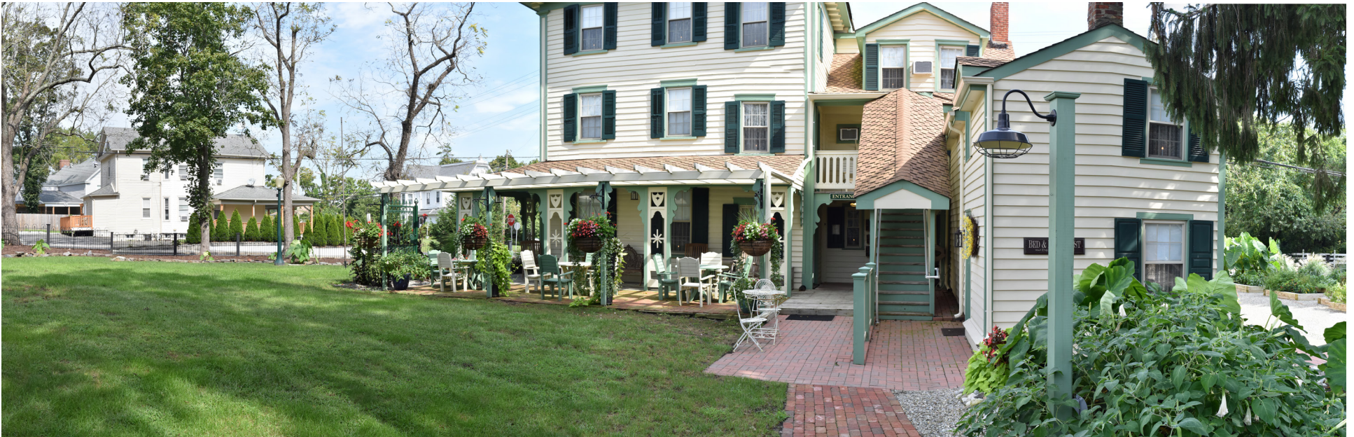
133 Absecon - Pitney House, Historic Resource E