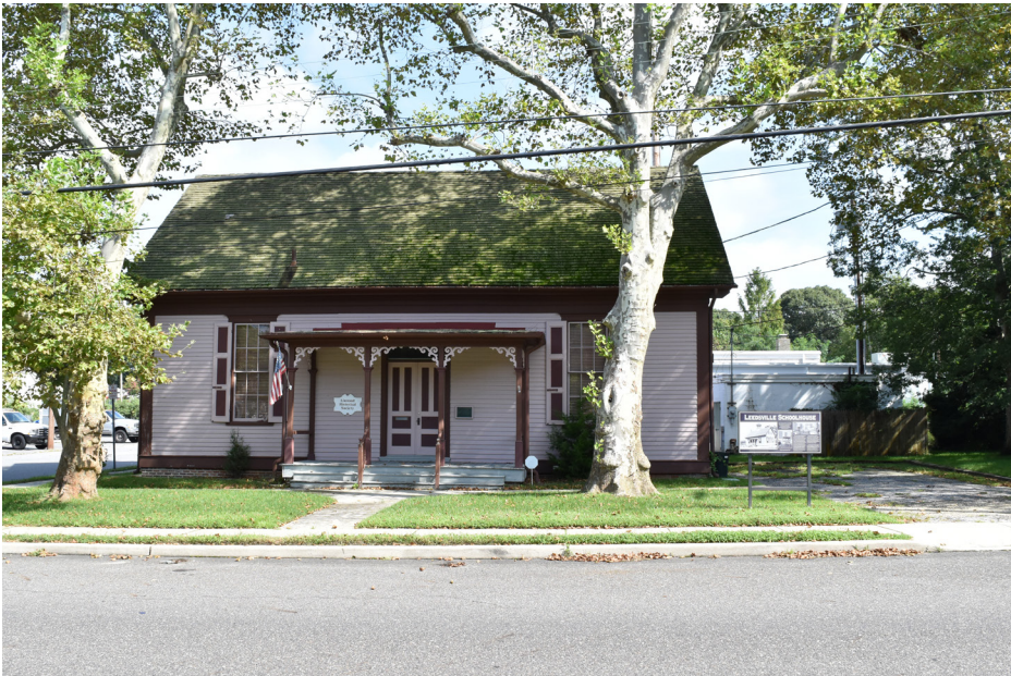
216 Linwood - Leedsville Schoolhouse, Historic Resource SE