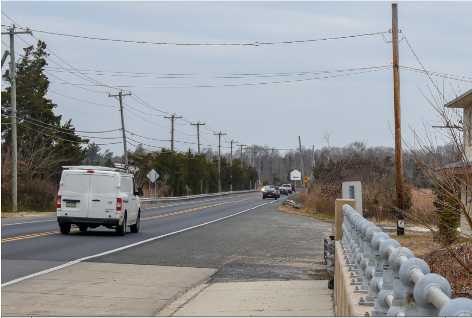
326 Dennis Township - Bridge over Dennis Creek, Route 47 N