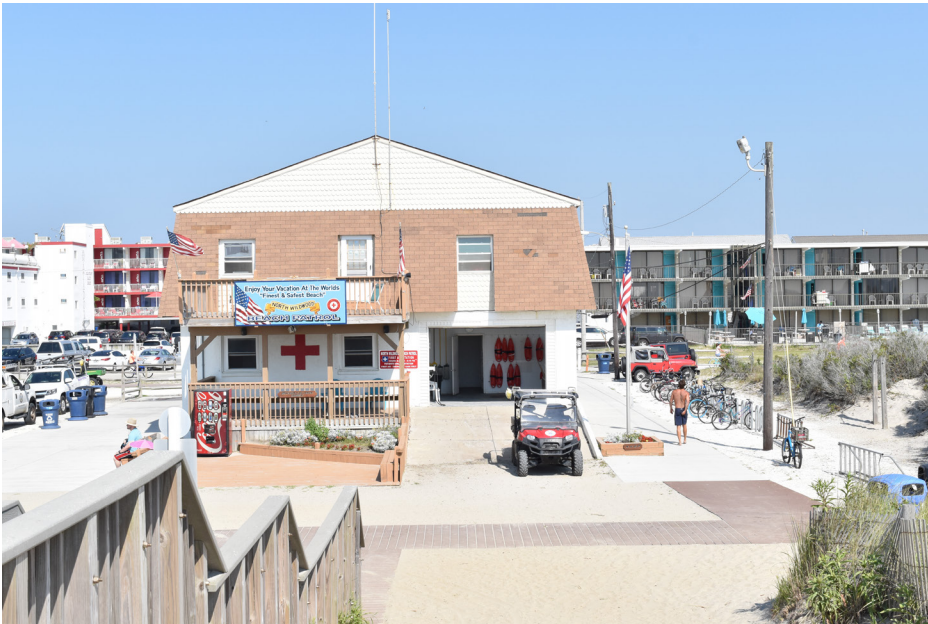
446 North Wildwood - North Wildwood Beach Patrol, Beach Access NW