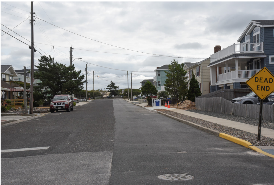
062 Ship Bottom - Beach Access, 8th Street SE