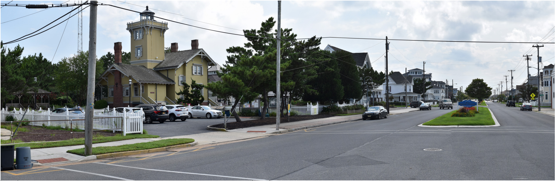
455 *North Wildwood - Hereford Lighthouse, Historic Resource, Central Avenue S