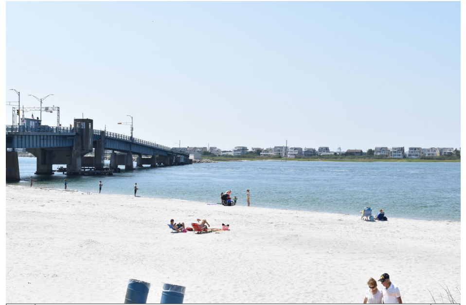
349 Sea Isle City - Townsend Inlet Park, Townsend Inlet Bridge S