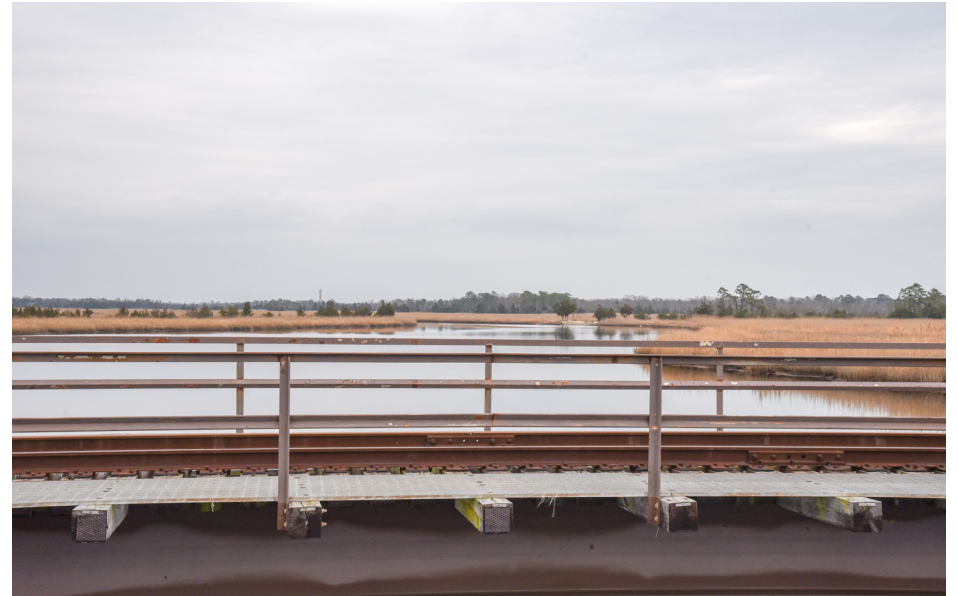
312 Upper Township - Tuckahoe River South, Route 50 NE