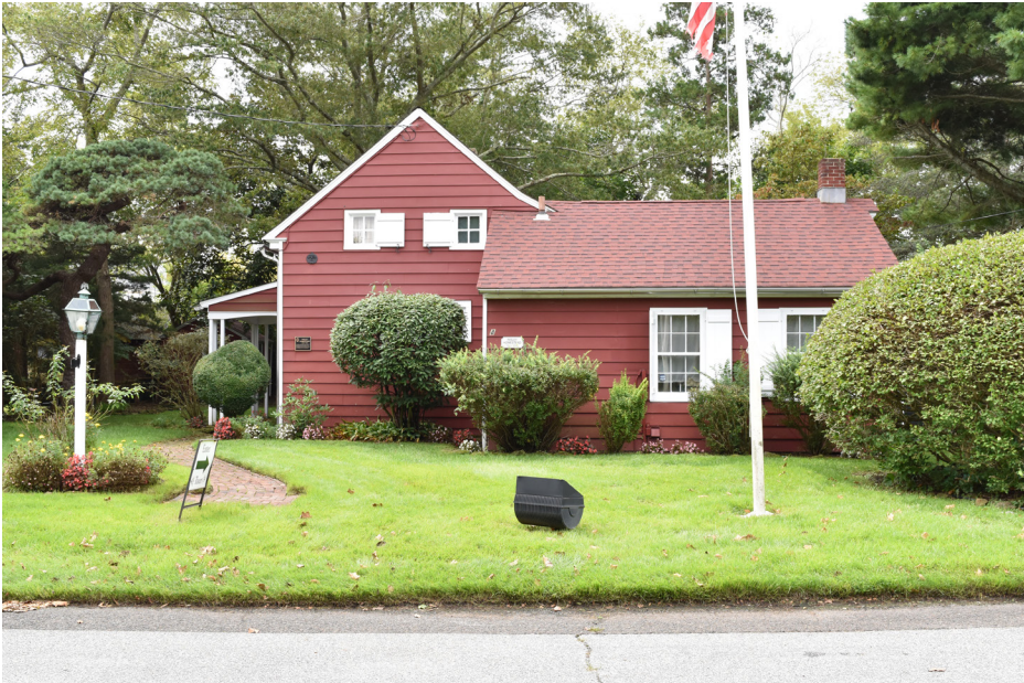
195 Northfield - Risley House, Historic Resource SW