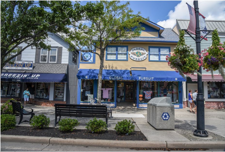
406 Stone Harbor - Stone Harbor Historic District, 96th Street NW