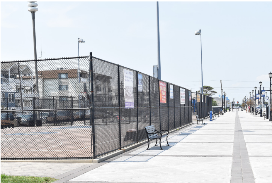
346 Sea Isle City - John F. Kennedy Boulevard, Recreation Area W