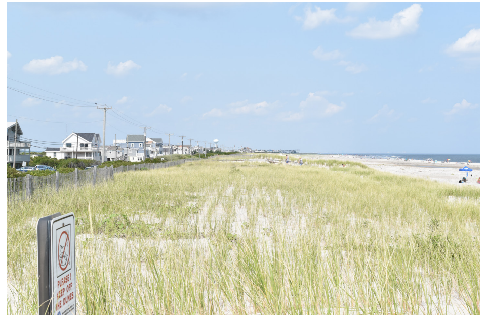
322 Upper Township - Beach Access, Dune, Commonwealth Avenue NE