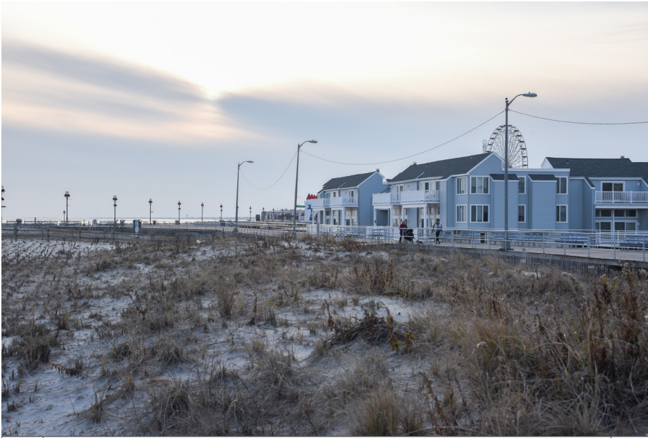
264 Ocean City - Beach Access, 4th Street SW