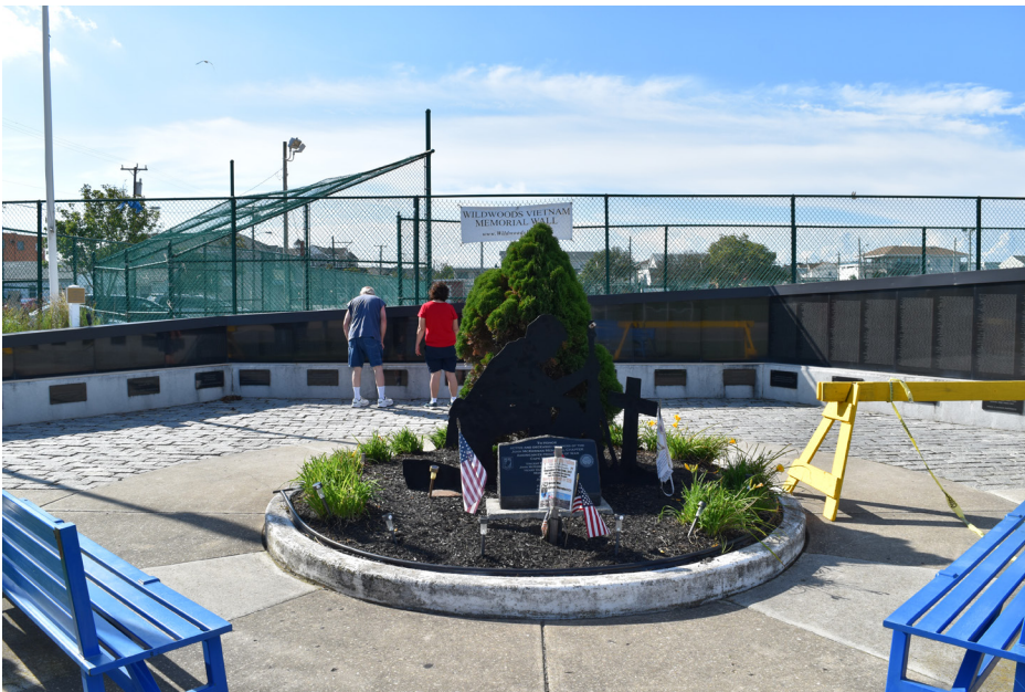
438 Wildwood - Vietnam Memorial Wall, Ocean Avenue NW