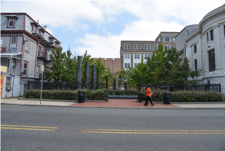
174 Atlantic City - Civil Rights Garden, Dr. Martin Luther King Boulevard E