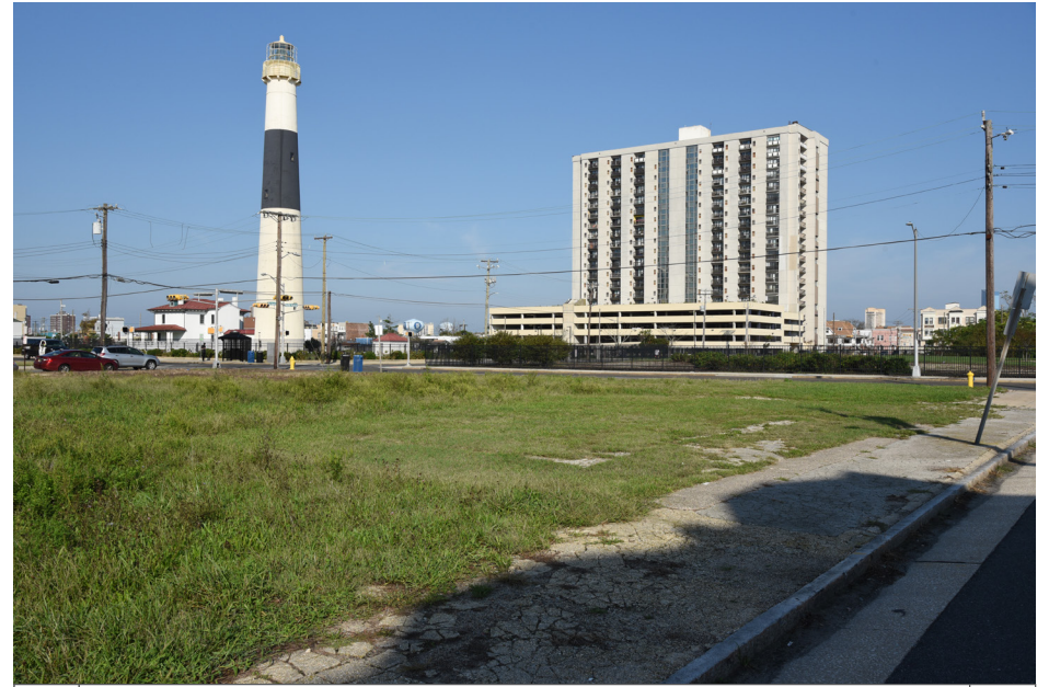
145 Atlantic City - Absecon Lighthouse, Historic Resource, Seaside Avenue W