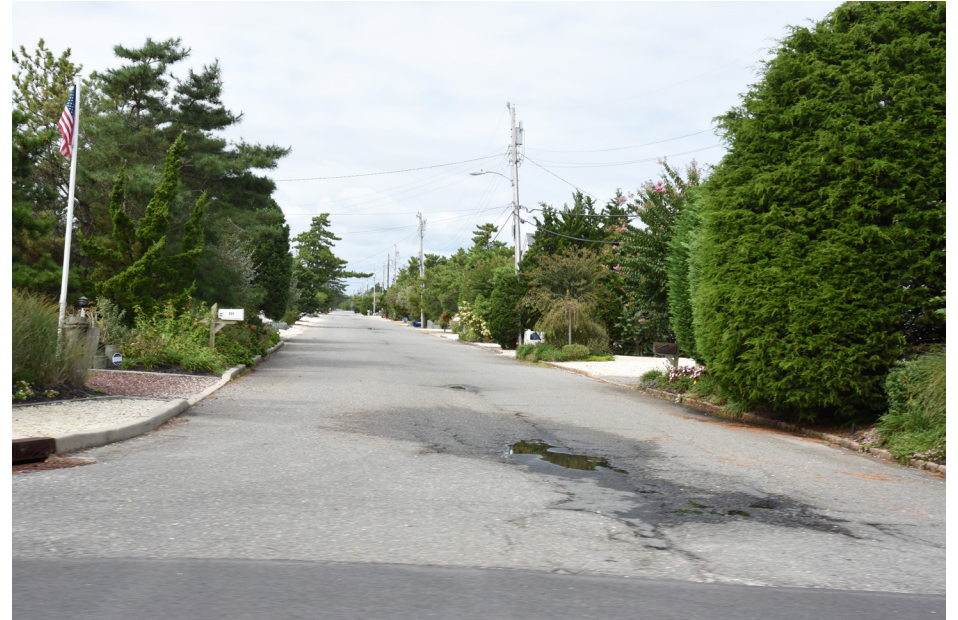
030 Long Beach Township (Loveladies) - Laguna Lane NW