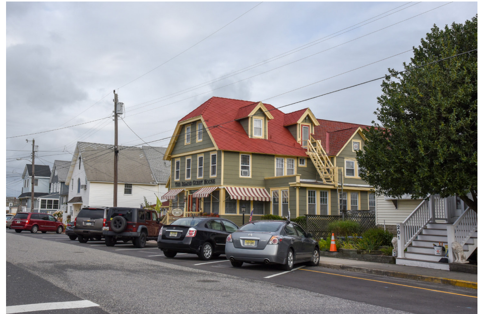
072 Beach Haven - Beach Haven Historic District, 3rd Street N