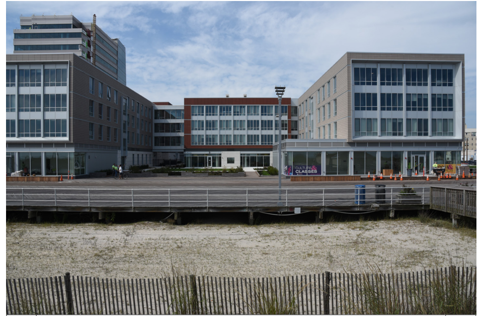
165 Atlantic City - Beach Access, Atlantic City Boardwalk, Stockton University NW