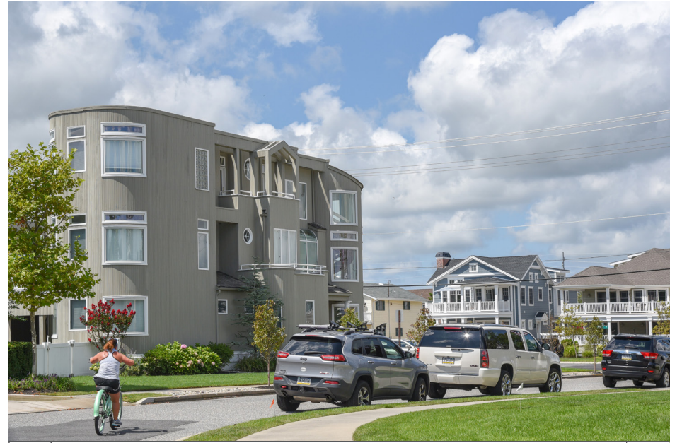
372 Avalon - Bayberry Road W