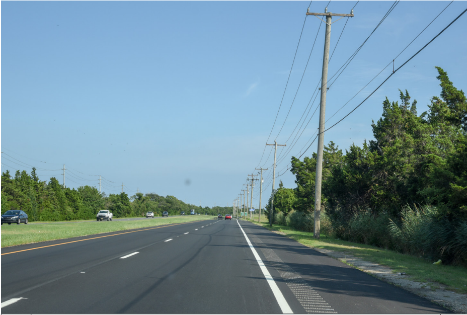
457 Lower Township - Garden State Parkway, Historic Resource SE