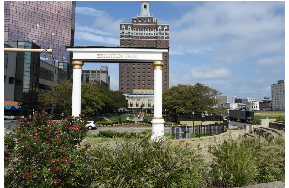
171 *Atlantic City - Atlantic City Boardwalk, Brighton Park, Historic Resource NW