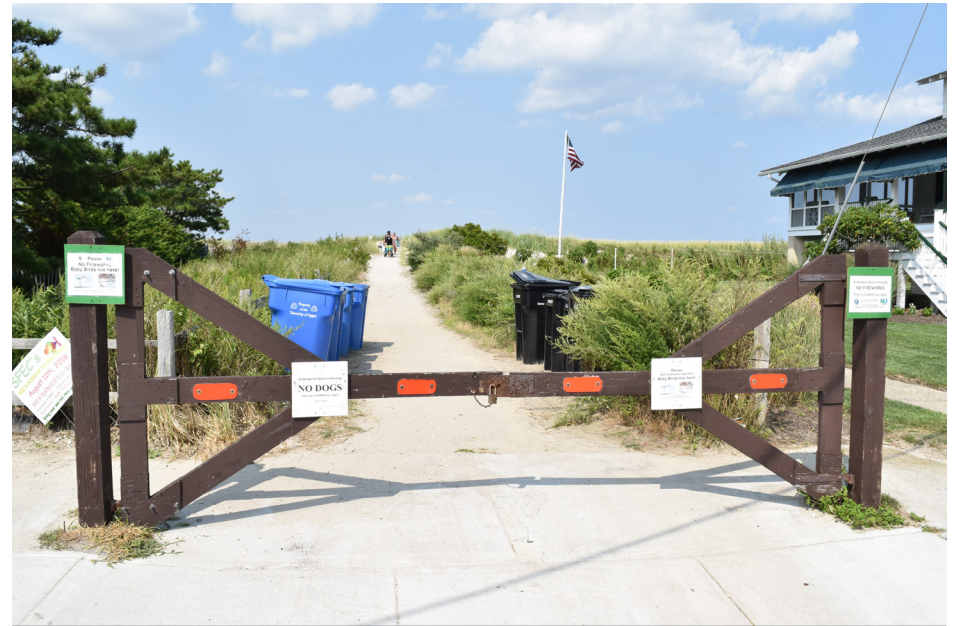
318 Upper Township - Beach Access, End of Commonwealth Avenue NE