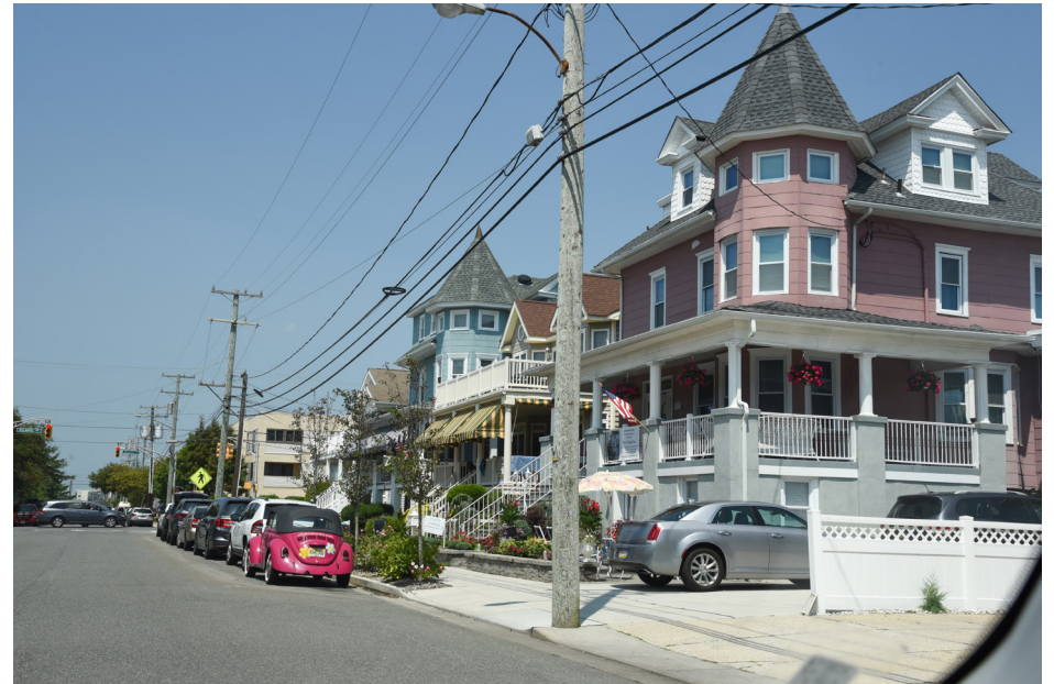
291 Ocean City - 5th Street, Historic Resource N