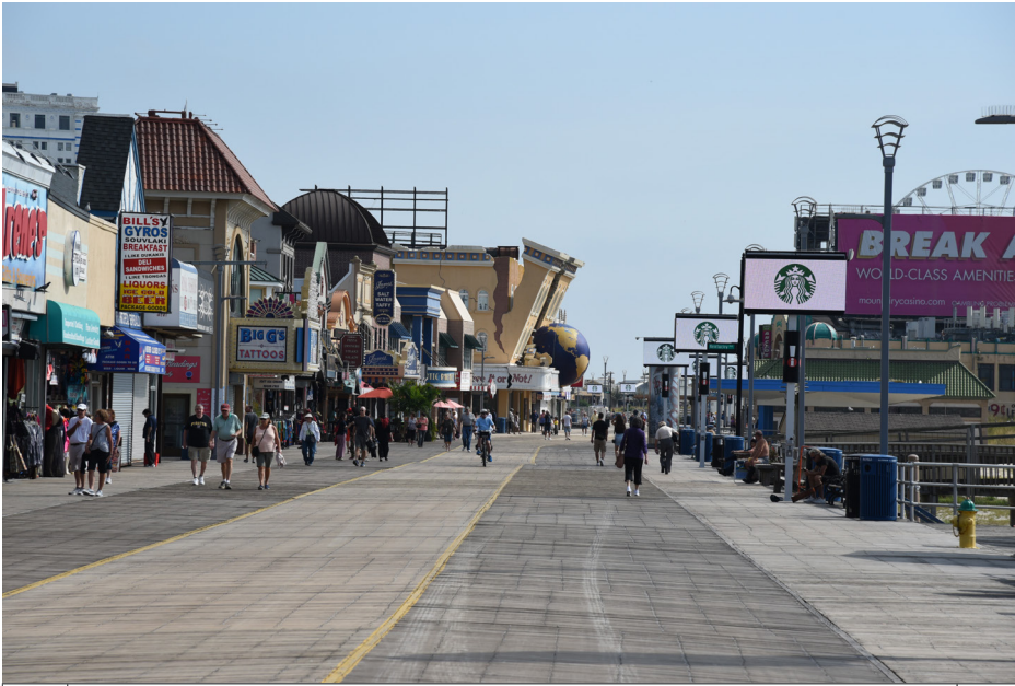
160 Atlantic City - Atlantic City Boardwalk, Historic Resource, MLK Boulevard E