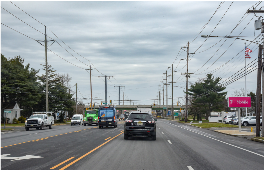
302 Upper Township - Proposed Underground Cable Route to BL England, Roosevelt Boulevard SE