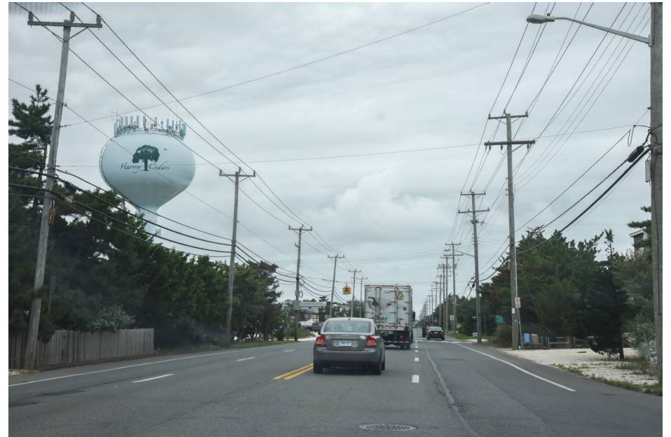
039 Harvey Cedars - Long Beach Boulevard at Gloucester Avenue N