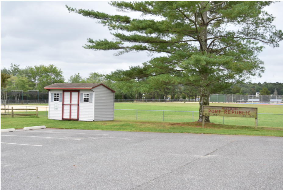
104 Port Republic - Port Republic Historic District, Bowen Memorial Fields SE