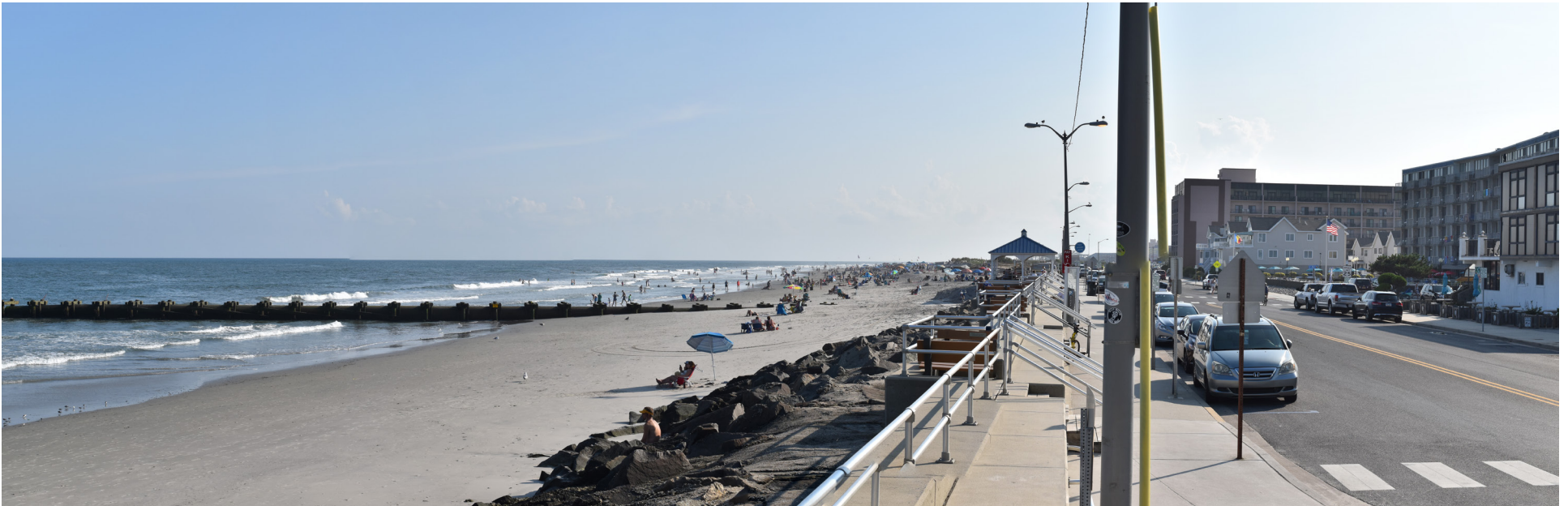
456 North Wildwood - John F. Kennedy Boulevard Pavilion SW