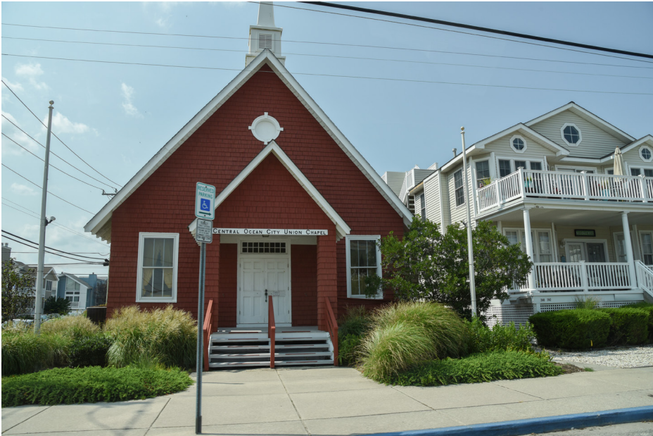
284 Ocean City - Ocean City Union Chapel, Central Avenue NW