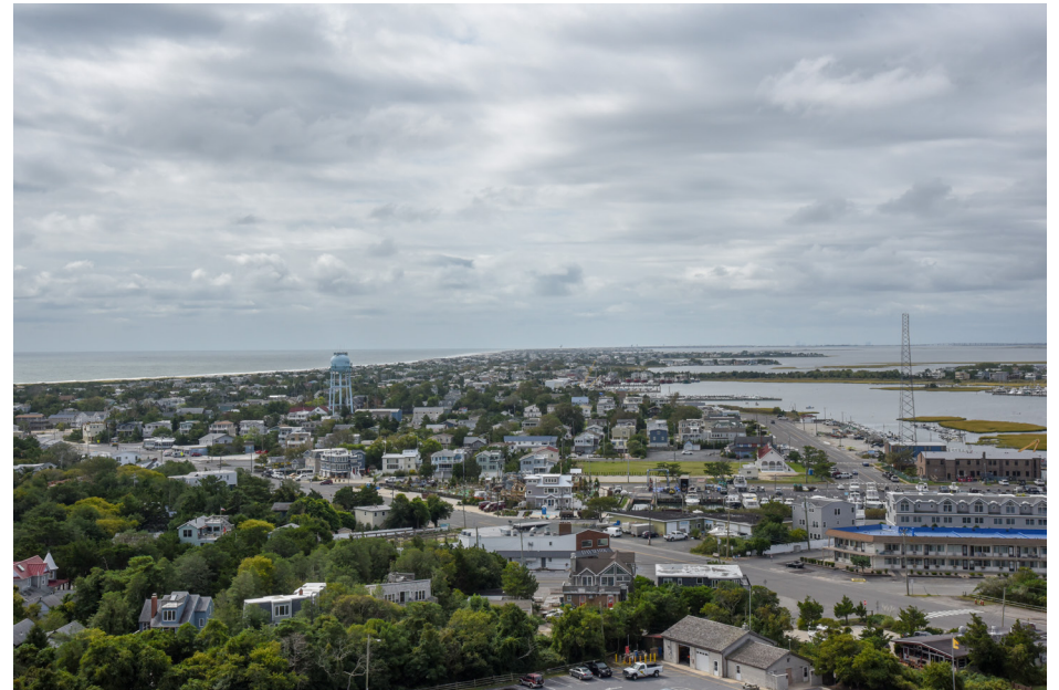
028 *Barnegat Light - Barnegat Lighthouse, view from top, Historic Resource SW