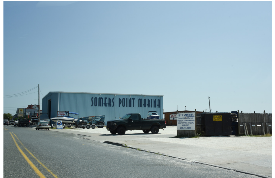
259 Somers Point - Bay Front Historic District, Somers Point Marina E