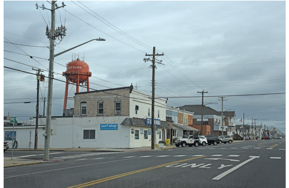
074 Beach Haven - South Bay Avenue Streetscape Historic District N