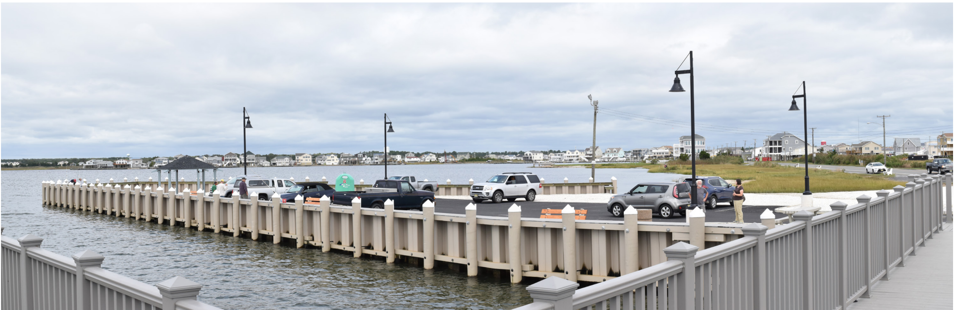
087 *Tuckerton - Tuckerton Dock, Historic Resource, Route 9 SE