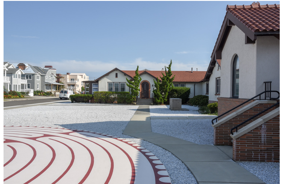
236 Longport - Church of the Redeemer SE