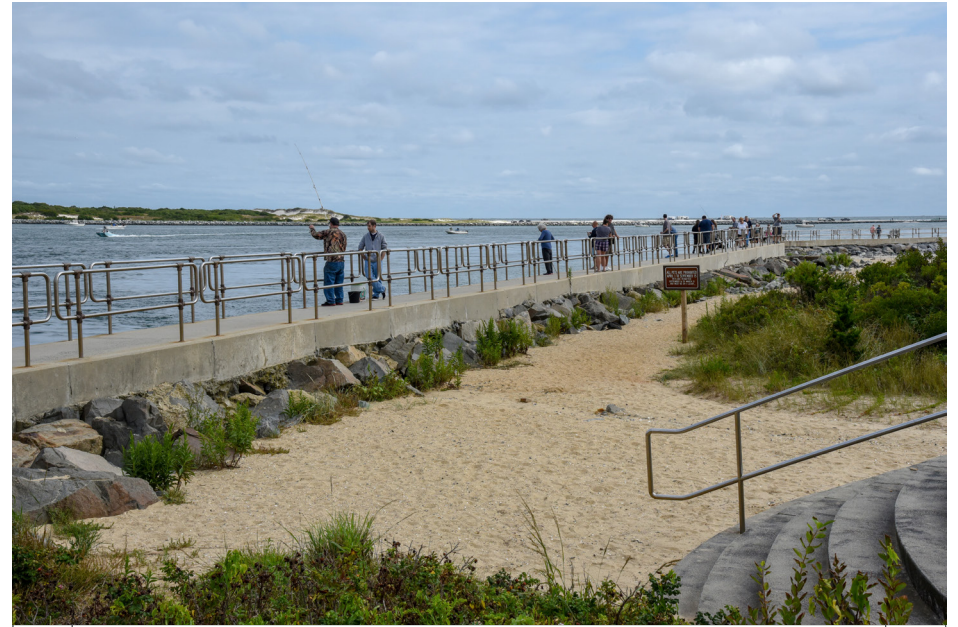
026 *Barnegat Light - Barnegat Lighthouse State Park NW