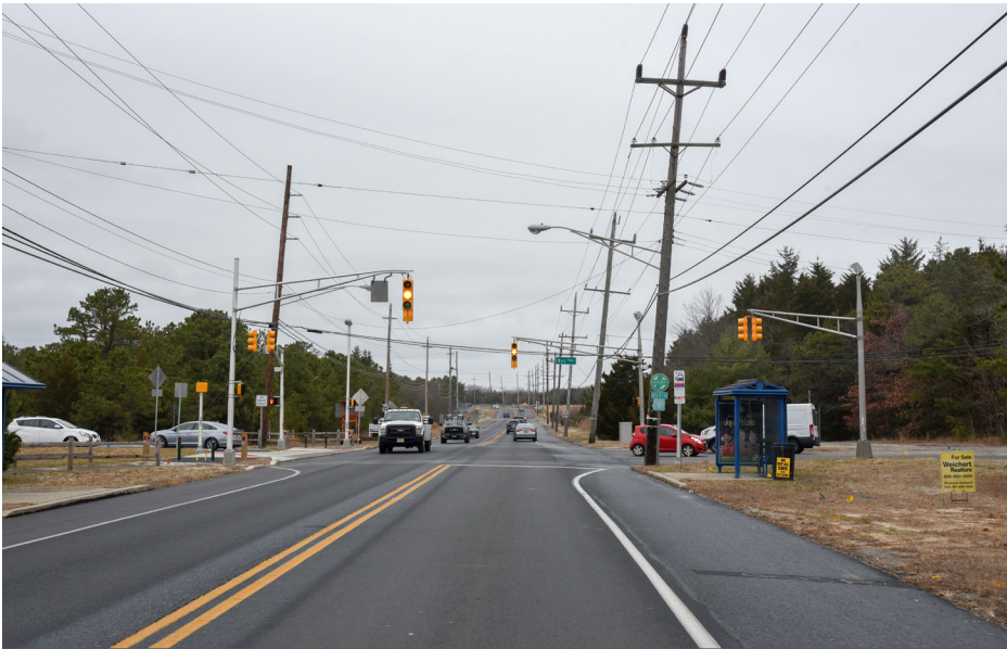
011 Ocean Township - Proposed Underground Cable Route to Oyster Creek, Bay Parkway N