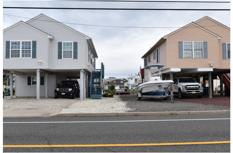
093 Little Egg Harbor Township - Canal Housing, Radio Road W