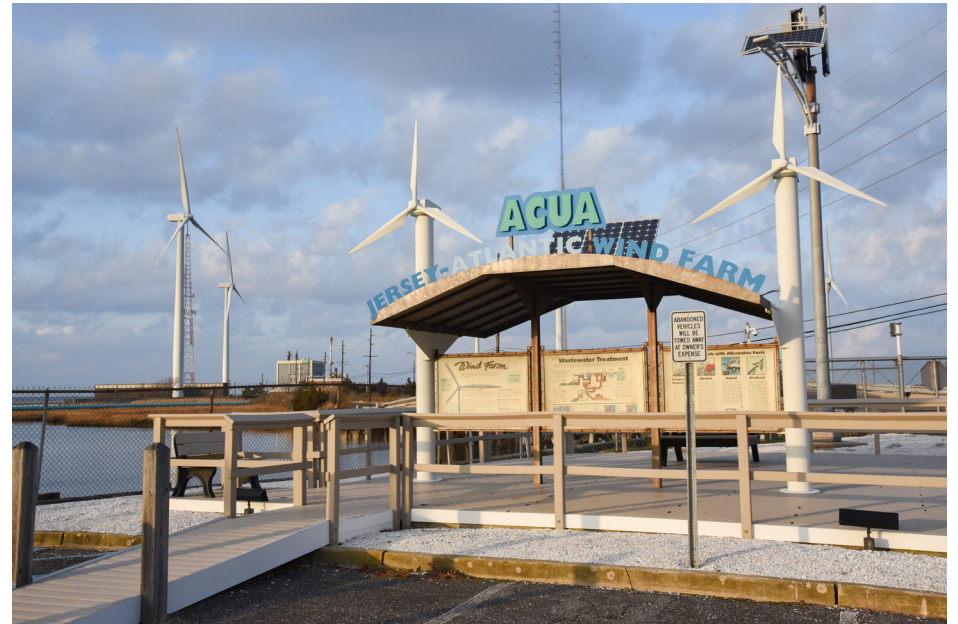
151 Atlantic City - Absecon Boulevard, Route 30 NE