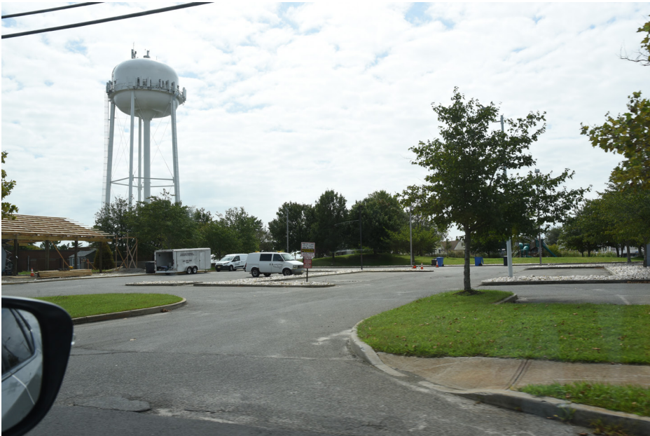
042 Stafford Township - Mill Creek Park, Mill Creek Road S