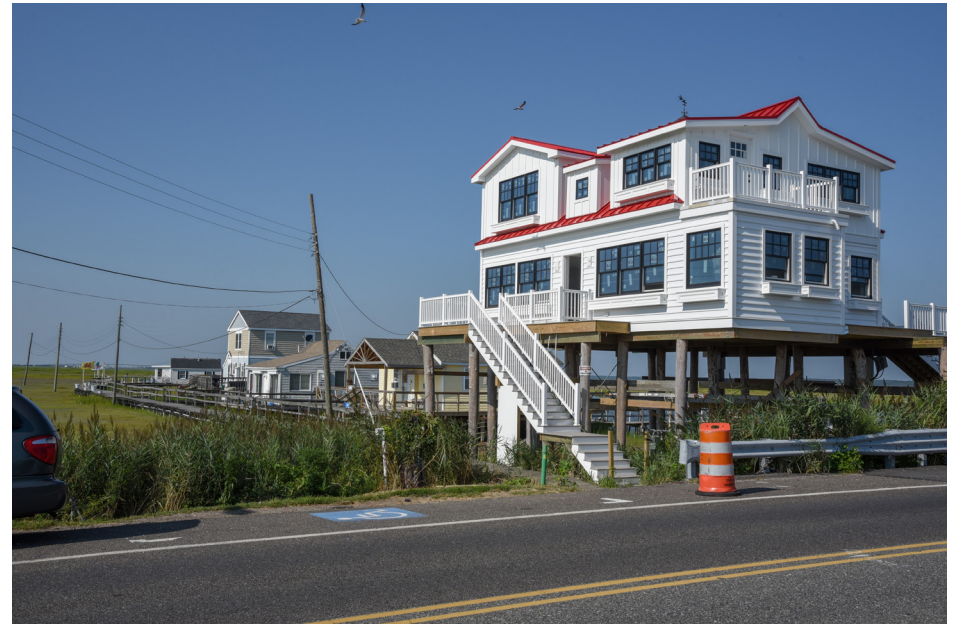
390 Middle Township - Atlantic City Railroad Cape May Division Historic District SW