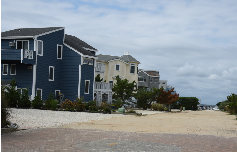
029 Long Beach Township (Loveladies) - Long Beach Boulevard at Duck Blind Alley E