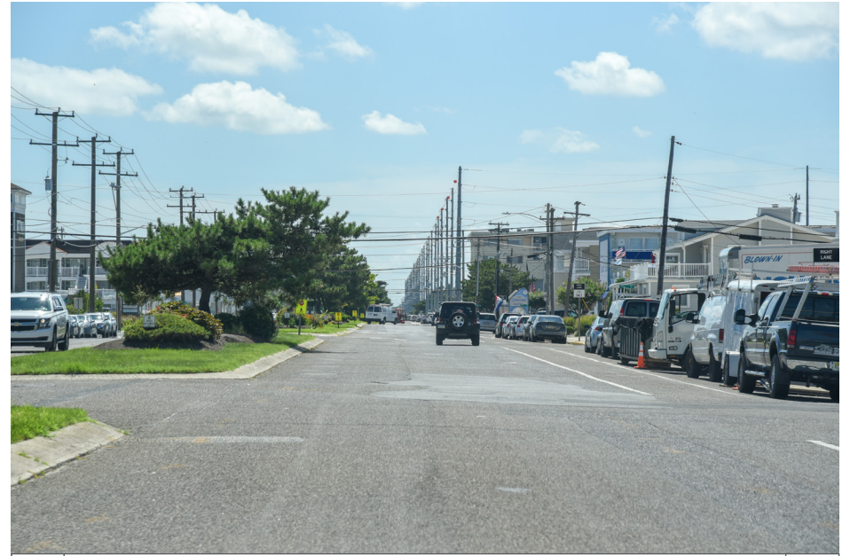
380 Avalon - Dune Drive S