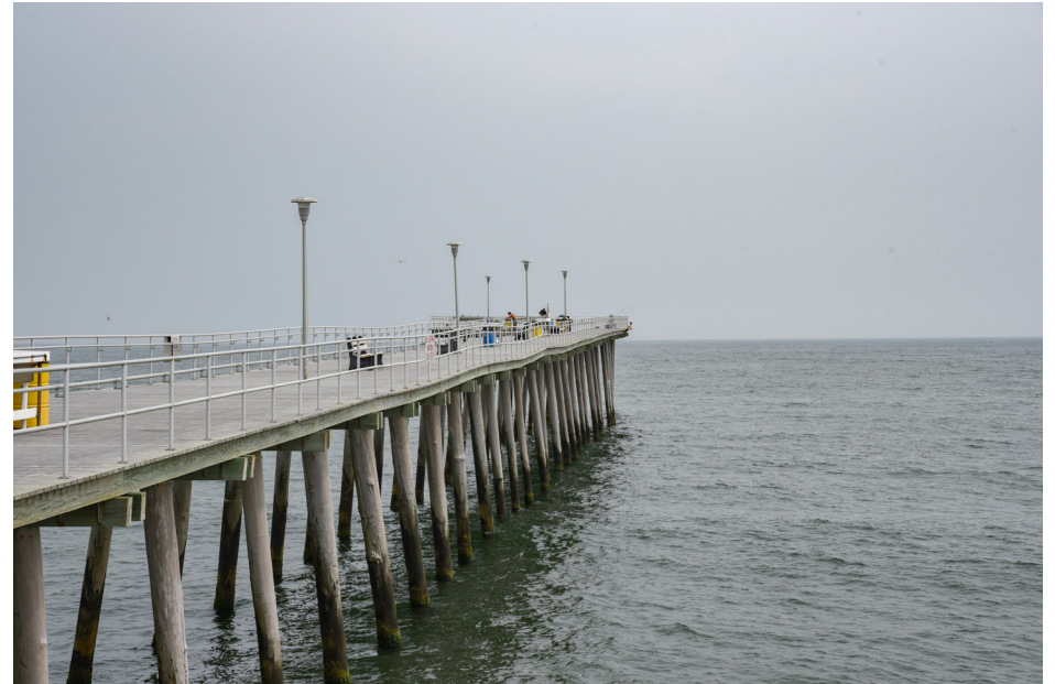
207 Ventnor City - Ventnor City Fishing Pier SE