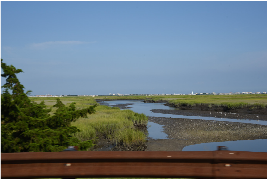
459 Lower Township - Garden State Parkway, Historic Resource E