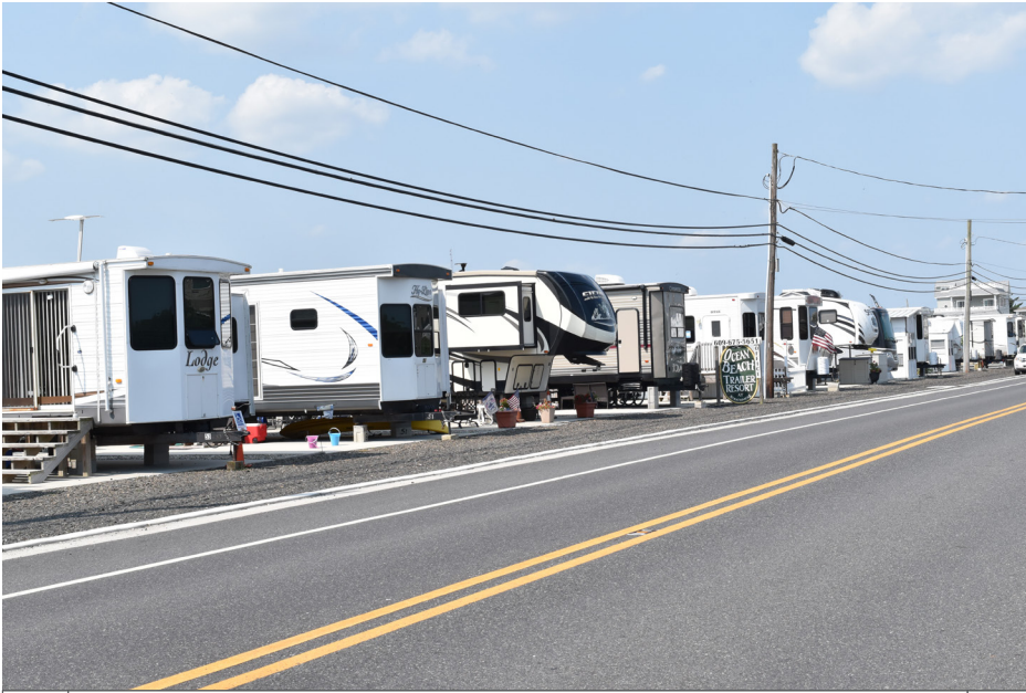
319 Upper Township - Ocean Beach Trailer Resort, Commonwealth Avenue N