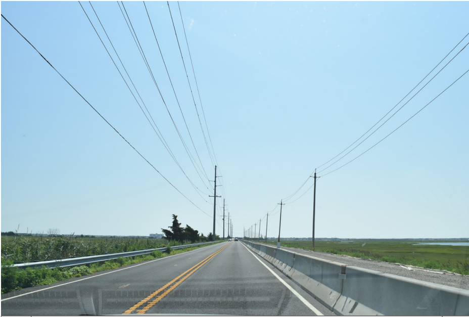
323 Dennis Township - Sea Isle Boulevard E