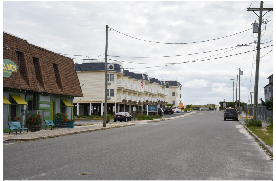
061 Ship Bottom - Long Beach Boulevard at 9th Street E