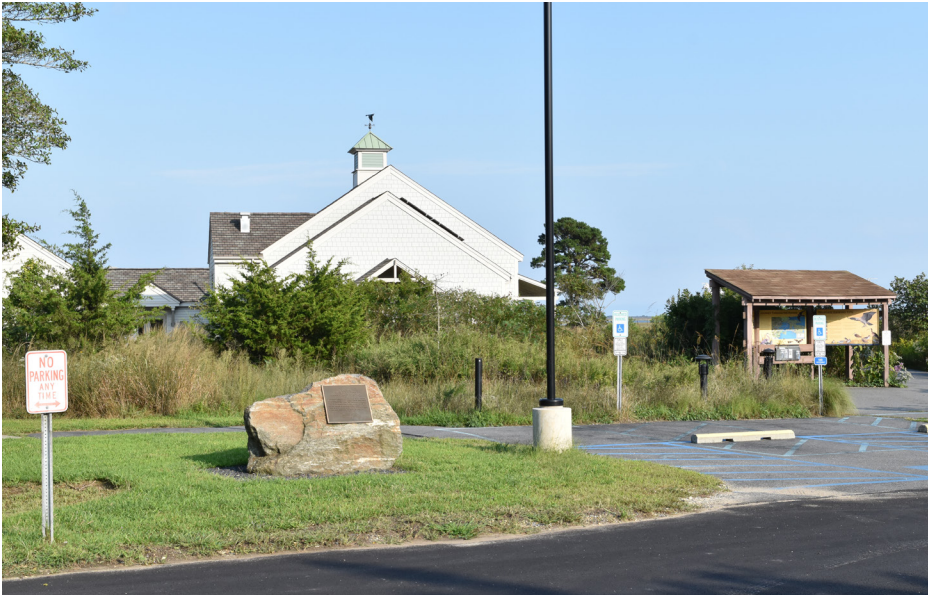
106 *Galloway Township - Edwin B. Forsythe National Wildlife Refuge, Entrance SE