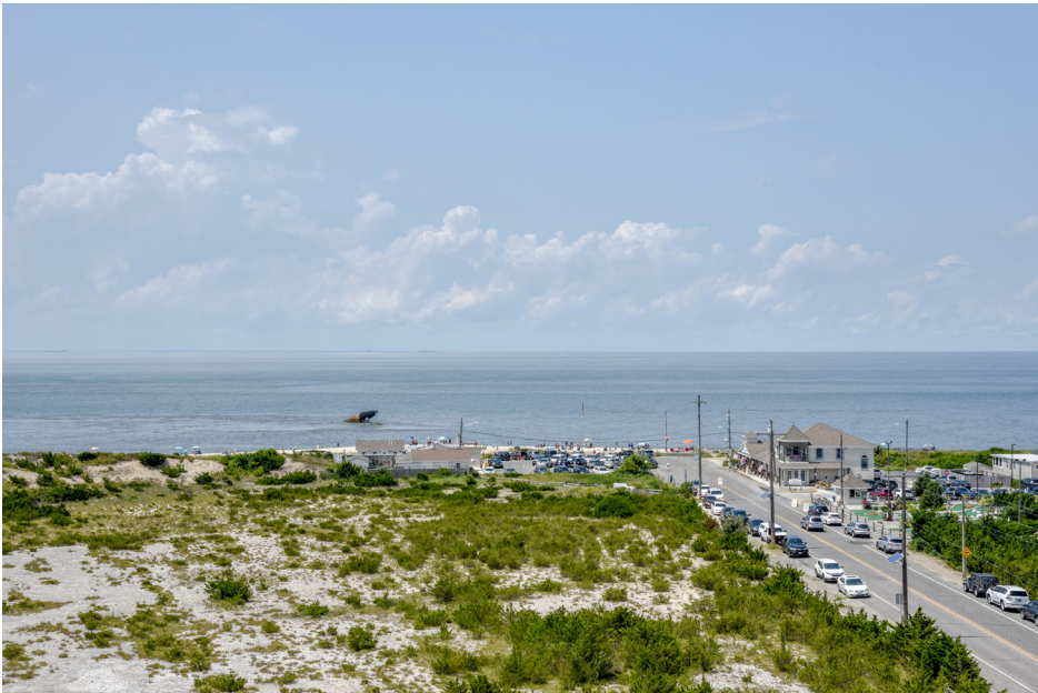
470 Lower Township - WWII Lookout Tower, Historic Resource W