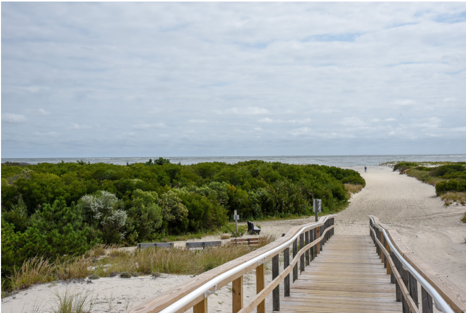
023 Barnegat Light - Public Beach Access, East 9th Street SE