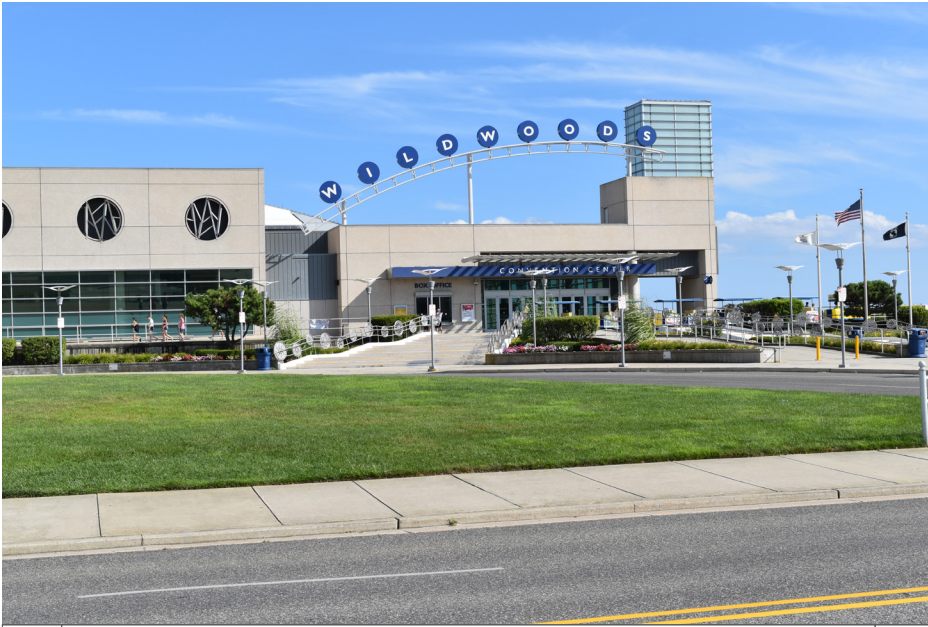
436 Wildwood - Wildwood Convention Center, Ocean Avenue SE