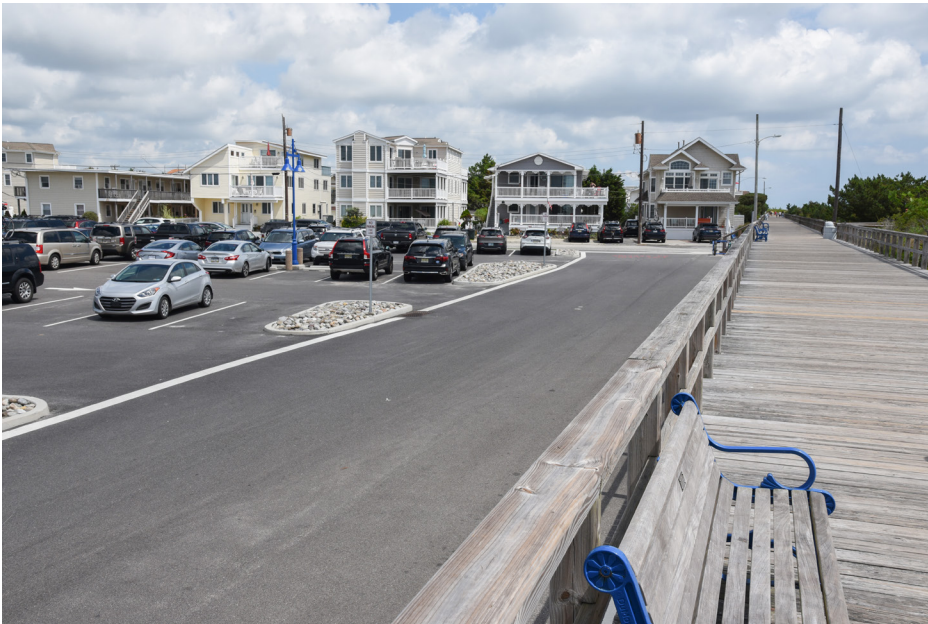
373 Avalon - Avalon Boardwalk, Public Parking Area NE