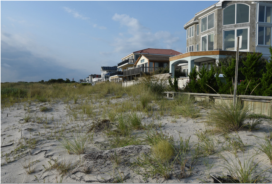
125 Brigantine - Beach Access, Ocean Drive West at Seaspray Road N