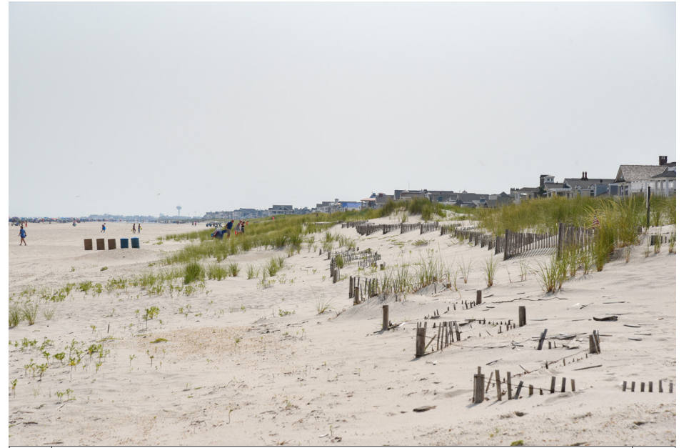
269 Ocean City - Beach Access, 42nd Street SW