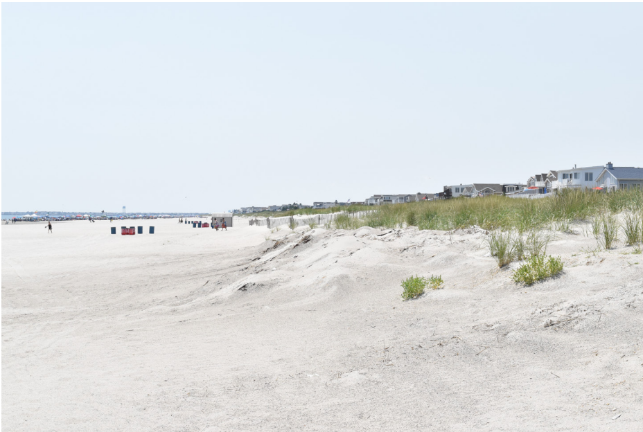
331 Sea Isle City - Public Beach, Pleasure Avenue at 62nd Street SW