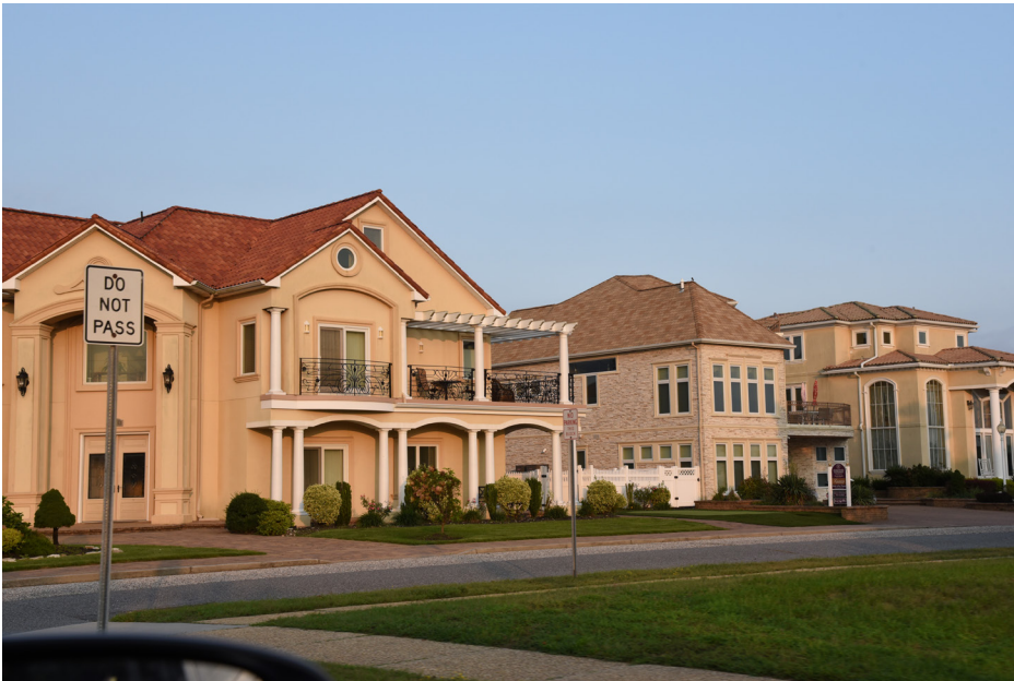
119 Brigantine - Ocean Avenue at 19th Street E