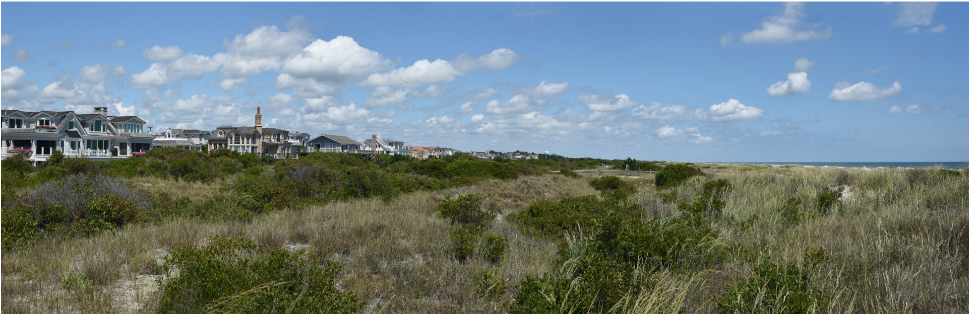
366 Avalon - 66th Street Public Beach Access, Dune NE