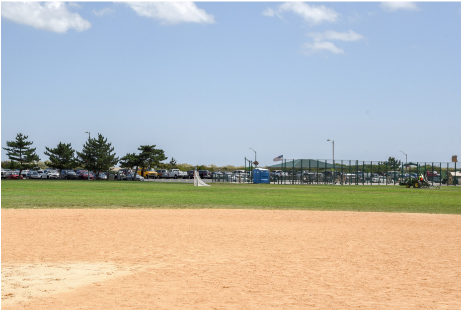
416 Stone Harbor - Stone Harbor Recreation Center S