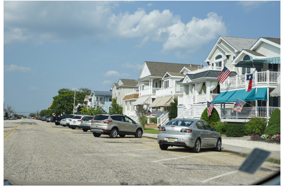
289 Ocean City - West Avenue NE