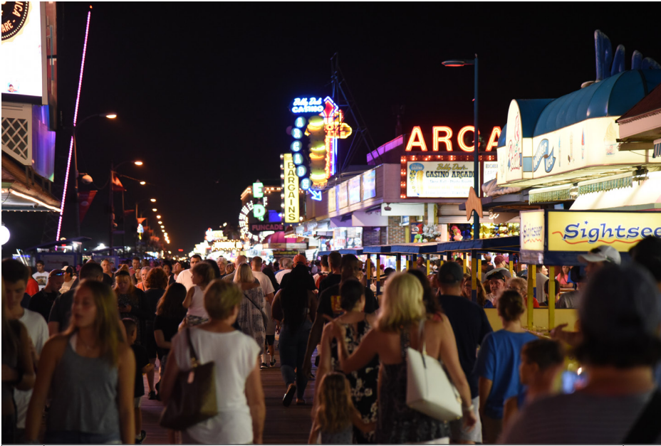
444 Wildwood - Boardwalk, at Cedar Avenue SW