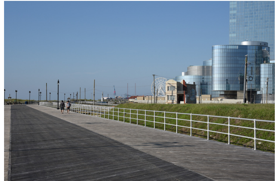
163 Atlantic City - Atlantic City Boardwalk at New Hampshire Street SW