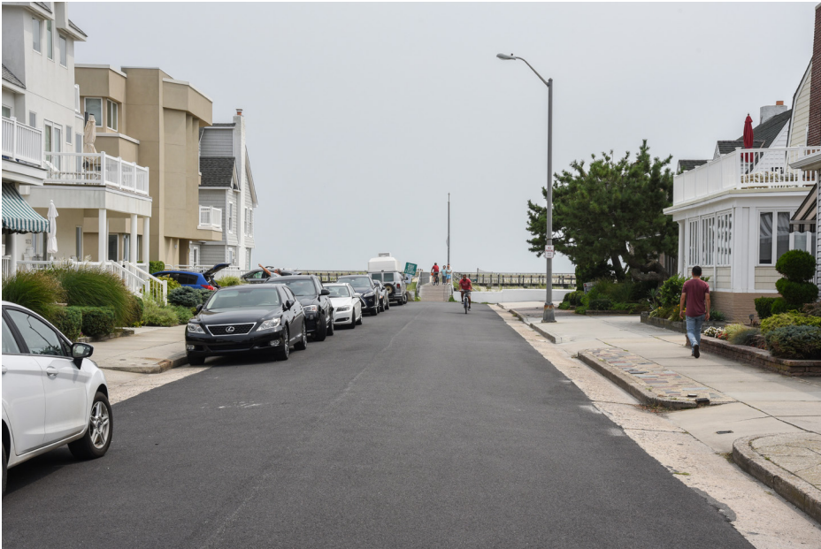
206 Ventnor City - Boardwalk & Public Beach Access, at Martindale Avenue SE