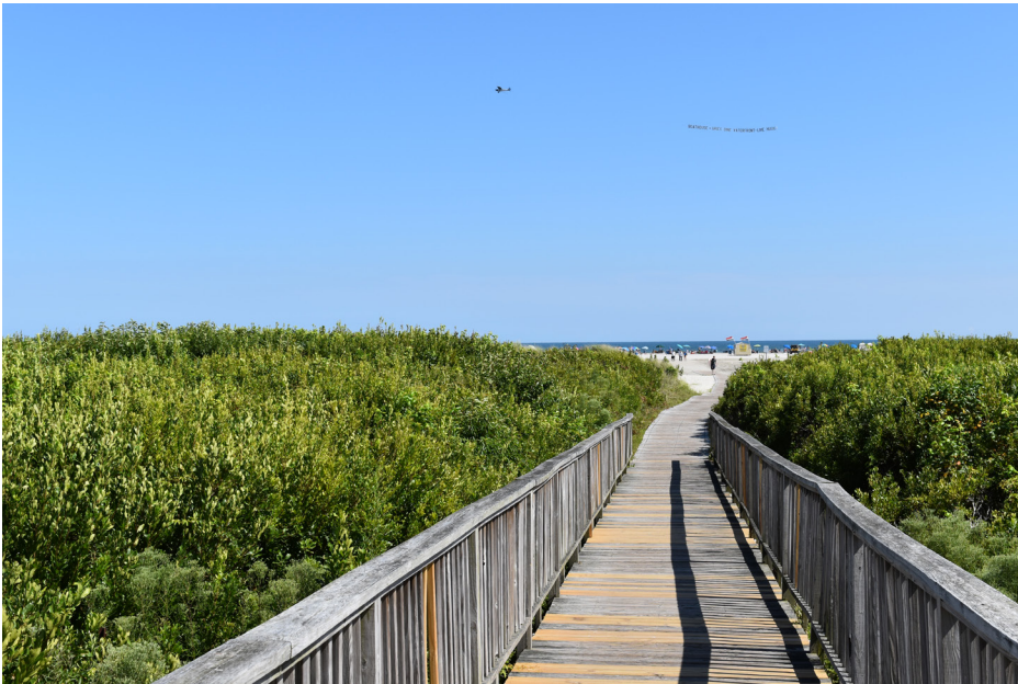
423 Wildwood Crest - Beach Access, Aster Road SE