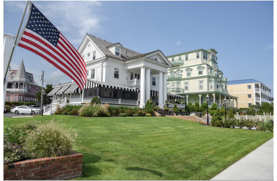
473 Cape May - 1301 Beach Avenue, Historic Resource N