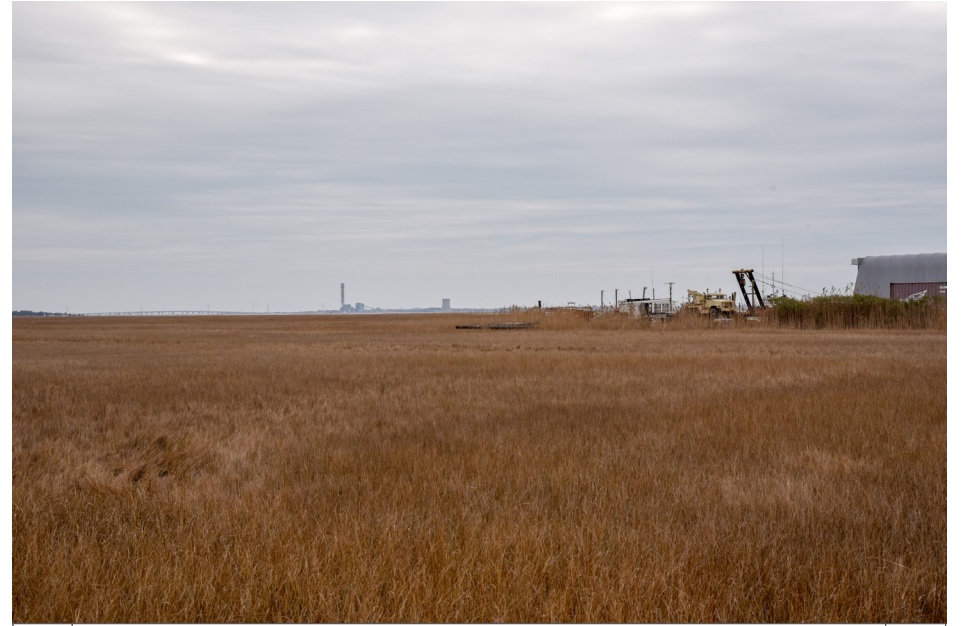
245 Egg Harbor Township - Great Egg River, Wharf Road S