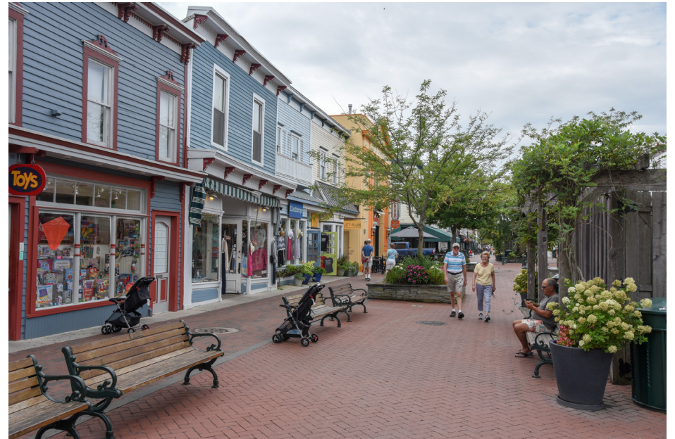
479 Cape May - Cape May Historic District, Washington Street Walkway SW