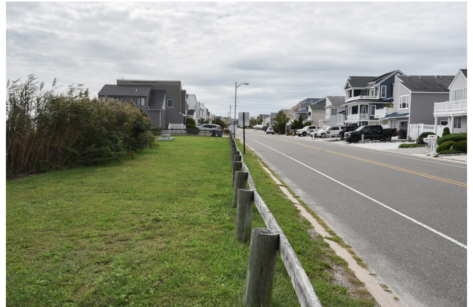
043 *Stafford Township - Bayfront Park, Conservation Area, Mill Creek Road SW