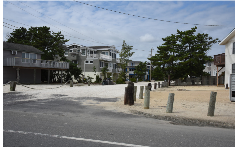
049 Long Beach Township (North Beach) - Long Beach Boulevard at Terrapin Lane W