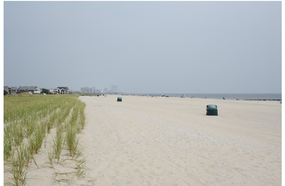
232 Margate City - Public Beach, South Decatur Avenue NE