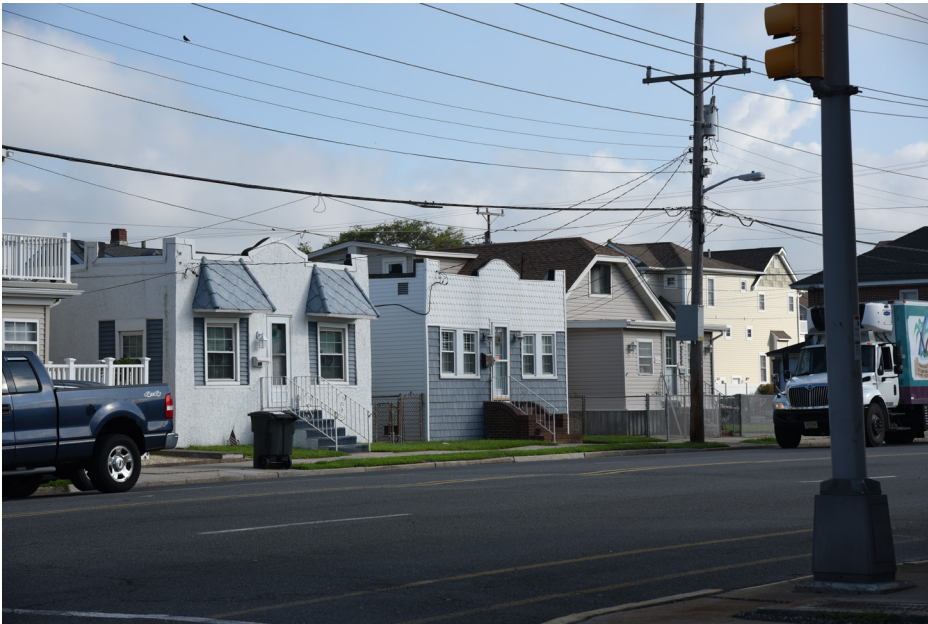
427 Wildwood - Taylor Avenue at Park Boulevard N