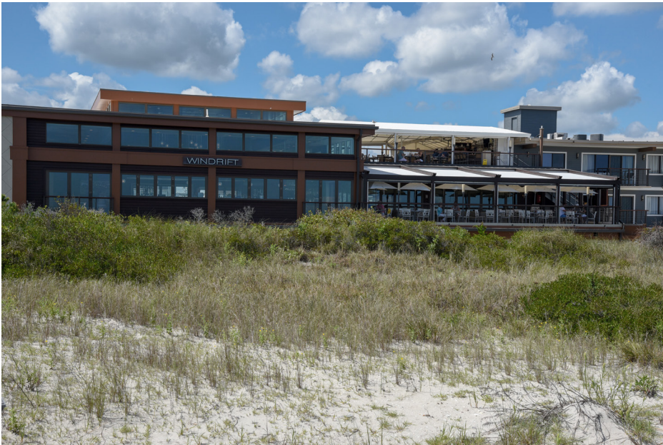
381 Avalon - Windrift Hotel, from 80th Street Public Beach Access SE