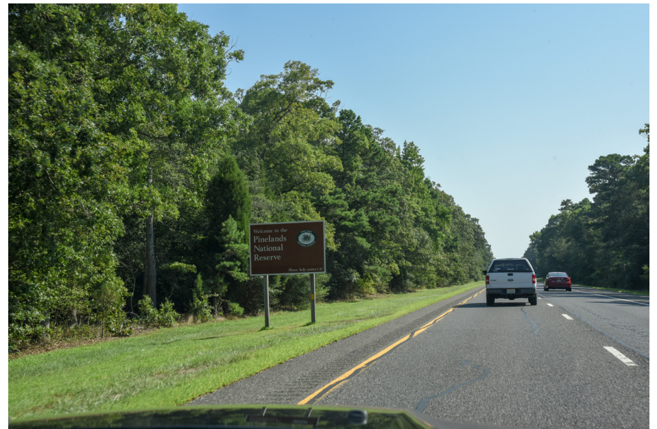
359 Middle Township - Garden State Parkway, Historic Resource NE