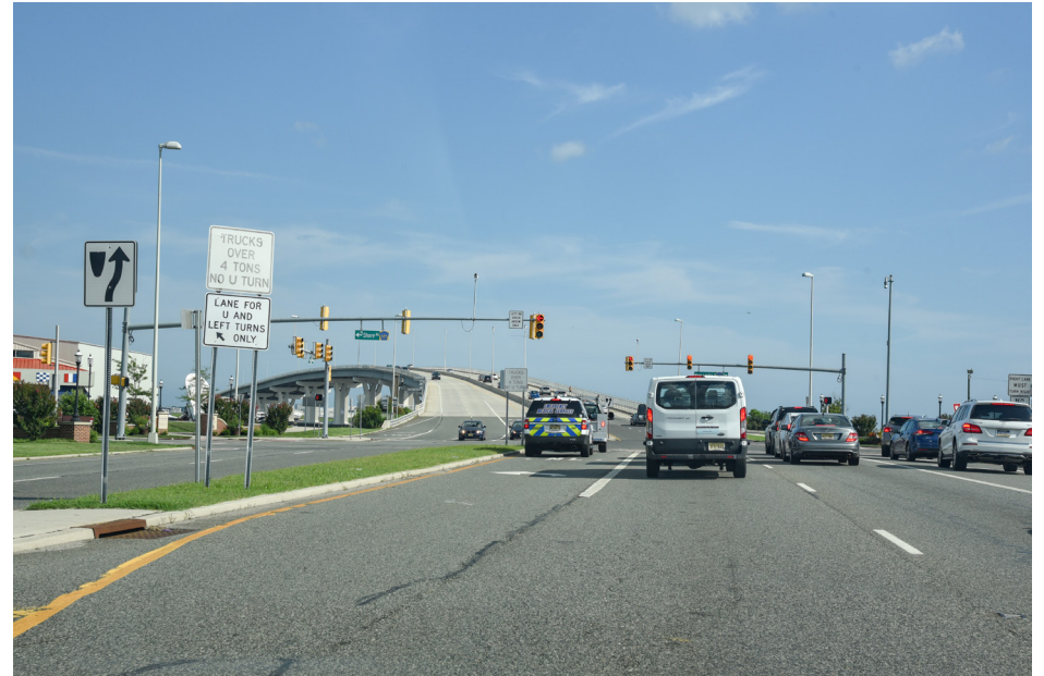
253 Somers Point - MacArthur Boulevard SE