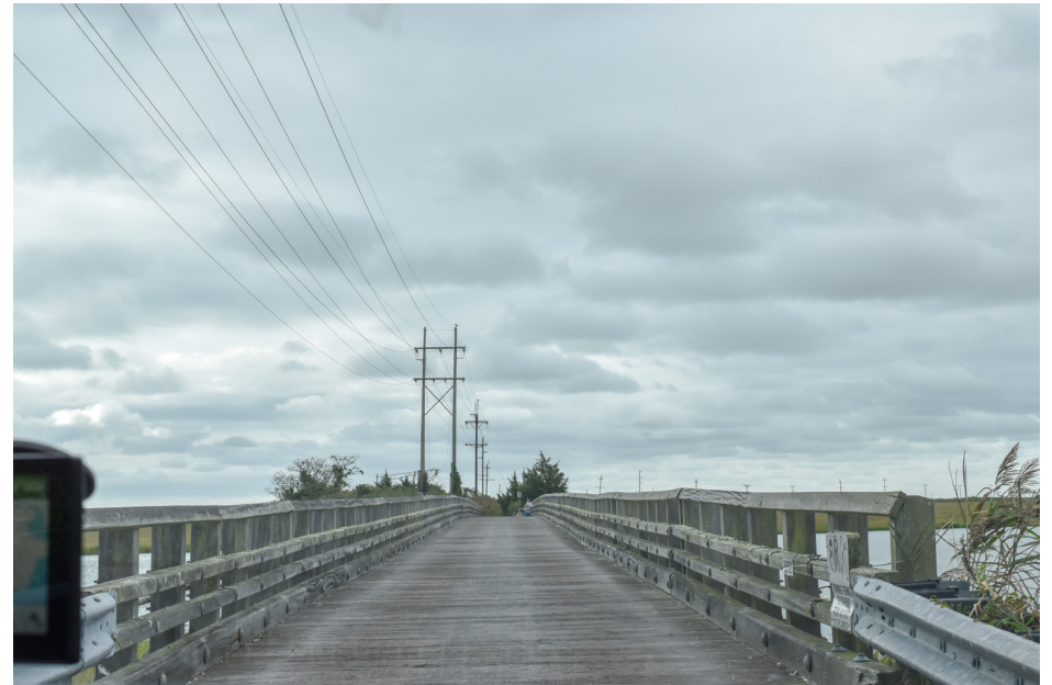
091 Little Egg Harbor Township - Great Bay Boulevard SE