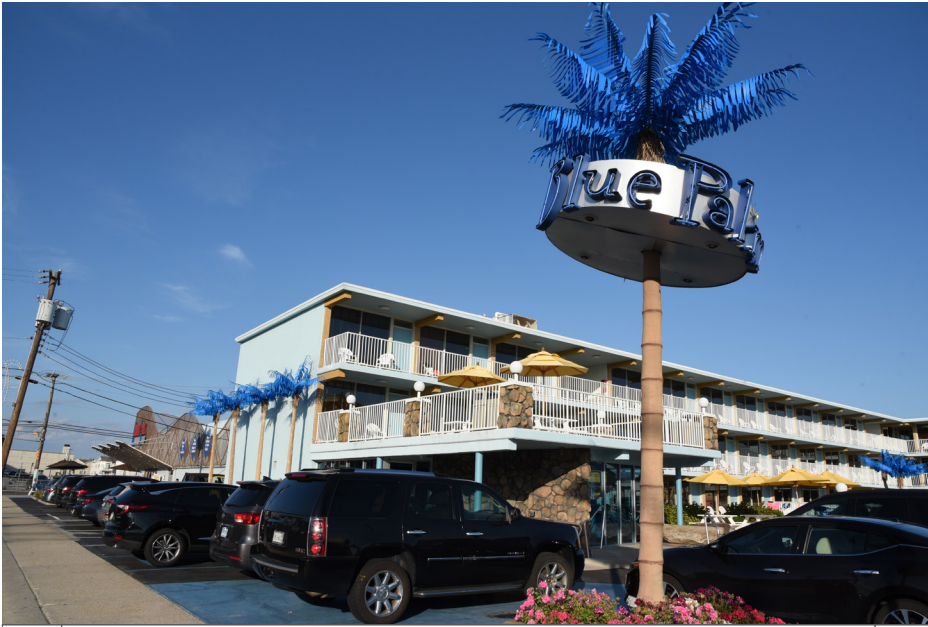
440 Wildwood - Blue Palms Motel, Atlantic Avenue at Lincoln Avenue E