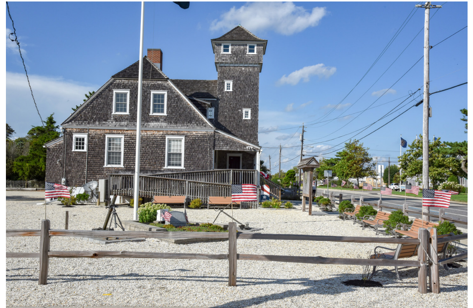
405 Stone Harbor - Historic Tatham Life Saving Station, 117th Street NE