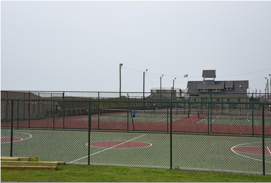
233 Longport - Longport Recreational Complex, from Gazebo SW