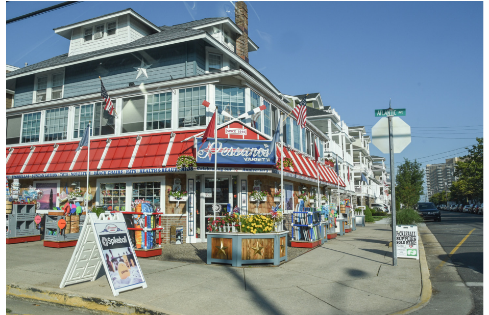
285 Ocean City - Pessano's Variety Store, Atlantic Avenue at 3rd Street E