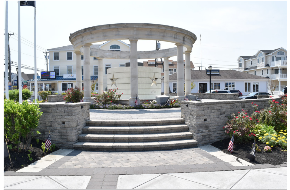
345 Sea Isle City - WWII Memorial SW