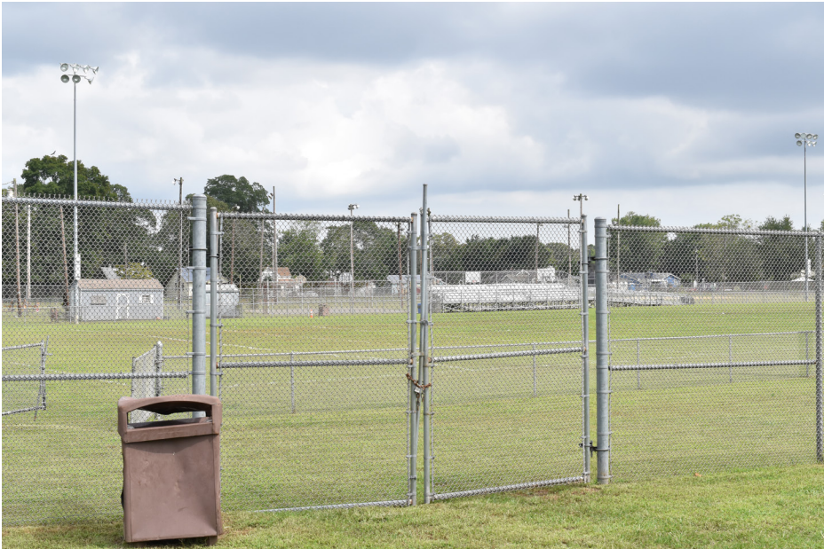
137 Pleasantville - Max Manning Sport Field Complex, Fernwood Avenue NE