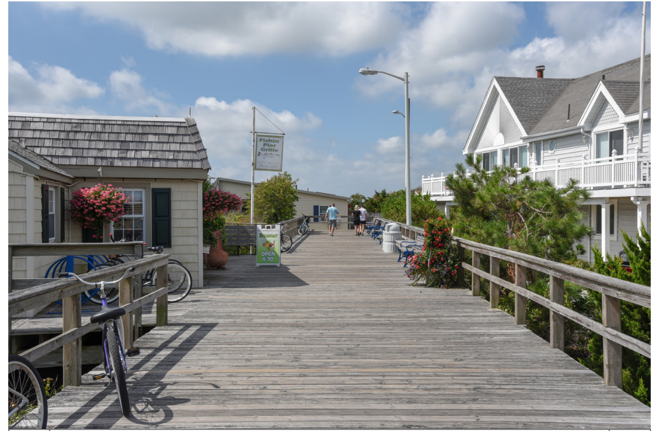
376 Avalon - Avalon Fishing Pier Entrance off of Boardwalk SE