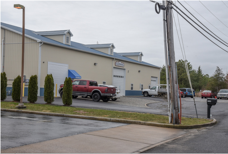
001 Lacey Township - Oyster Creek Route, Old Shore Road SW