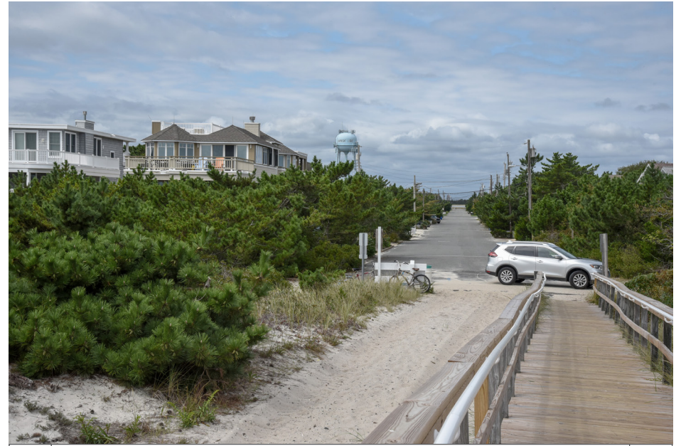
022 Barnegat Light - Public Beach Access, East 9th Street NW