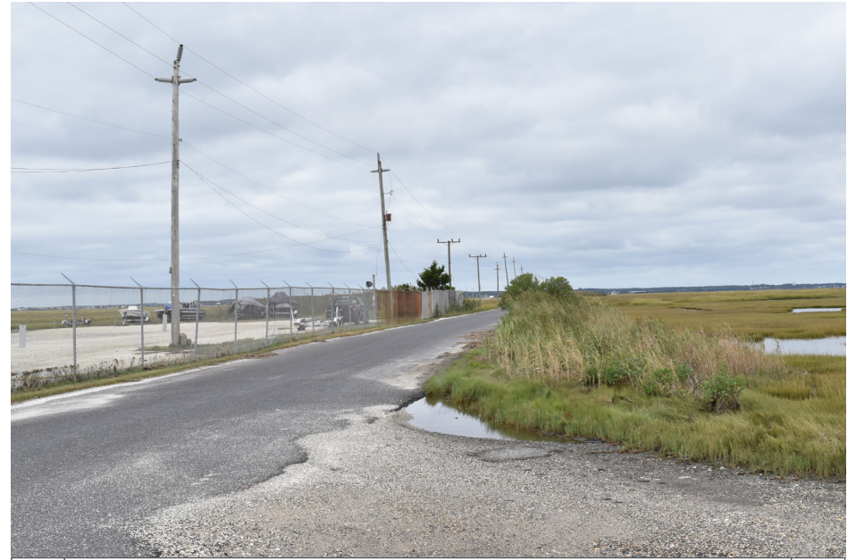
089 Little Egg Harbor Township - Great Bay Boulevard NW