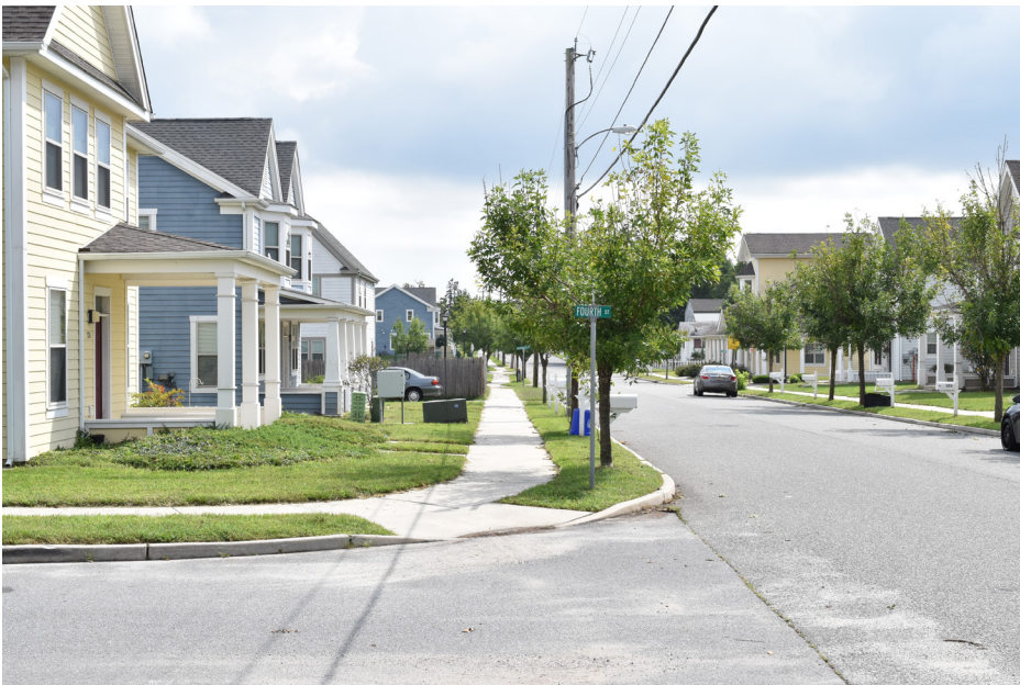
139 Pleasantville - Woodland Avenue at 4th Street SE