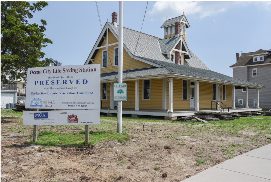
290 Ocean City - Ocean City Life Saving Station, Historic Resource E