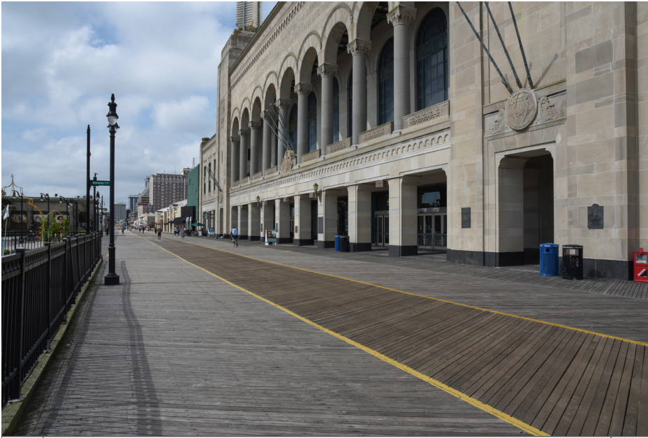
168 Atlantic City - Boardwalk Hall and Kennedy Plaza W