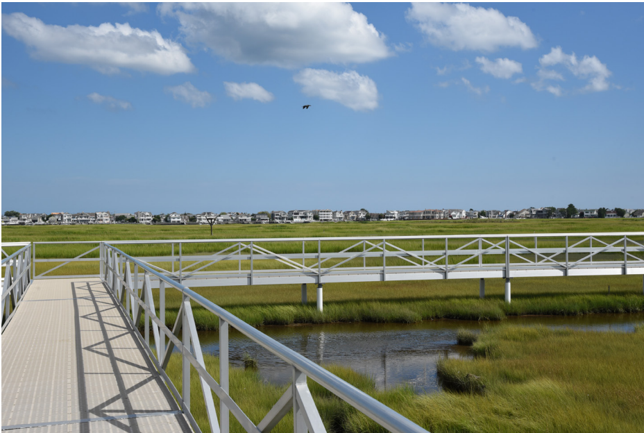
400 *Middle Township - The Wetlands Institute, Conservation Land SE