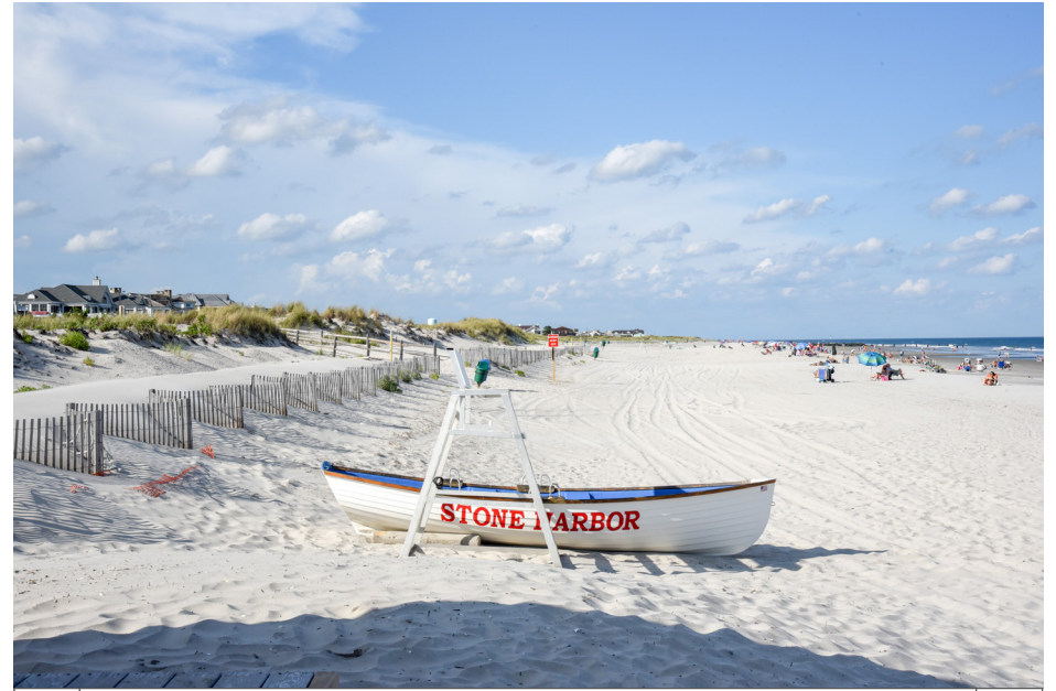
415 Stone Harbor - Stone Harbor Conservation Land NE