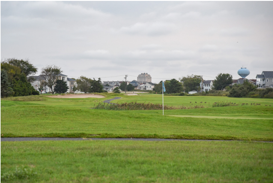
127 Brigantine - Brigantine Golf Course S