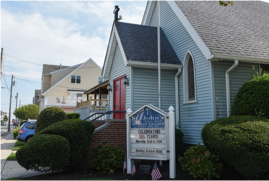
203 Ventnor City - St. John's By the Sea Church, Historic Resource S