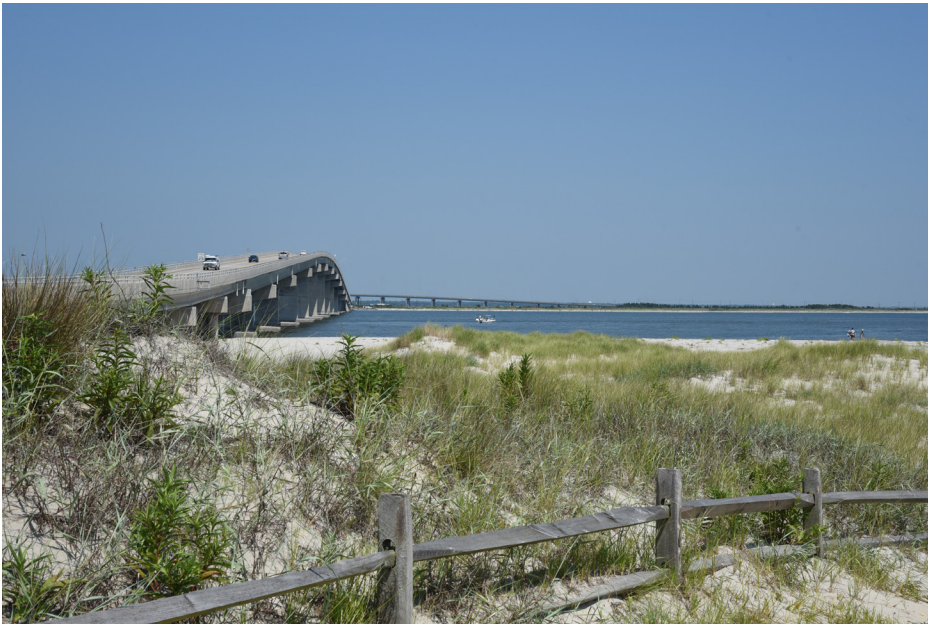
270 Ocean City - Ocean City - Longport Bridge, Historic Resource N