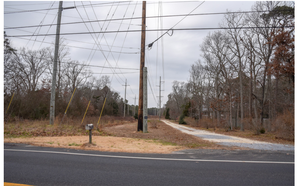
303 Upper Township - Proposed Underground Cable Route to BL England, Old Tuckahoe Road N