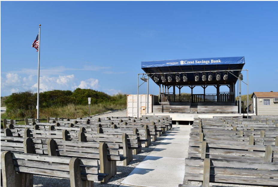
453 North Wildwood - Lou Booth Amphitheater, 2nd Avenue E