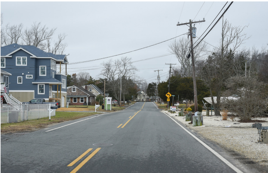
015 Ocean Township - Proposed Underground Cable Route to Oyster Creek, Lighthouse Drive NW