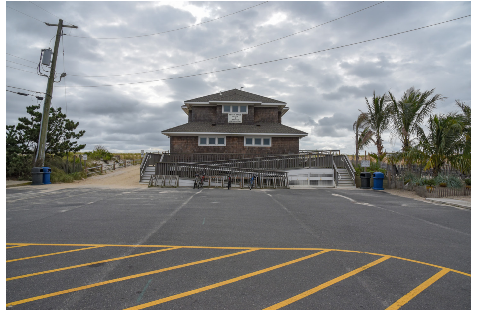
080 Beach Haven - Lifeguard Headquarters at end of Centre Street SE