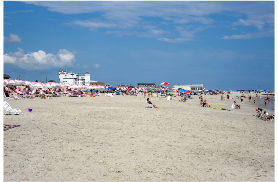
477 Cape May - Public Beach, view toward hotels in Cape May Historic District W