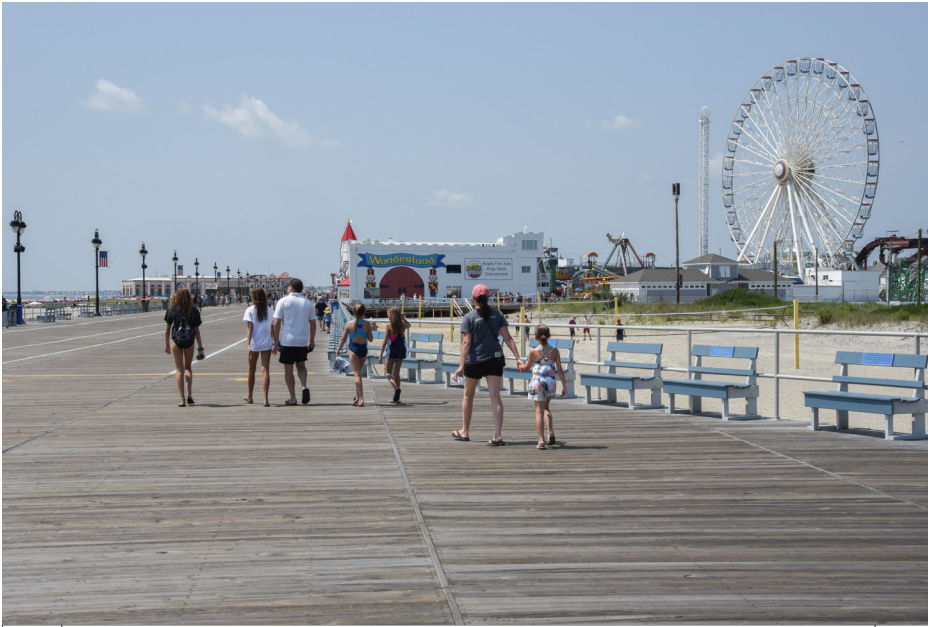
272 *Ocean City - Ocean City Boardwalk, 5th Street W