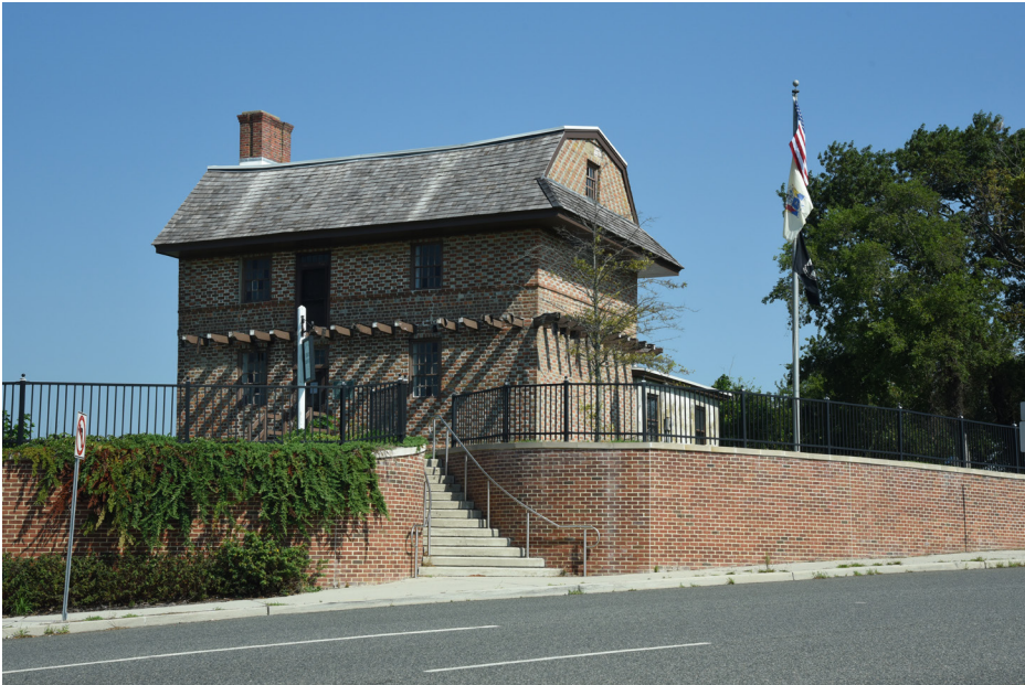
252 Somers Point - Somers Mansion, Historic Resource, Shore Road N