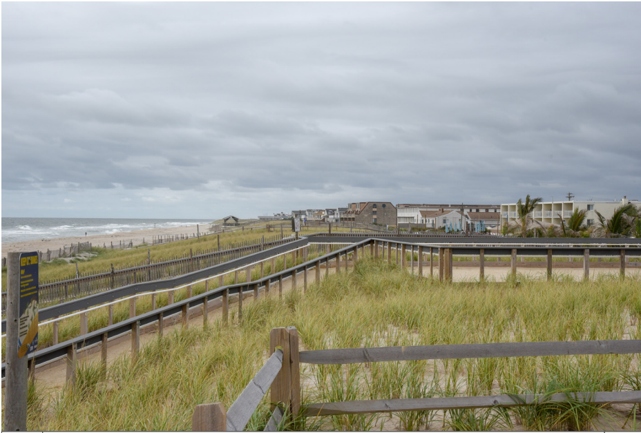
069 Beach Haven - Public Beach Access, Centre Street S