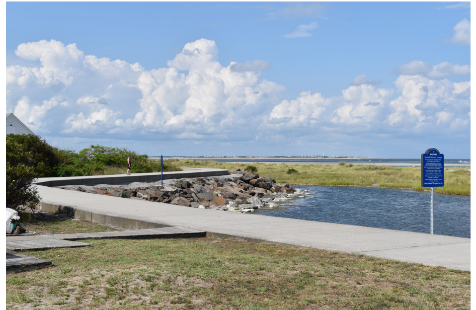
454 *North Wildwood - North Wildwood Seawall N