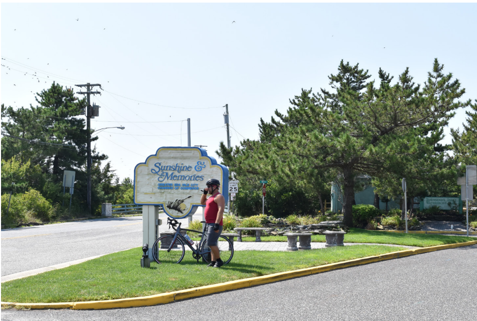
350 Sea Isle City - Townsend Inlet Park Entrance, Roberts Avenue S