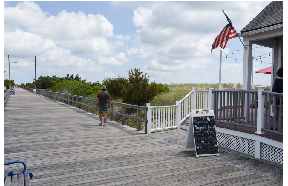
374 Avalon - Avalon Boardwalk, facing North NE