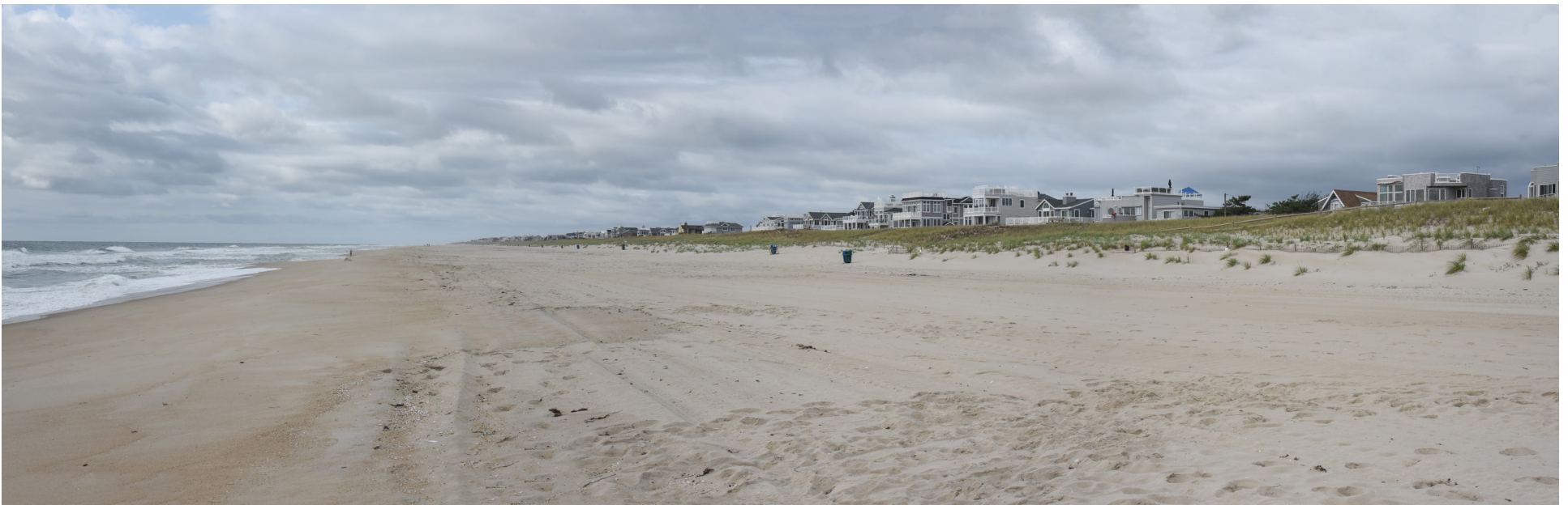
068 Long Beach Township (Spray Beach) - Public Beach, East Delaware Avenue SW