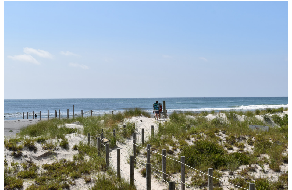
468 *Lower Township - Cape May National Wildlife Refuge, Beach Access NW