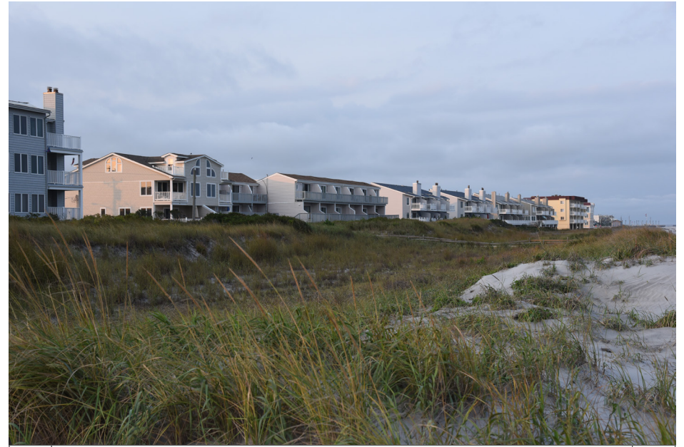
122 Brigantine - Beach Access, Brigantine Avenue at 3rd Street N