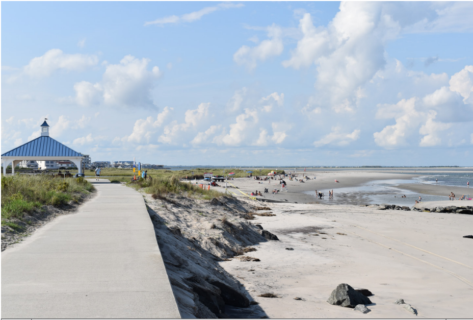
451 North Wildwood - Hereford Inlet Park N