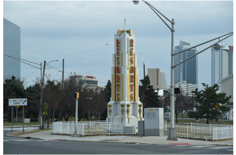
153 Atlantic City - Absecon Boulevard at North Carolina Avenue SE