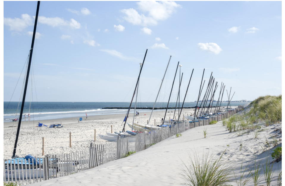
409 Stone Harbor - Stone Harbor Conservation Land SW