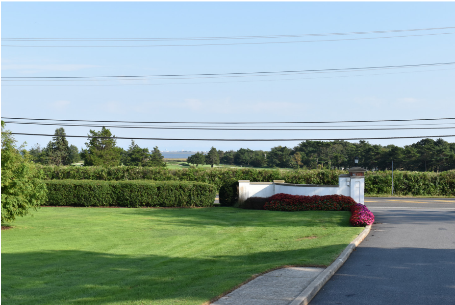
115 Galloway Township - Seaview Golf Course, from clubhouse E