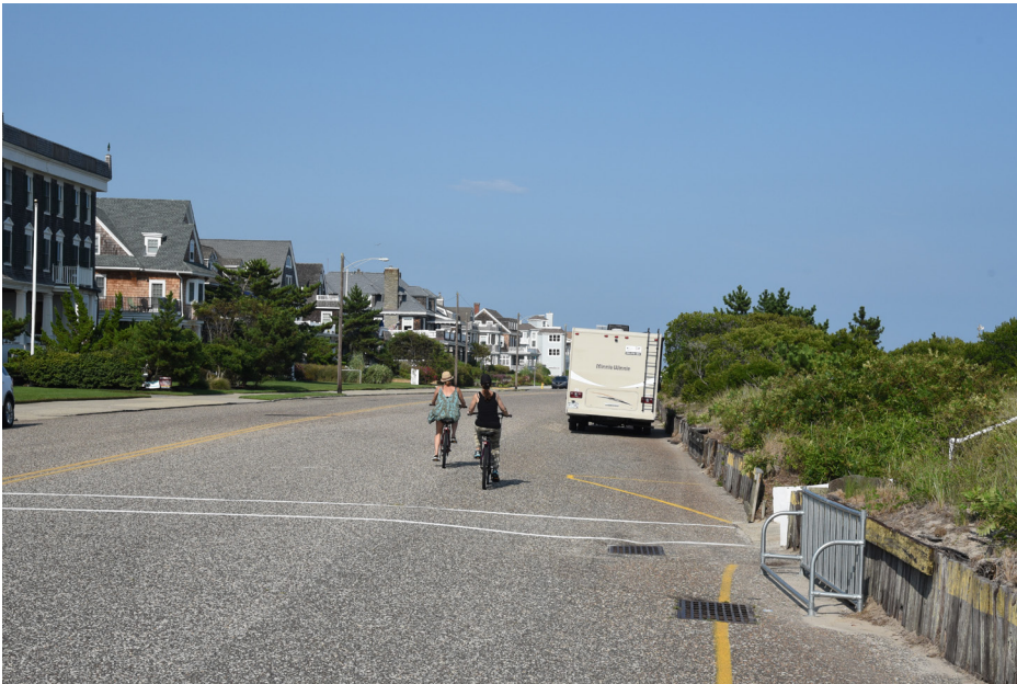
474 Cape May - Beach Avenue at Baltimore Avenue W