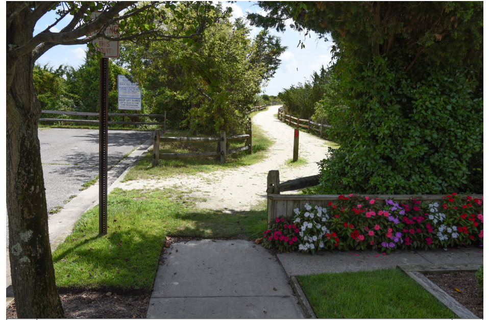
361 | Avalon - Public Beach Access, 37th Street | SE