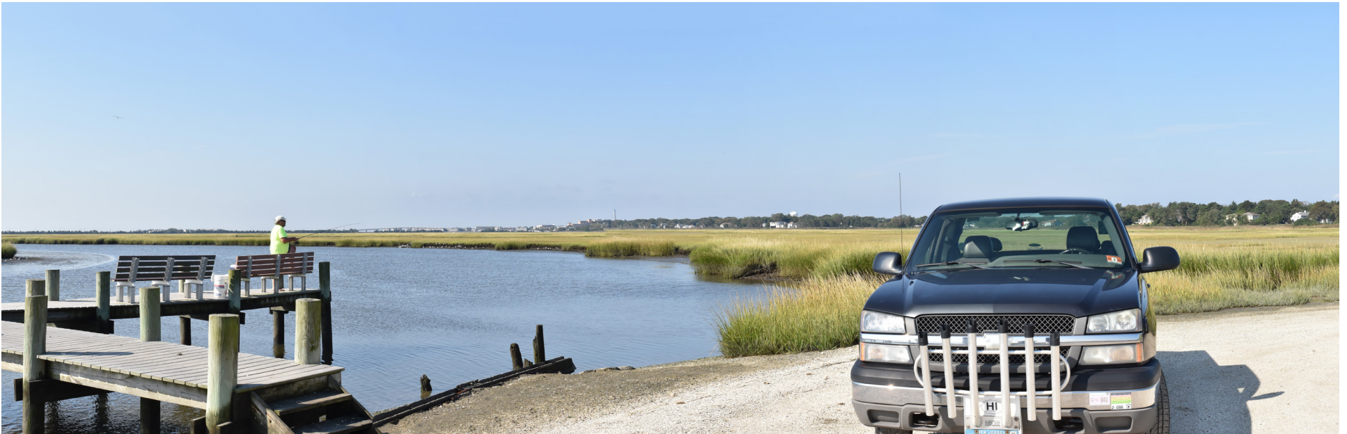
224 Linwood - Seaview Avenue Boat Ramp SW