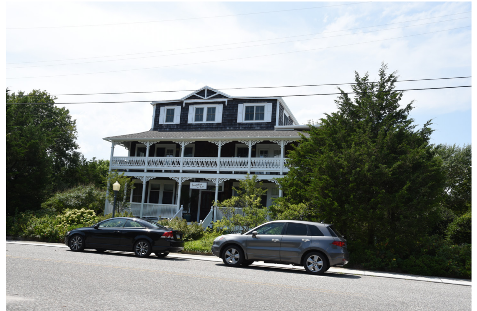
483 Cape May Point - Yale Avenue at Ocean Avenue, Sea Grove Historic District S