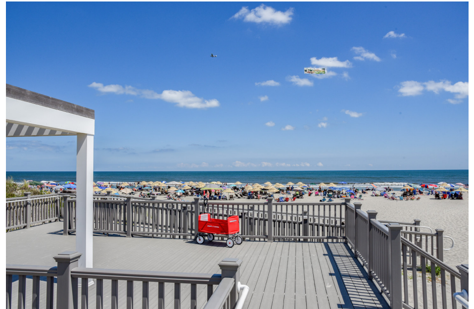
382 Avalon - Public Beach Access, 80th Street SE