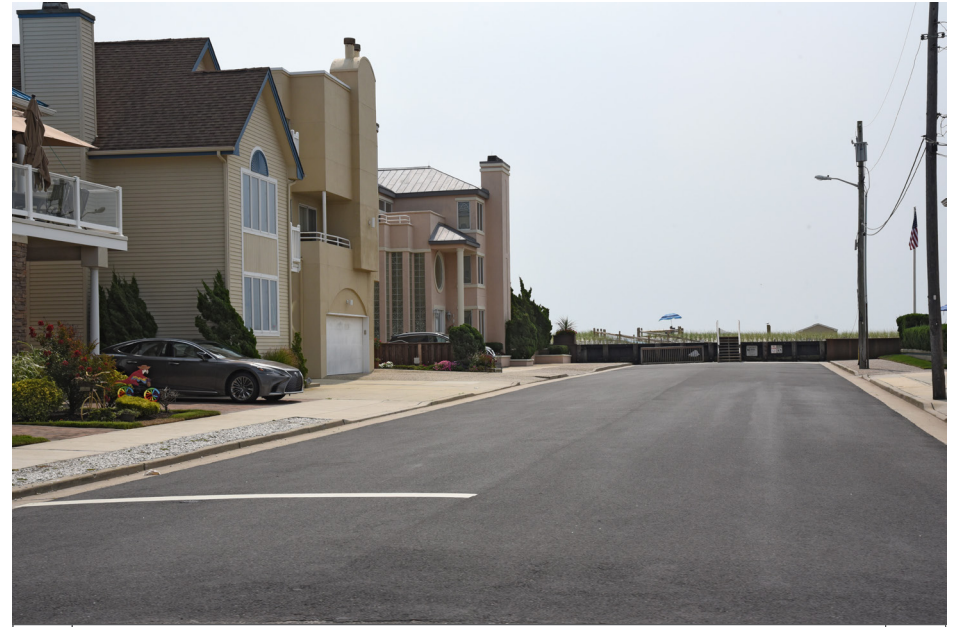
234 Longport - Atlantic Avenue at 31st Avenue SE