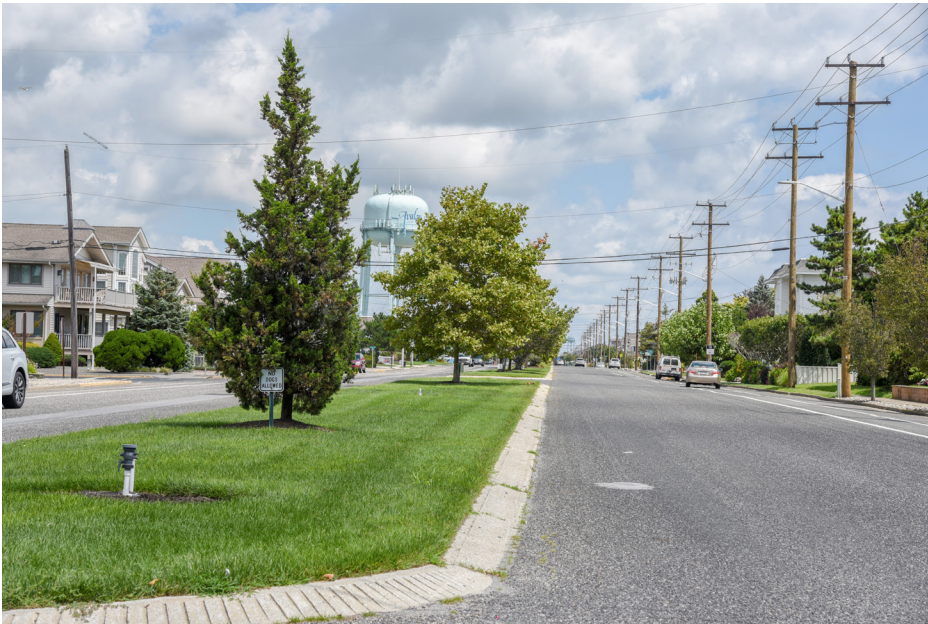
369 Avalon - Dune Drive at Bayberry Road NE