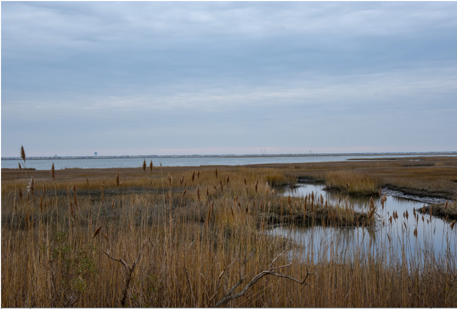
356 Dennis Township - Garden State Parkway, Historic Resource SE