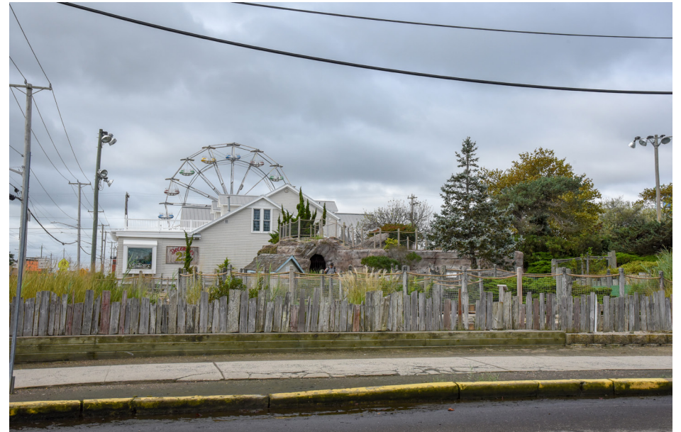
078 Beach Haven - Thundering Surf Waterpark, Taylor Avenue SW