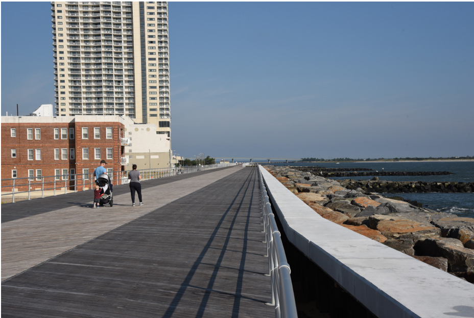
162 Atlantic City - Atlantic City Boardwalk at Pacific Avenue NW