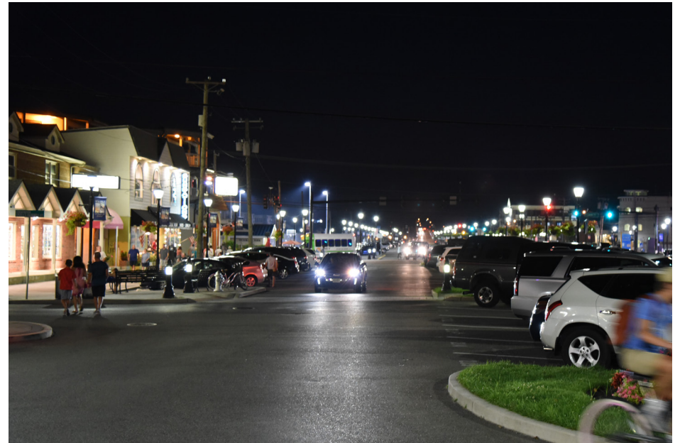
343 Sea Isle City - End of John F. Kennedy Boulevard NW