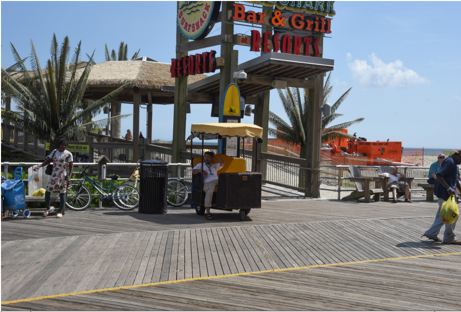
176 Atlantic City - Atlantic City Boardwalk S