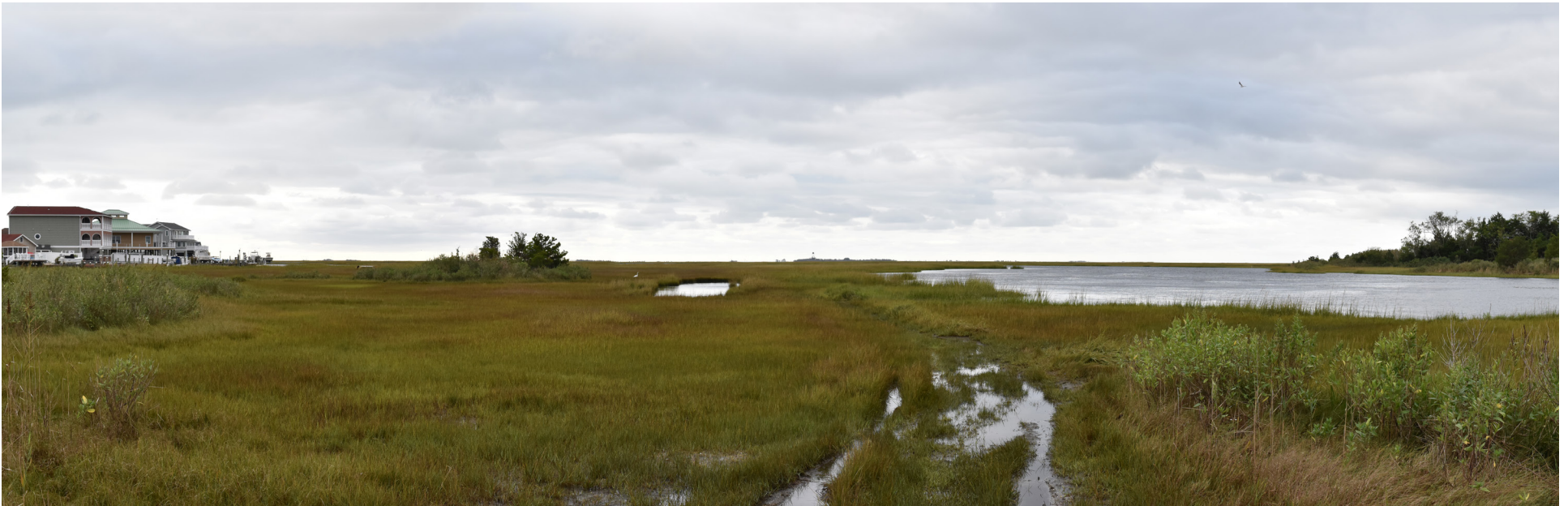
097 Little Egg Harbor Township - Radio Road Bridge, below Bridge S