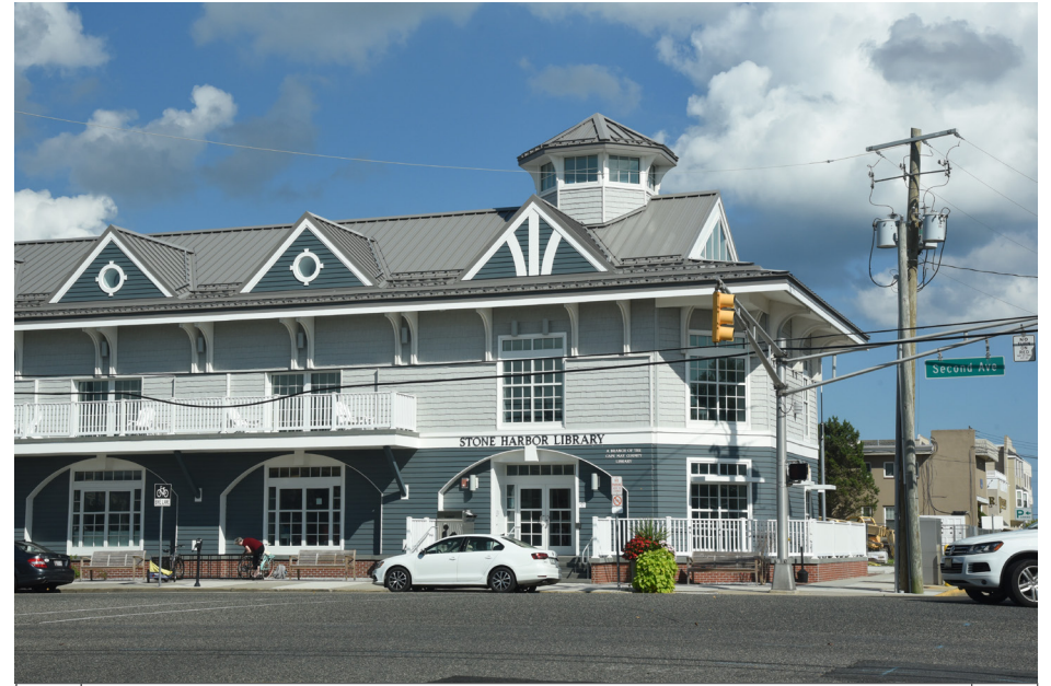
411 Stone Harbor - Stone Harbor Library, 2nd Avenue at 96th Street E