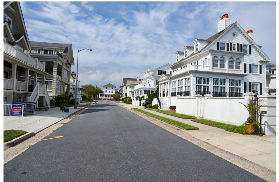
213 | Ventnor City - John Stafford Historic District, South Marion Avenue | N