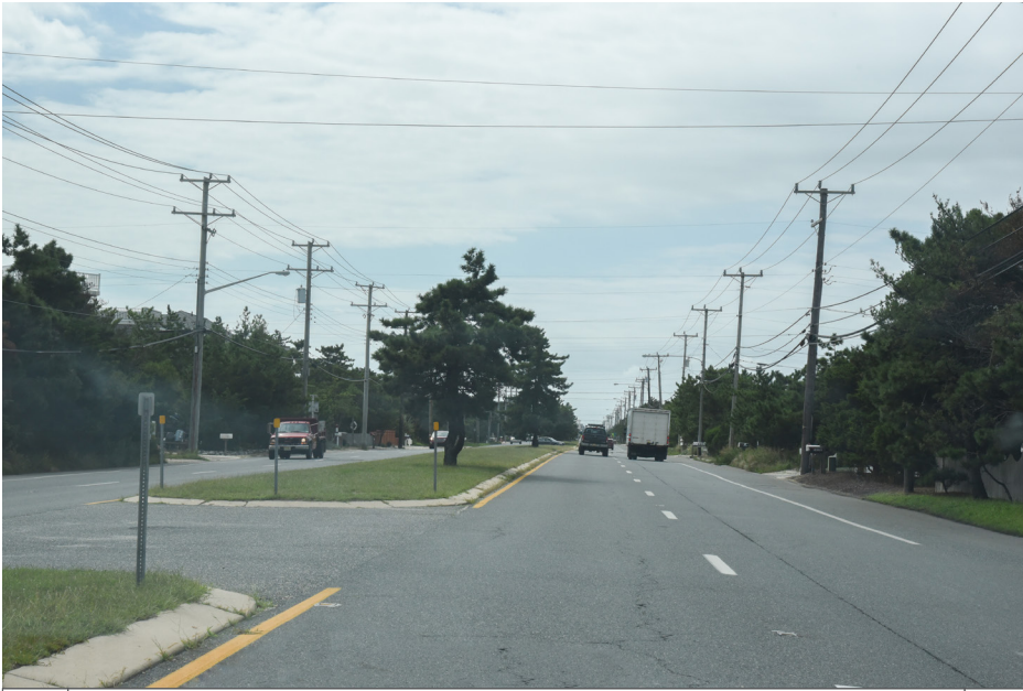
048 Long Beach Township (North Beach) - Long Beach Boulevard SW