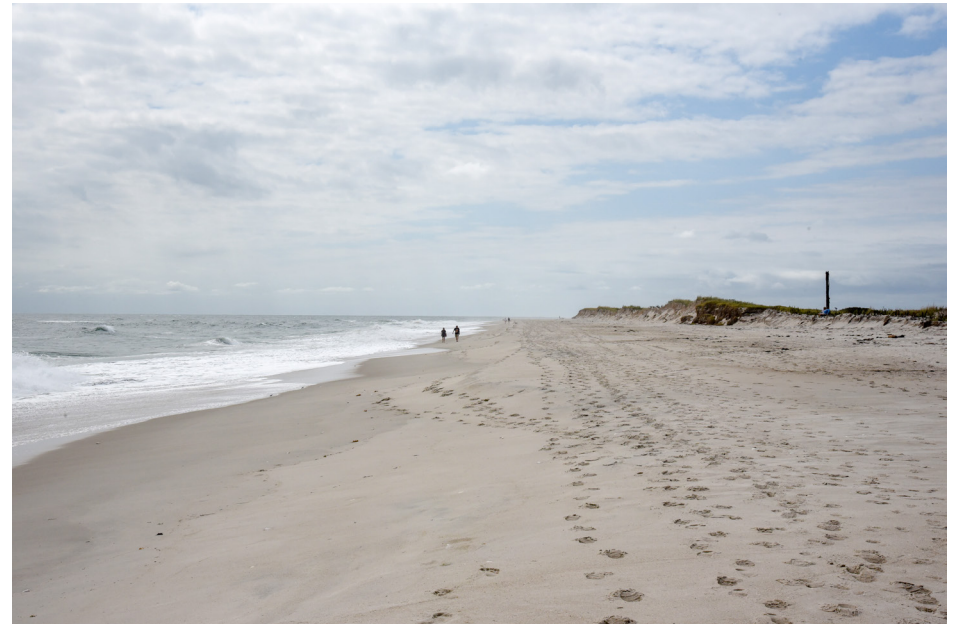
024 Barnegat Light - Public Beach, East 9th Street SW