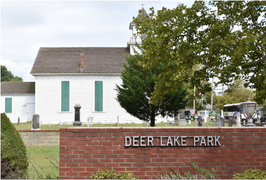
040 Stafford Township - Manahawkin Baptist Church, Historic Resource N