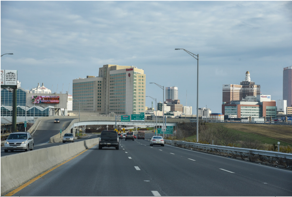
152 Atlantic City - Atlantic City Expressway E