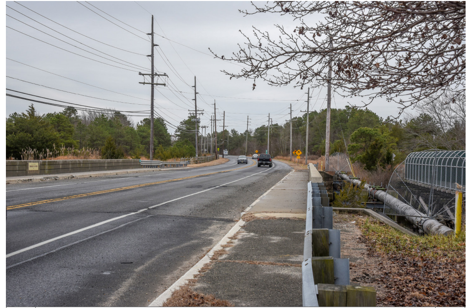
006 Lacey Township - Oyster Creek Route, Route 9 Bridge over Forked River S