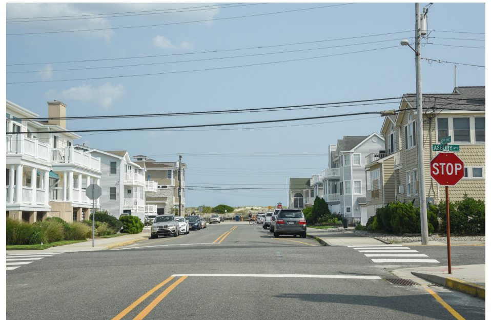
267 Ocean City - Ashbury Avenue at 42nd Street SE