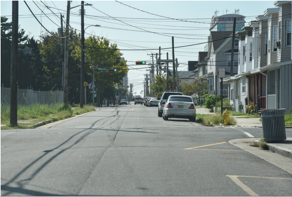
148 Atlantic City - New Jersey Avenue at Lexington Avenue SE