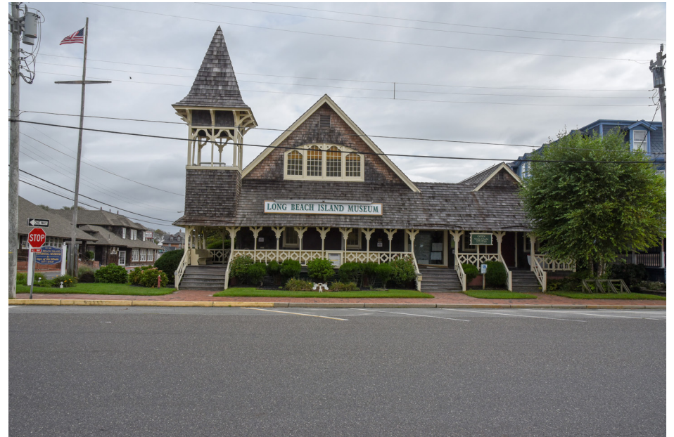
076 Beach Haven - Long Beach Island Museum, Engleside Avenue N