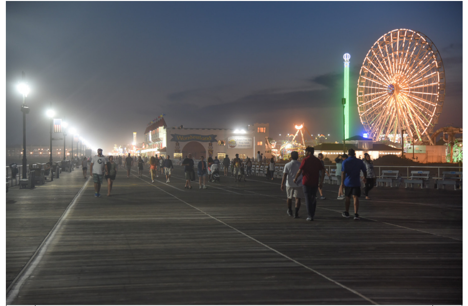
277 *Ocean City - Ocean City Boardwalk, 5th Street