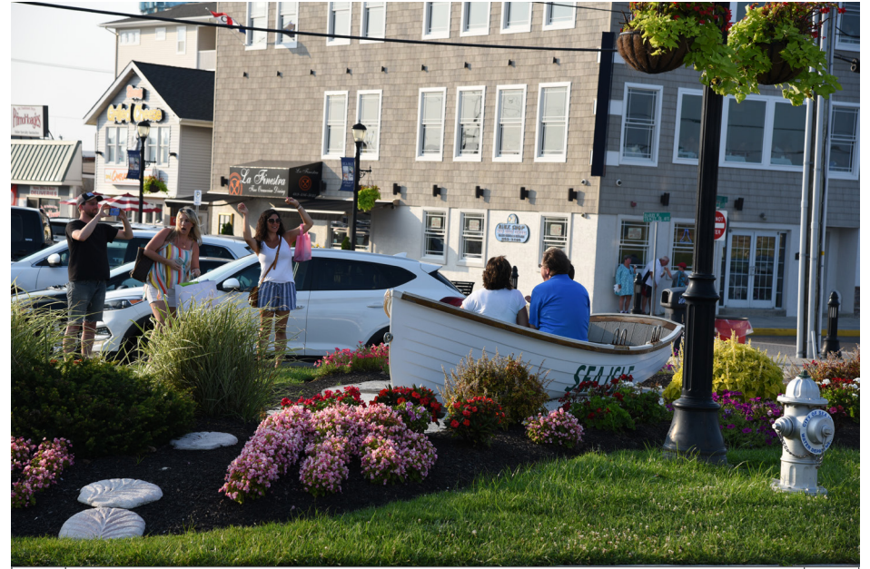
341 Sea Isle City - End of John F. Kennedy Boulevard N