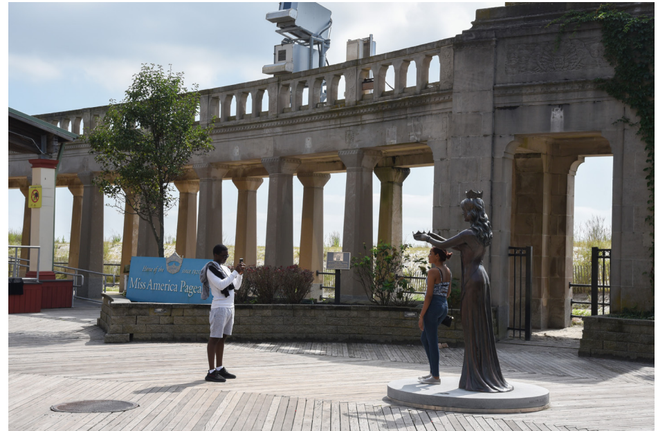
167 Atlantic City - Boardwalk Hall and Kennedy Plaza SE