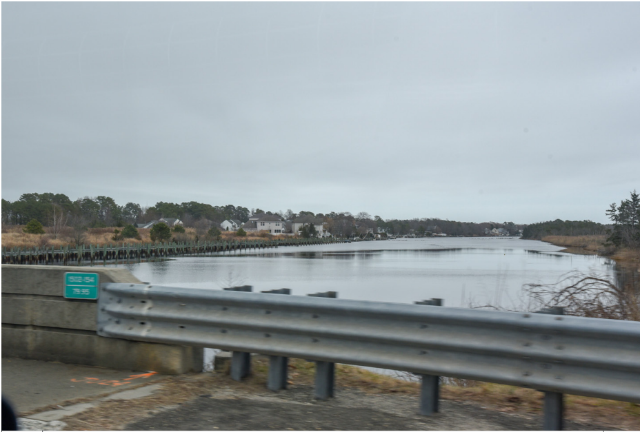
005 Lacey Township - Oyster Creek Route, Route 9 Bridge over Forked River NW