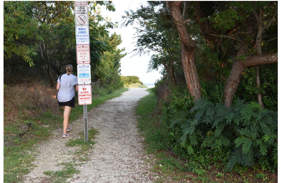
124 Brigantine - 34th Street Beach Access SE