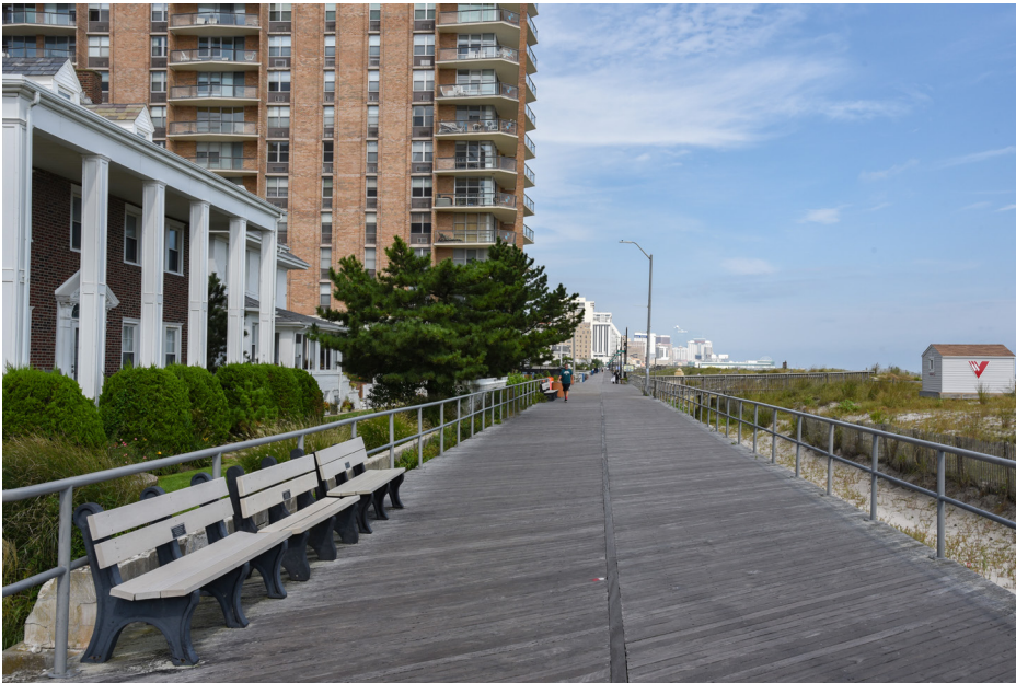
201 Ventnor City - Boardwalk, at South Marion Avenue NE