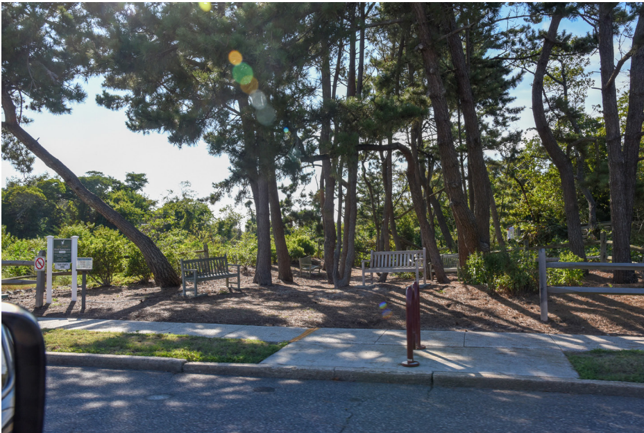
404 Stone Harbor - Stone Harbor Bird Sanctuary, 2nd Avenue at 114th Avenue NW