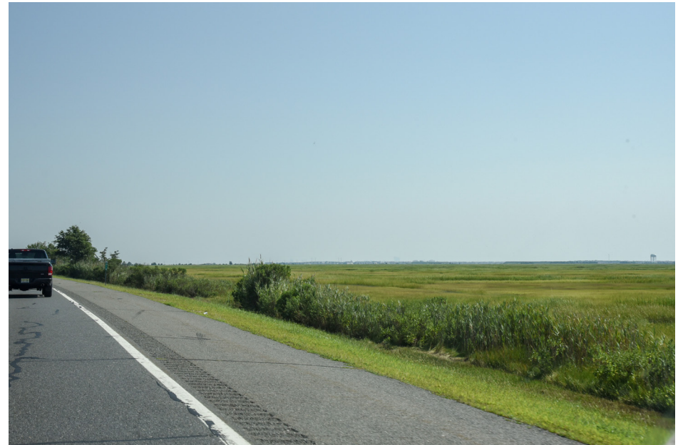
299 Upper Township - Garden State Parkway, Historic Resource E