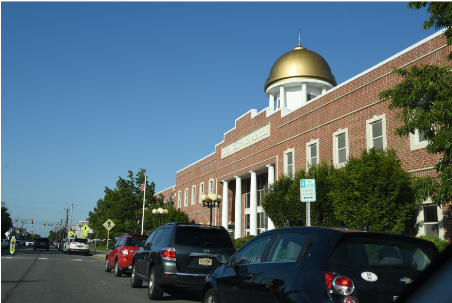
286 Ocean City - Ocean City High School, Atlantic Avenue E