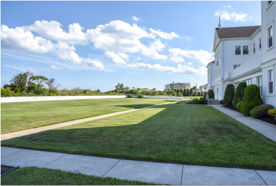
414 Stone Harbor - Villa Maria by the Sea, Historic Resource, 111th Street S