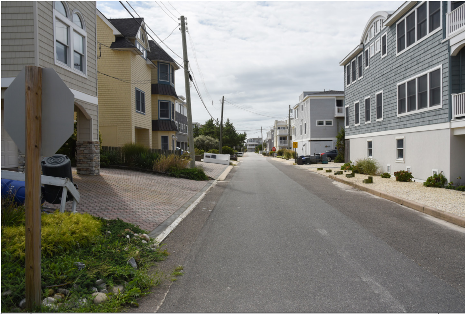
052 Surf City - Ocean Terrace at 16th Street SW