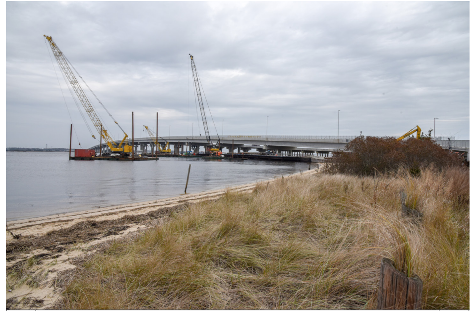
301 Upper Township - Harbor Road Beach, toward Garden State Parkway NE