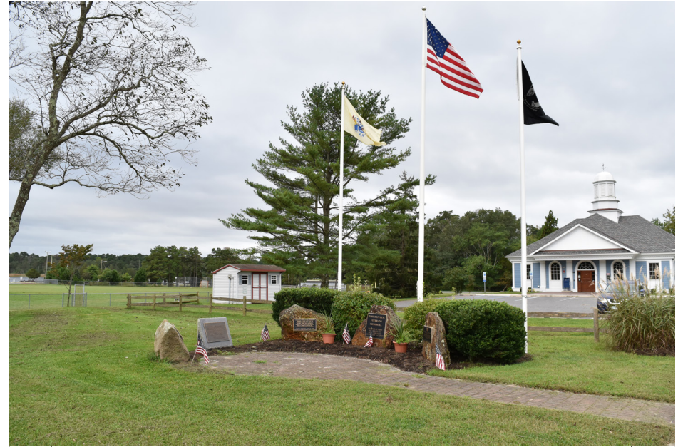
103 Port Republic - Port Republic Historic District, Veteran's Memorial SW