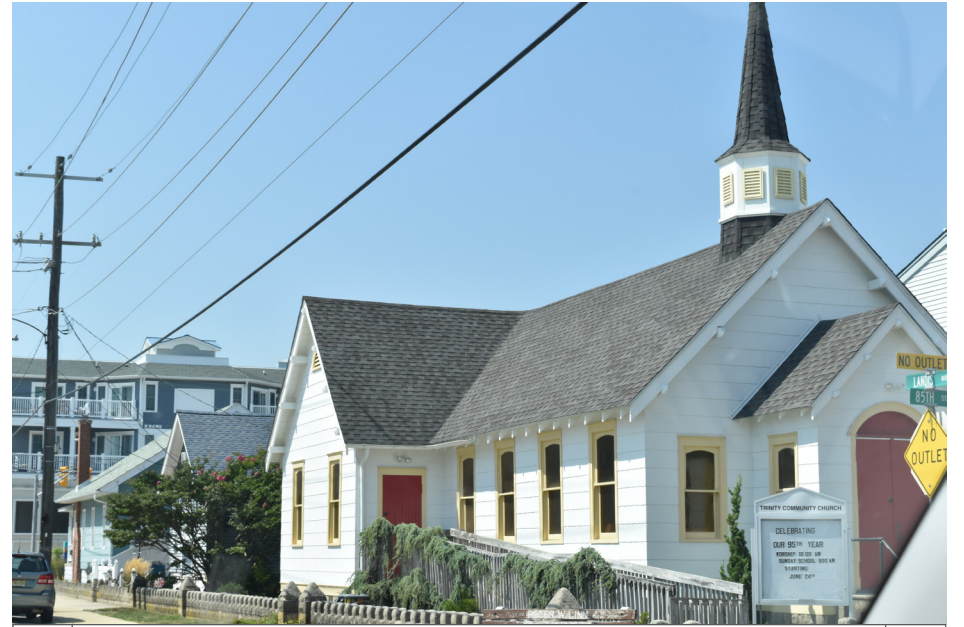
337 Sea Isle City - Trinity Lutheran Church, Historic Resource, Landis Avenue SW