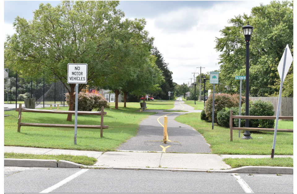
135 Pleasantville - Linwood Bike Path, Tilton Road SW