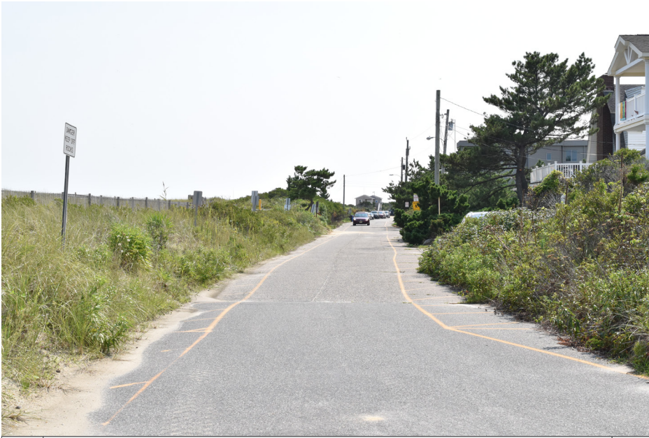
315 Upper Township - Neptune Drive at Seaview Drive SW