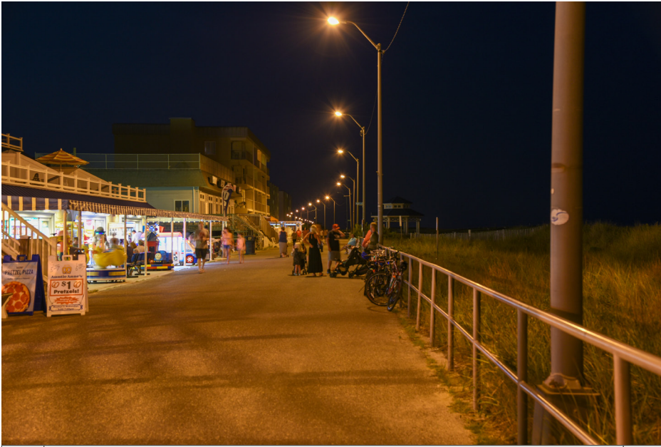
344 Sea Isle City - Sea Isle City Promenade NE