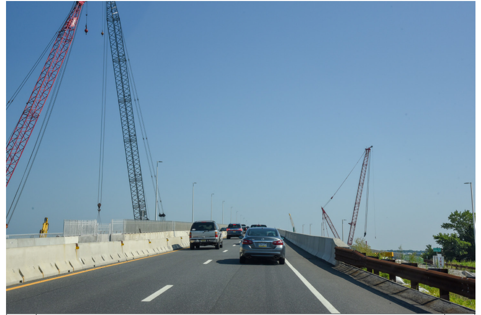
297 Upper Township - Garden State Parkway, Historic Resource N