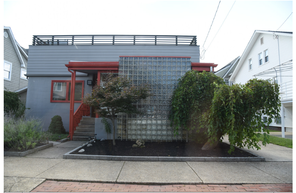
211 | Ventnor City - Tofani DiMuzio House, Historic Resource | SW