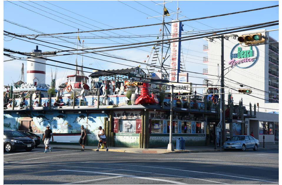
441 Wildwood - Schellengers Restaurant, Atlantic Avenue at Lincoln Avenue N