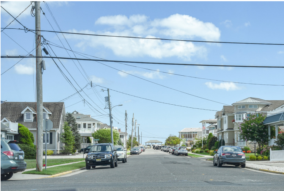
412 Stone Harbor - 2nd Avenue at 88th Street SE