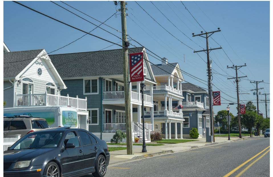
263 Somers Point - Bay Front Historic District, Bay Avenue N