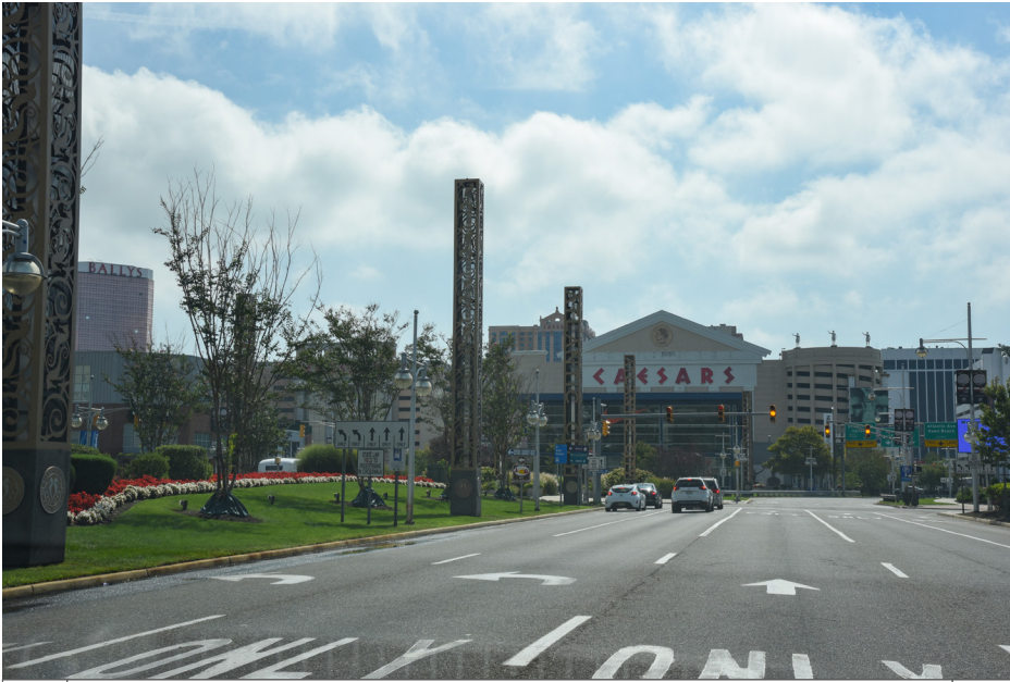
156 Atlantic City - Atlantic City Expressway Park SE