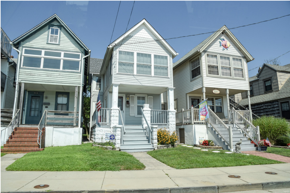
256 Somers Point - Bay Front Historic District, Bay Avenue NW