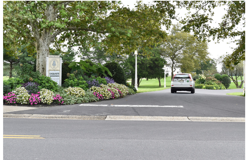
198 *Northfield - Atlantic City Country Club Entrance SE