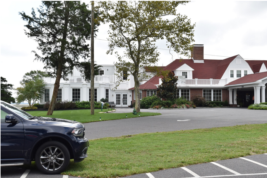
197 *Northfield - Atlantic City Country Club SE