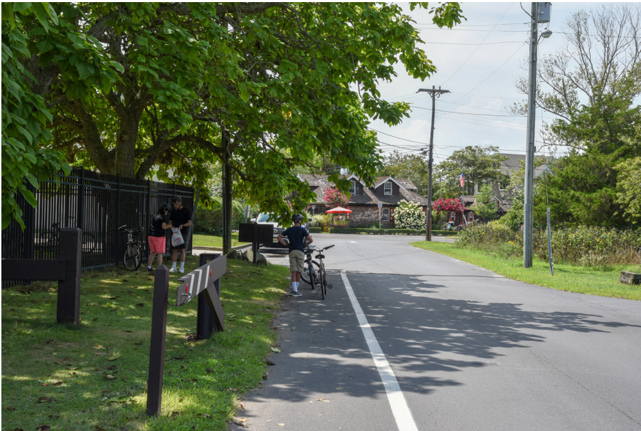
463 *Lower Township - Radio Tower Road, Cape May Point State Park NW