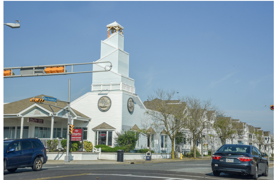
147 Atlantic City - New Hampshire Avenue at Melrose Avenue NW