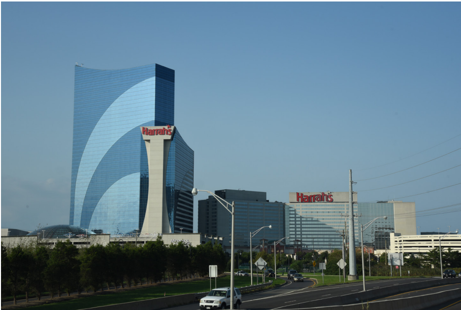
150 Atlantic City - Brigantine Boulevard, Harrah's Resort Atlantic City N