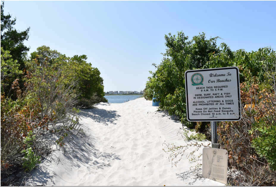
348 Sea Isle City - Beach Access, Townsend Inlet Park SW