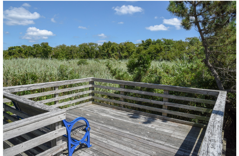
378 Avalon - Armacost Community Wildlife Observation Platform W