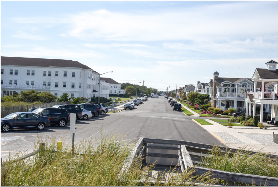
402 Stone Harbor - 111th Street, Beach Access, Villa Maria, Historic Resource NW