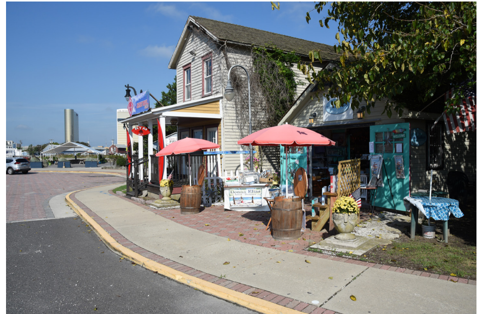
179 Atlantic City - Historic Gardeners Basin, Rhode Island Avenue W