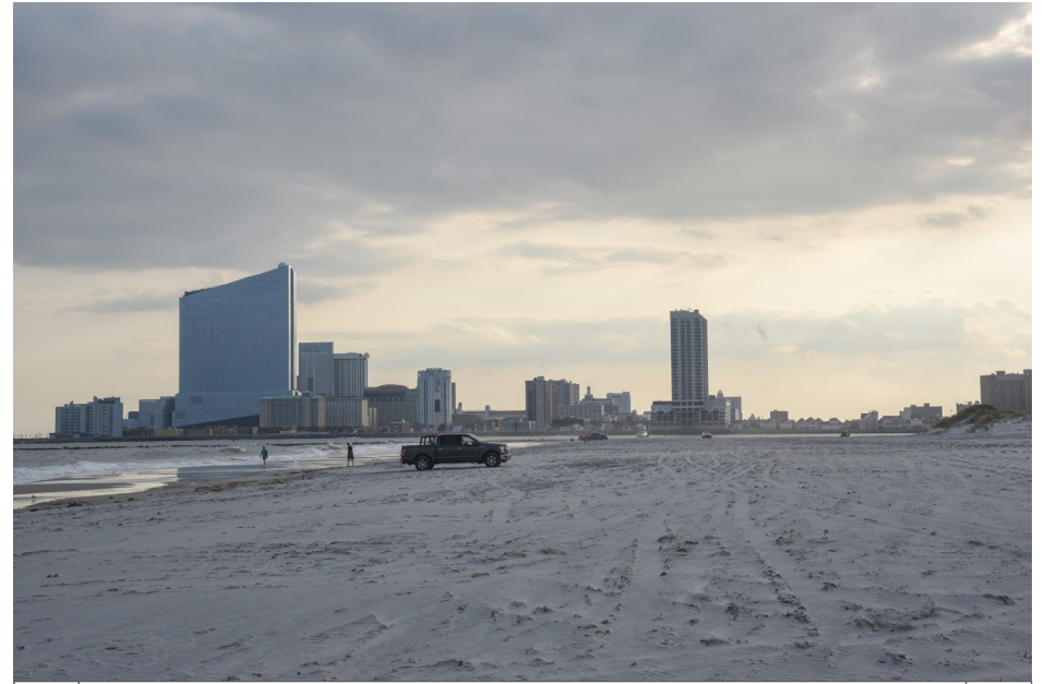
126 Brigantine - Beach, Ocean Drive South at Sandy Lane SW