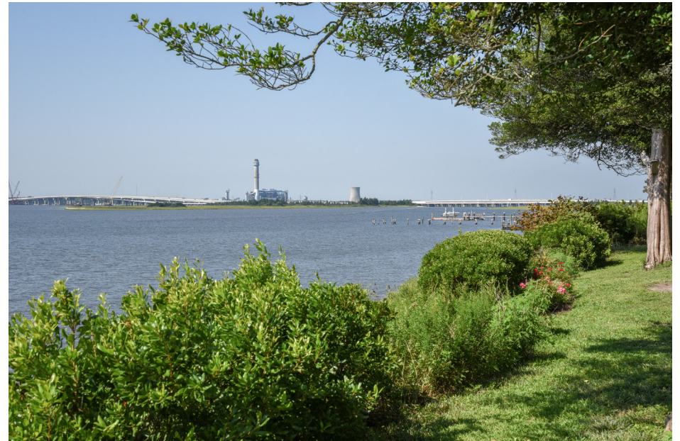
255 Somers Point - John F. Kennedy Park SW