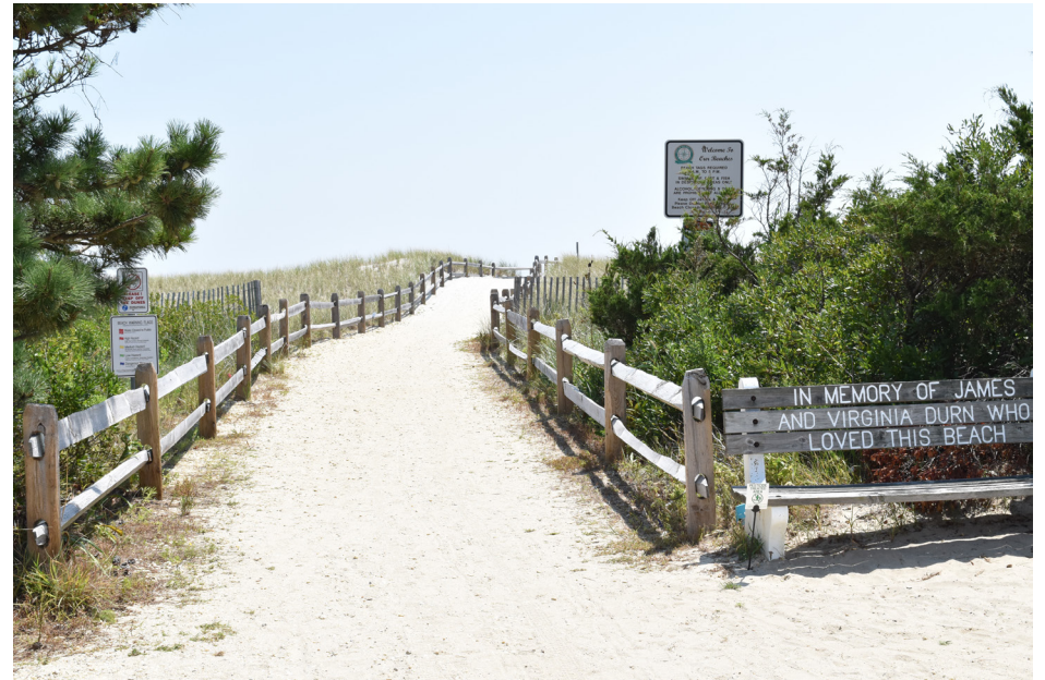
332 Sea Isle City - Public Beach Access, 89th Street E