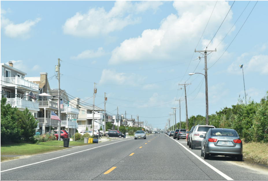
340 Sea Isle City - Landis Avenue NE