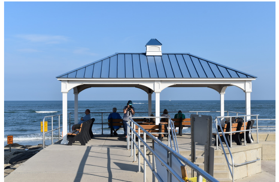
450 North Wildwood - John F. Kennedy Boulevard Pavilion