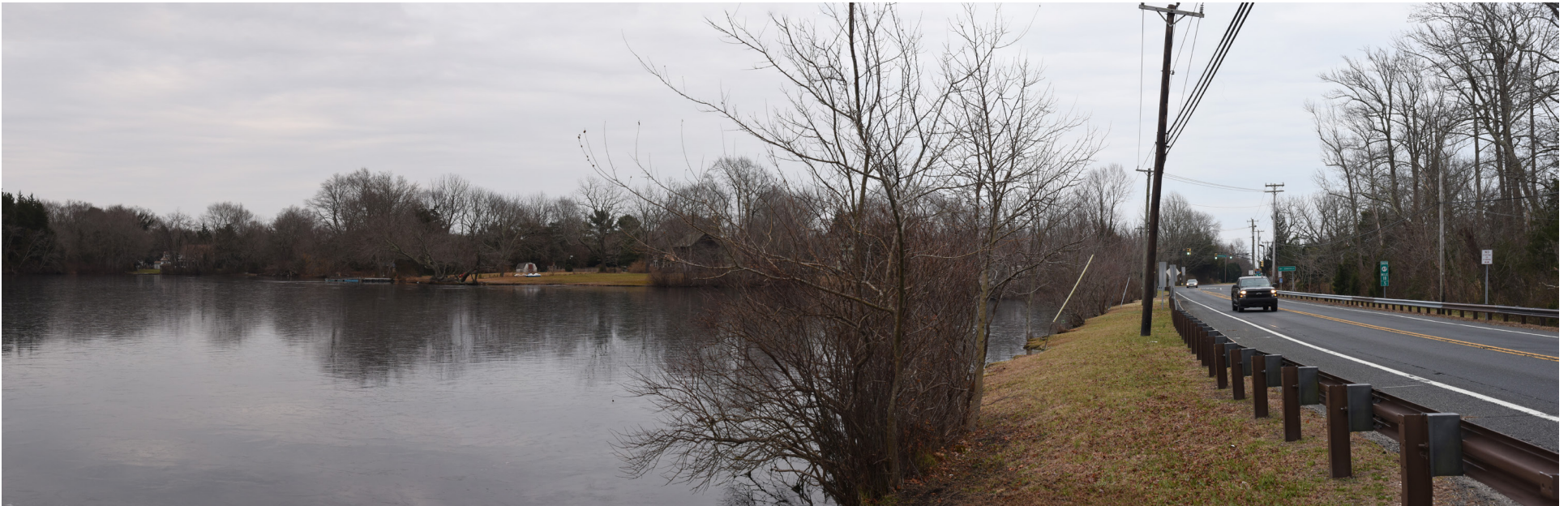
328 Dennis Township - Johnson Pond, Dennisville Historic District N