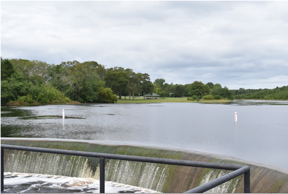
081 Tuckerton - Pahotcang Lake, Route 9