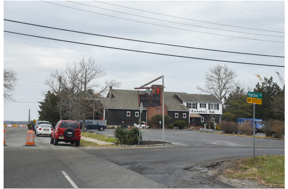
305 Upper Township - Tuckahoe Inn, Historic Resource, Harbor Road NE