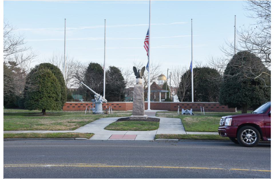
293 Ocean City - War Memorial Park, Historic Resource, Wesley Avenue SW