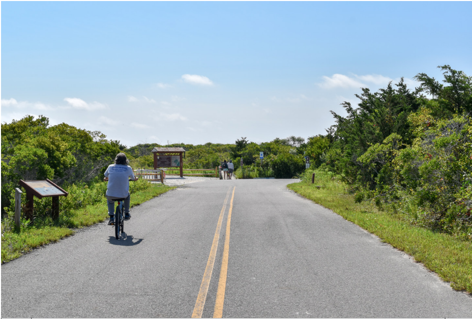
465 *Lower Township - Cape May National Wildlife Refuge SE