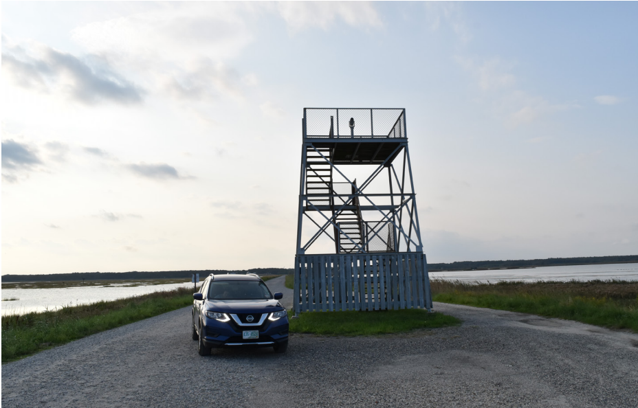
109 *Galloway Township - Edwin B. Forsythe National Wildlife Refuge, Wildlife Drive NW