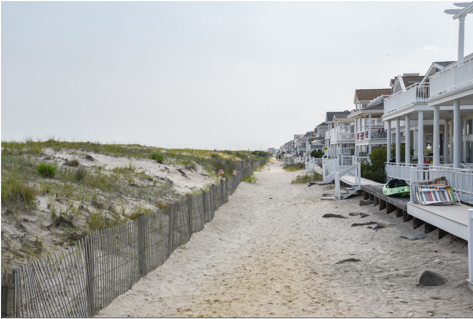
268 Ocean City - Beach Access, 42nd Street SW