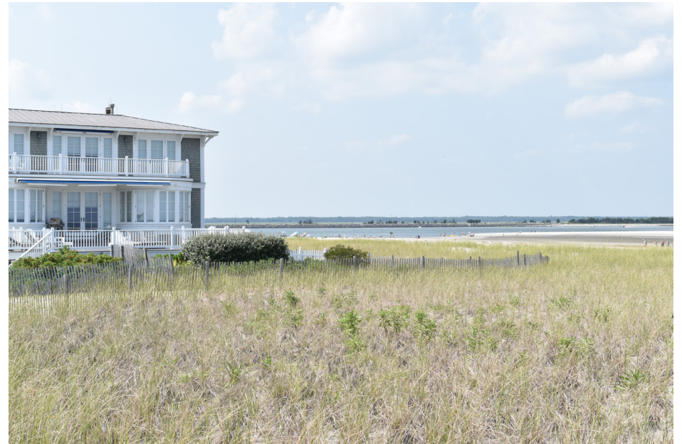
314 Upper Township - Beach Access, Seaview Drive toward Bay Avenue N