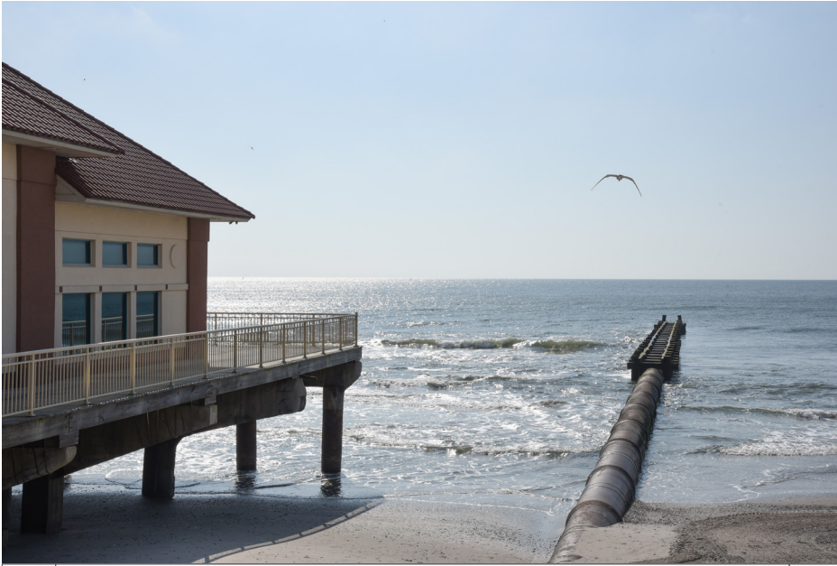
188 Atlantic City - Beach west of Atlantic City Garden Pier SW