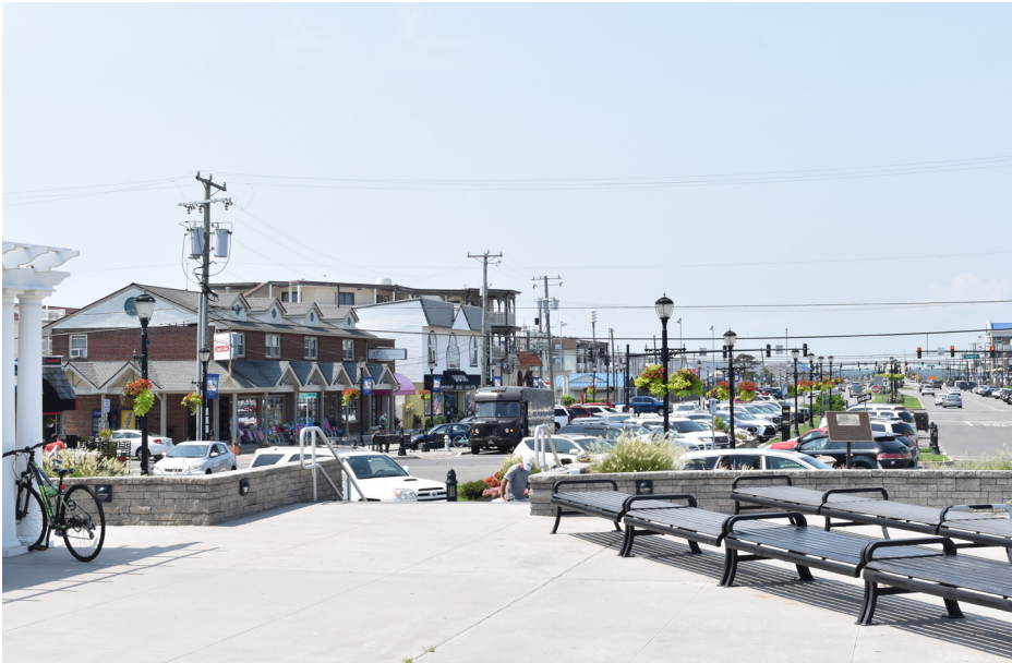
352 *Sea Isle City - Sea Isle City Promenade, John F. Kennedy Boulevard W