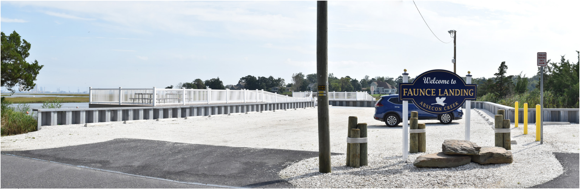
129 *Absecon - Faunce Landing, Public Boat Launch, Faunce Landing Road S