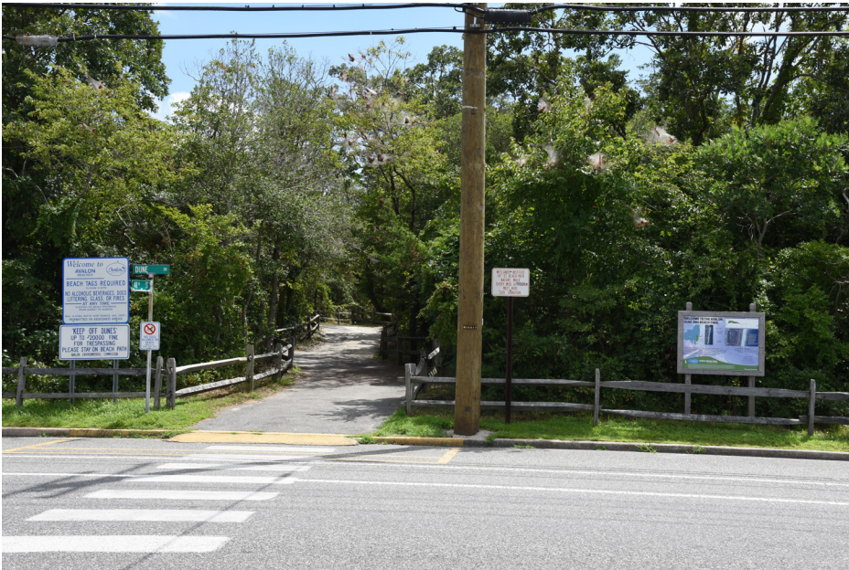
362 | Avalon - 48th Street Trail Entrance, Dune Drive | SE