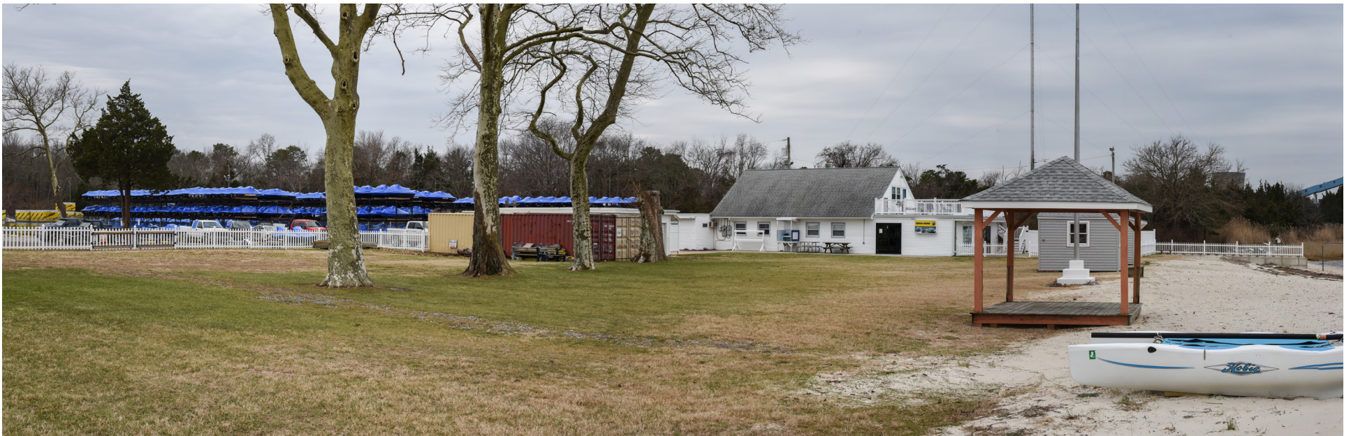
306 Upper Township - North Shore Road, toward Mad Beach Jet Ski Rental W