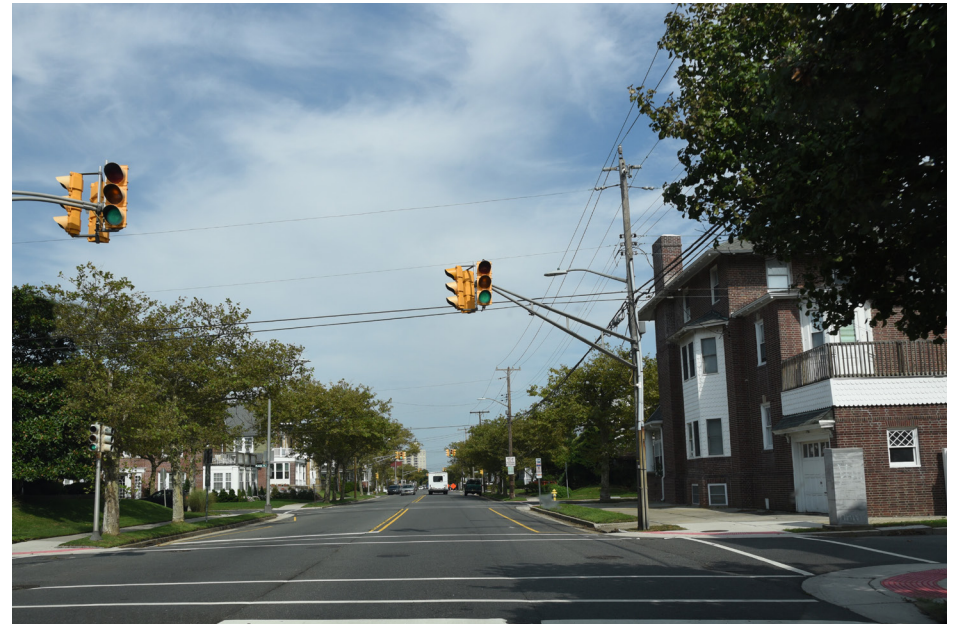
202 Ventnor City - Saint Leonard's Tract Historic District NE