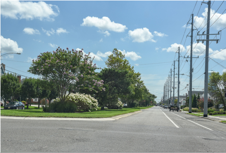
410 Stone Harbor - 2nd Avenue at 90th Street SW