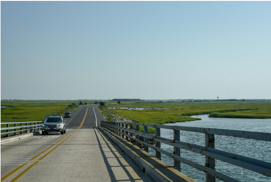
393 Middle Township - Grassy Sound Bridge, Historic Resource NE