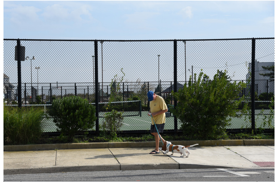
204 Ventnor City - Suffolk Avenue Park, at Atlantic Ave SE