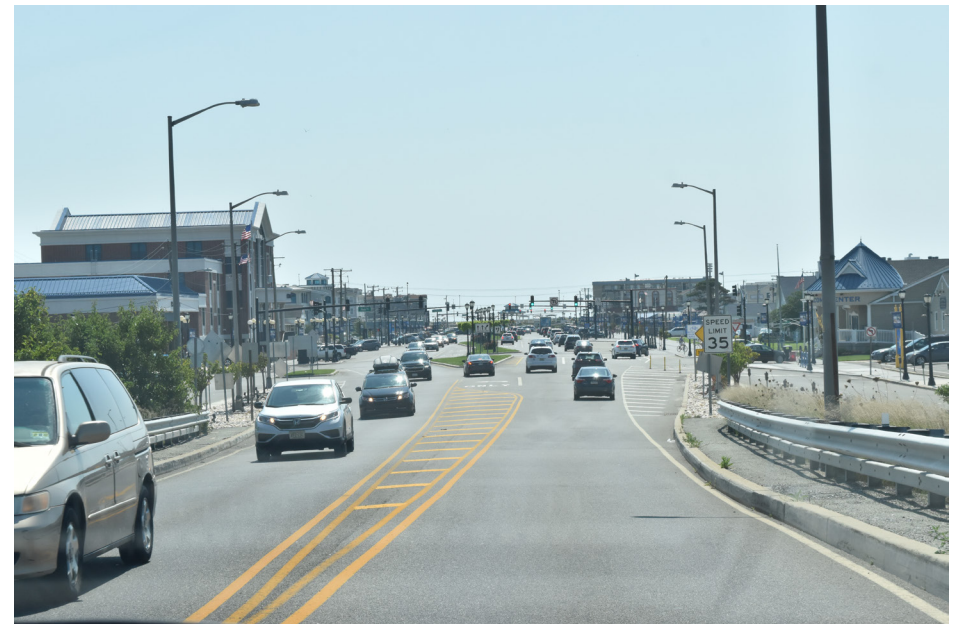
355 Sea Isle City - John F. Kennedy Boulevard entering Sea Isle City SE