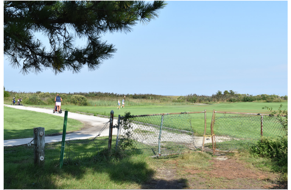
114 Galloway Township - Seaview Golf Course E