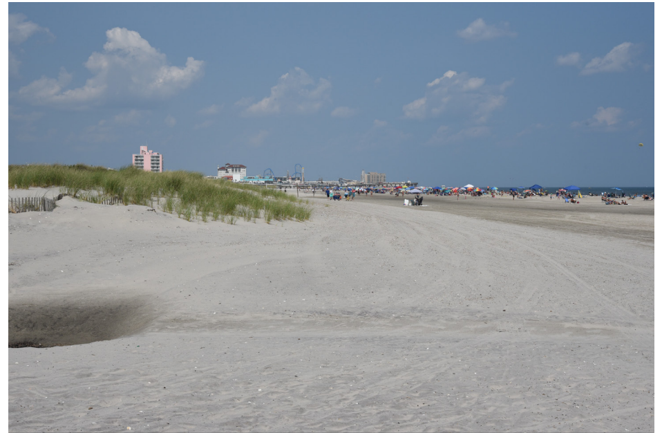
275 Ocean City - Public Beach, 20th Street NE