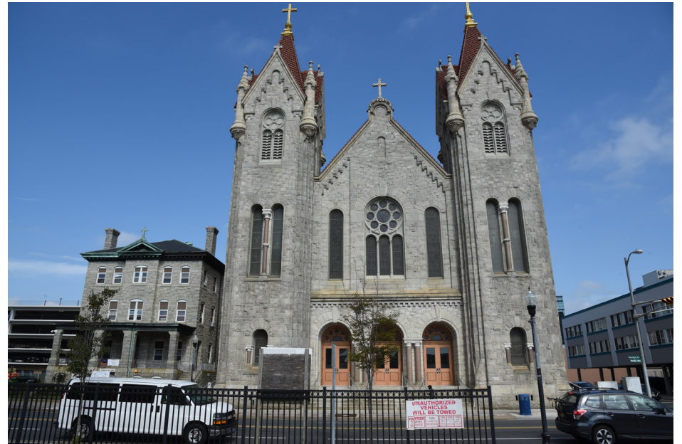
191 Atlantic City - St. Nicholas of Tolentine Church, Historic Resource NW