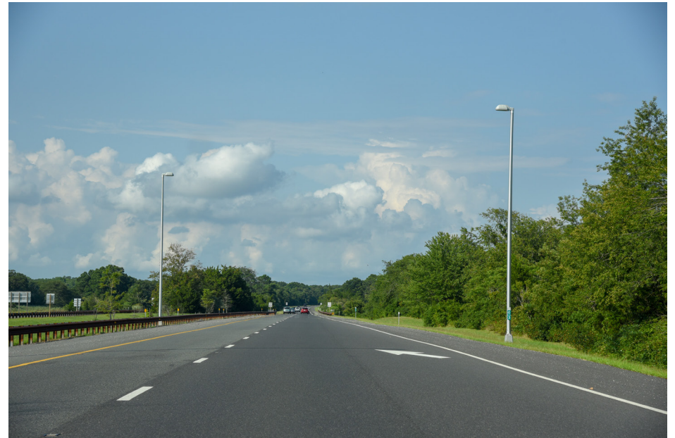
460 Lower Township - Garden State Parkway, Historic Resource NE