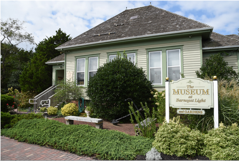
025 Barnegat Light - Museum at Barnegat Light, Central Ave W