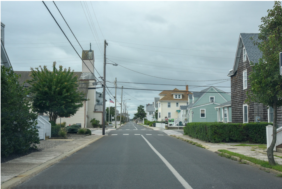
071 Beach Haven - Beach Haven Historic District, North Beach Avenue NE