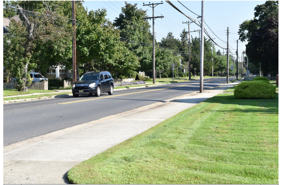
223 Linwood - Linwood Historic District, Shore Road N