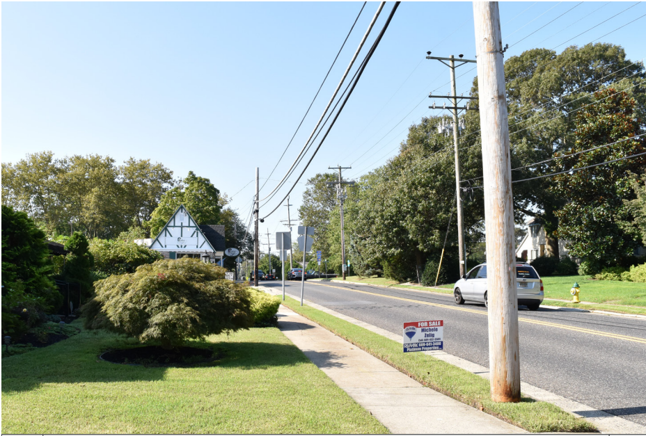
222 Linwood - Linwood Historic District, Shore Road SW