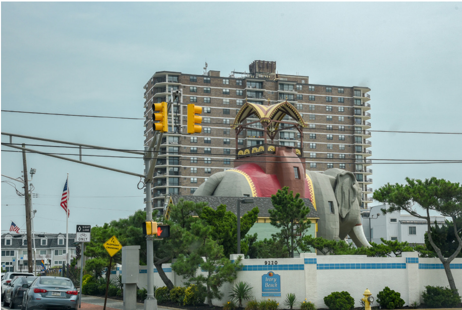
231 *Margate City - Lucy the Elephant, Historic Resource W