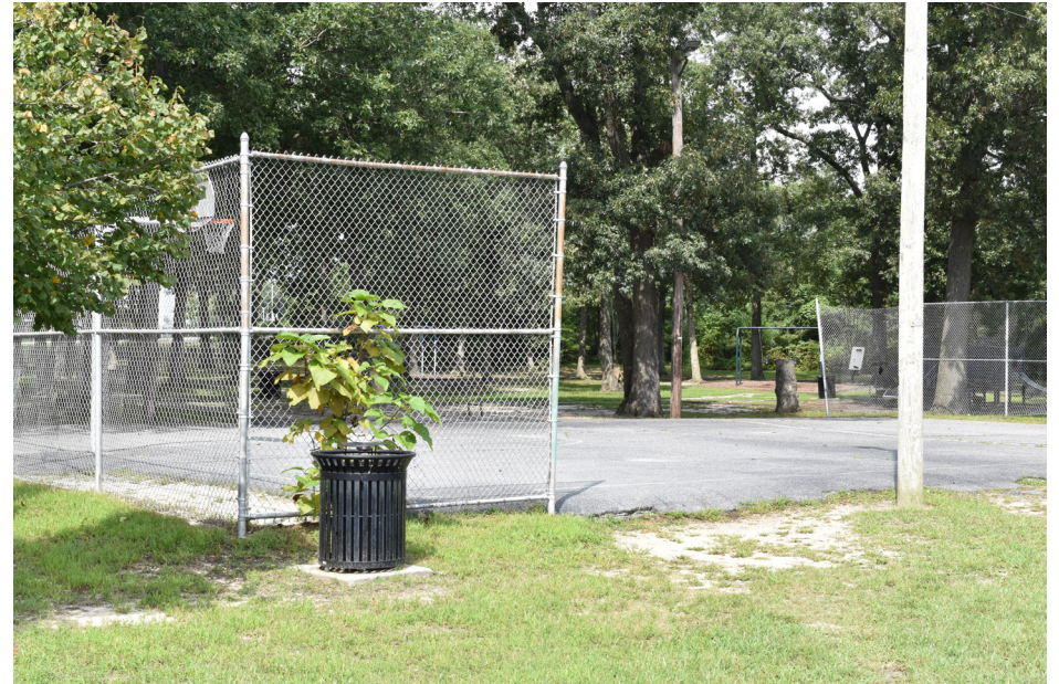
138 Pleasantville - Woodland Avenue Playground N