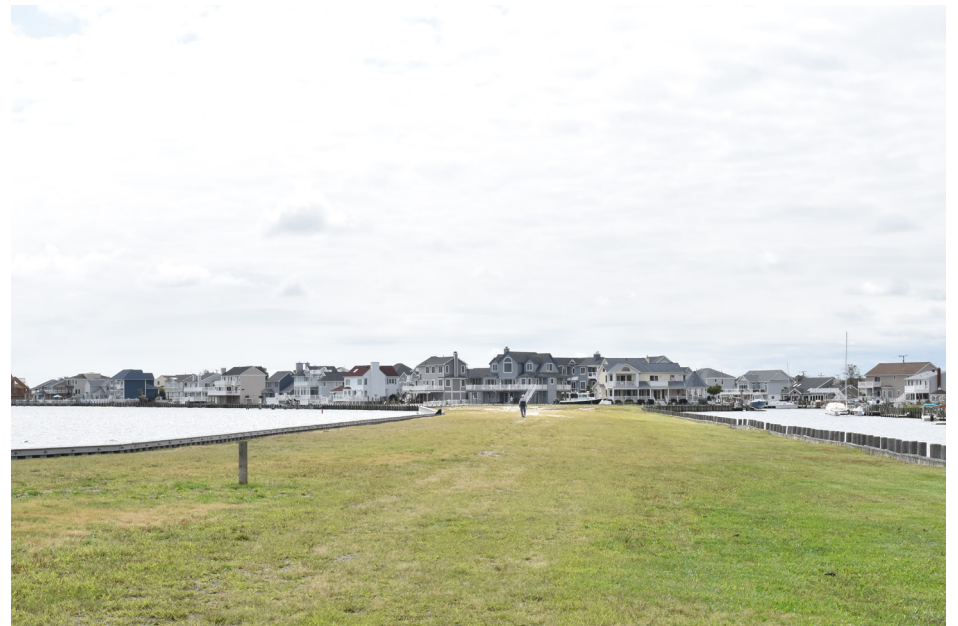
020 Ocean Township - Tuscarora Avenue Park SW