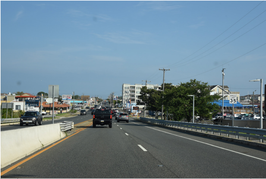
425 Wildwood - Entering Wildwood, Rio Grande Avenue SE