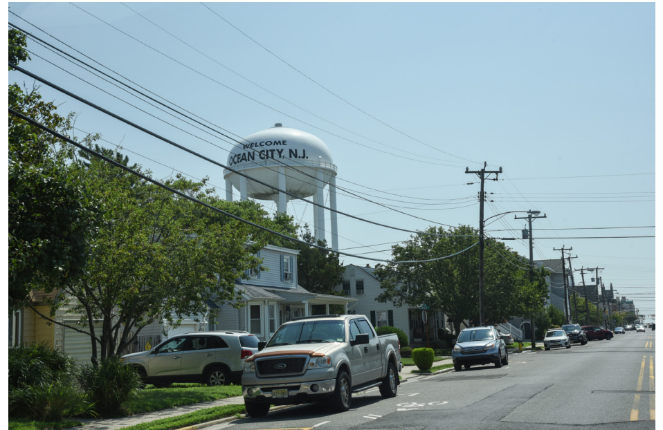
287 Ocean City - 8th Street E