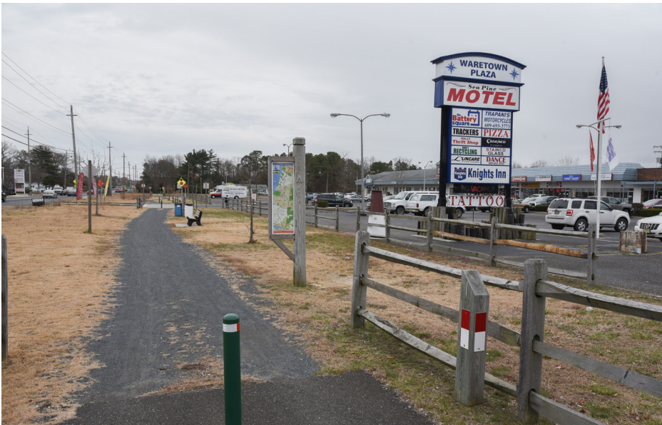
019 Ocean Township - Proposed Underground Cable Route to Oyster Creek, Waretown Plaza S