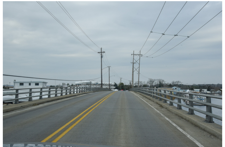
251 Egg Harbor Township - Mays Landing Road Bridge W