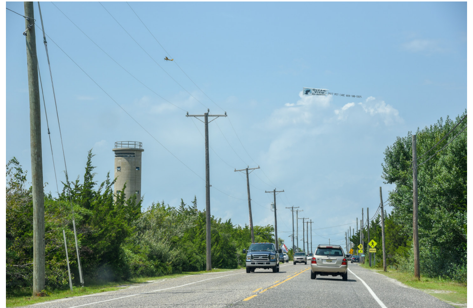
471 Lower Township - WWII Lookout Tower, Route 606, Historic Resource W