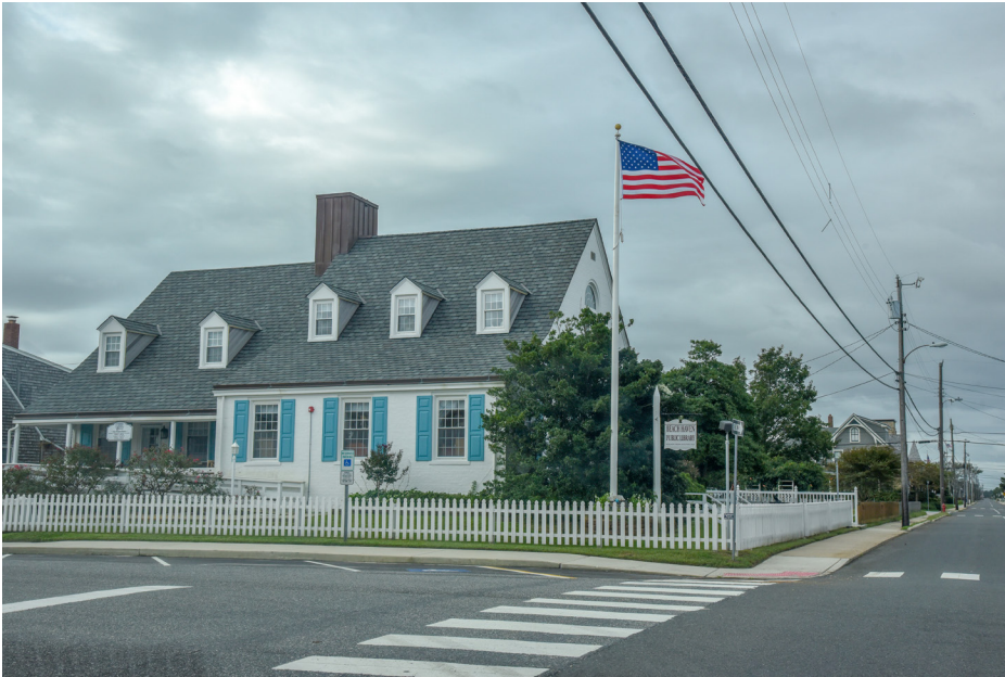
073 Beach Haven - Beach Haven Public Library, Beach Haven Historic District S