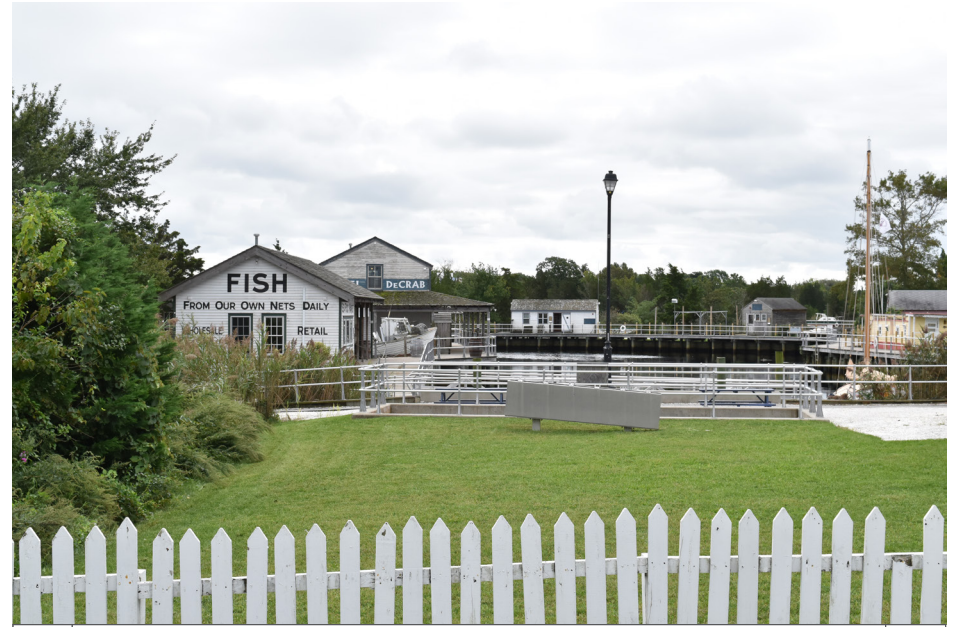
082 Tuckerton - Tuckerton Historic District, Historic Resource, Route 9