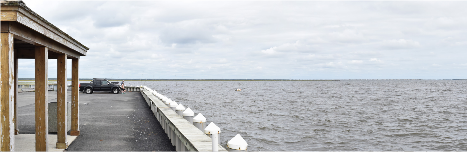
064 Eagleswood Township - Dock Road Pavilion, Edwin B. Forsythe Conservation Area N