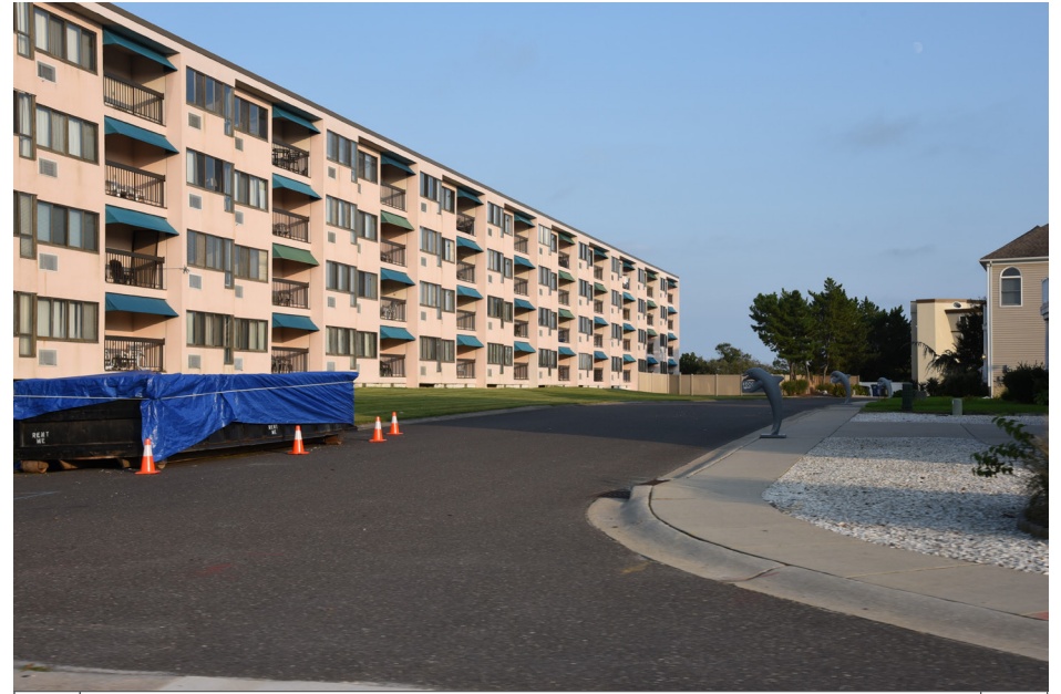
118 Brigantine - Brigantine Avenue at Dolphin Drive E