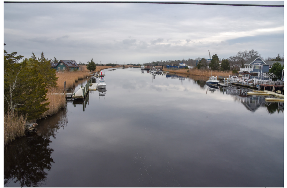
308 Upper Township - Tuckahoe Historic District, Route 50 Bridge W