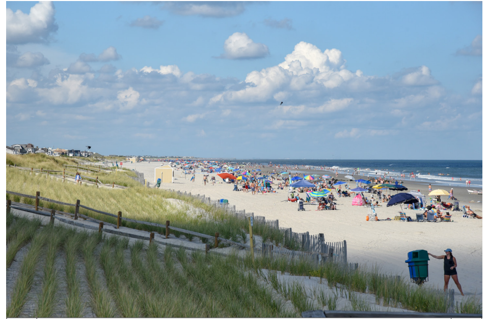
403 Stone Harbor - 111th Street, Public Beach Access NW