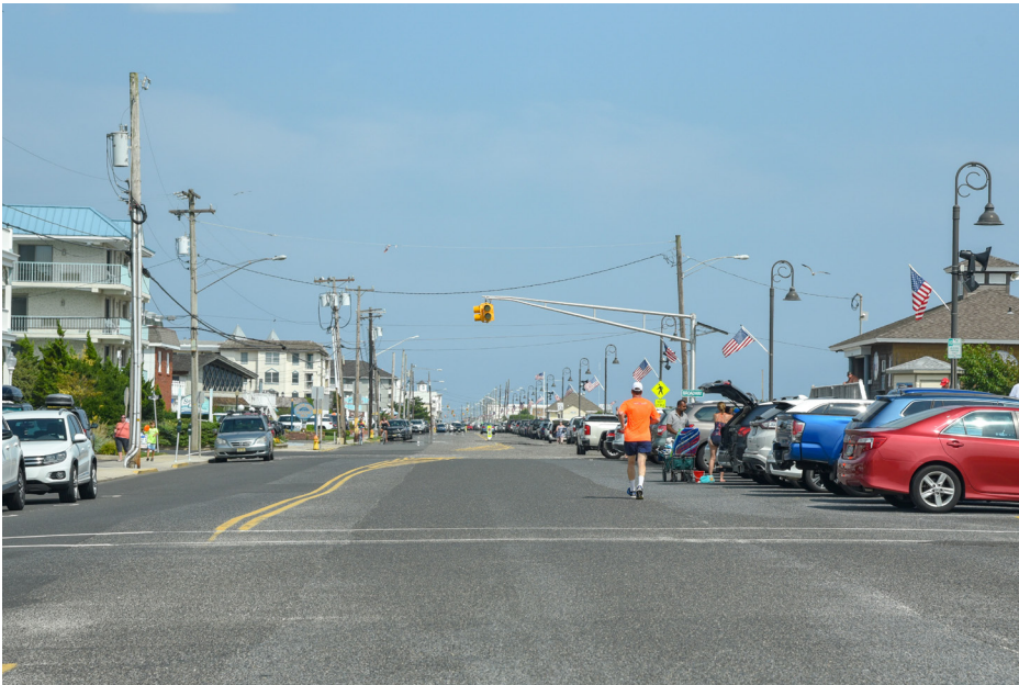
478 Cape May - Beach Avenue at 1st Avenue E