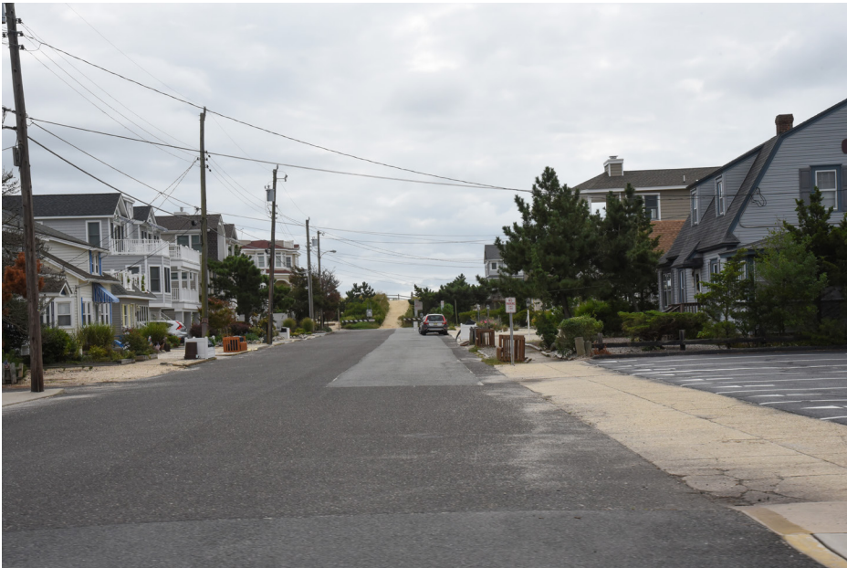
058 Surf City - Long Beach Boulevard at 14th Street SW