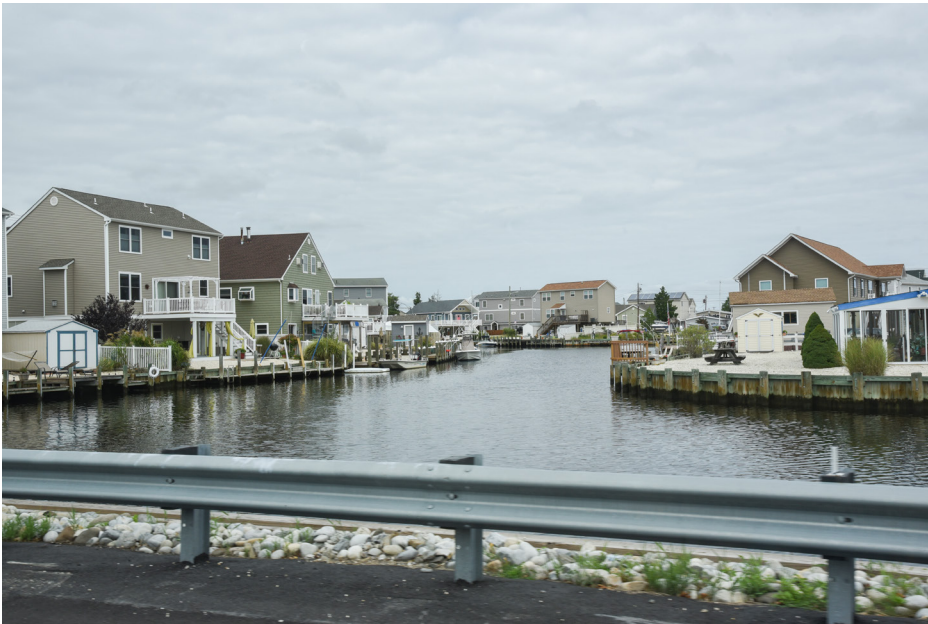
046 Stafford Township - Mill Creek Road N