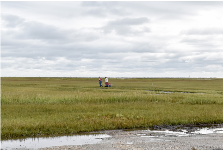
090 Little Egg Harbor Township - Great Bay Boulevard E