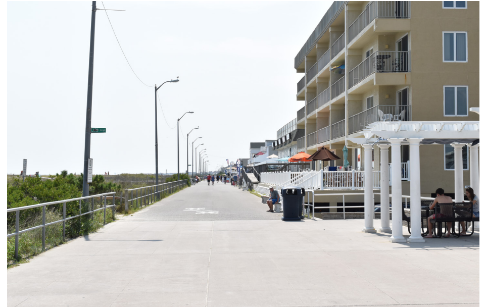
353 *Sea Isle City - Sea Isle City Promenade SW