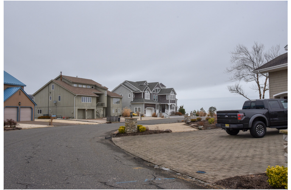
002 Lacey Township - Oyster Creek Route, End of Orlando Drive W