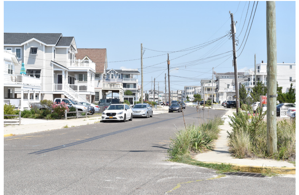
335 Northfield - Pleasure Avenue at 89th Street N