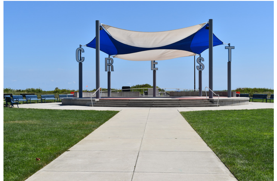
420 Wildwood Crest - Centennial Park, Ocean Avenue SE