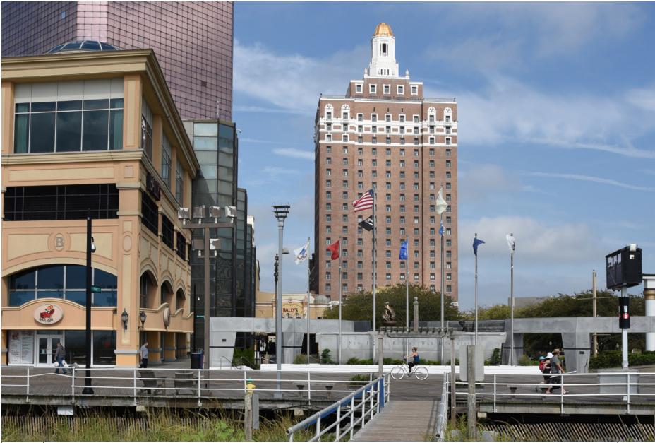
172 *Atlantic City - New Jersey Korean War Memorial NW