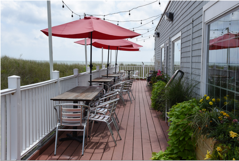
375 Avalon - Ice Cream Store on Dune off of Boardwalk SE