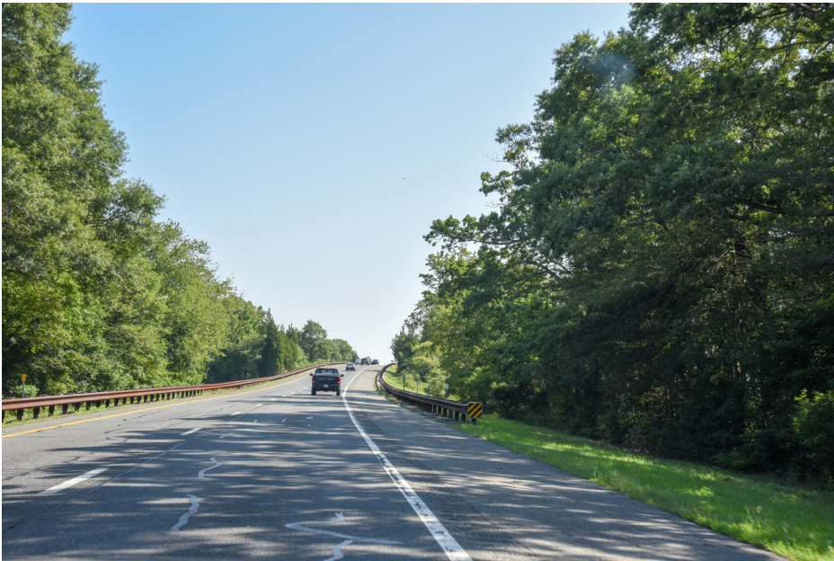
298 Upper Township - Garden State Parkway, Historic Resource NE