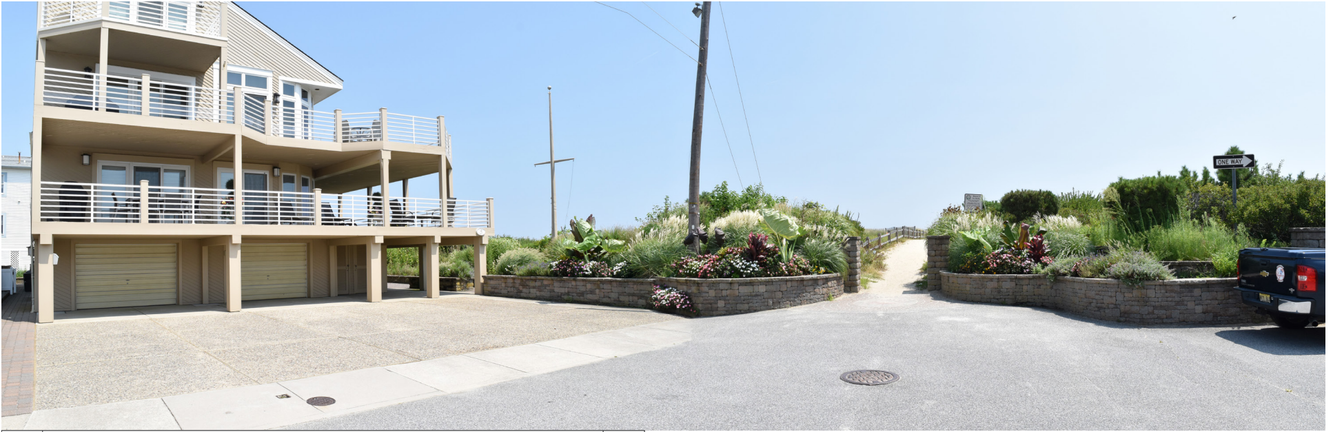
333 Sea Isle City - Public Beach Access, 61st Street SE