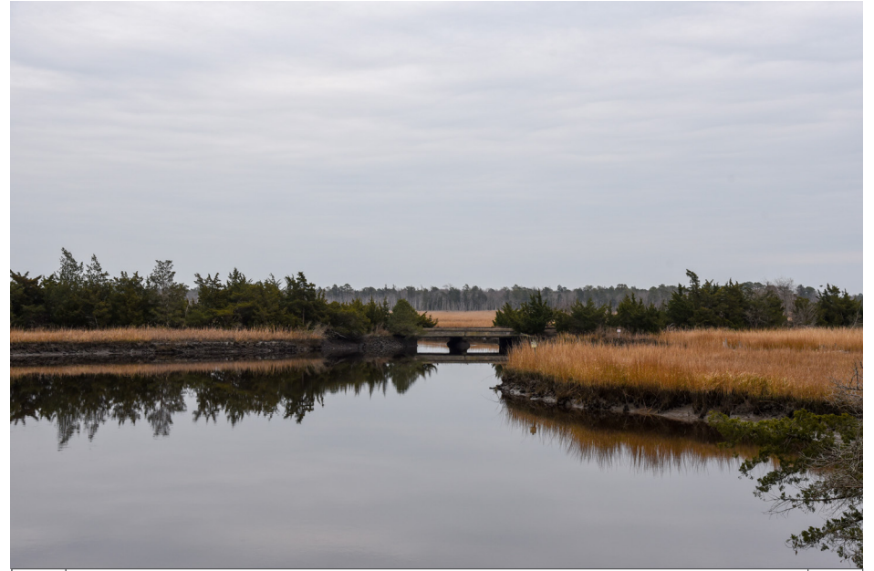
327 Dennis Township - Bridge over Dennis Creek, Route 47 E