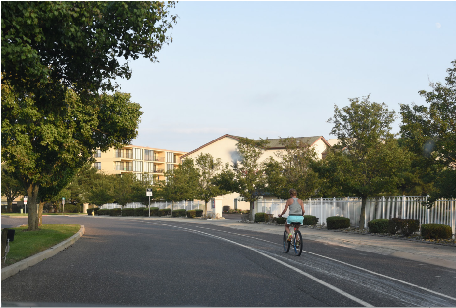
121 Brigantine - Brigantine Avenue SE