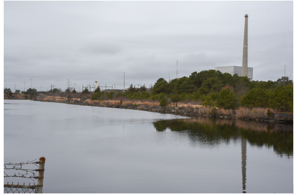
010 Ocean Township - Oyster Creek Generating Station, Route 9, Forked River NW