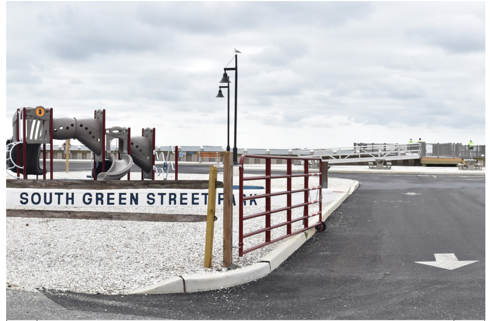
086 *Tuckerton - South Green Street Park S