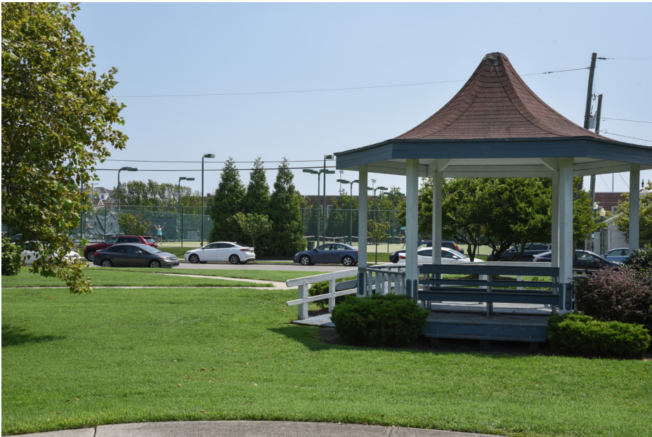
294 Ocean City - War Memorial Park, Historic Resource E