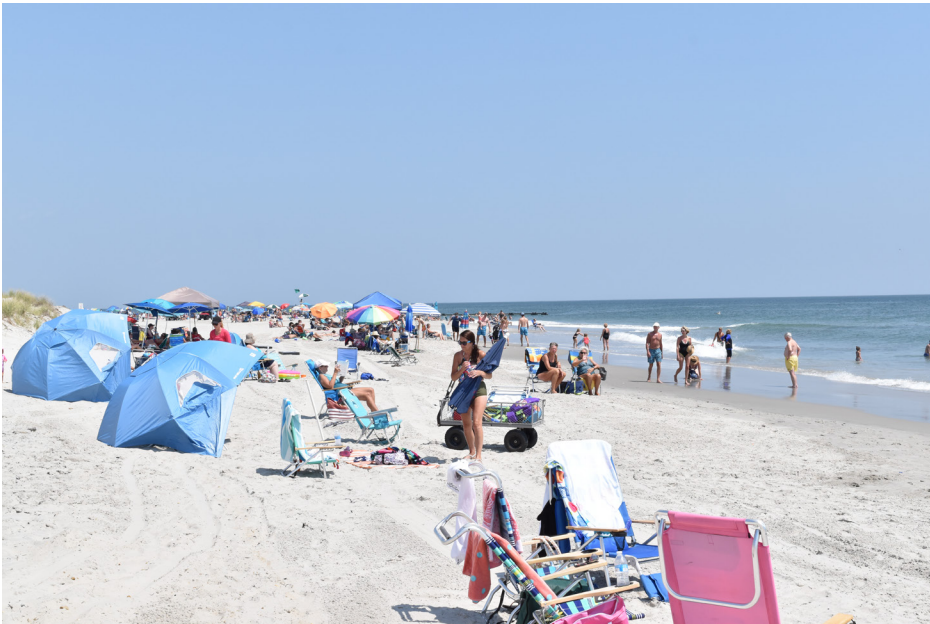
334 Sea Isle City - Public Beach, 89th Street NE