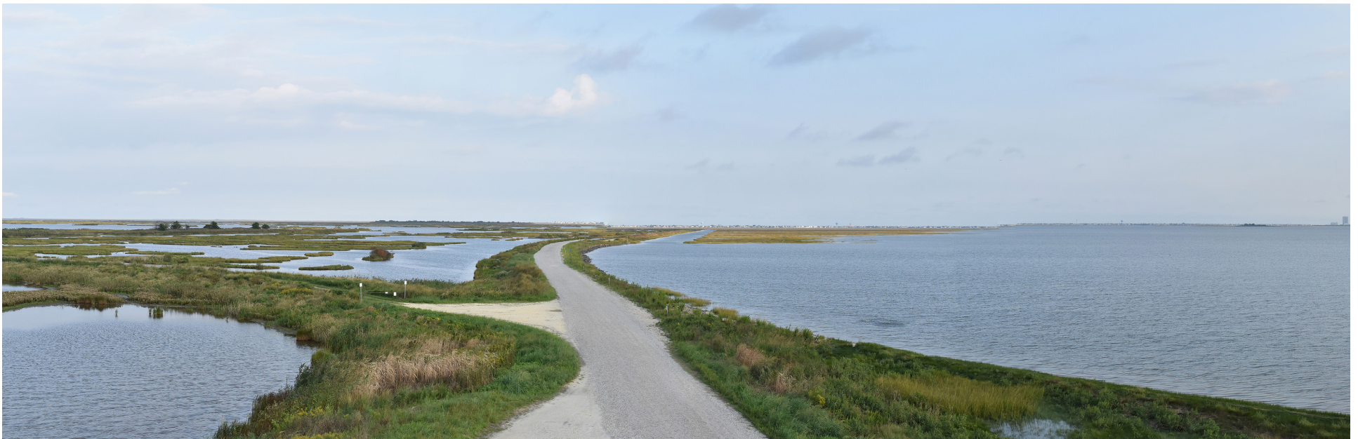
108 *Galloway Township - Edwin B. Forsythe National Wildlife Refuge, from tower SE