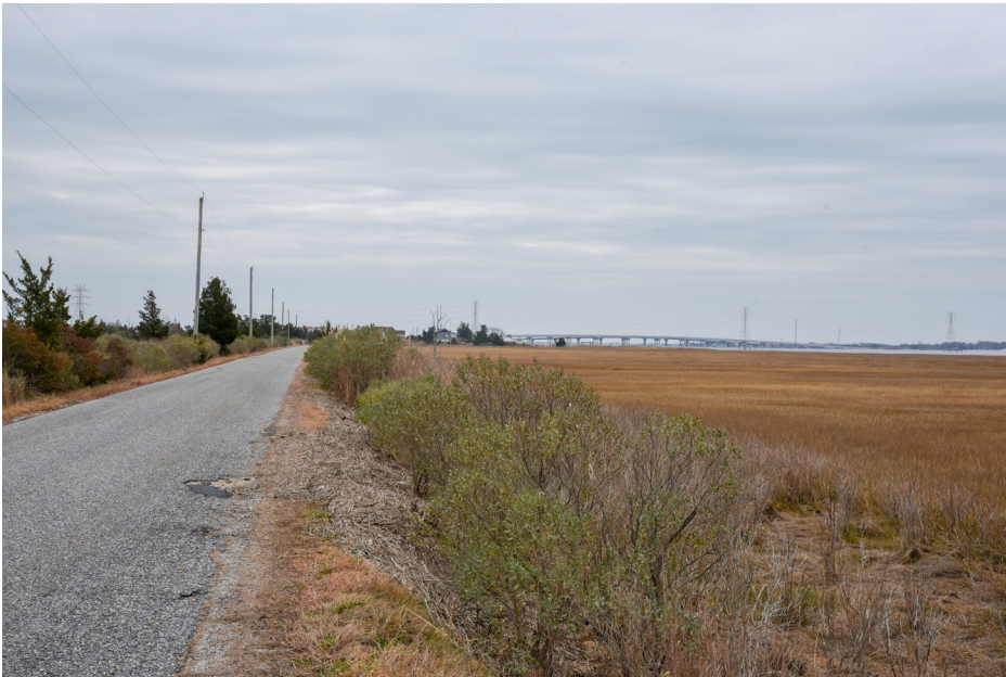
246 Egg Harbor Township - Tuckahoe WMA, Morris Avenue SE