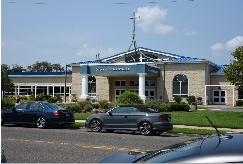
292 Ocean City - Ocean City Tabernacle, Historic Resource, Wesley Avenue W