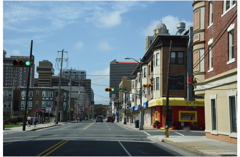
149 Atlantic City - Pacific Avenue at Florida Avenue SW