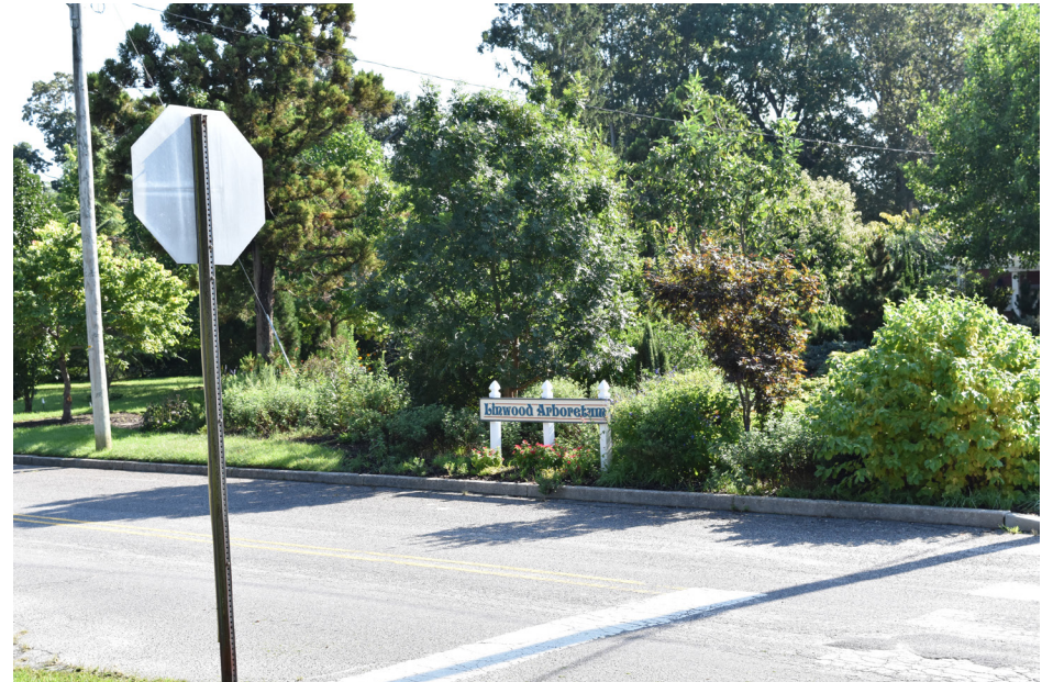
217 Linwood - Linwood Arboretum, Wabash Avenue E