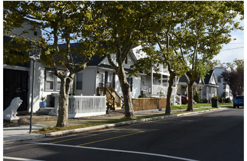
428 Wildwood - Arctic Avenue at Park Boulevard N