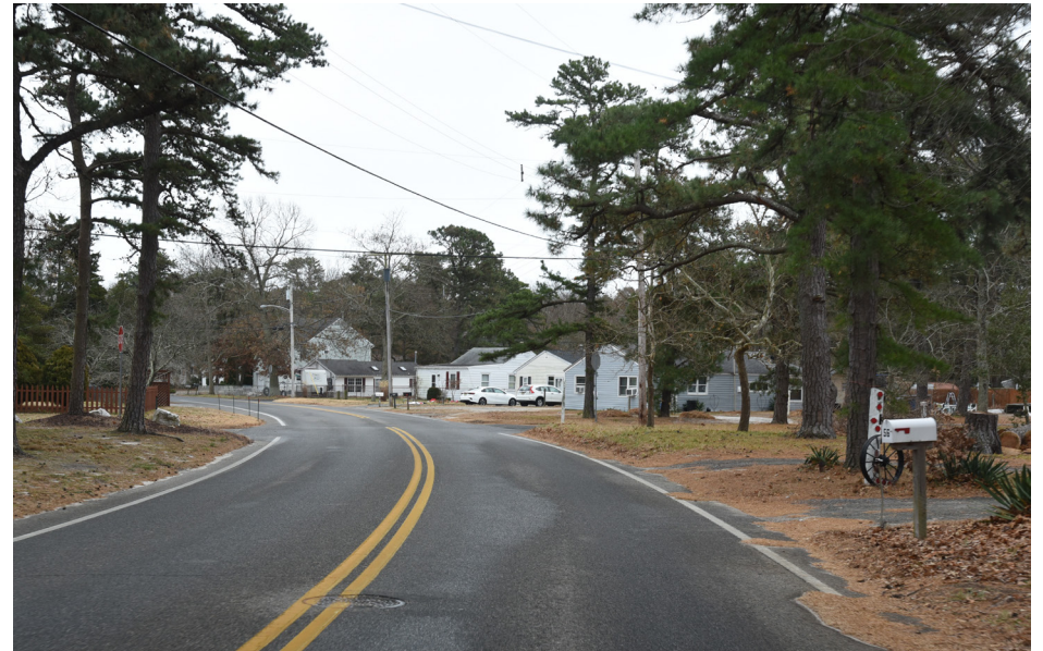
012 Ocean Township - Proposed Underground Cable Route to Oyster Creek, Bay Parkway SE