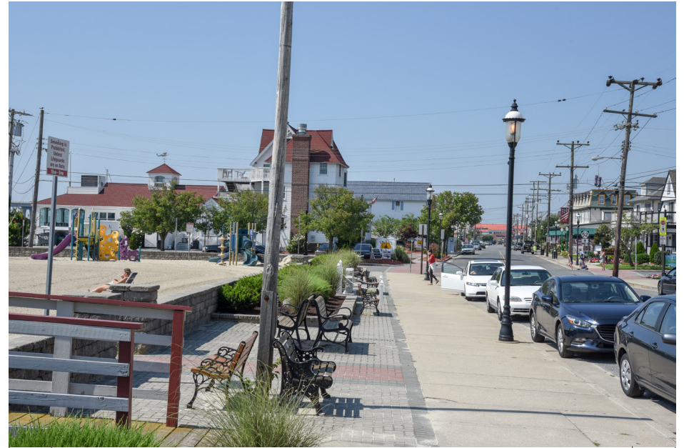
261 *Somers Point - Bay Front Historic District, Bay Avenue SW