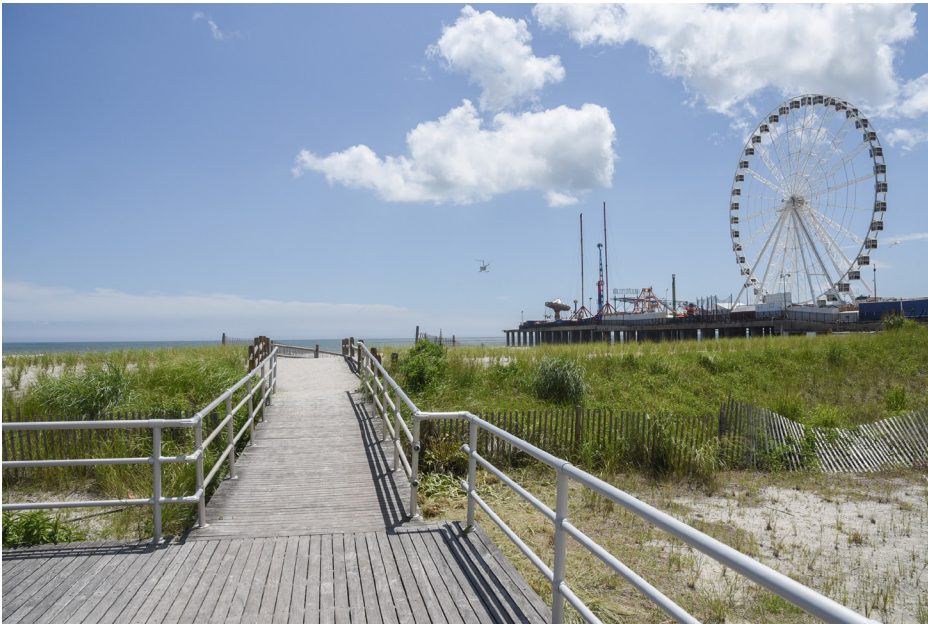
170 Atlantic City - Beach Access, Atlantic City Boardwalk, East of Steel Pier SE