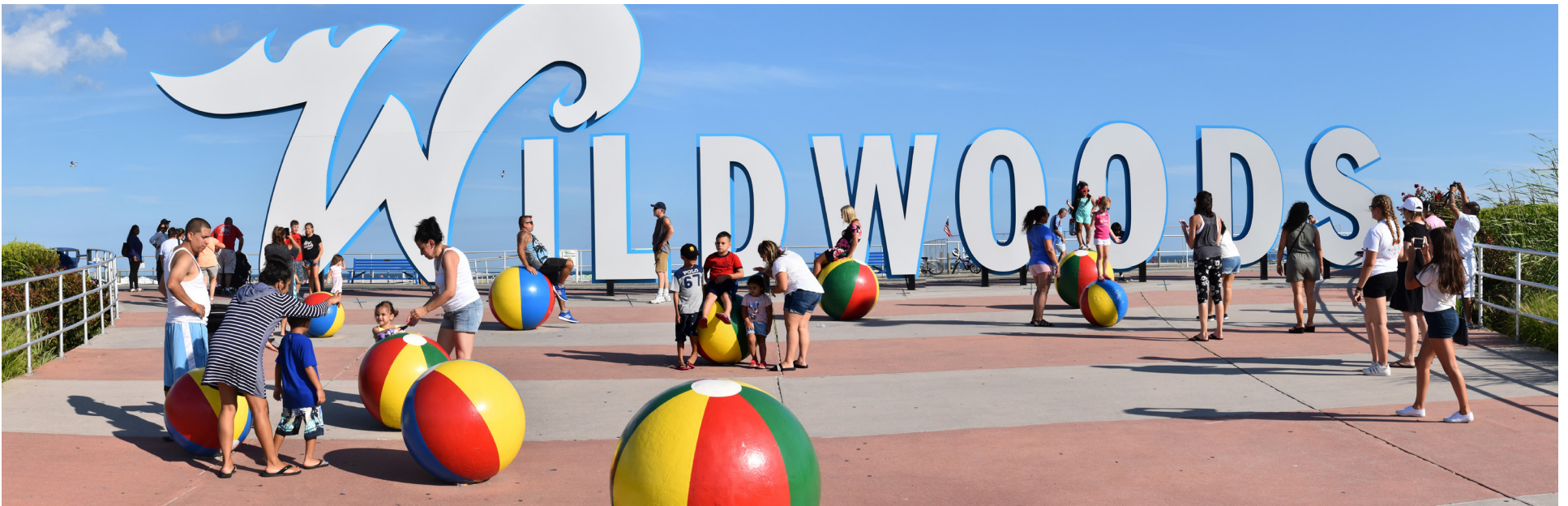
431 Wildwood - Wildwood Sign, End of Rio Grande Avenue