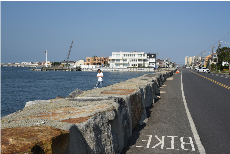
235 Longport - Atlantic Avenue NE