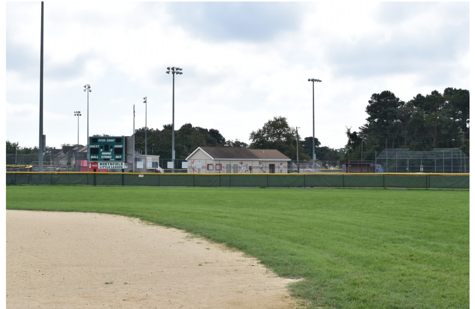
194 Northfield - Birch Grove Park Playing Fields SE