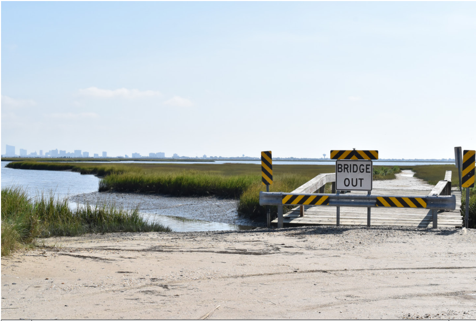
218 Linwood - Marsh Access, East Poplar Avenue SE