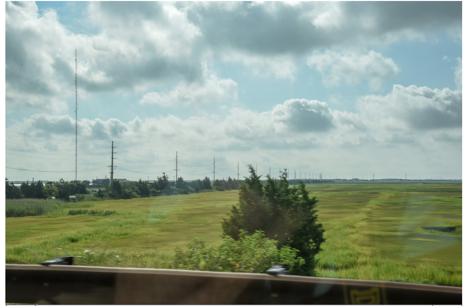
357 Middle Township - Garden State Parkway, Historic Resource SE