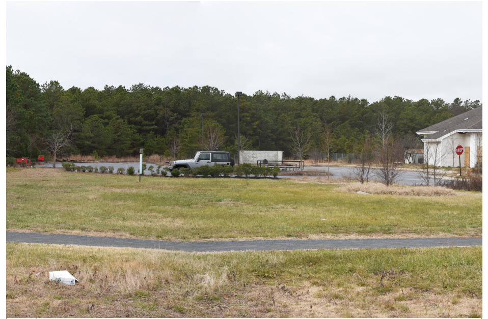
018 Ocean Township - Potential Substation Parcel NW