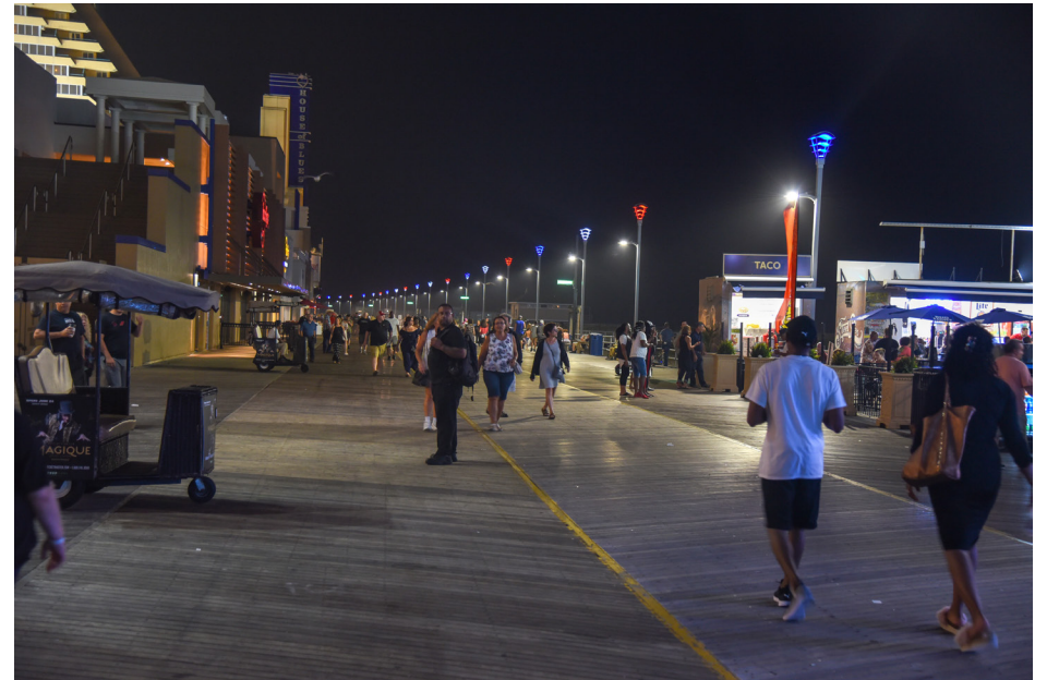
175 Atlantic City - Atlantic City Boardwalk, Historic Resource, at Hard Rock NE