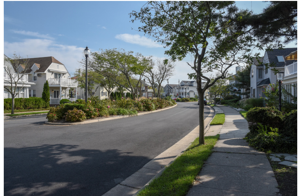
228 Margate City - Marvin Gardens, Historic Resource S