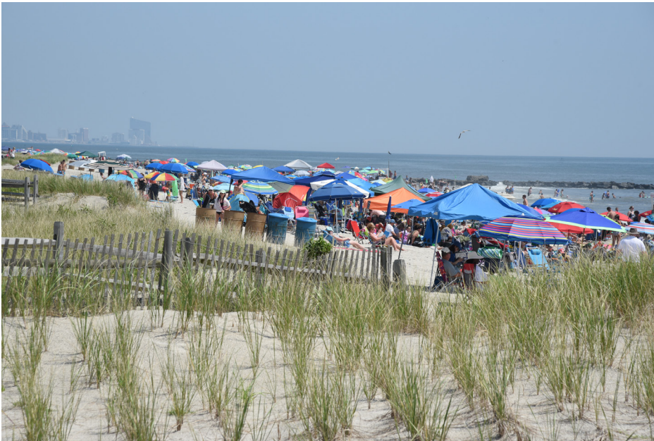
274 *Ocean City - Ocean City Boardwalk, 5th Street, Beach NE