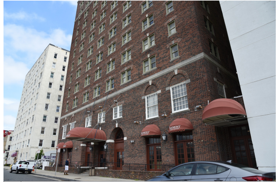
181 Atlantic City - Madison Hotel, Historic Resource N