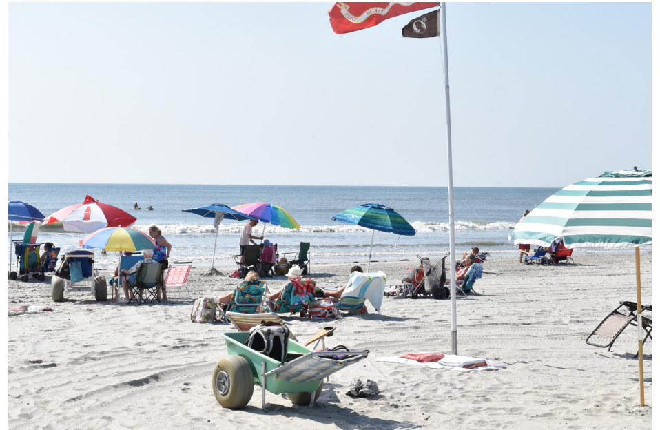
447 North Wildwood - Beach Access, 15th Avenue SE