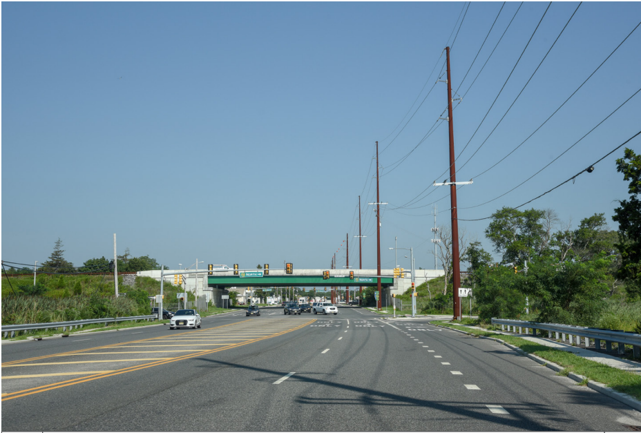
387 Middle Township - Atlantic City Railroad Cape May Division Historic District NW