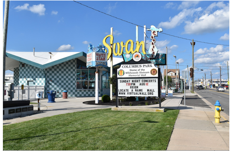
437 Wildwood - Doowop Museum in Columbus Park, Ocean Avenue NE