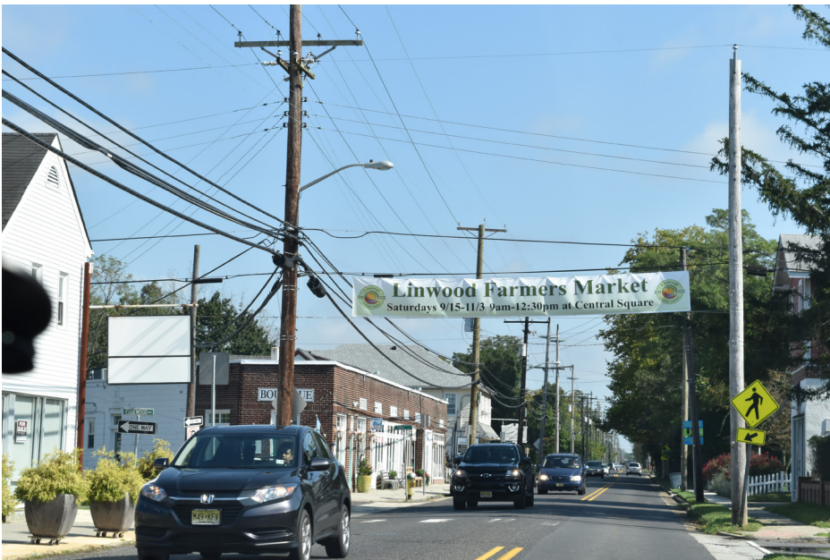
220 Linwood - Linwood Historic District, Shore Road NE