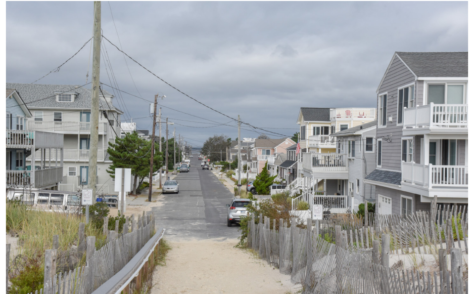
067 Long Beach Township (Spray Beach) - Public Beach Access, East Delaware Avenue NW