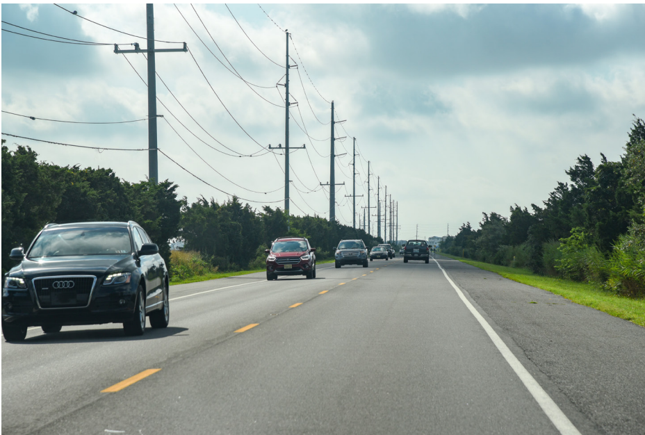
358 Middle Township - Garden State Parkway, Historic Resource SE