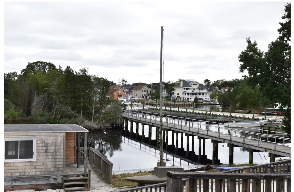
084 Tuckerton - Tuckerton Historic District, Historic Resource