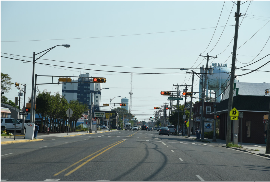
429 Wildwood - New Jersey Avenue