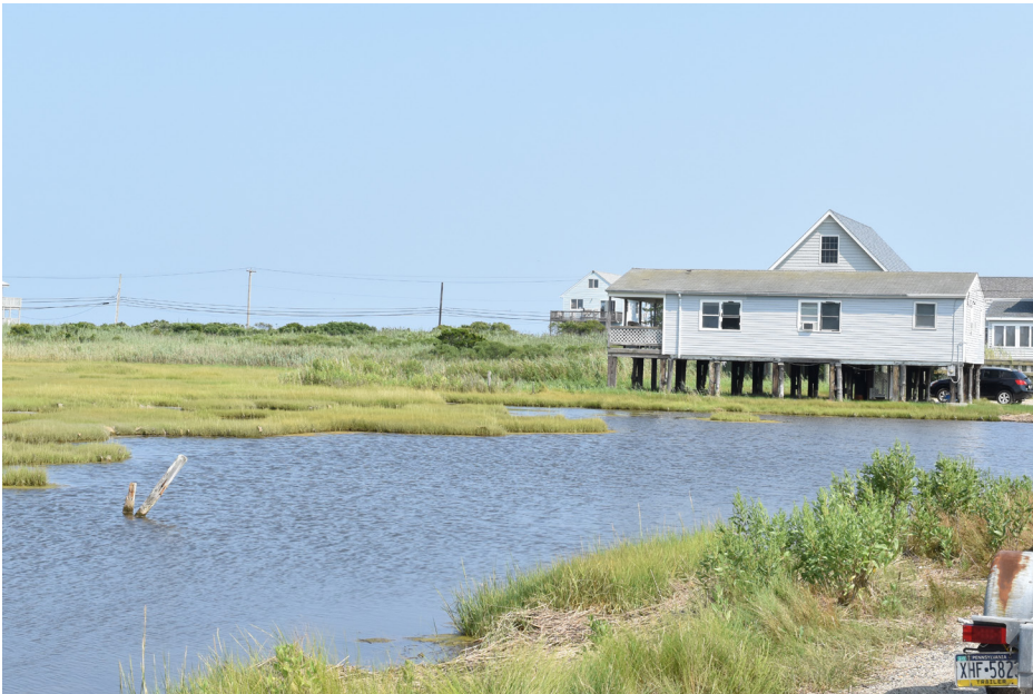
321 *Upper Township - Taylor Avenue NE