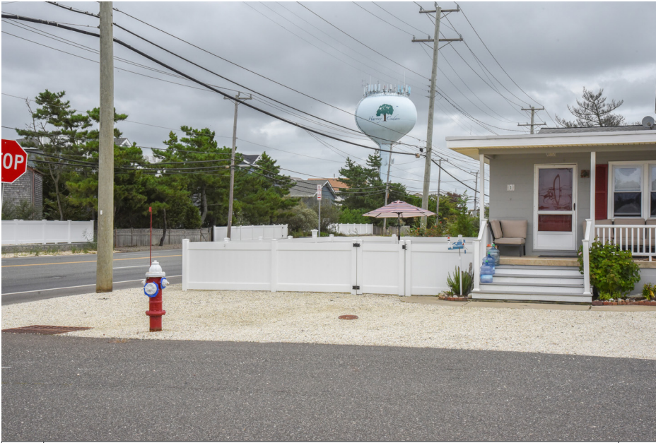
036 Harvey Cedars - East Cape May Avenue N