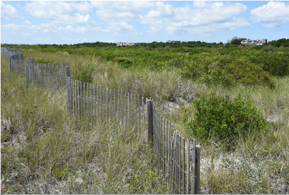
364 Avalon - 48th Street Trail, Dune, view toward inland neighborhoods N