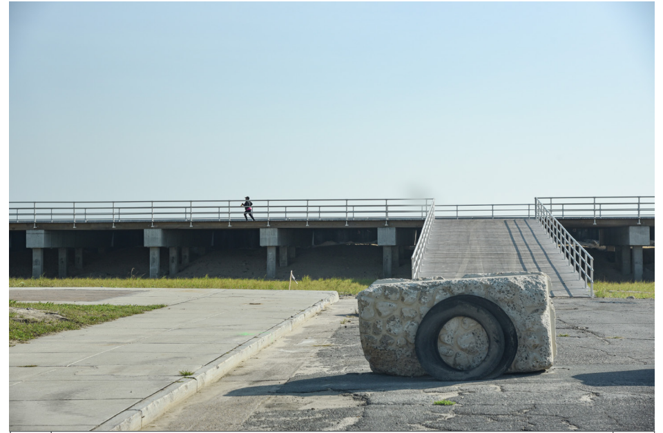
161 Atlantic City - Atlantic City Boardwalk at Pacific Avenue NE