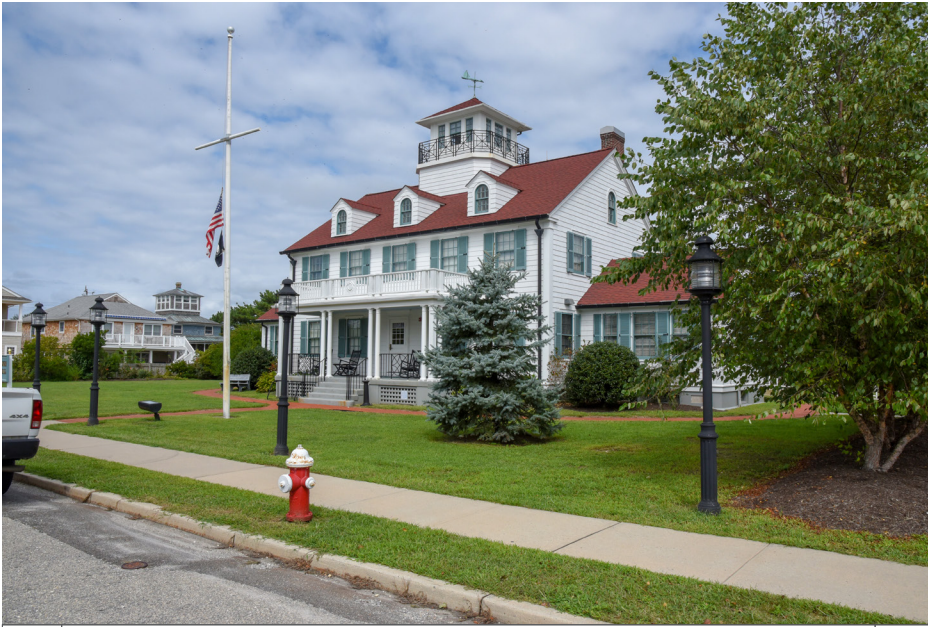
021 Barnegat Light - Barnegat Hall, Historic Resource N