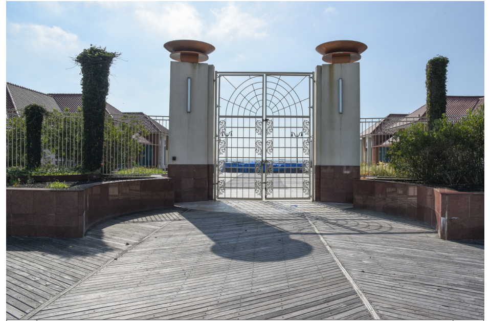
189 Atlantic City - Atlantic City Garden Pier, Historic Resource SE