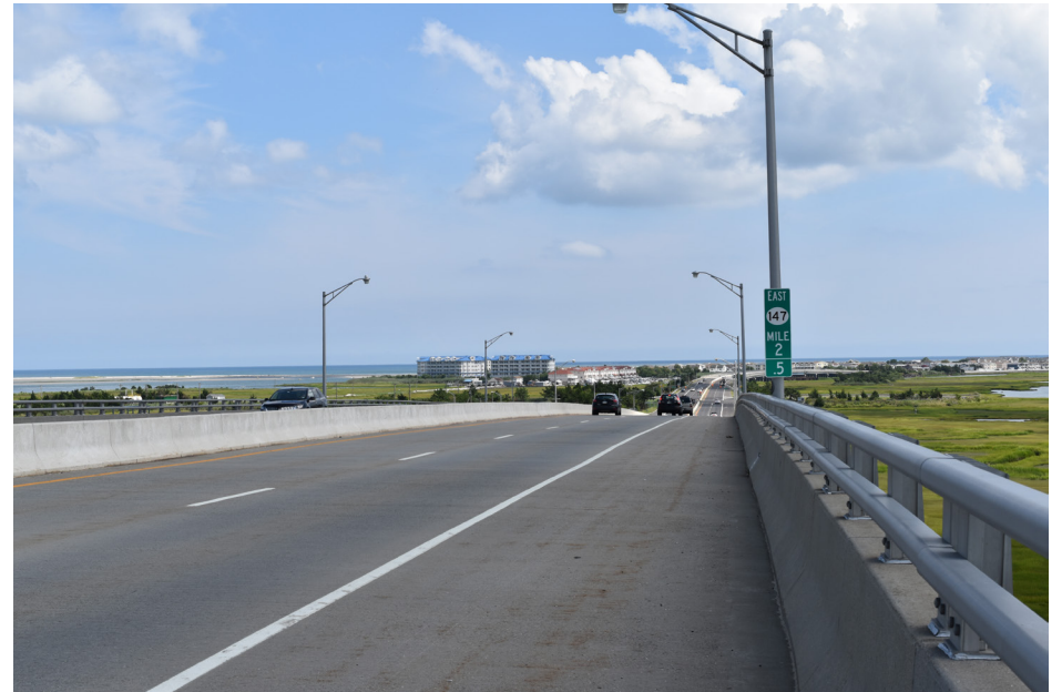
401 *Middle Township - North Wildwood Boulevard SE