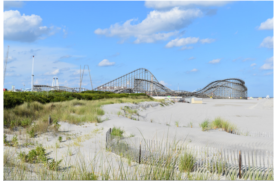
433 Wildwood - Convention Center Beach Access, Amusement Park NE