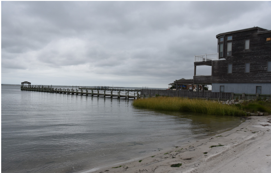
100 Long Beach Township (Holgate) - Public Beach, inland side of Long Beach Township N