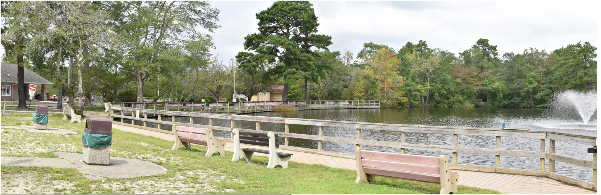
192 Northfield - Birch Grove Park N