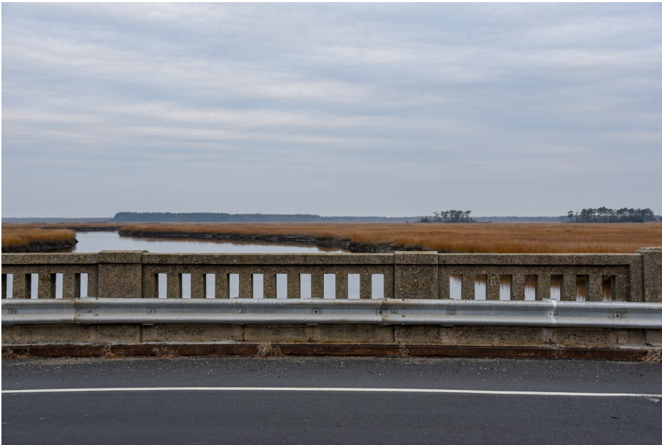
389 Middle Township - Route 47 Bridge SE