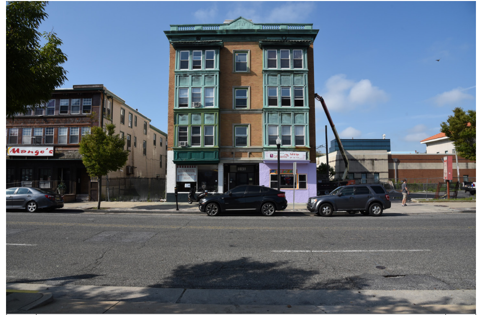
157 Atlantic City - Pennsylvania Avenue SW