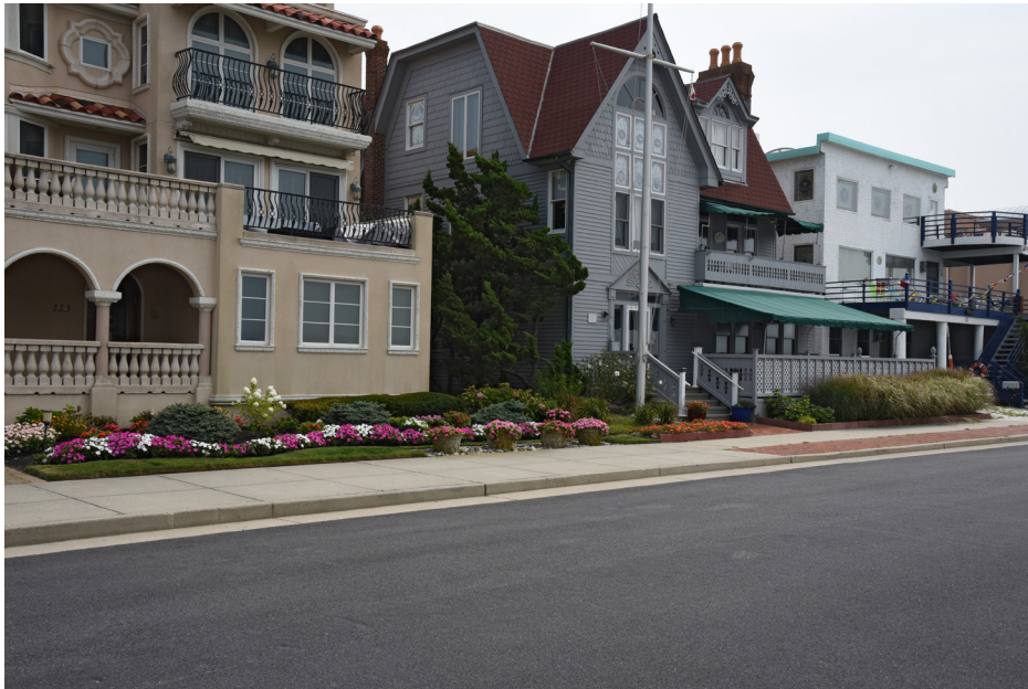
242 Longport - 11th Avenue E