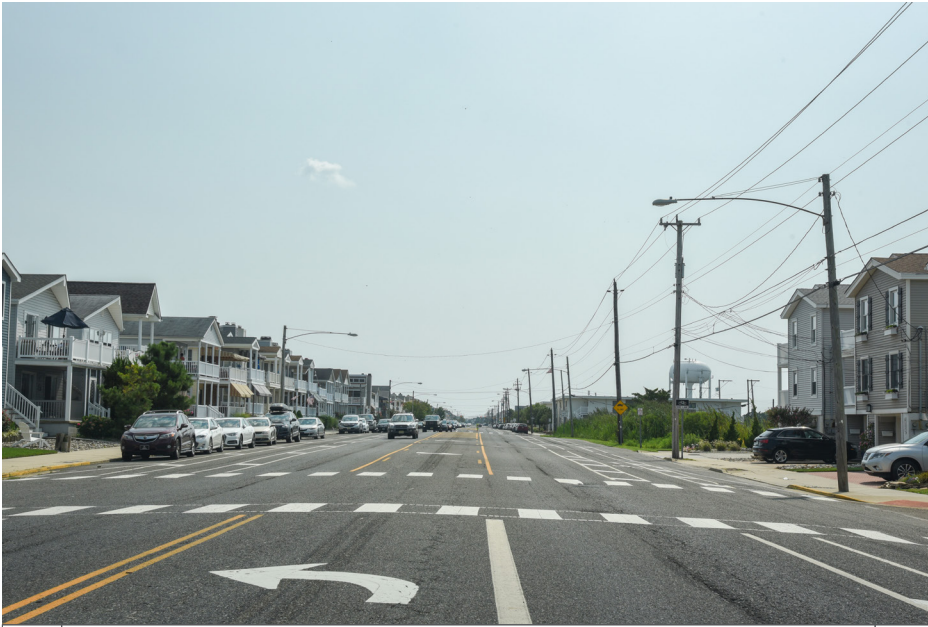
288 Ocean City - West Avenue at 42nd Street SW