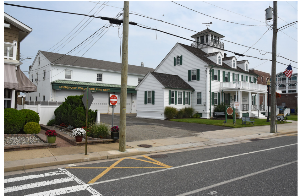
243 Longport - Longport Fire Dept. & Historical Society, Historic Resource N