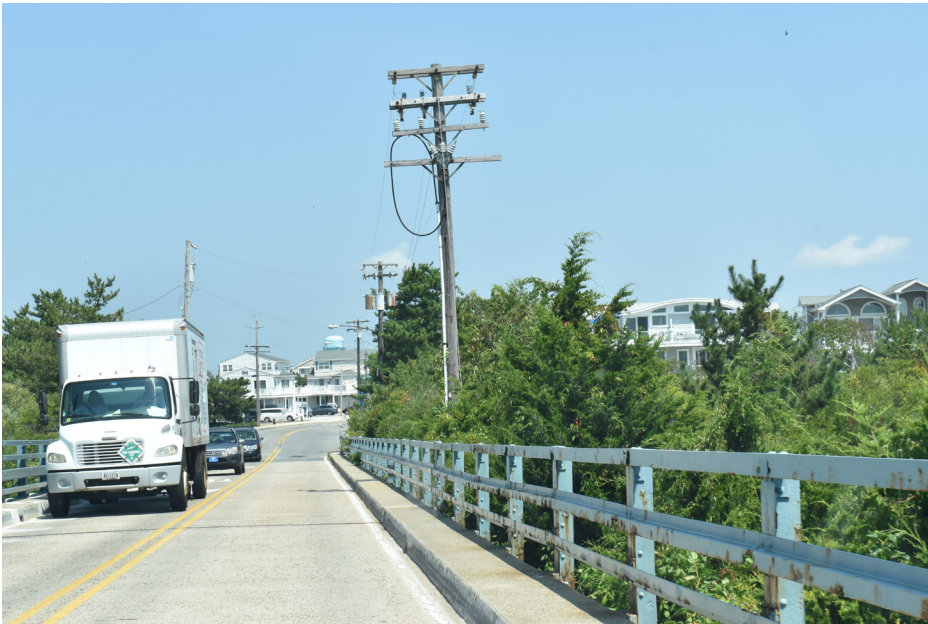
338 Sea Isle City - Ocean Drive Bridge Entering Sea Isle City N