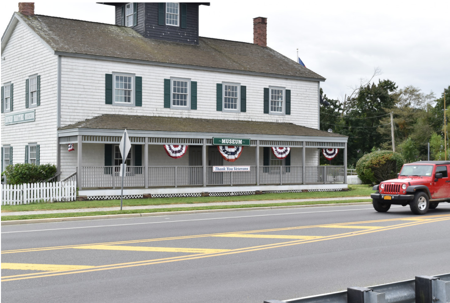
083 Tuckerton - Baymen Maritime Museum, Historic Resource, Route 9