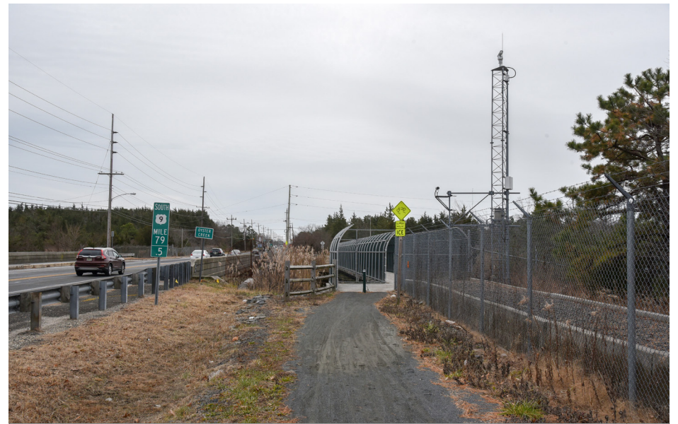
008 Lacey Township - Proposed Underground Cable Route to Oyster Creek, Barnegat Branch Trail, Route 9, South Branch Forked River S