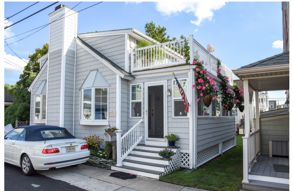
413 Stone Harbor - The Bungalow Colony Historic District, Weber Court S