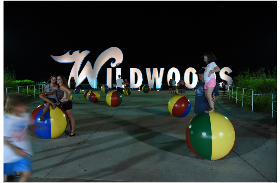
430 Wildwood - Wildwood Sign, End of Rio Grande Avenue