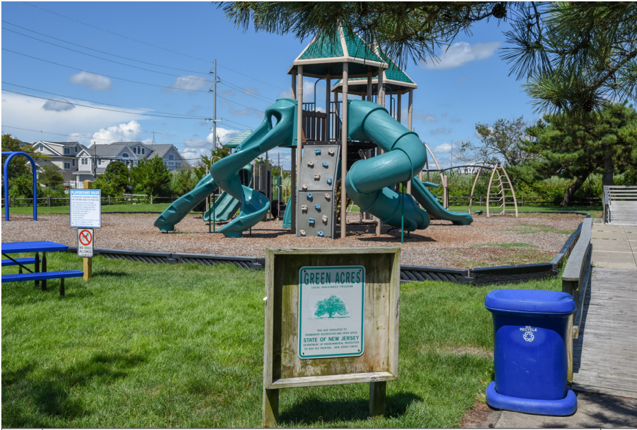
379 Avalon - Armacost Community Park Playground N