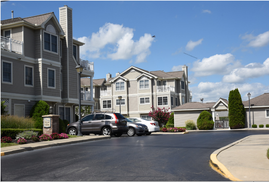
398 Middle Township - Stone Harbor Boulevard, Townhouses N