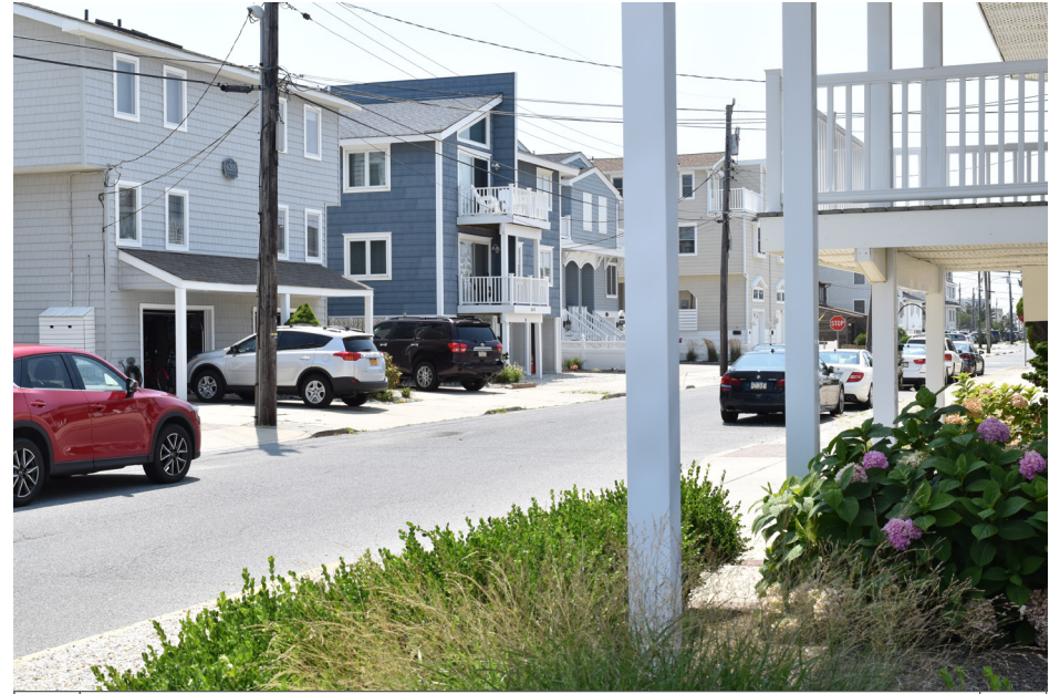
330 Sea Isle City - Pleasure Avenue at 62nd Street S