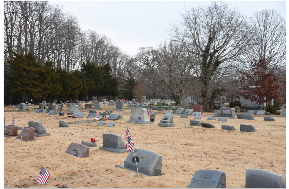
388 Middle Township - First Baptist Cemetery, Historic District E