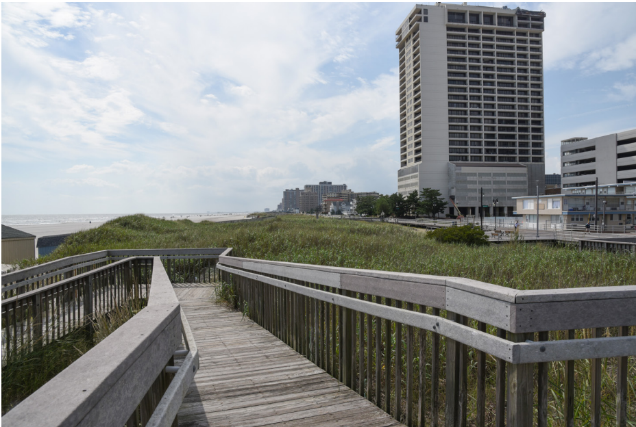
166 Atlantic City - Atlantic City Boardwalk, Beach Access SW