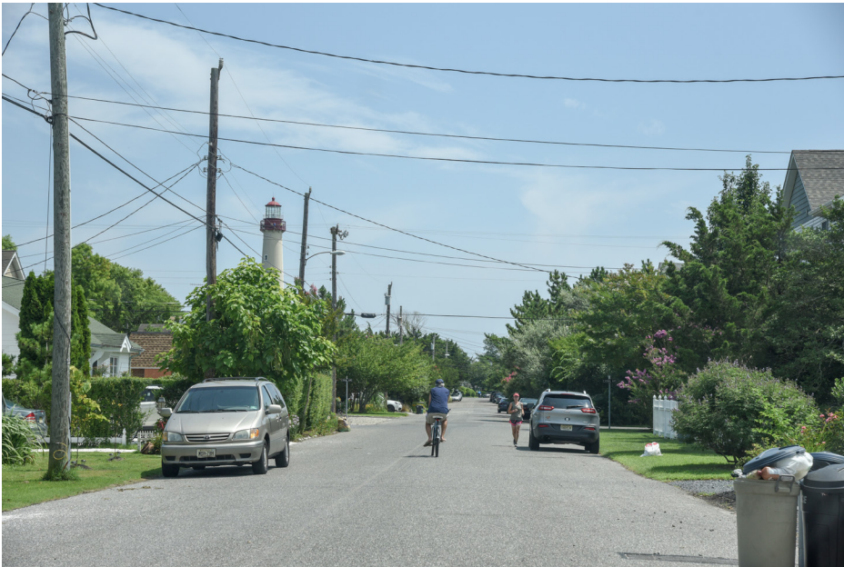
482 Cape May Point - Yale Avenue, Cape May Lighthouse, Historic Resource SE