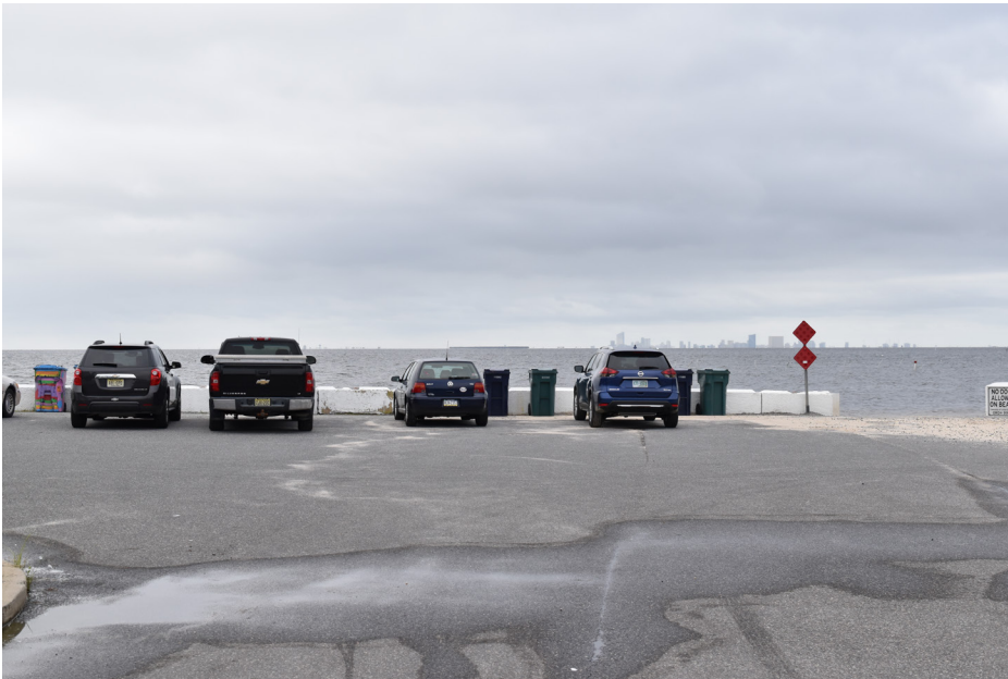
094 Little Egg Harbor Township - Edwin B. Forsythe NWR, Water Access S