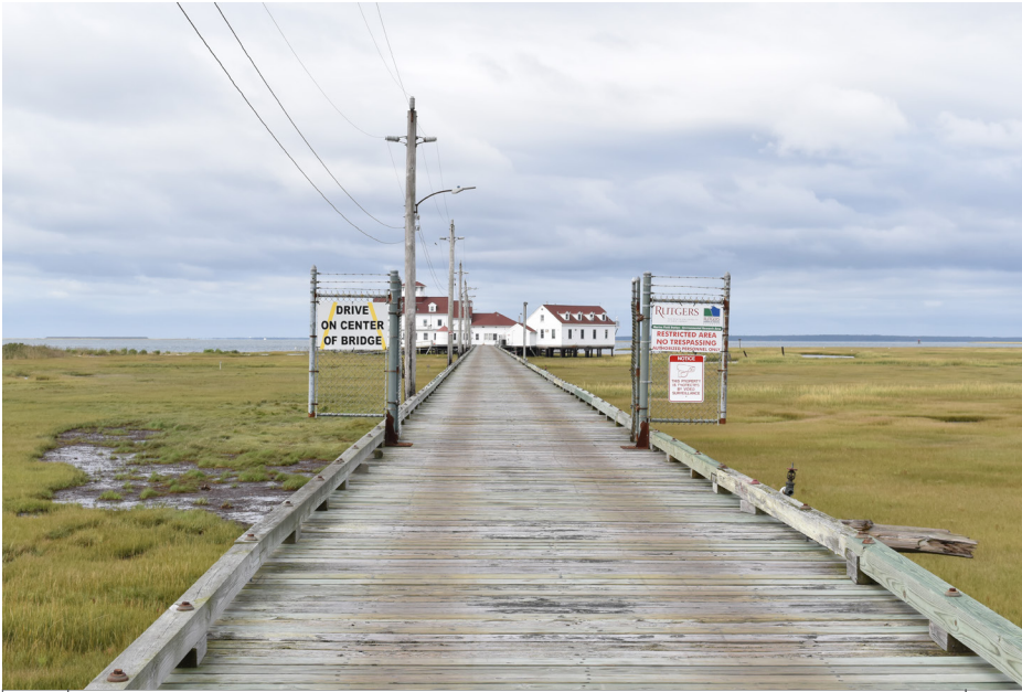
092 *Little Egg Harbor Township - Life Saving Station, Historic Resource SW