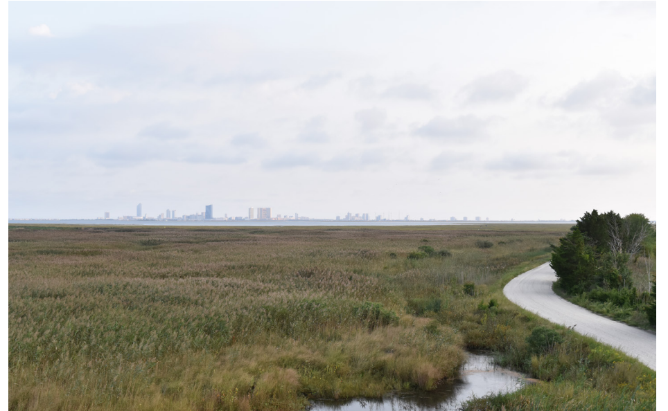
110 *Galloway Township - Edwin B. Forsythe National Wildlife Refuge, Wildlife Drive S