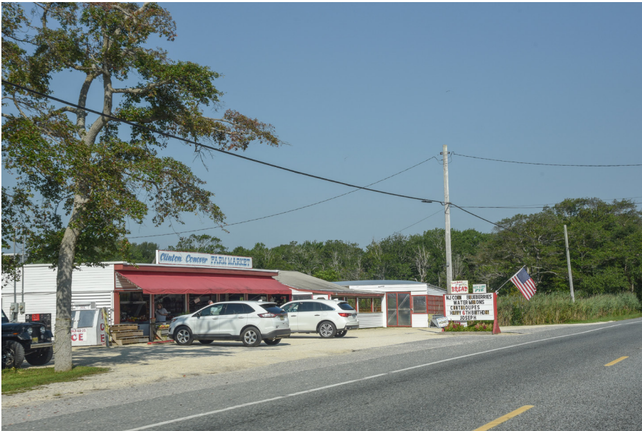
385 Middle Township - Atlantic City Railroad Cape May Division Historic District W