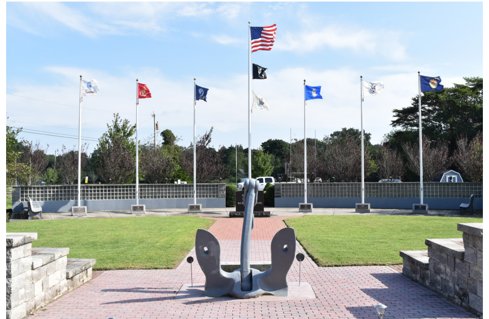
116 Galloway Township - Galloway Veterans Memorial Park SE