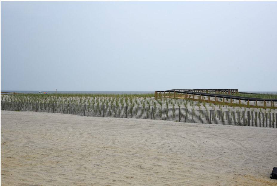
227 Margate City - Public Library Beach Access, Senior Citizen Park SE