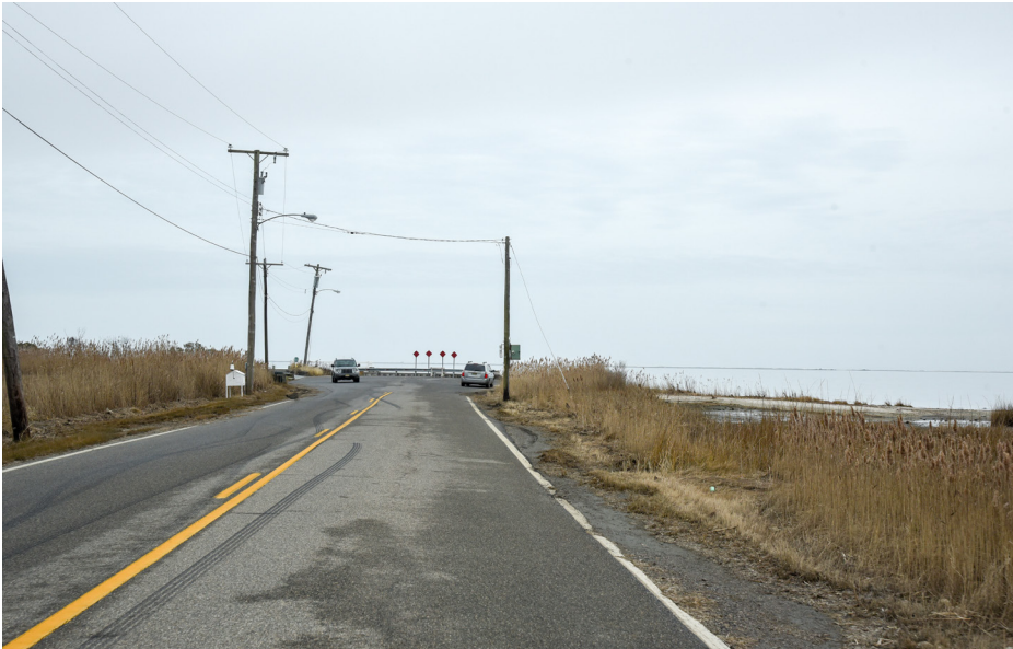
013 Ocean Township - Proposed Underground Cable Route to Oyster Creek, Bay Parkway, End of Road N