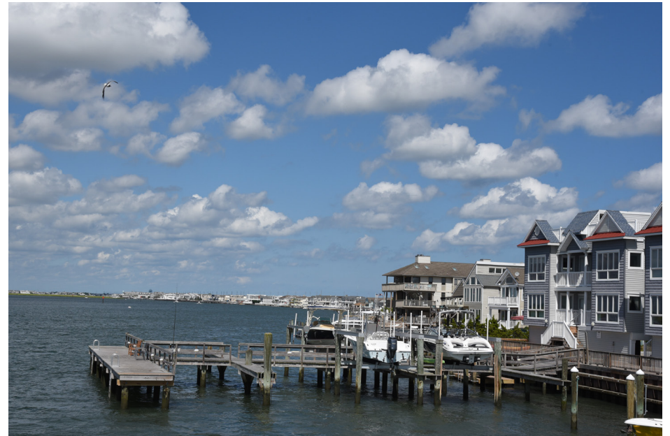
417 Stone Harbor - Great Channel Bridge, Historic Resource NE