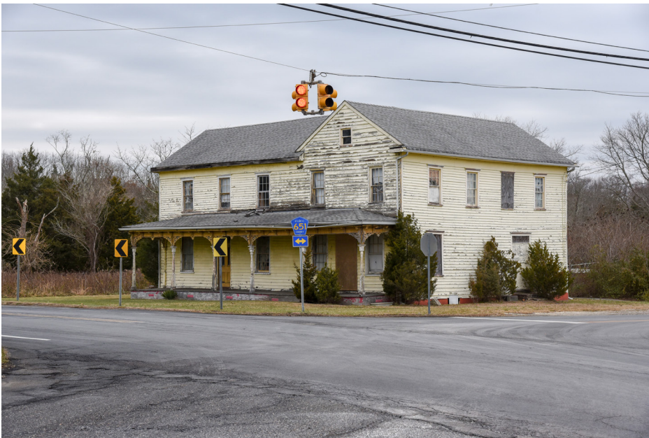
250 Egg Harbor Township - Sculville Historic District, Mays Landing Road N