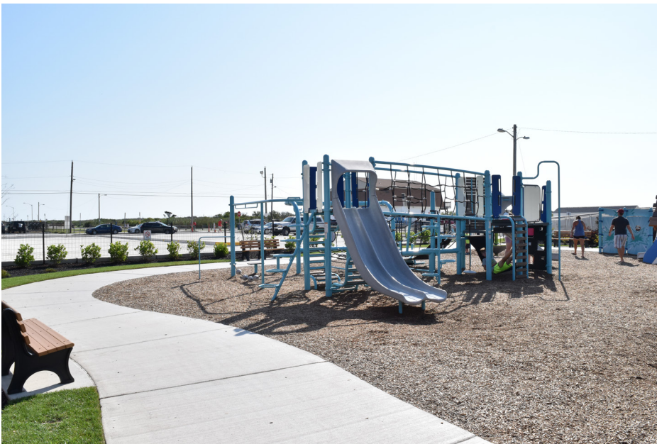
449 North Wildwood - Playground park, 16th Avenue