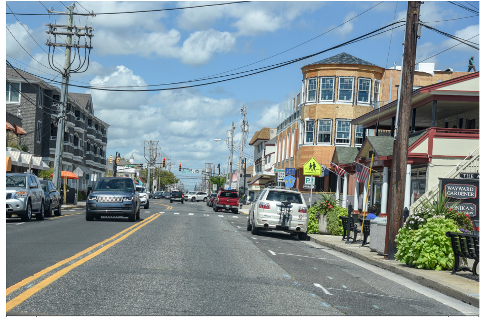
407 Stone Harbor - Stone Harbor Historic District, 3rd Avenue NE