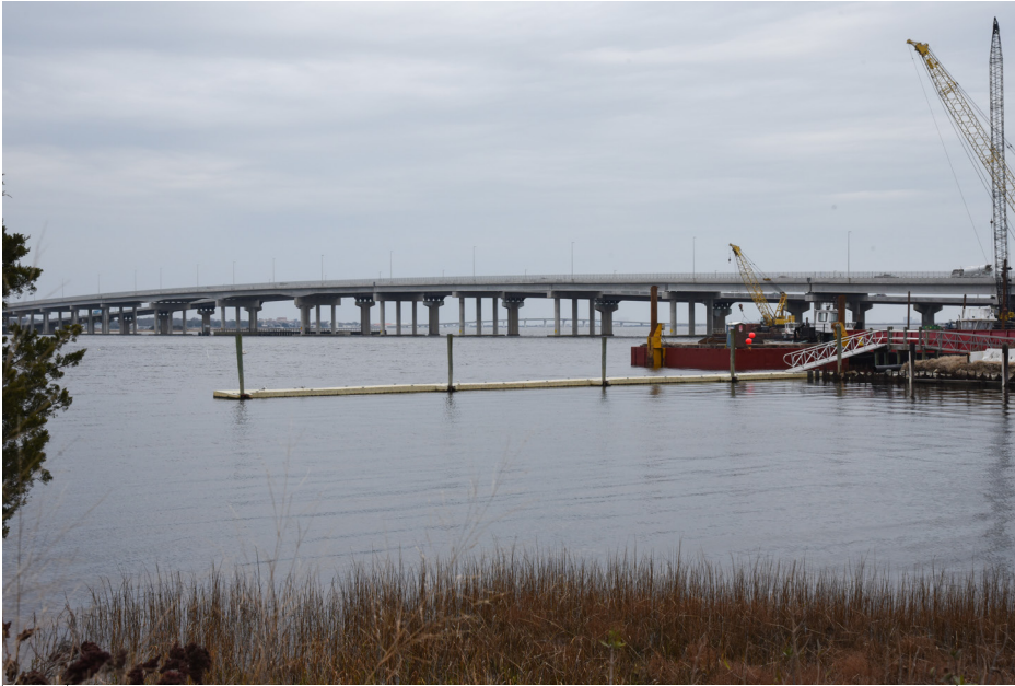
307 Upper Township - North Shore Road Beach toward Garden State Parkway NW