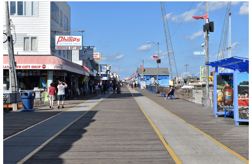
435 Wildwood - Boardwalk at Baker Avenue NE