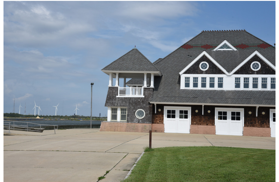
187 Atlantic City - Pete Pallito Field & Boat House N