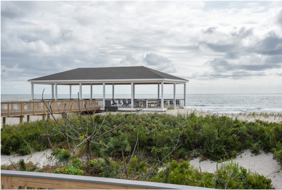
066 *Long Beach Township (Brant Beach) - Bayview Park, Viewing Platform E