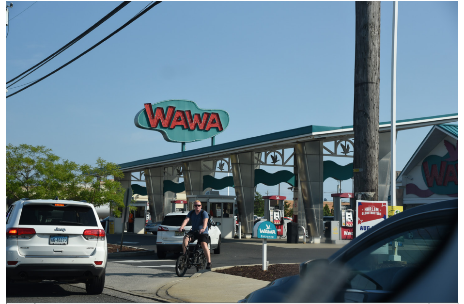
426 Wildwood - Typical signage character, Rio Grande Avenue S