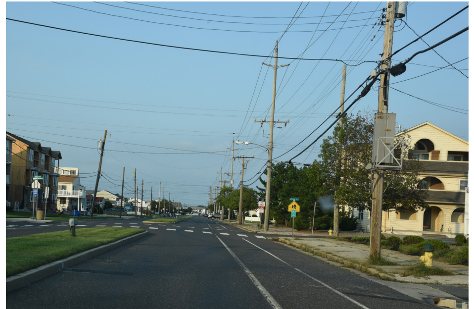
120 Brigantine - Brigantine Avenue NW