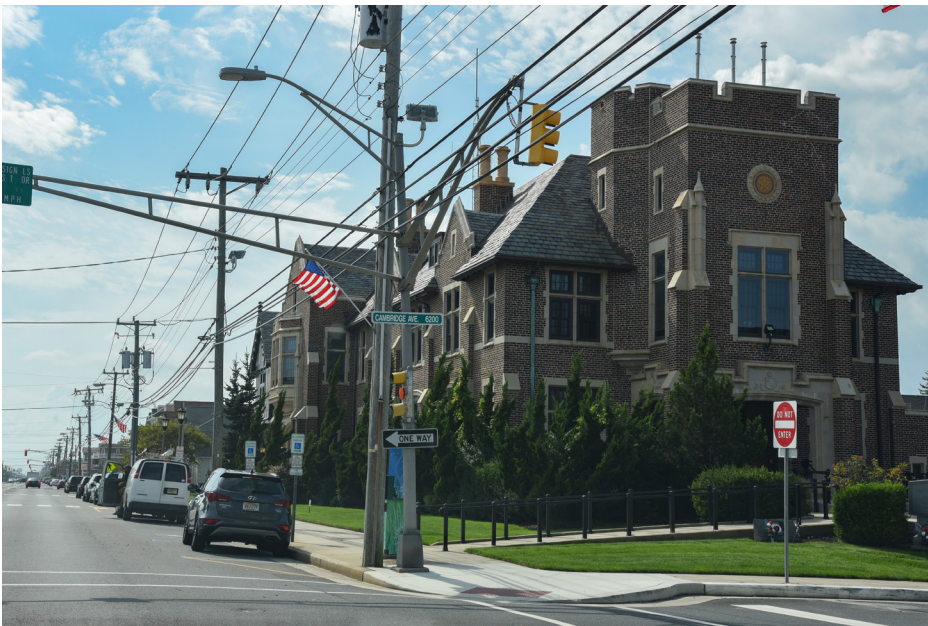
212 | *Ventnor City - Ventnor City Town Hall, Historic Resource | W