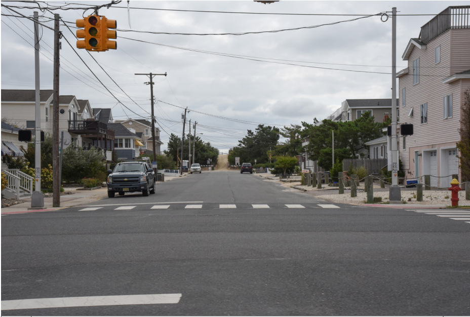
056 Surf City - Long Beach Boulevard at 8th Street NE