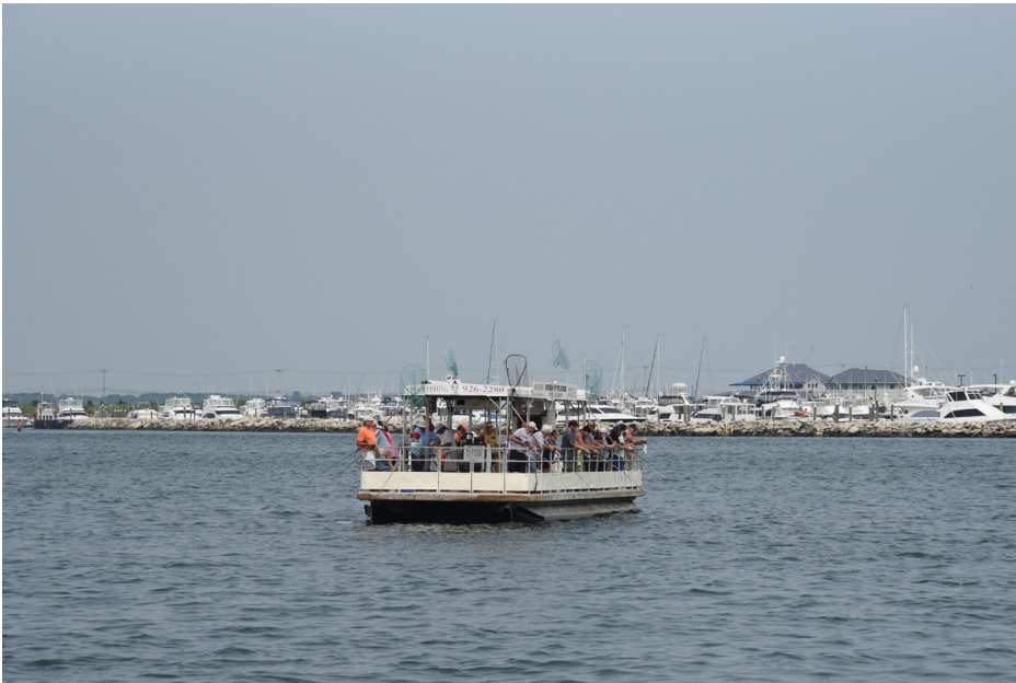
239 Longport - Duke O' Fluke Fishing Boat, from Atlantic Avenue NW