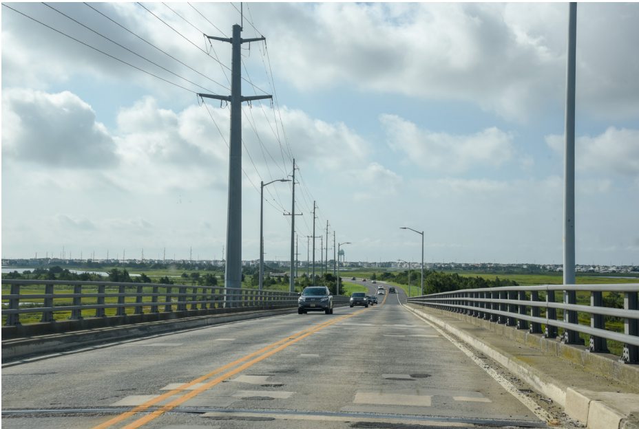
377 Avalon - Route 201 Bridge, Avalon Boulevard SE