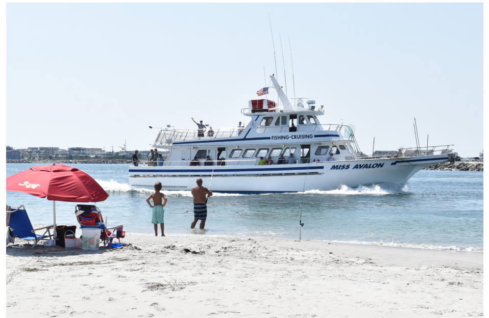
351 Sea Isle City - Townsend Inlet Park, Charter Cruise Boat S