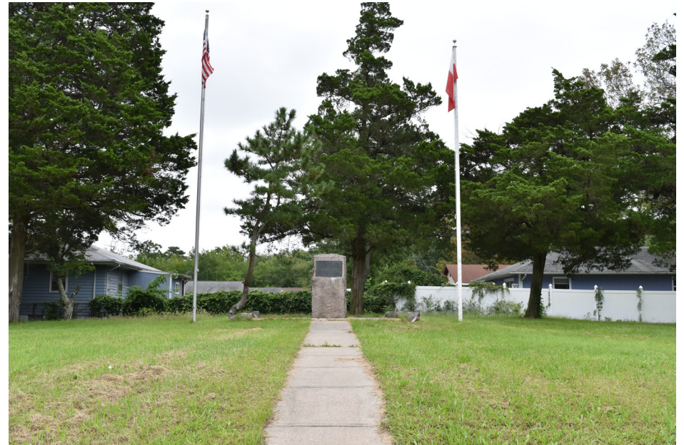
095 Little Egg Harbor Township - Pulaski Monument, Historic Resource E