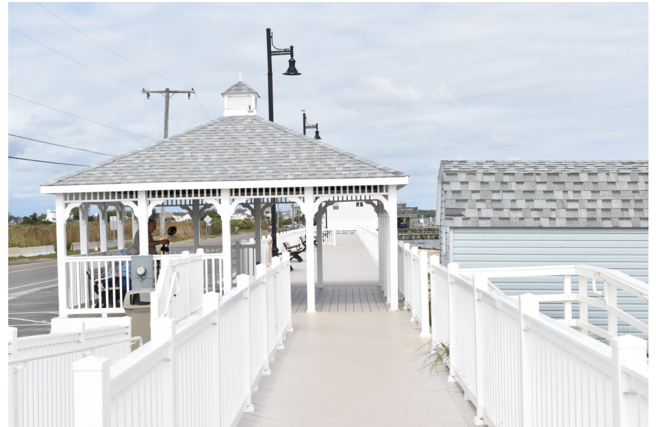
035 | Barnegat Township - Barnegat Beach | N