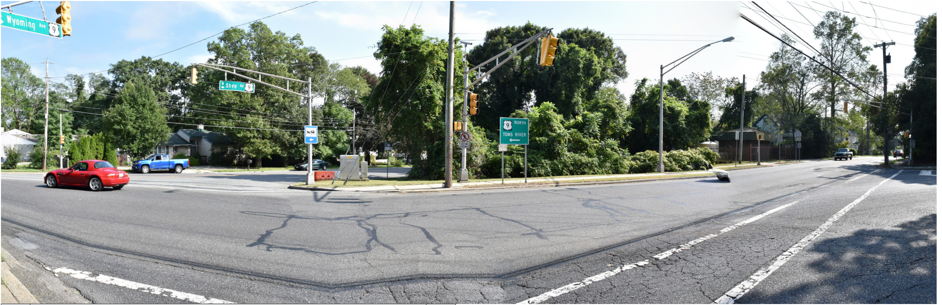
132 Absecon - North Shore Road Eligible Historic District SE