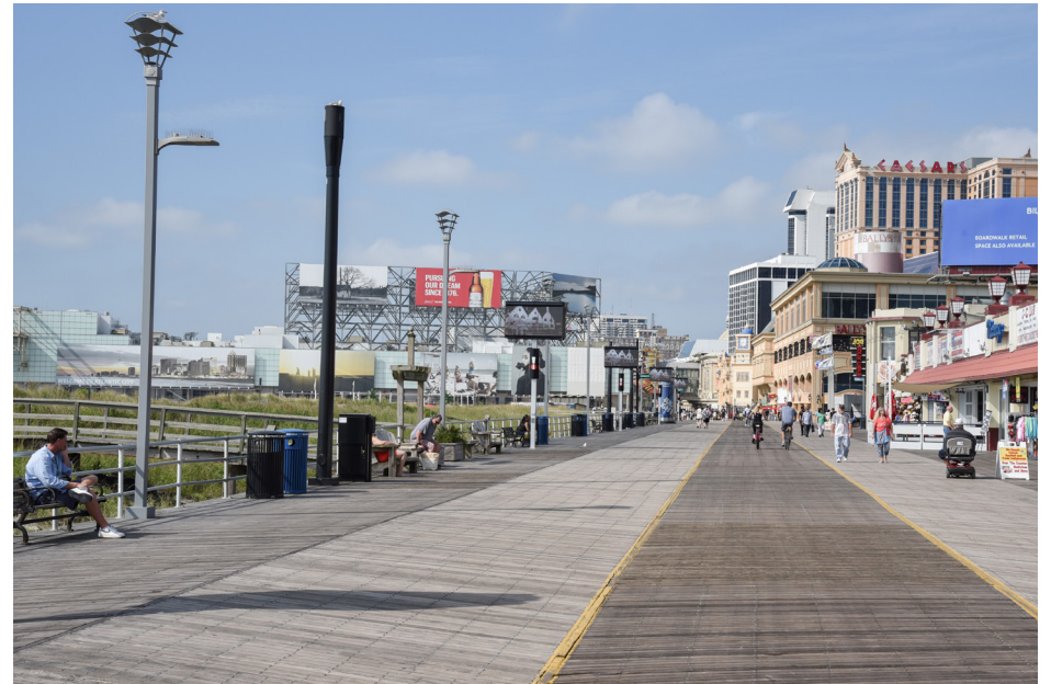
159 Atlantic City - Atlantic City Boardwalk, Historic Resource, MLK Boulevard W