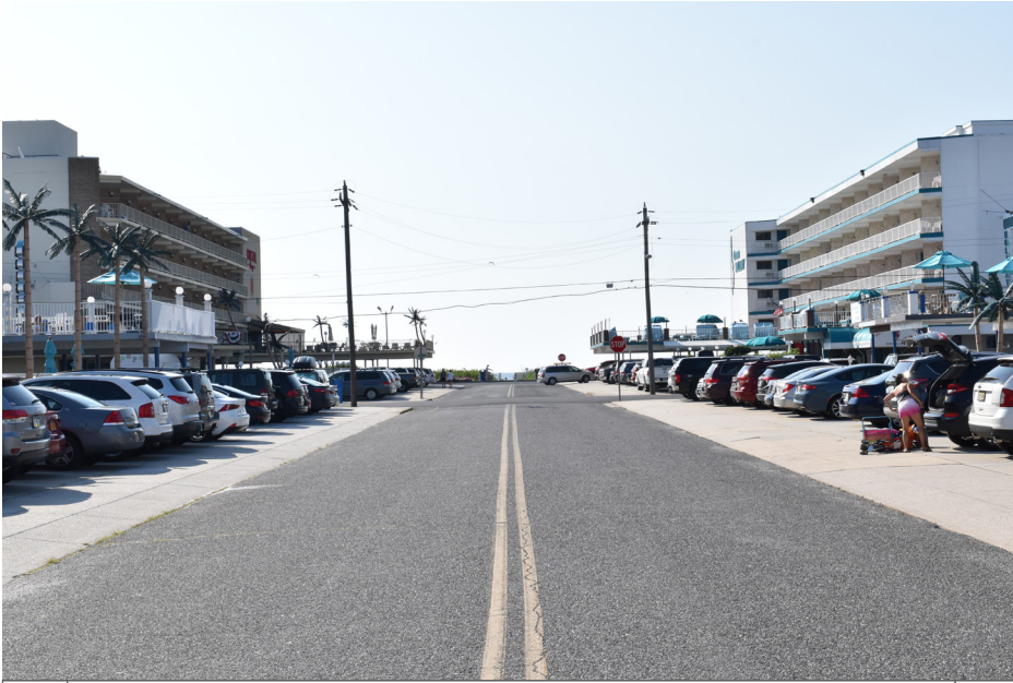
421 Wildwood Crest - Wildwood Shore Resort Historic District, Rosemary Road SE