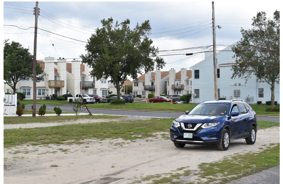
140 *Pleasantville - Skyline Condominiums, Walnut Avenue N