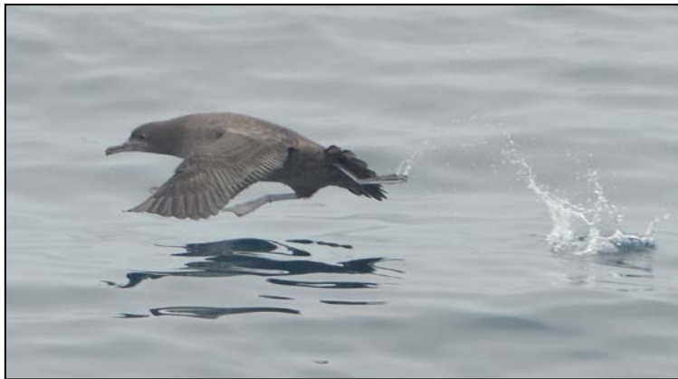
Sooty Shearwater.