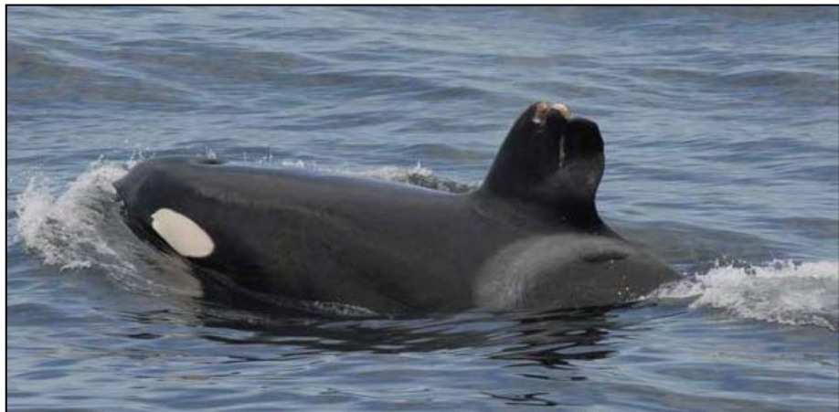
Killer whale (CA217) photographed near Wave Energy Area.

During the second survey of the BOEM Wave Energy Area immediately outside of Newport Harbor, a well-known transient killer whale with a distinctively damaged dorsal fin was sighted. This individual (a male with identification number CA217) was first sighted off of Santa Catalina Island on 13 December 1998, and was an adult at that time. He was last sighted with six other whales in Johnstone Strait (British Columbia) on 7 July 2014. He has been seen as far south as Dana Point, though most of his sightings have been in Monterey Bay.