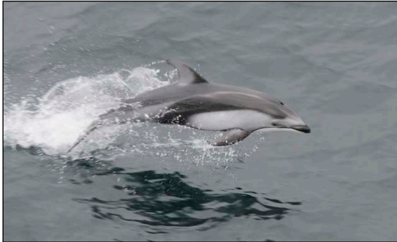
Pacific white-sided dolphin - most common cetacean observed in the Windfloat Area on 24 August 2014.