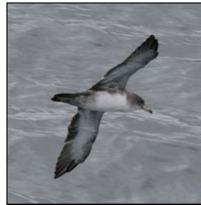
Pink-footed Shearwater.

Thirteen species and 177 birds were recorded in the Windfloat Area (Table 3). Nine species and 218 birds were recorded in the Wave Energy Area during the 26 August survey (Table 4); eight species and 87 individual birds were recorded in this area during the 30 August survey (Table 5).