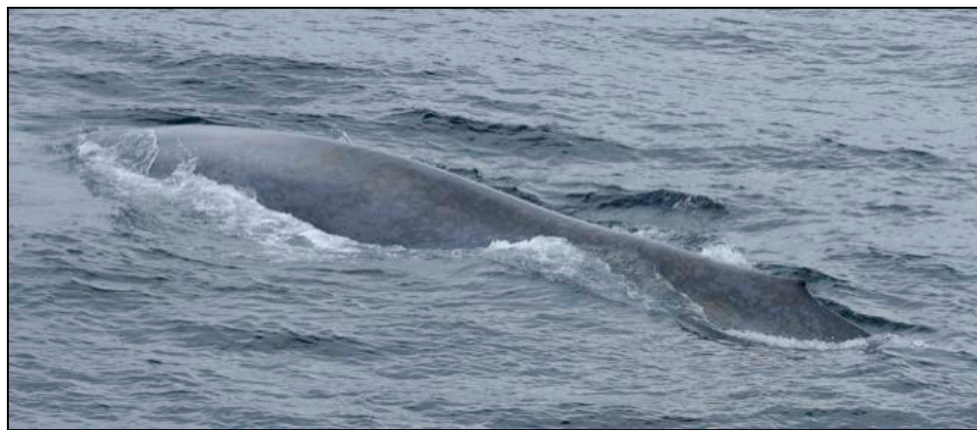
Blue whale off the coast of Oregon.

There were eight cetacean sightings and no pinniped sightings in the Wave Energy Area (Table 2). Please note that the table contains raw data and is not intended to be a measure of density, abundance, or habitat use.