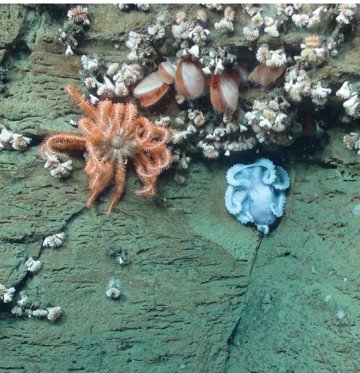
Often multiple species of invertebrates are found co-occurring on rock ledges and canyon walls near the edge of the Mid-Atlantic's continental shelf. Here a brisingid sea star, an octopus, bivalves, and several individuals of the cup coral ( Desmophyllum ) are found in close proximity to one another.