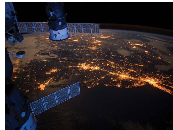
A view of the Mid-Atlantic region at night from the International Space Station looking from the Atlantic Ocean landward.

the needs of stakeholders in the region. Interjurisdictional coordination is the process of collaboratively developing and implementing those tools, information, and processes, and is a core component of the Plan. This chapter describes several key Plan components