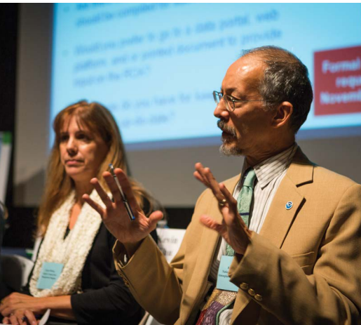
Members of the Mid-Atlantic Regional Planning Body discuss interagency coordination during a public listening session in Virginia Beach, Virginia.

There is no single management entity responsible for comprehensive, integrated stewardship of our domestic oceans. Responsibilities for ocean management are distributed among numerous Federal, State, and Tribal entities and include hundreds of laws, regulations, and policies. This distributed system poses challenges to managers striving for efficient, informed, and coordinated decision making. These challenges are increasing as society seeks to accommodate new and expanding ocean uses while simultaneously protecting the health of a rapidly changing natural system.