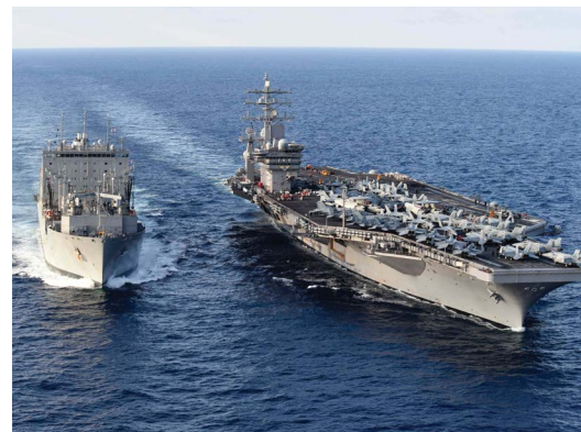
The Mid-Atlantic is home to world's largest naval station. Naval Station Norfolk supports 75 ships and 134 aircraft alongside 14 piers and 11 aircraft hangars, and houses the largest concentration of U.S. Navy forces. Military uses of the ocean are critically important for our region and the nation as a whole. It is vital they be coordinated with other ocean uses, including navigation, renewable energy, fishing, and recreation.

Finally, the RPB expresses interest in further exploring two options that would enable certain decisions related to the Coastal Zone Management Act (CZMA) to be more efficient, streamlined, and coordinated. The options relate to (1) providing earlier Federal notice to States and Tribes than current regulations require, where appropriate and practicable, and (2) improving States' abilities to execute the Federal Consistency provisions of the CZMA in the offshore space.