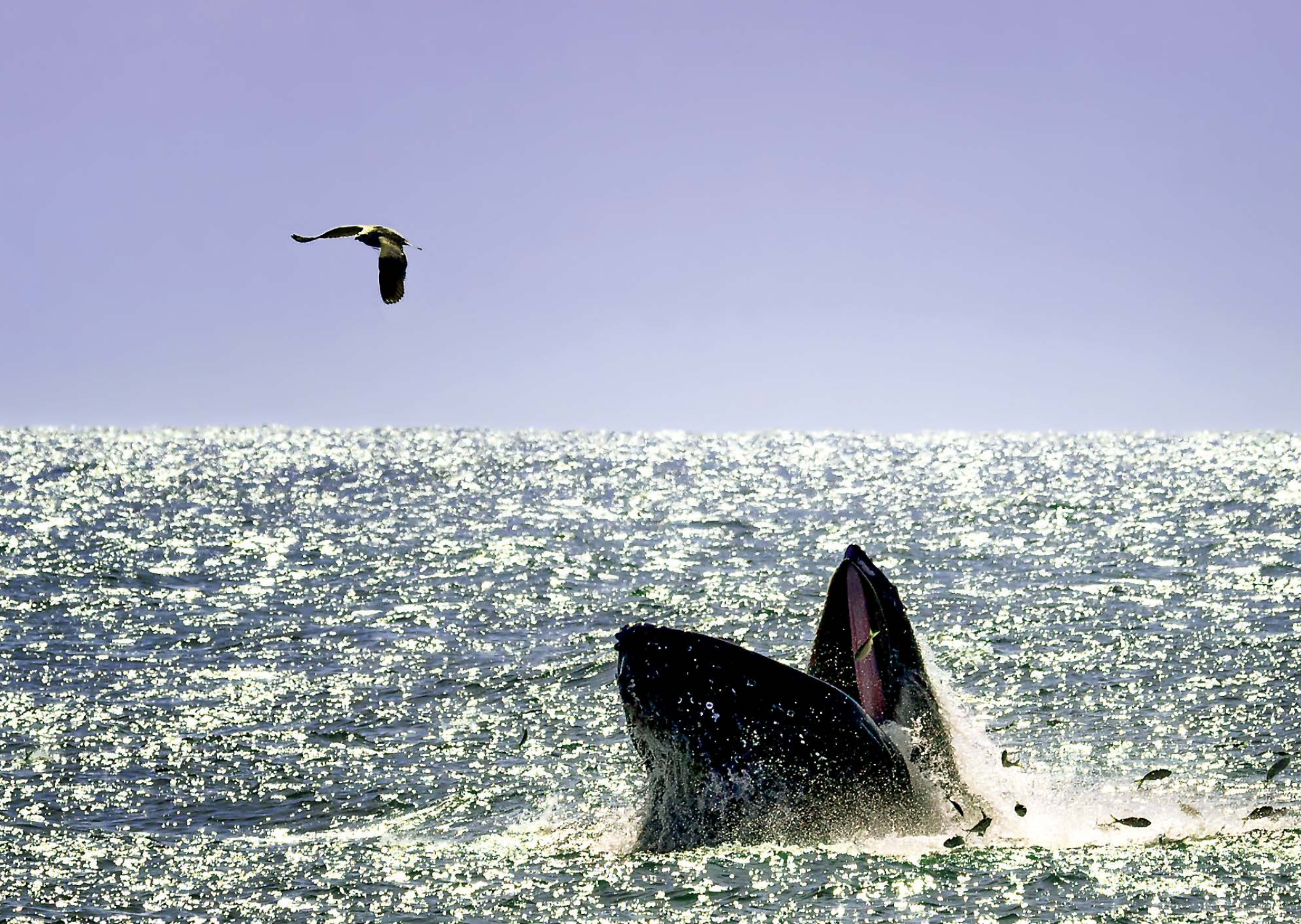
Humpback whale ( Megaptera novaeangliae ) lunge feeding off of Long Beach, New York.