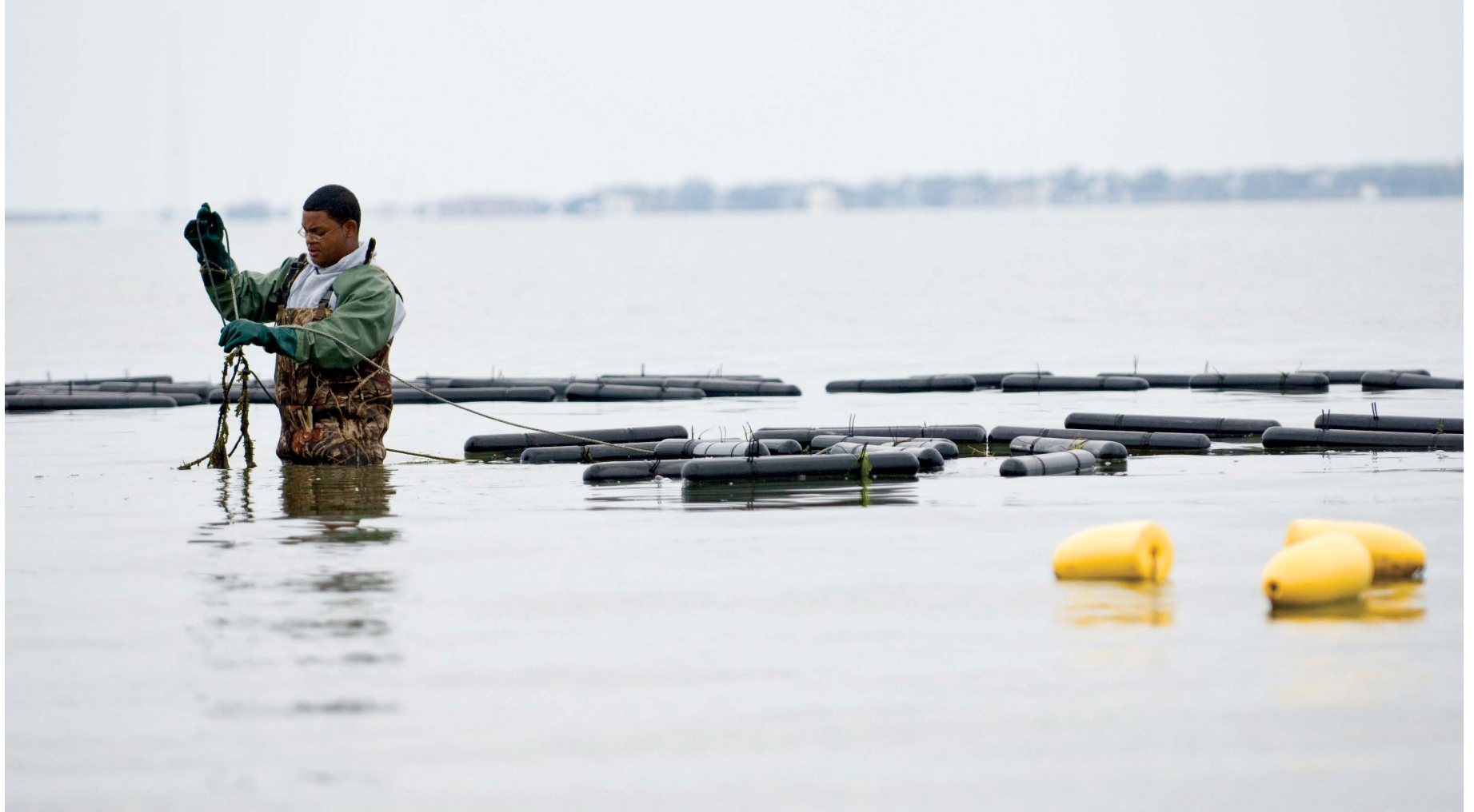
Tribes such as the Shinnecock Indian Nation of New York have an ancestral relationship with ocean resources.