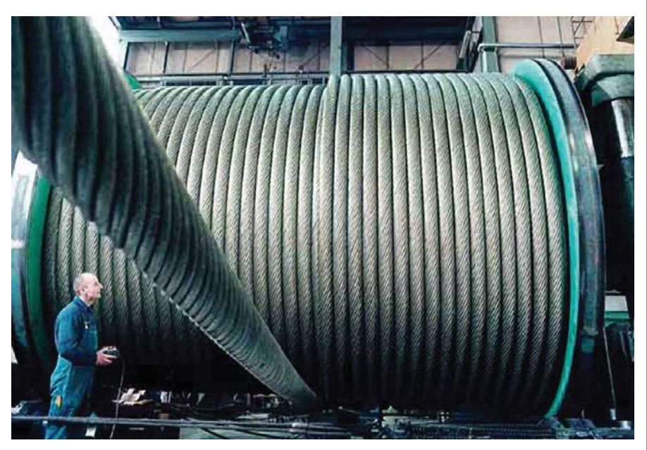
Above: Cable used for moorings.

These challenges gave rise to a support industry that still grows and changes today, right along with the oil and gas industry companies. Two interesting areas of such growth are fabrication yards and ports.