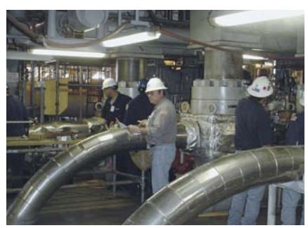
MMS inspectors examine the incoming flowline risers of the Thunder Horse semisubmersible production platform.

he Deep Water Operations Plan (DWOP) is designed to address industry and MMS concerns by allowing an operator to know, well in advance of significant spending, that his proposed methods of dealing with situations not specifically addressed in the regulations are acceptable to MMS. The DWOP provides MMS with information specific to deepwater/ subsea equipment issues to demonstrate that a deepwater project is being developed in an acceptable manner as mandated in the regulations. The MMS reviews deepwater development activities from a total system perspective, emphasizing the operational safety,